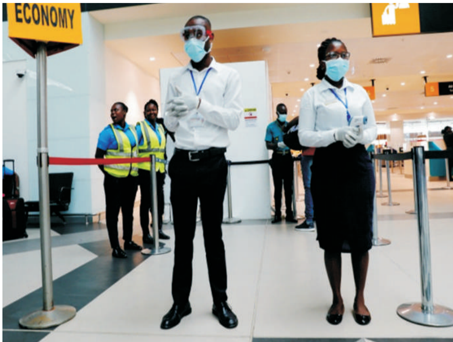
The new penalties came a day after Ghana began requiring all passengers over the age of 18 to provide evidence of full vaccination against the virus

GHANA has said it will fine airlines $3,500 for each passenger who arrives in the capital's international airport without being fully vaccinated against COVID-19.