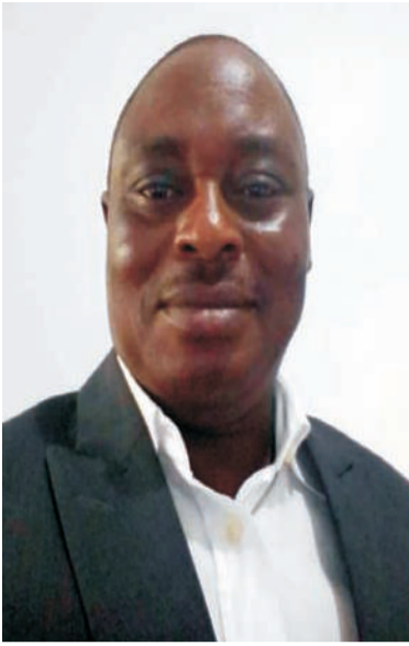
By KENNETH DARENG

OMICRON, according to the World Health Organisation [WHO], derived its name from the 15 th letter of the Greek alphabet and is equivalent to a short sound English letter 'Q' which also signifies the 13 th and 14 th Greek letters [nu and xi] which were skipped over because the 'nu' and the 'xi' is also a common surname