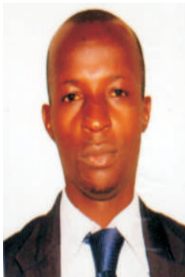
By JIDAUNA DARING

"WHO, and medical experts have alluded to the fact that Omicron is more lethal than most people imagine which means, a contagious person can easily spread the virus to anybody irrespective of whether one has received the covid-19 jab or not."