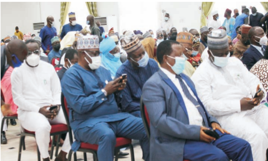
A cross section of members of the Plateau State Executive Council at the ceremony