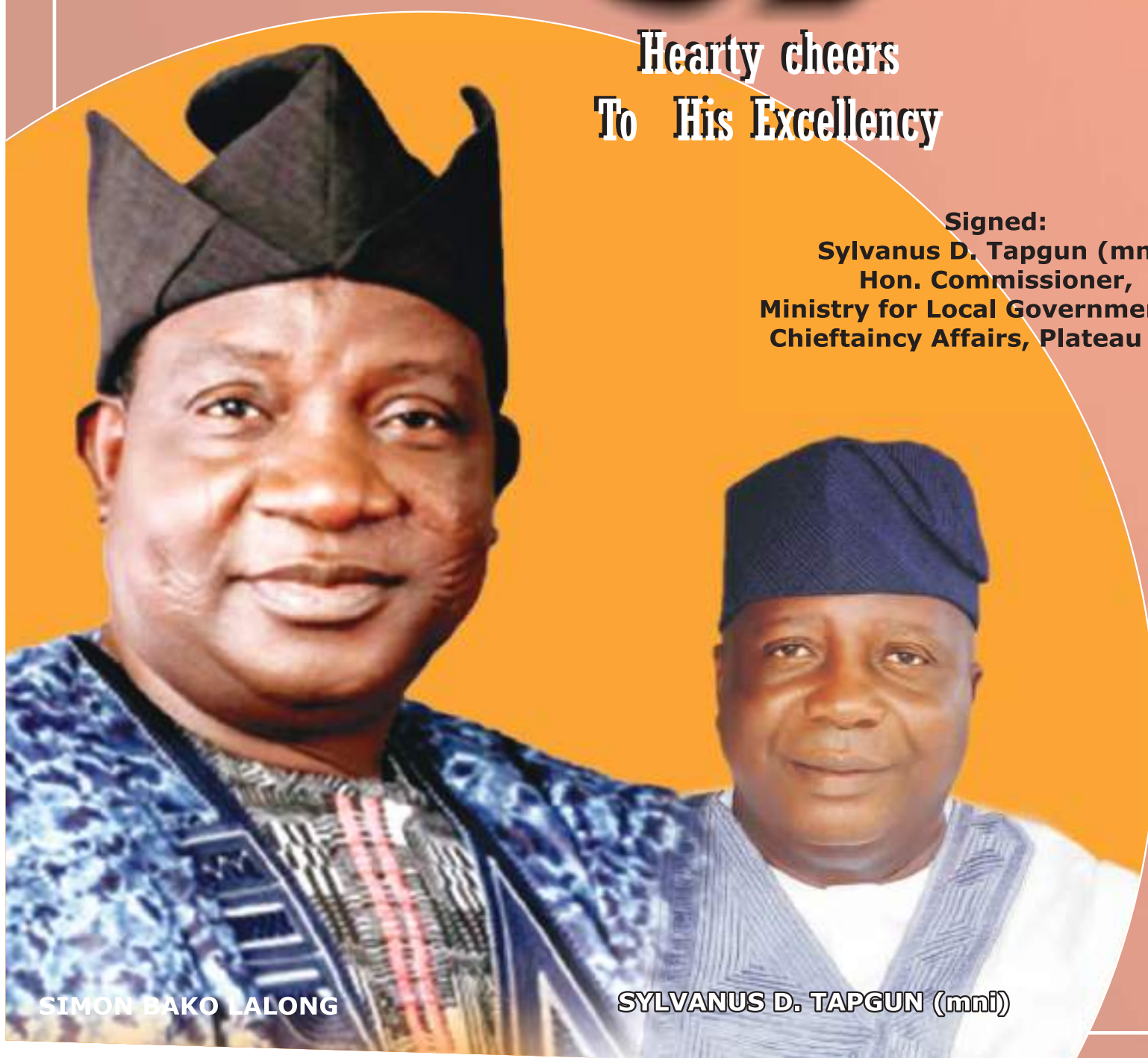
SIMON BAKO LALONG

Sylvanus D. Tapgun (mni) Hon. Commissioner, Ministry for Local Government and Chieftaincy Affairs, Plateau State