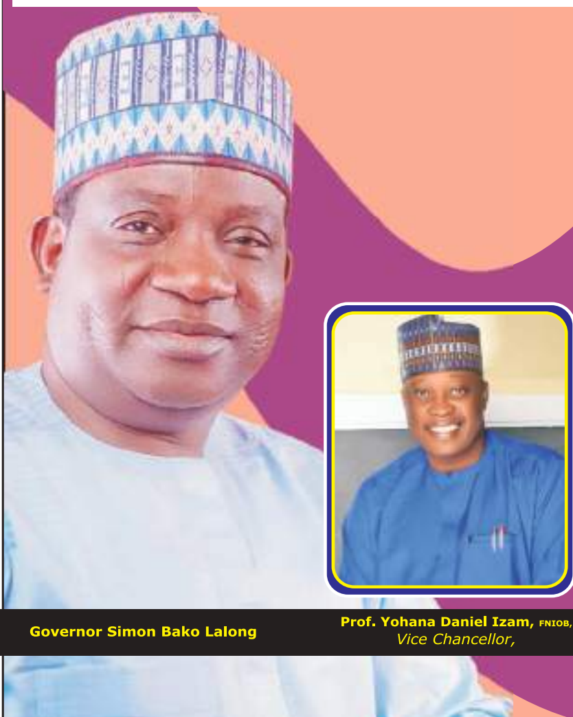
Governor Simon Bako Lalong