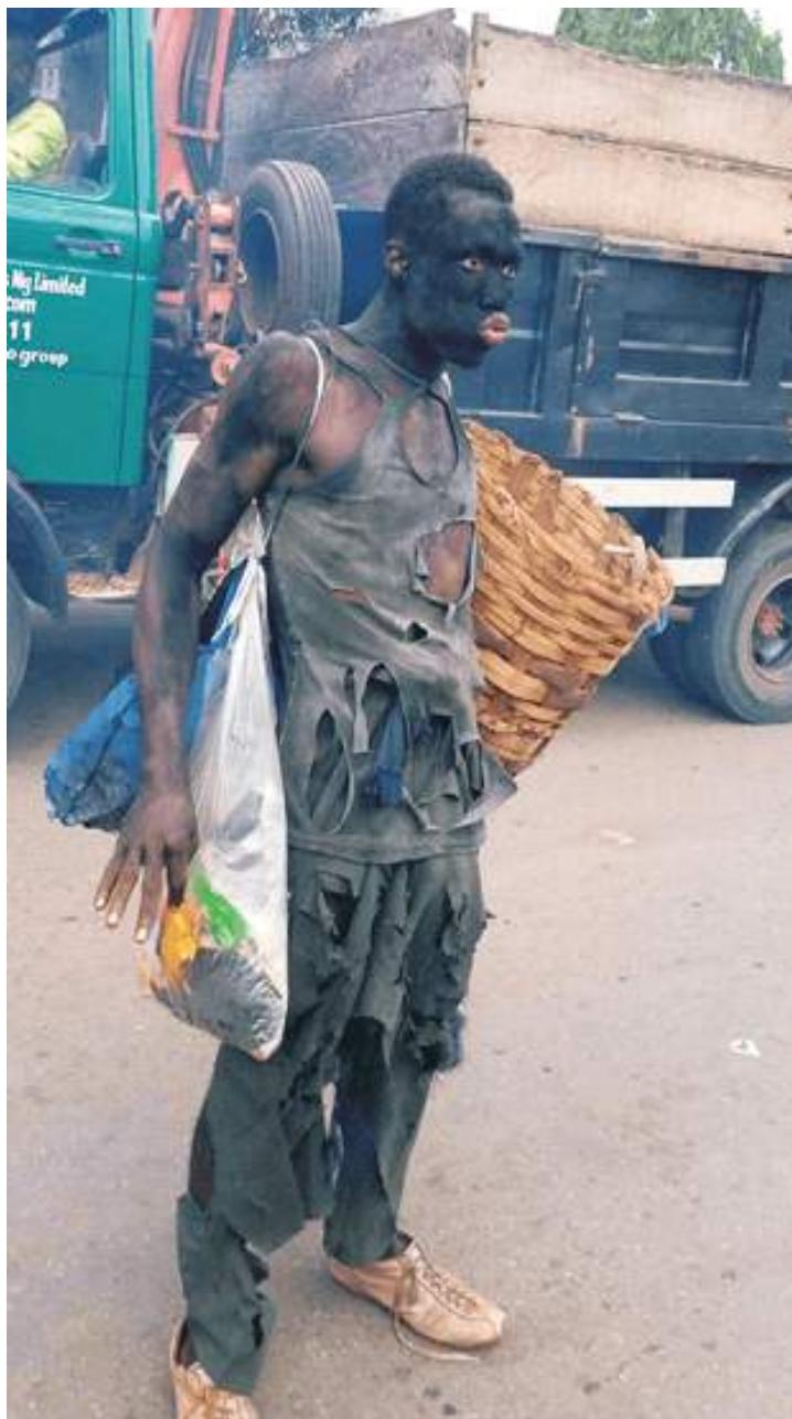
A mad man in his world

the city centre to sample opinions of citizens on the resurgence of mentally ill persons within the metropolis. And these are their views.