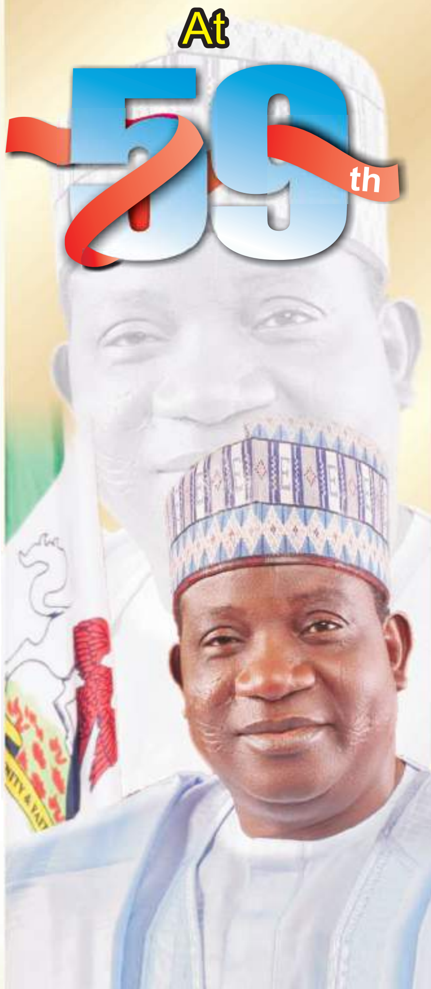
Gov. Simon Bako Lalong Executive Governor, Plateau State