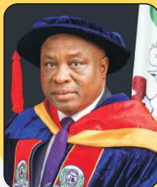
Governor Bako Lalong