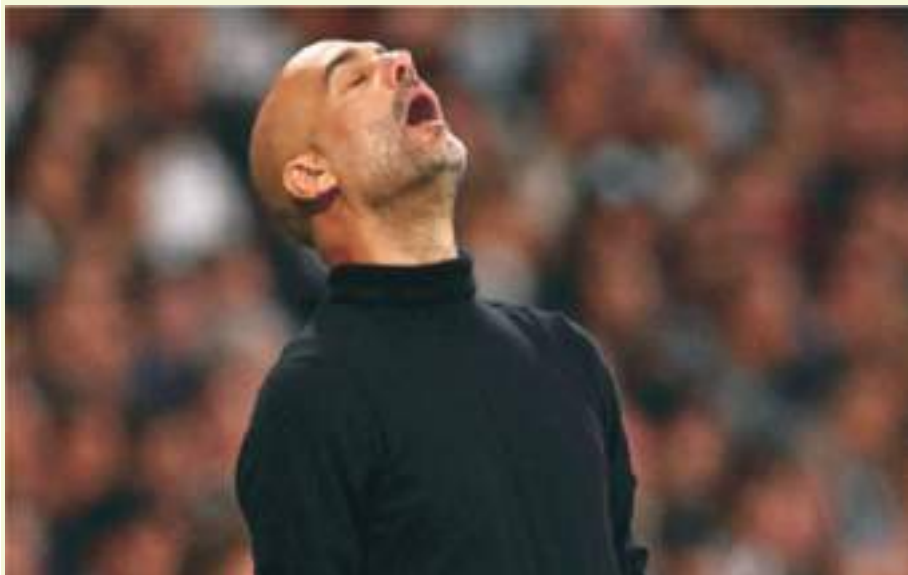
The coach has not been able to achieve the club's dream of winning the European title in his six years in England

They sit a point ahead of Liverpool in the Premier League with four matches left to play.