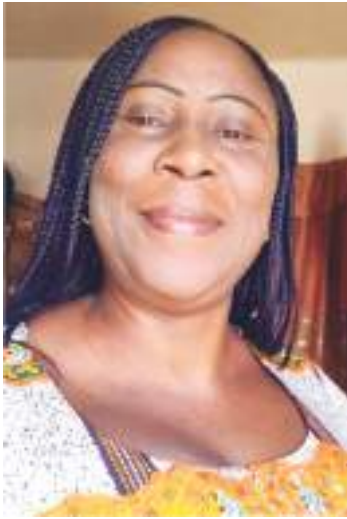
By JENNIFER YARIMA

The political landscape hasn't been very palatable for women in Nigeria to actively strive for elective positions. While some scholars blame women for their own undoing, the reality of the fact is that our stakeholders are not ready to create an enabling environment for women's integration in the scheme of things. This is the sad commentary of Nigerian women at the moment. Therefore; it seems women have little or nothing to celebrate even as our journey into the Fourth Republic has reached appreciable level. It is very clear that the political atmosphere has become quite tight to accommodate more women as against what was earlier hoped for.