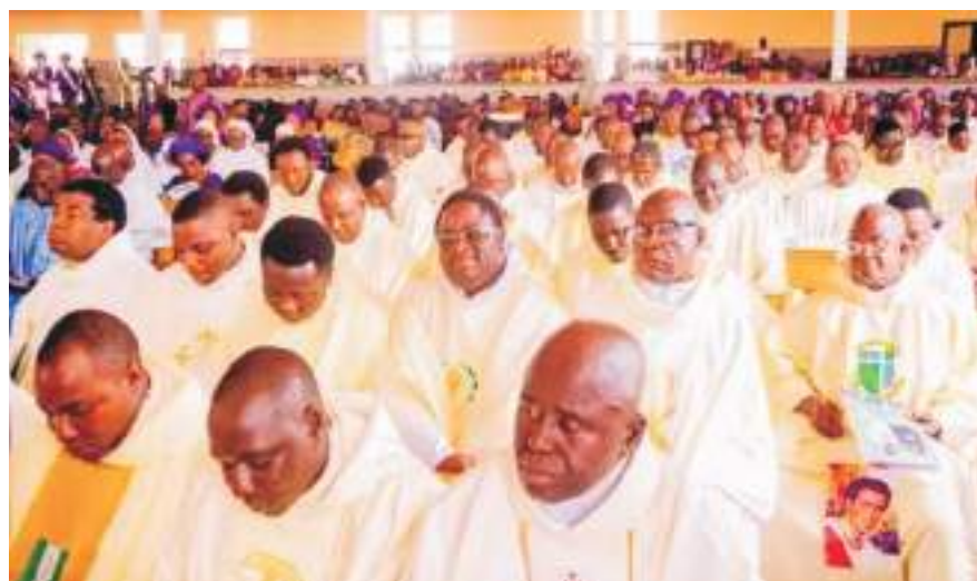
A cross section of Reverend Fathers at the wedding ceremony