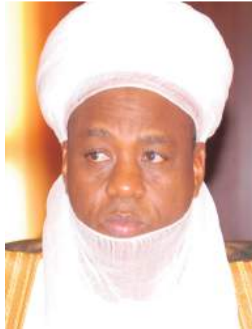
Abubakar, Sultan of Sokoto

benefits, the colonialists propped up the existing feudal system that they had overthrown by a power sharing mechanism that entrenched their powers by designing an architecture of power that subordinated the non-Muslim communities across the Middle belt to the structure of feudal power that would later be known as the Emirate system. Large swathes of lands and communities who had successfully repelled the Fulani ruling classes in wars were now parceled out and brought under the rule of Emirs. An understanding of the history of this injustice is fundamental to appreciating the reaction of say, the peoples of the Plateau to the situation in Plateau state today. The decision by the colonial state to further create the Sabon Gari (strangers' quarters) system of exclusion and separation in pursuit of a policy known as non-interference further deepened and widened the chasm of fear and suspicion between Christians and Muslims in Northern Nigeria.