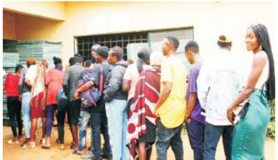
Potential voters waiting patiently to register or collect their PVCs