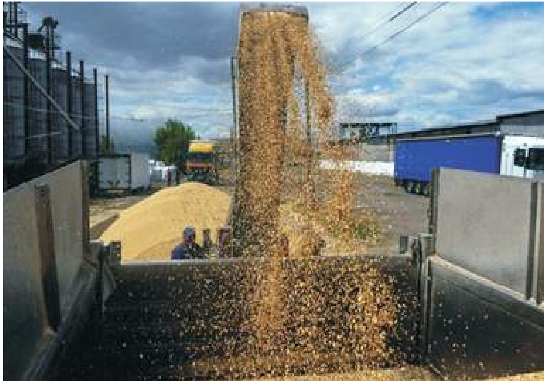
A worker loads a truck with grain during barley harvesting in the Odesa region

The key to this blockade has been Snake Island. A tiny islet 48km (30 miles) off the coast of Ukraine and Romania, it was taken by Russia in the opening days of the war. Strategically placed, it controls the approach waters to Ukraine's last three remaining commercial ports and is being heavily armed by Russia.