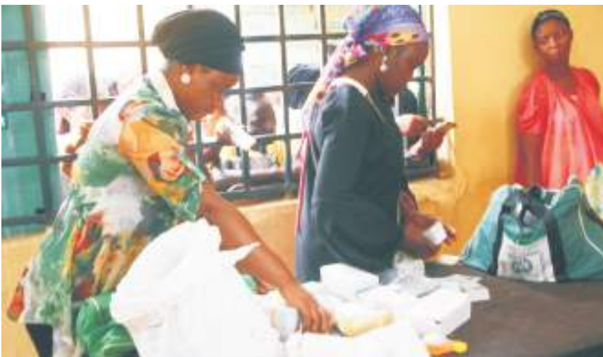
A cross section of INEC staff sorting out PVCs ready for collection at its Jos South office