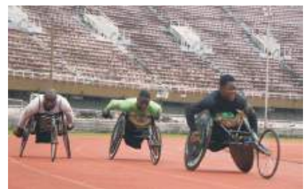
Para-athletes in training

Ms Okagbare failed to respond to the charges by the extended deadline (21 June, 2022) and is therefore deemed to have admitted the anti-doping rule violations (under Rule 2.3 and Rule 2.5 of the World Athletics Anti-Doping Rules) and to have accepted the consequences.