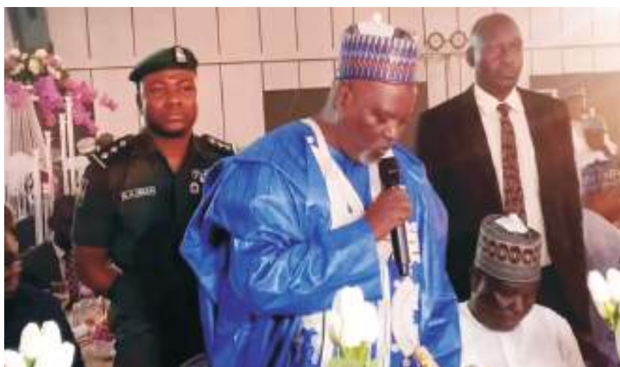
Nigeria's House of Reps Deputy Speaker, Rt. Hon. Ahmed Idris Wase delivering his goodwill message at the wedding reception