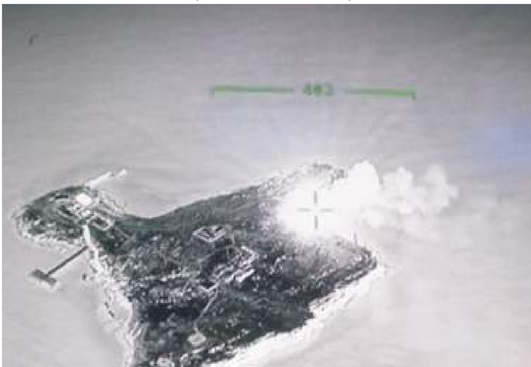
A screengrab from a drone video shows a fire on Snake Island on May 8, 2022