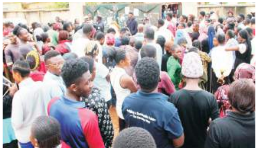
A mammoth crowd waiting for their turn at the Jos South INEC Office