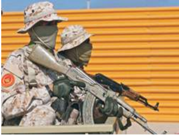
Fighters loyal to Libya's Tripoli-based Prime Minister Abdul Hamid Dbeibah sit with their weapons in the back of a pick-up truck in the capital

Now, Dbeibah and a rival prime minister, Fathi Bashagha, appointed by