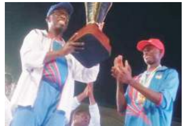
The Sport festival trophy

Delta 2022, will be the first time perennial champions, Delta State, will be hosting the "National Olympics"