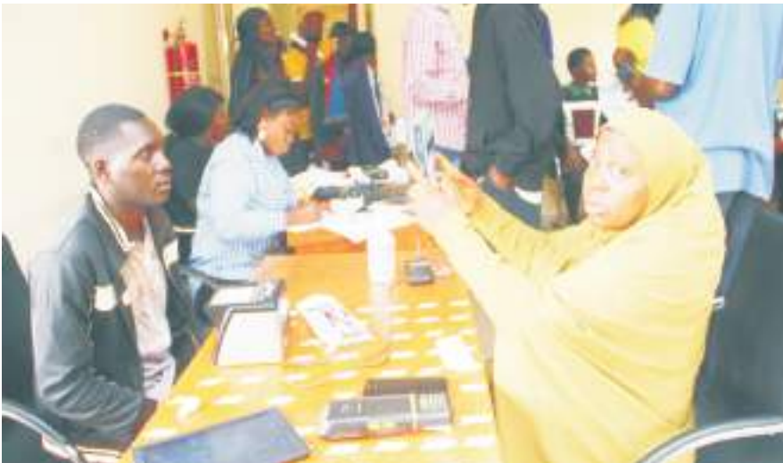
One of the persons being captured at the of the INEC office during monitoring of the exercise