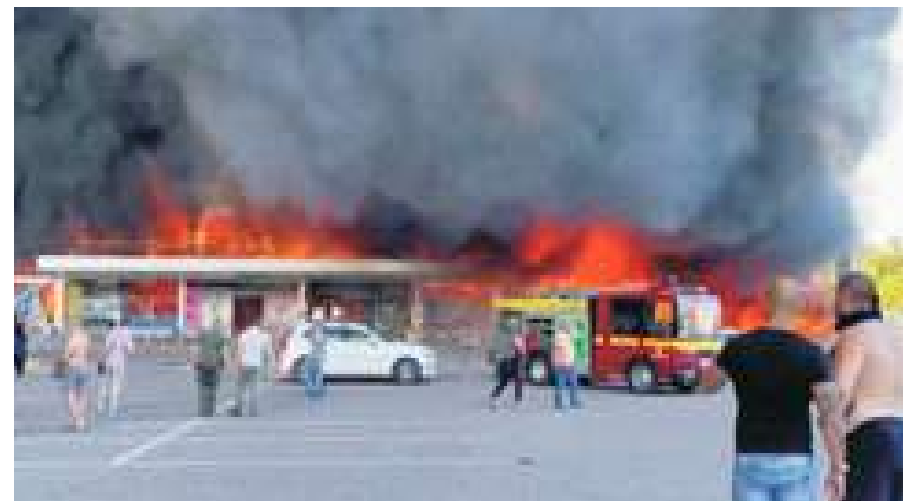
At least 18 people were killed and 59 wounded in a Russian attack

statement posted on its Telegram channel. "The detonation of stored ammunition for Western weapons caused a fire in a non-functioning shopping centre located next to the depot," it ministry said in a added.