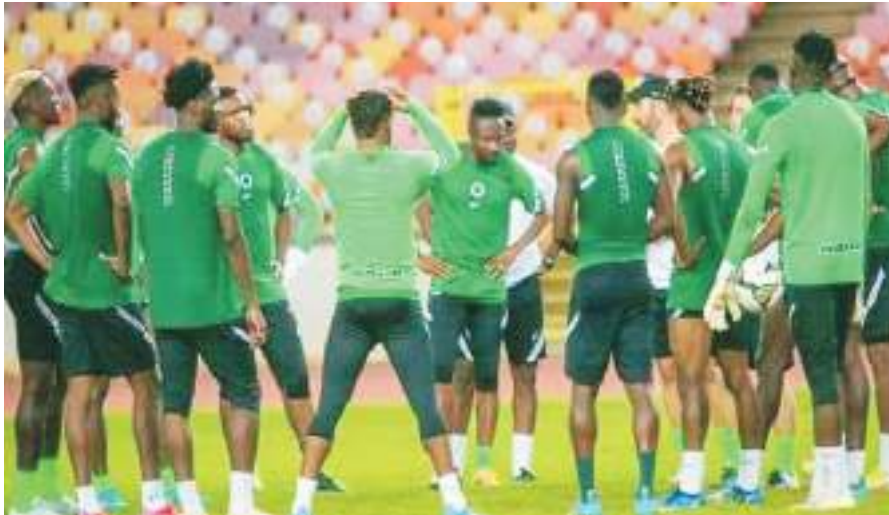
Super Eagles in training