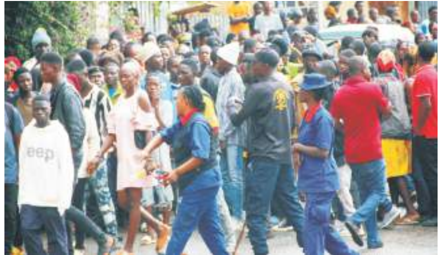
Members of the security agencies controlling crowd at the Jos North INEC office