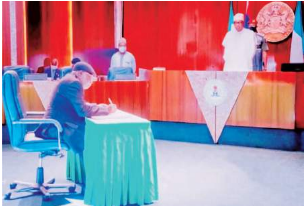
Acting new CJN, Justice Olukayode Ariwoola (left) signing the oath papers being administered by President Muhammadu Buhari on Monday at the Presidential Chambers after the resignation of the former Justice Ibrahim Tanko Mohammed