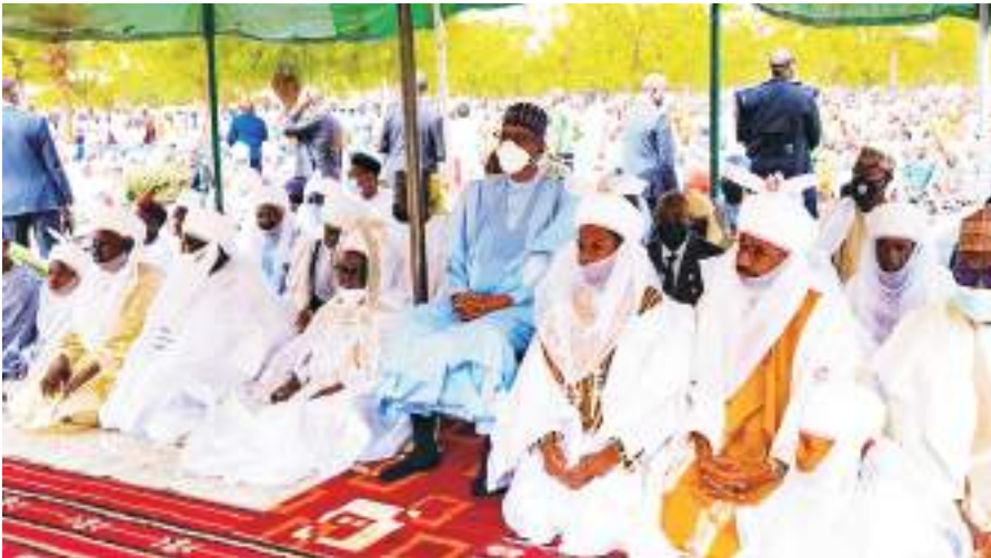
Muhammadu Buhari (middle) Emirs and Katsina State Government functionaries listening to preaching by the Chief Imam