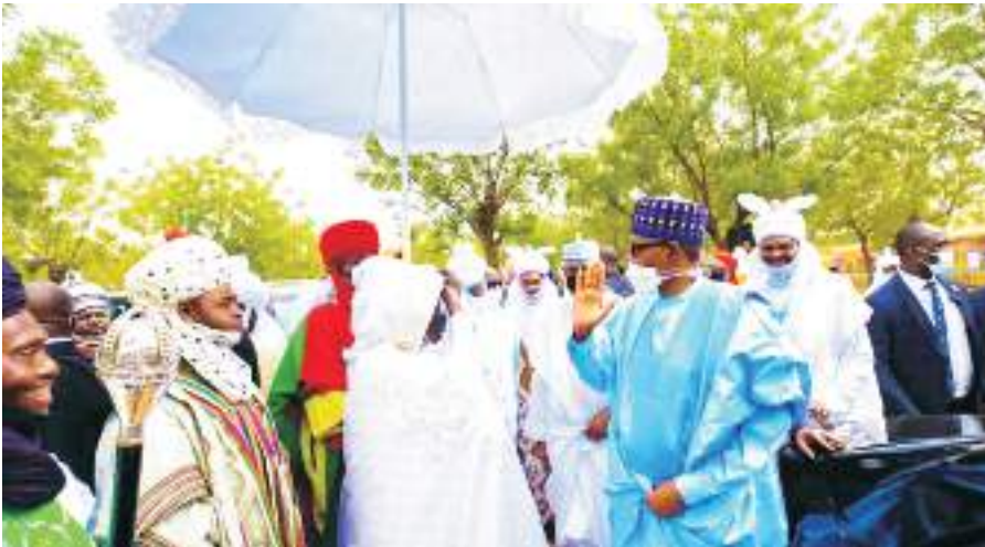
Nigeria’s President, Muhammadu Buhari (right) acknowledging cheers from his Daura community after the Eid prayers