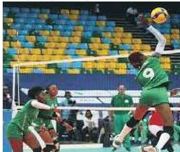
Nigerian Volleyball players

South-South while the third Round will come up in the South West.