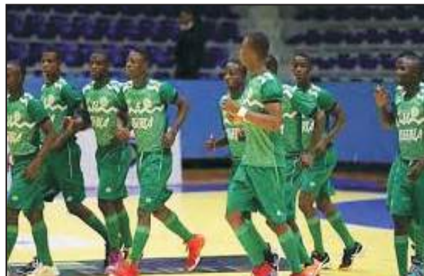
Nigerian Handball players

The Golden Arrows finished in the 10th position in the last edition in Tunisia.