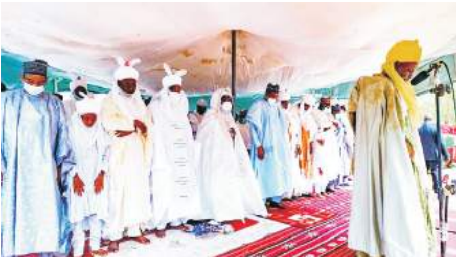
Chief Imam of Daura Central Mosque leading President Buhari and other faithfuls praying during the Eid-el Kabir

Nigeria’s President, Muhammadu Buhari and other Muslim faithfuls prayed at the Daura, Eid Ground, Katsina State last Saturday