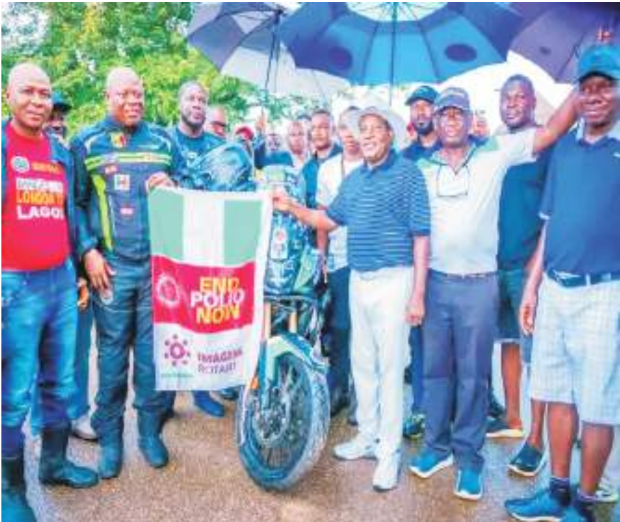
Governor Lalong, Biker Kunle Adeyanju with State Government officials displaying end polio now logo