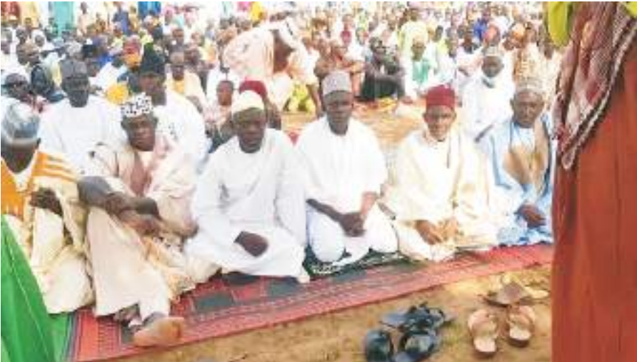
A cross section of other Muslim faithful at the Eid praying ground, Namu