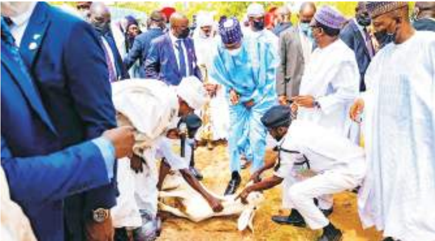
President Buhari (middle) being assisted by members of the Aid group slaughtering the Sallah ram after the prayers