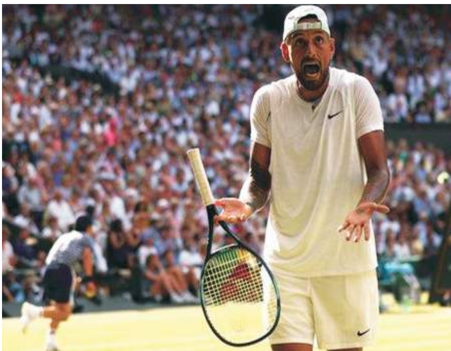
Before his run to the Wimbledon final, Nick Kyrgios had never made it past a quarter-final in singles at a Grand Slam