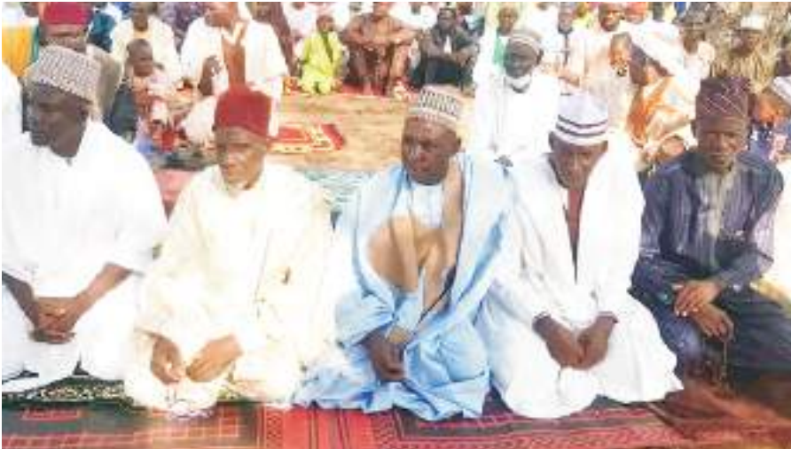
Another cross section of tittle holders and others in a prayer mood during the Eid-el Kabir