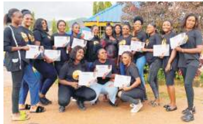
Former trainees displaying their certificates