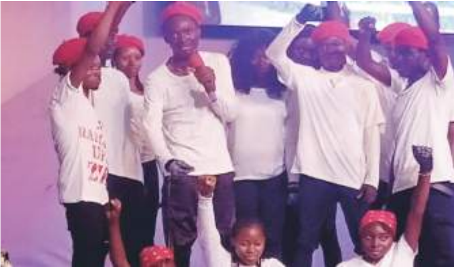
House of Opera put smiles on the faces of members with their performance at the celebration