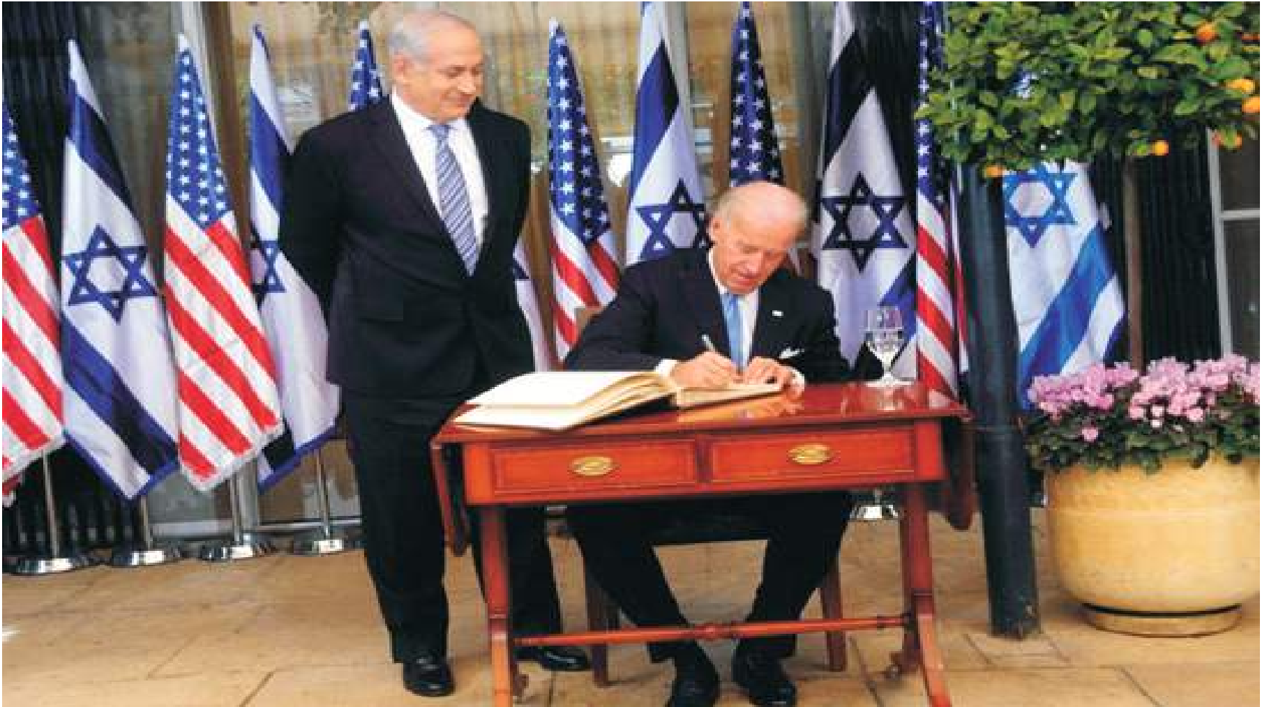
Benjamin Netanyahu, left, looks on as then-US Vice President Joe Biden signs the guest book. Biden says there is a 'moment of opportunity' for peace between Israelis and Palestinians