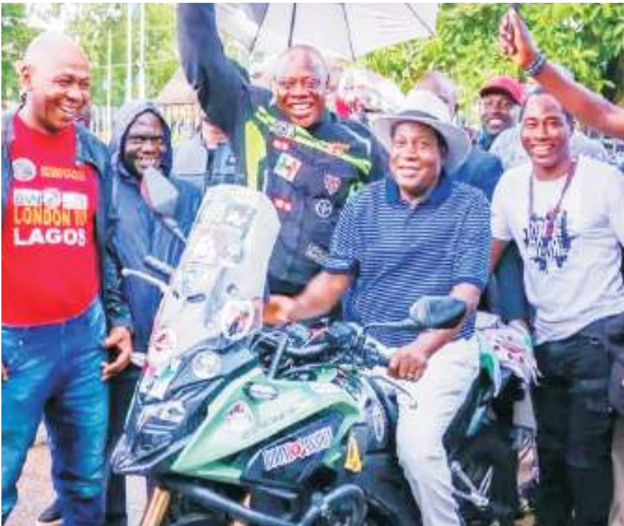
Plateau State Governor on one of the bikes during the visit