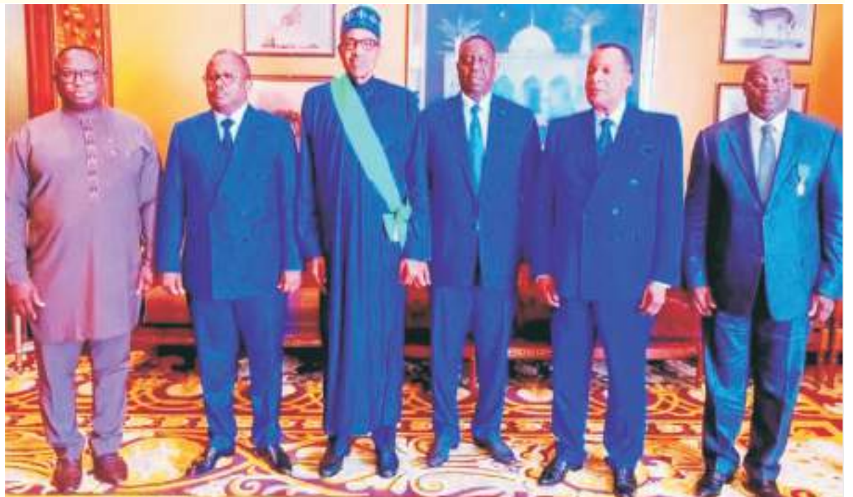
Nigeria's President Muhammadu Buhari (3rd from left) in a group photograph with President Julius Bio of Sierra Leone (left) President Umaro Sissoco Embaló of Guinea Bissau, President Macky Sall of Senegal, Congo Denis Sassou-Nguesso and the vice President of Cote D'Ivoire after President Buhari received the highest National Honour of the republic of Senegal in Dakar recently.