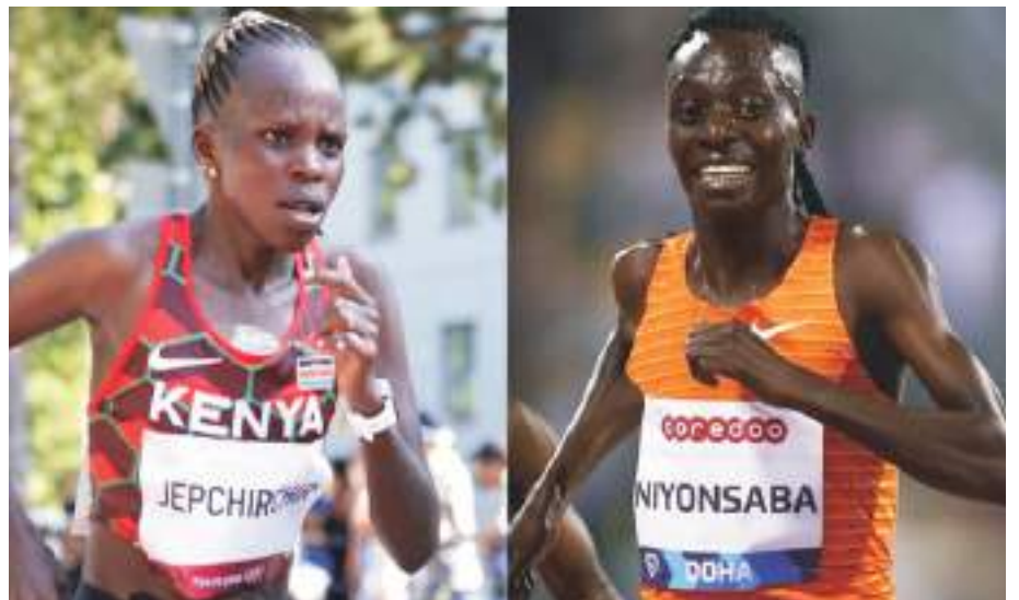
Peres Jepchirchir (left) was among the favourites for the women's marathon after wins in New York and Boston since taking Olympic gold

The World Athletics Championships begin on Friday and last until 24 July.