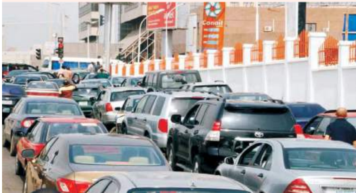
Long queue waiting to refuel at a petrol station, Abuja.