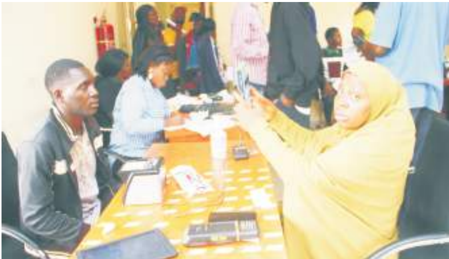
One of the persons being captured at the INEC office during monitoring of the exercise