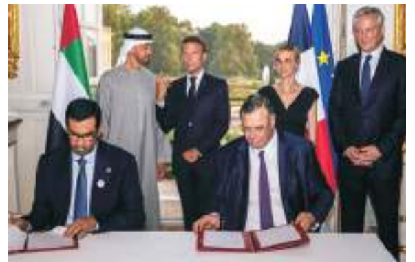
Macron and Sheikh Mohamed speak as UAE industry minister Sultan Ahmed al-Jaber and TotalEnergies group CEO Patrick Pouyanne sign documents at the Grand Trianon of Versailles palace near Paris

according to Emirati state news agency WAM.