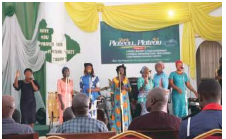
Chapel band rendering songs at the service