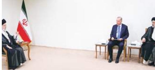
Iran's Supreme Leader Ayatollah Ali Khamenei meets with Turkish President Recep Tayyip Erdogan and Iranian President Ebrahim Raisi in Tehran, Iran

Mehrabad Airport in Tehran late on Monday but it did not carry Putin.