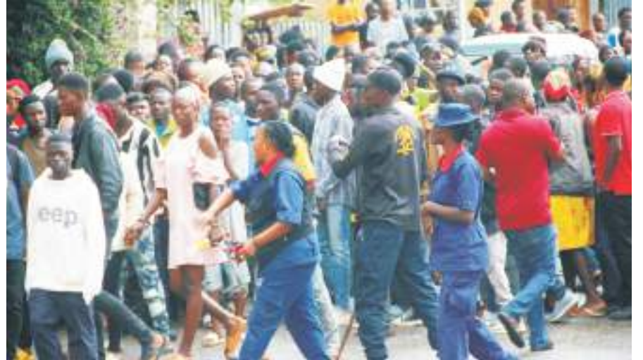
Members of the security agencies controlling crowd at the Jos North INEC office