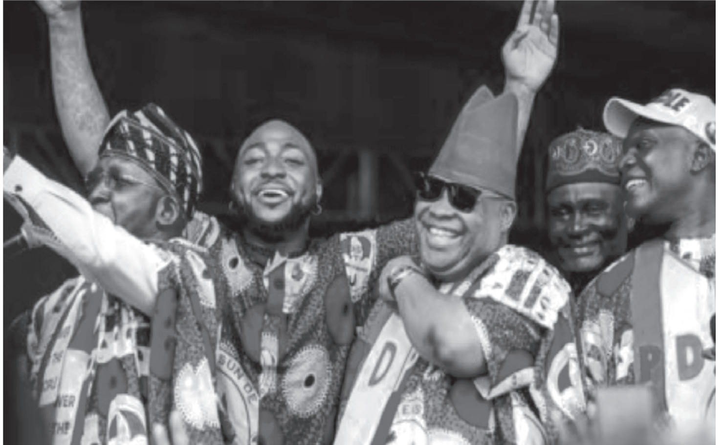
PDP National Chairman with the Osun governor elect

as vice president of Origin International LLC, a flavour and fragrance manufacturing company in Atlanta, Georgia, US.