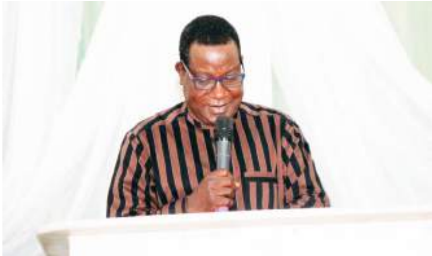
Governor Simon Bako Lalong delivering his remarks at the service

Plateau State Governor and Chairman, Northern Governors' Forum, Rt. Hon. Simon Bako Lalong on Friday attended the end of month prayer and fasting service organised by the Governor through the leadership of Government House Chapel for all government functionaries in the state at the chapel Rayfield, Jos, recently