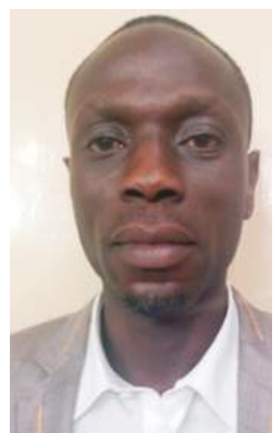
By HOSEA NYAMLONG

WIKIPEDIA, defines burial, as an interment or inhumation, is a method of final disposition whereby a dead body is placed into the ground, sometimes with objects.