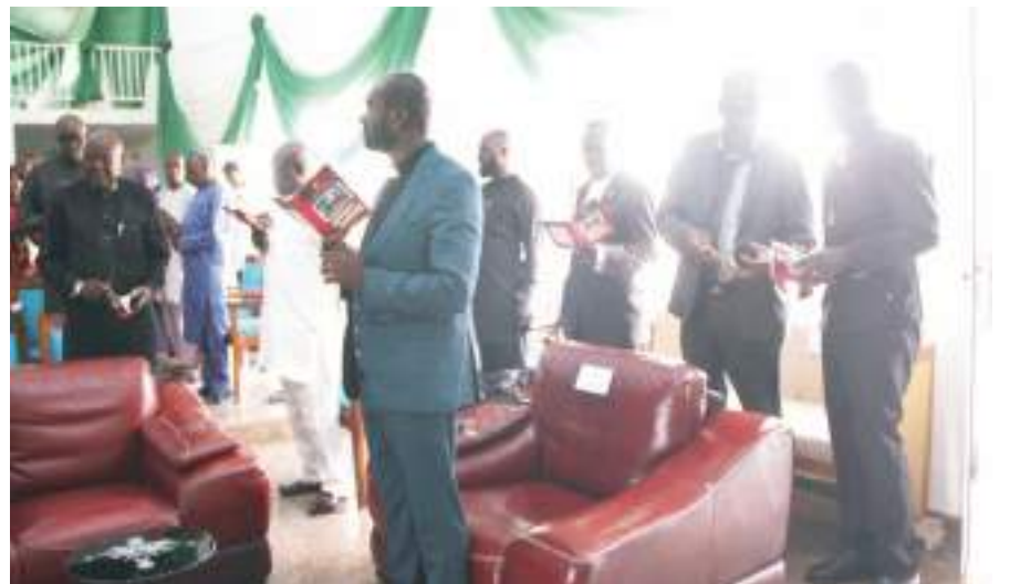
A cross section of Government House Chapel leadership during the service