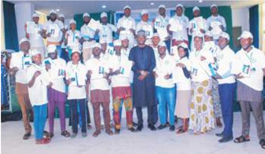
N-SIP recruited staff on training