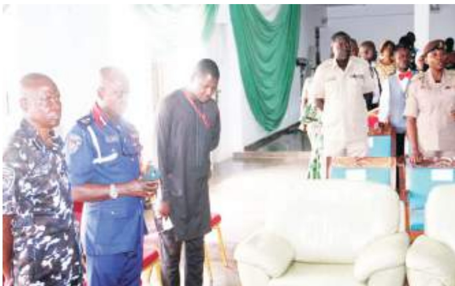
A cross section of security chiefs representatives at the service