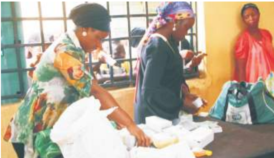
A cross section of INEC staff sorting out PVCs ready for collection at its Jos South office