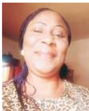
By JENNIFER YARIMA

THE female folk are uniquely made by our Creator with very vital issues for consideration towards their total well being. Their makeup is complex in nature which if mismanaged can lead to agonizing situation. The subject matter focused on is crucial in the life of a woman even though it's surrounded with lots of complexities.