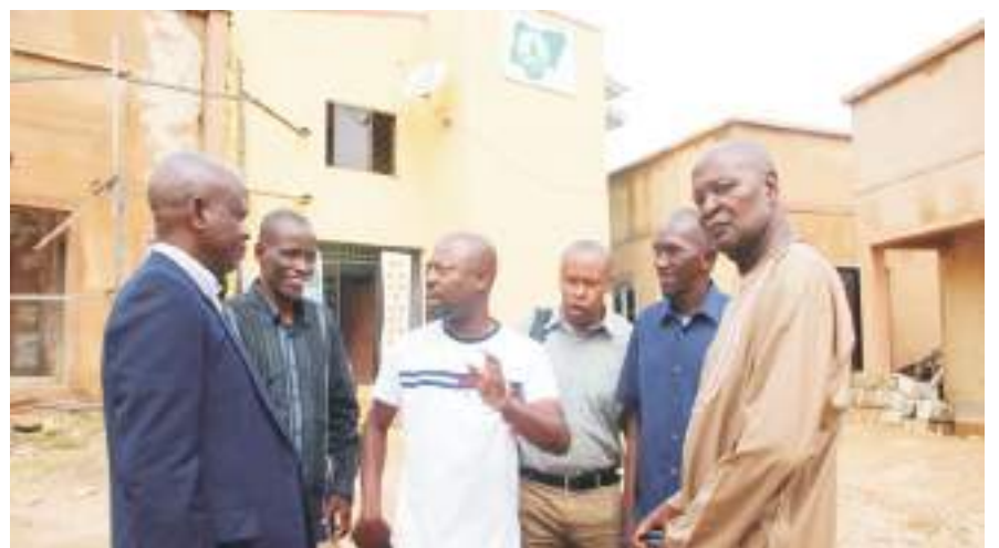
NUJ State Chairman (left) exchanging greetings with other Journalists at the Secretariat before the arrival of the visitors