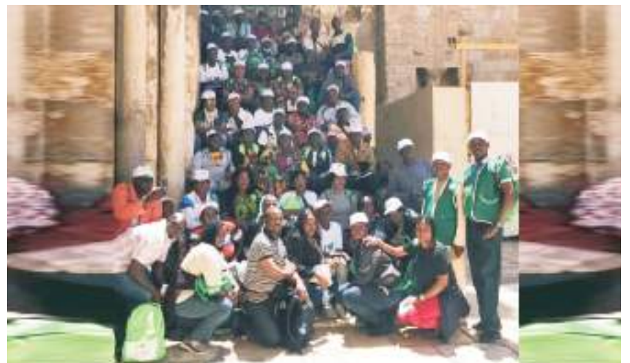
Second batch of Pilgrims in high spirit during a group photograph