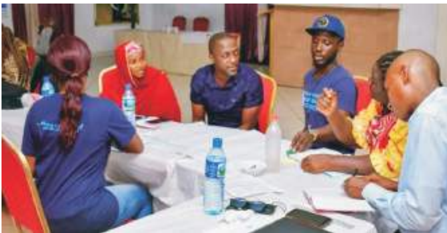
A cross section of some staff of the Agency and resource persons at the intensive training