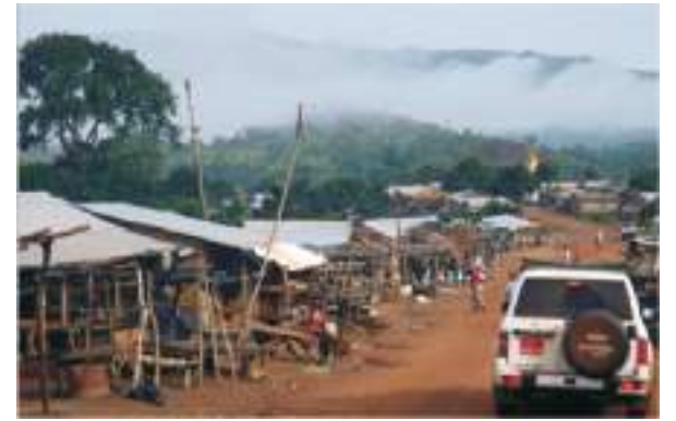
Mist shrouds the Simandou mountains in Beyla, Guinea, an area where finest iron ore found

suspended construction of the mine and related infrastructure once before, in March. That resulted in Rio and WCS signing a framework agreement that month under which they would "c o - d e v e l o p" infrastructure for the mine, including a 670-km (416 miles) railway and a port.