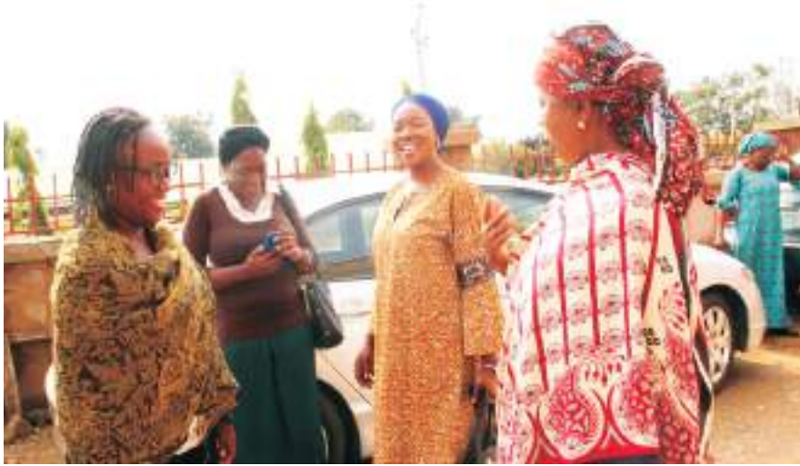
A cross section of Women Journalists waiting for the arrival of the APC Governorship flag bearer