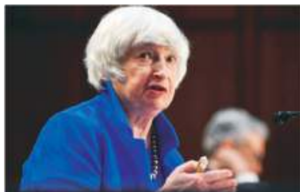
United States Treasury Secretary Janet Yellen

Once EU member states have adopted the legislation, which is regarded as a formality, a 15-month transitional period starts, after which it enters into force