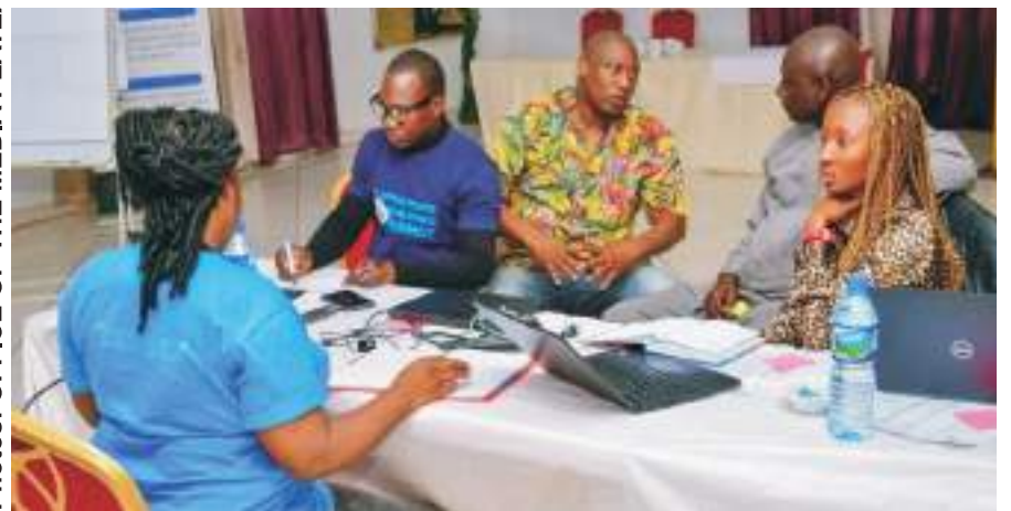
A cross section of participants listening keenly