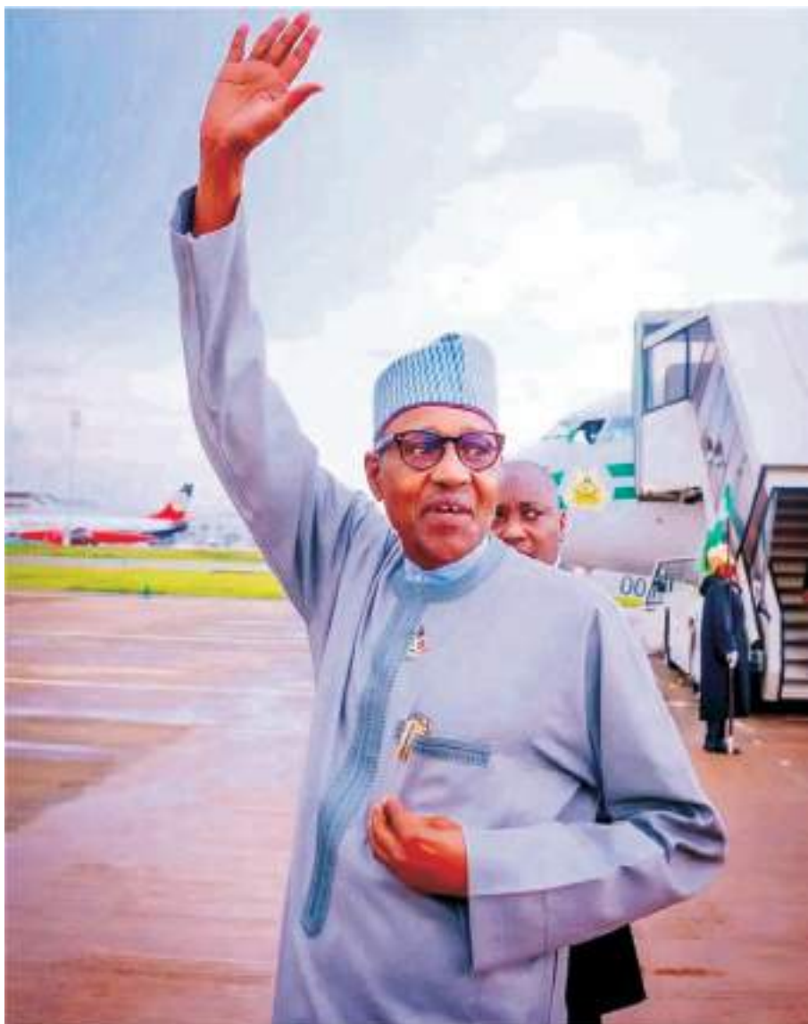
Nigeria's President Muhammadu Buhari acknowledging cheers during his departure from Lisbon, Portugal to Nigeria recently.