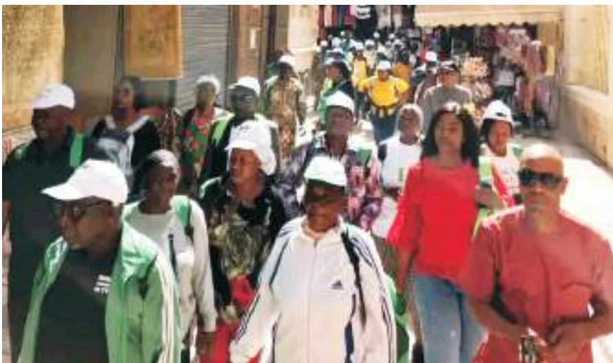
Nigerian second batch pilgrims visiting holy sites in Jerusalem