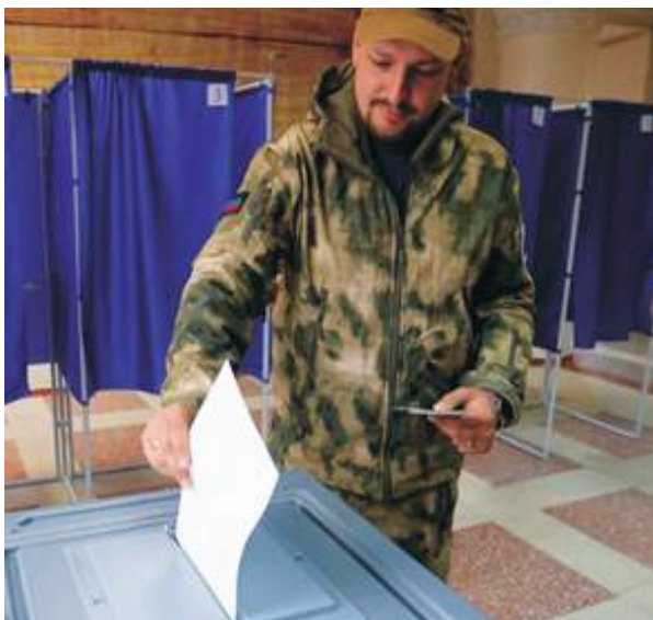
None of the four regions where the annexation referendums are taking place is fully under Moscow's control [Alexander Ermochenko]

way, the Kremlin cautioned Kyiv faces a devastating escalation of the conflict, all the way up to the use of its nuclear arsenal.