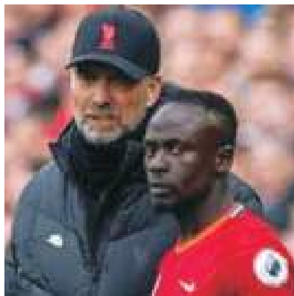
Mane and Klopp

He is currently on international duty with Senegal. Mane was on target as the Teranga Lions defeated Bolivia 2-0 in their latest friendly match. On Tuesday, he is expected to feature in another international friendly, this time against Iran before embarking on club assignments against Bayer Leverkusen next on line.