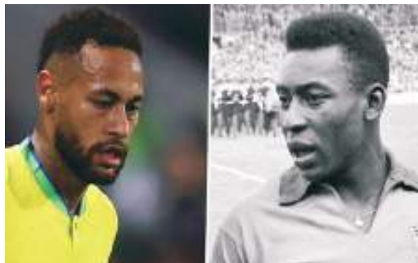
Neymar and Pele

Neymar has told Telefoot of chasing down Pele: "God willing...I hope to get past him. I'm going to talk to my teammates about it and tell them to