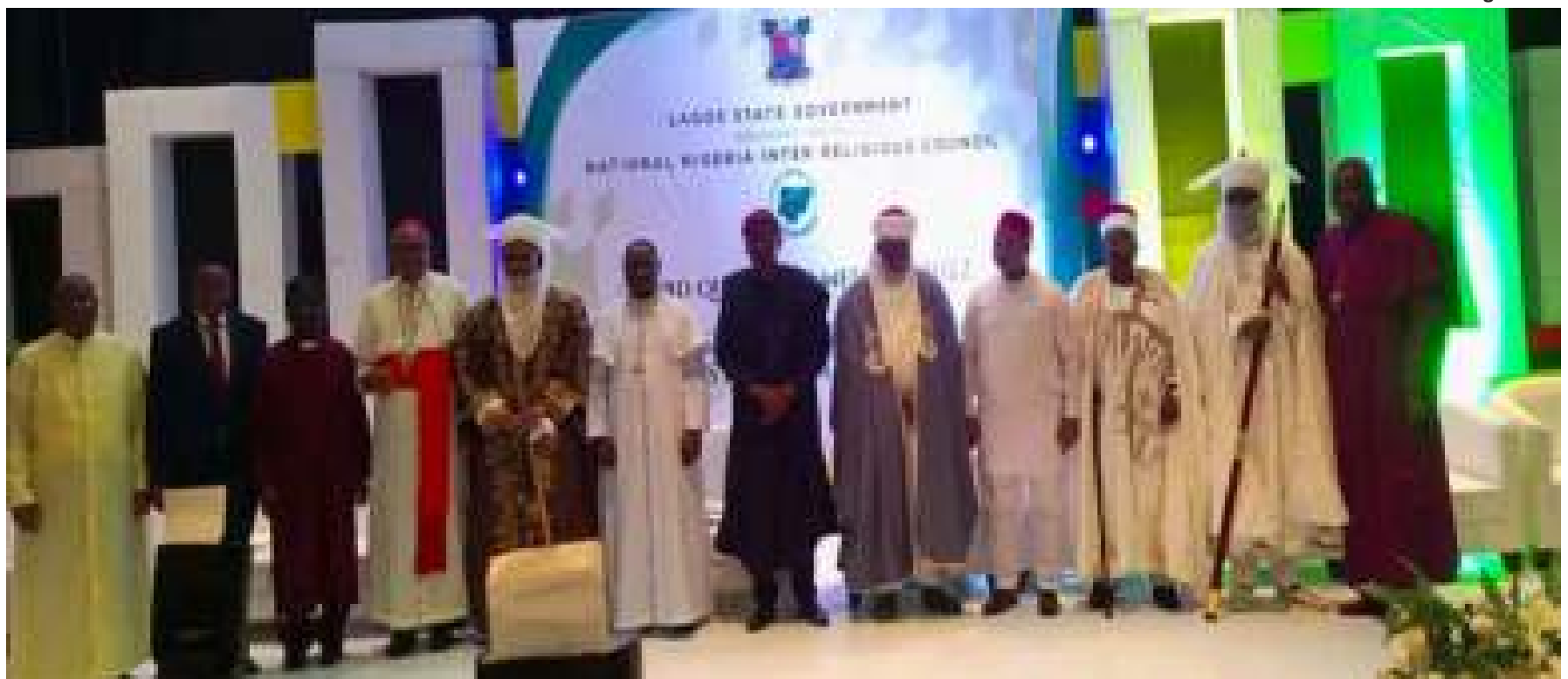
Chairman and Co-Chairman, NIREC and other members of the Council in a group photograph after their meeting on Monday at the Continental Hotel, Victoria Island, Lagos State, hosted by Governor Babajide Sanwo-Olu of Lagos State.