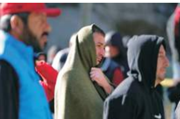
Thousands of Russians are reported to have fled the country since Moscow's partial mobilisation order

land border – since Russia issued what it called a "partial mobilisation" order last week.