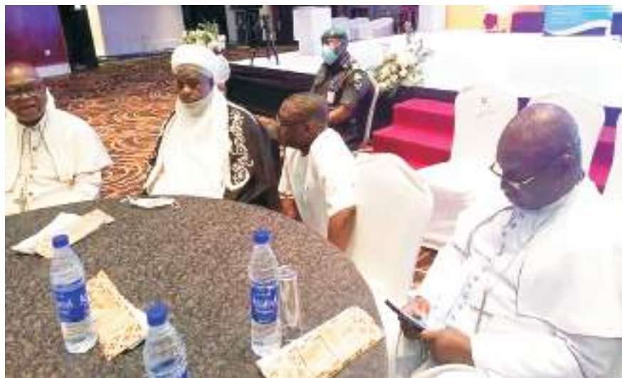
A cross section of members of the high table during the NIREC meeting