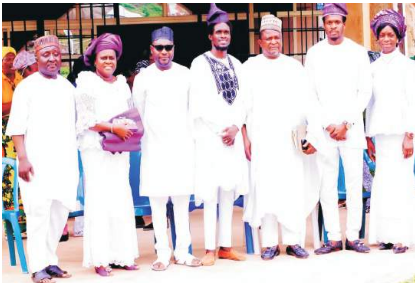
The ordained deacons

servant. It is not anything fanciful. They are servants of the church. Their service delivery is to the church. That does not mean others will do nothing. In Biblical terms it is there and also in the secular world. That does not mean they are the only ones. Every member of the church has also been called to serve and in Phil 1:1, Paul introduced himself and Timothy as servants and also in Acts 1:1-6.