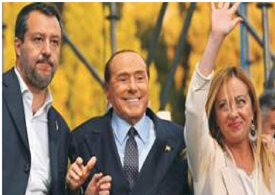
The three right-wing leaders united on stage for the first time in more than two years

Like the centre right, they are keen to lift the ban on nuclear power, and like the centre left, they want to import more liquefied natural gas.