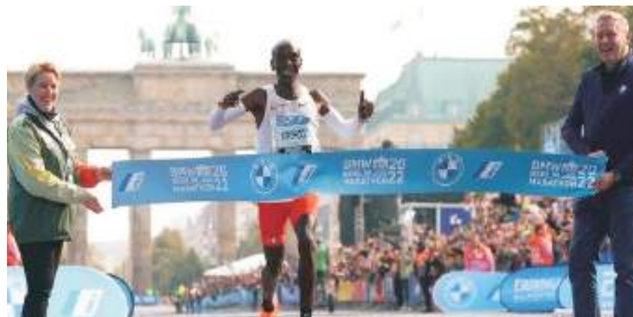
Kipchoge claimed his fourth Berlin Marathon victory

In the women's race, Ethiopia's Tigist Assefa ran the third fastest time in history to set a course record of 2:15.37.