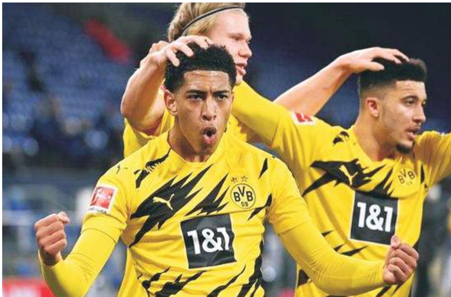
2021 - Jadon Sancho to Manchester United; 2022 - Erling Haaland to Manchester City; 2023 - Jude Bellingham to ?

Indeed, there are growing concerns that the manager's conservative tactics are stifling