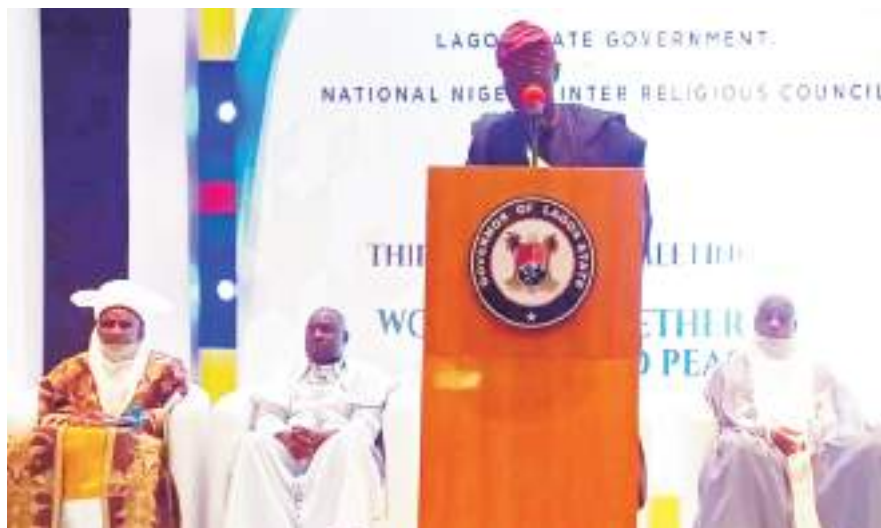
Executive Governor of Lagos State, Babajide Sanwo-Olu delivering his speech at the opening ceremony of NIREC

The Nigeria Inter-Religious Council (NIREC) held its meeting on Monday at the Continental Hotel, Victoria Island, Lagos State hosted by Governor Babajide Sanwo-Olu of Lagos State