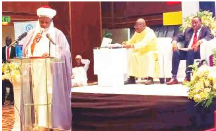
His Eminence, Sultan of Sokoto and President General, Nigeria Supreme Council for Islamic Affairs, Alhaji Muhammad Saad Abubakar III making his speech