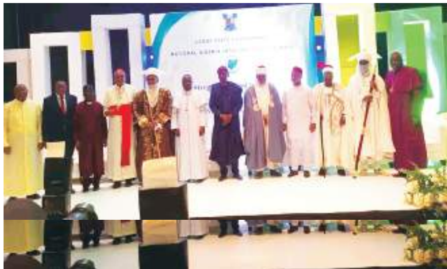
Chairman, Co-Chairman in a group photograph with dignitaries at the Nigeria Inter-Religious Council meeting in Lagos