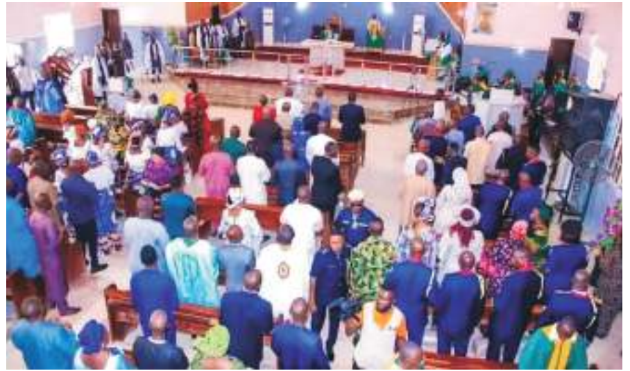
A cross section of worshippers during the 62nd Nigeria's Independence Service, 2022