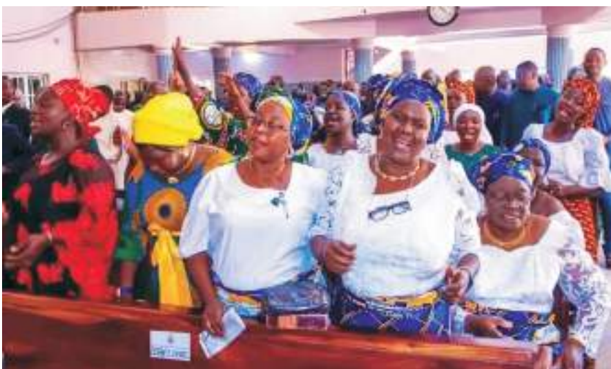
A cross section of Christian Association of Nigeria, Women Wing presenting their songs