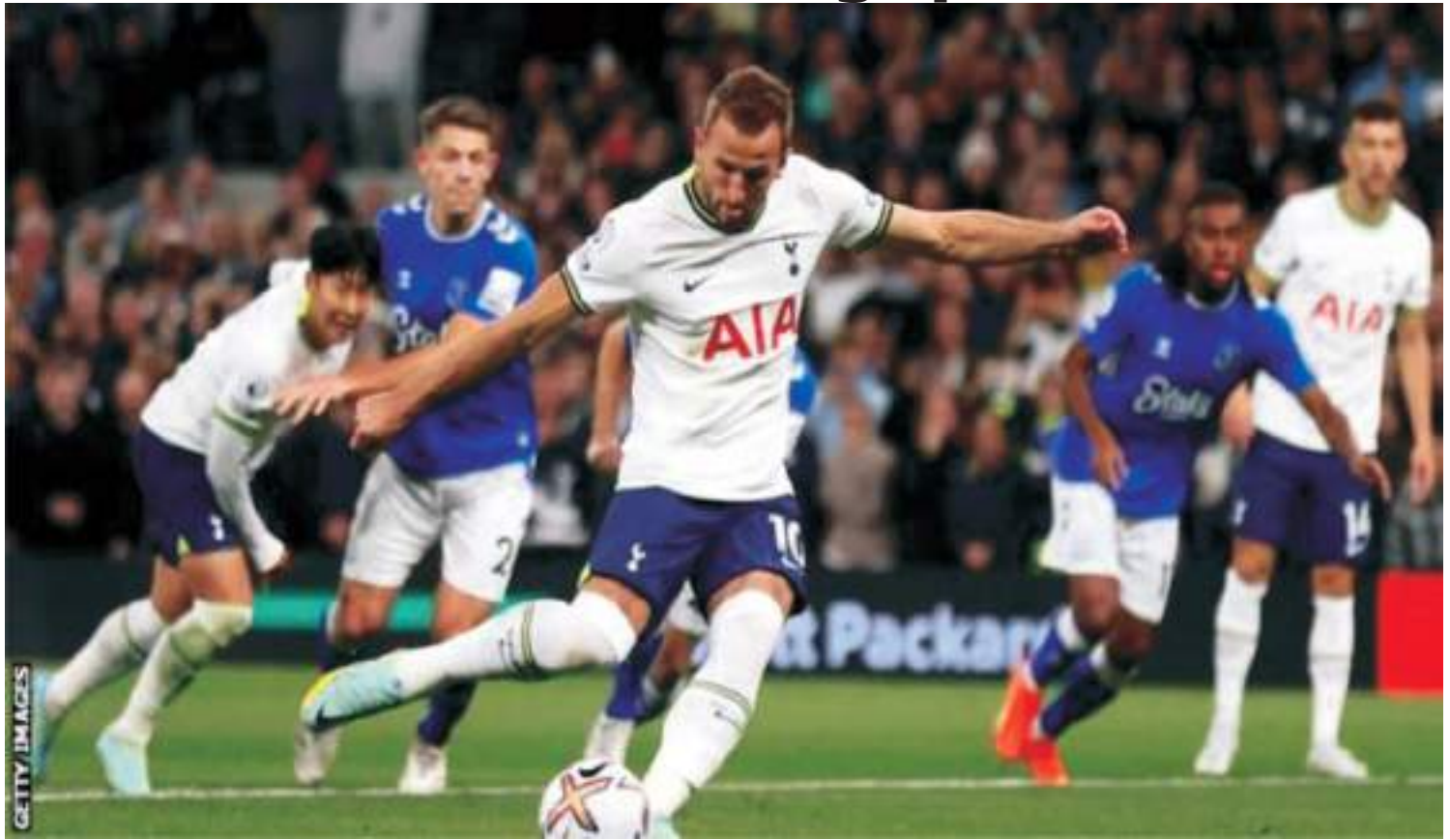
Harry Kane captain has found the net in five successive Premier League games for the first time in his career

The victory lifts Spurs on to 23 points from 10 league matches - their highest tally