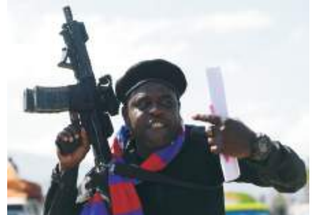
Jimmy Cherizier aka 'Barbecue' is the leader of the 'G9 Famil' gang in Haiti

outside of Haiti who are supporting them and directing them for their own purposes," US Secretary of State Antony Blinken said in Washington on Thursday.