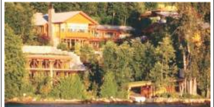
Bill GatesWorth: $81 billion Home: Medina, Washington

Here, take a look at the residences the six richest moguls call home: