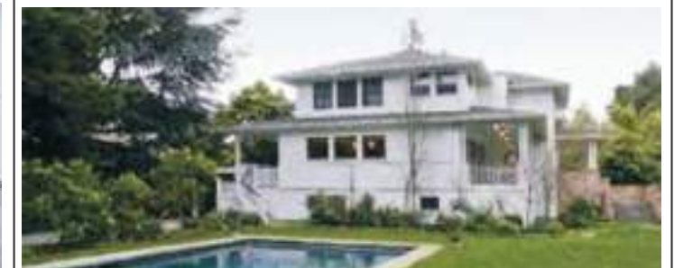
Mark Zuckerberg Worth: $55.5 billion Home: Palo Alto, California

His home sits on a corner in Omaha, Nebraska, which he bought in 1958 for $31,500. Mr. Buffett has lived there ever since. The house, originally built in 1921, underwent several expansions to make it a cozy and comfortable 6,500-square-foot home for the man who has a net worth of over $65.5 billion.