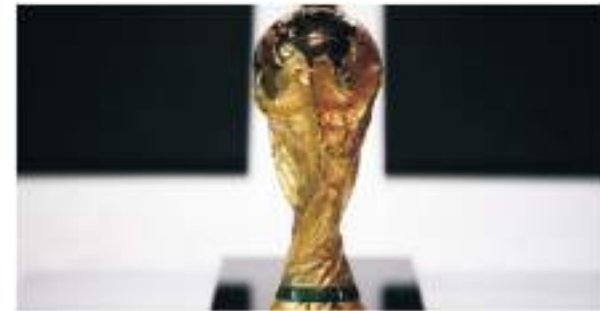
FIFA World Cup

A statement read: "As part of its commitment to recognise the contribution that football clubs make to the successful staging of the FIFA World Cup,