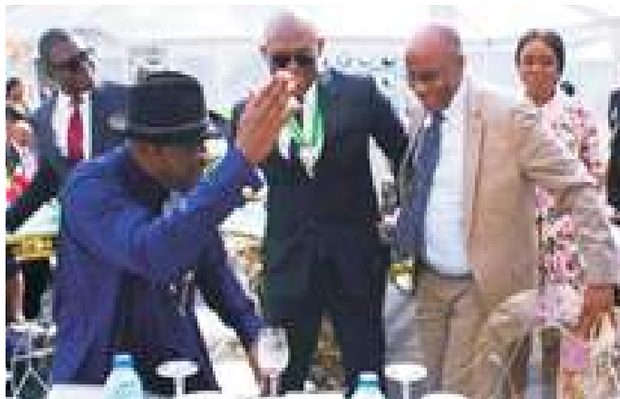
Former President Goodluck Jonathan (left) congratulating Tony Elumelu CFR (middle) and former, Minister of Transport, Rt. Hon. Rotimi Chibuike Amaechi