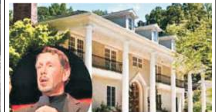
Larry Ellison Worth: $49.3 billion Home: Woodside, California

Mr. Zuckerberg, 32, purchased his first Craftsman-style 5,000-square-foot home in Palo Alto in 2011 for $7 million. He snapped up four of the houses surrounding his home in the following years for about $43.8 million to better keep his privacy. But his plan to tear down and rebuild those four homes has been stalled.