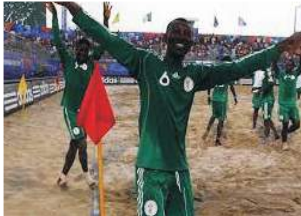
Nigerian Beach Soccer team

fixture for the competition following the withdrawal of Nigeria, which will now see seven teams compete for the ultimate prize at the fifth edition tournament.