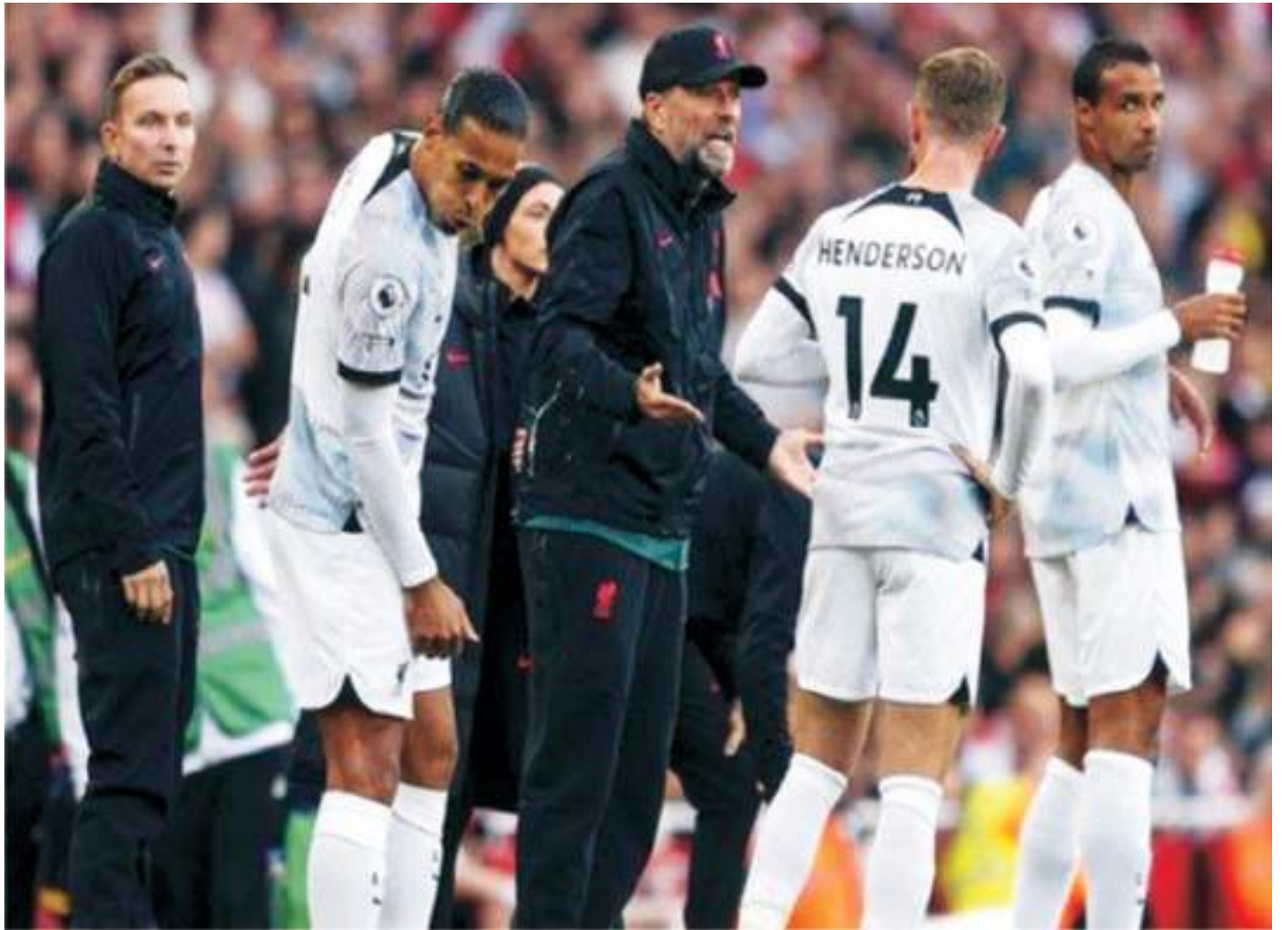
Defeat at Arsenal left Liverpool 14 points off the top of the Premier League

Gracenote finds that in 2021-2022, Liverpool created an average of 3.75 big chances per match and in their title-winning season, 3.5 per match.