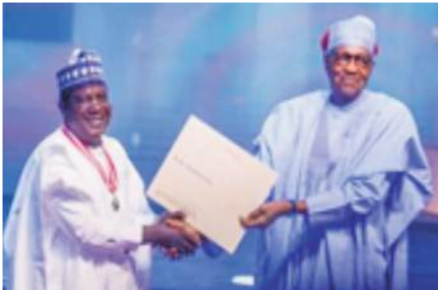
Governor Simon Bako Lalong of Plateau State (left) receiving his CON certificate from President Buhari

Plateau State Governor, Director General, Tinubu/Shettima Presidential Campaign Council, Rt. Hon. Simon Bako Lalong was among other Nigerians presented with National Honors at the International Conference Centre, Abuja by President Muhammadu Buhari