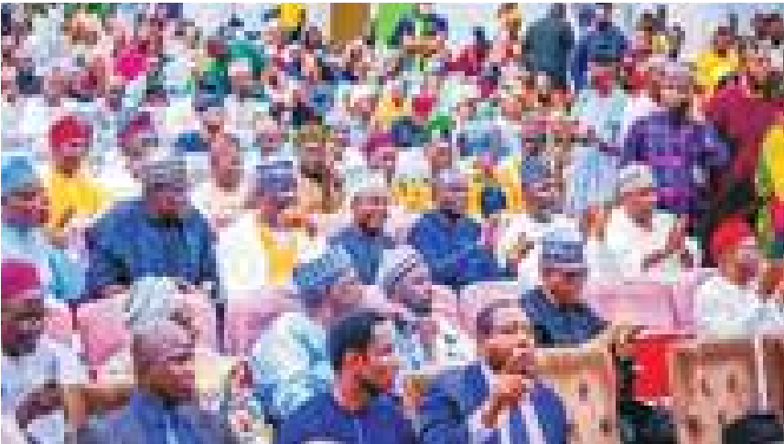
A cross section of important dignitaries listening to speeches at the Chief SD Lar Foundation