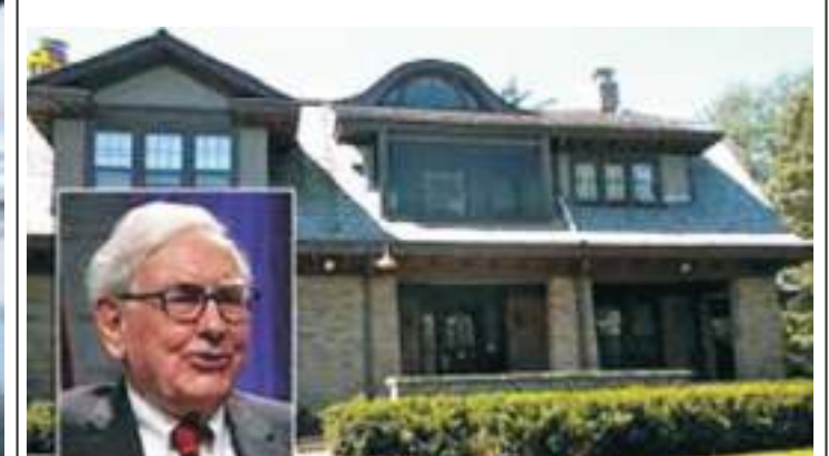
Warren Buffett Worth: $65.5 billion Home: Omaha, Nebraska

His home at Medina, Washington, close to Amazon's headquarters, boasts 5.35 acres and about 29,000 square-foot of living space. Aside from the main home, there's also a caretaker's cottage and a 4,500-square-foot boathouse on Lake Washington.