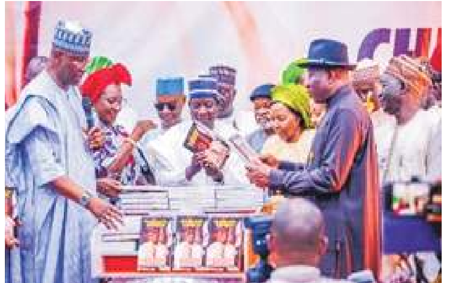
Chairman of the occasion and former Nigeria's President, Dr. Goodluck Jonathan (right) representative of President Buhari, Mr. Boss Mustapha, SGF (left) with other personalities unveiling the book