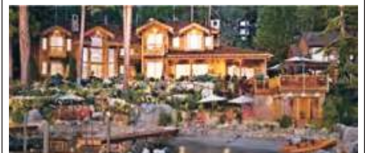
Jeff BezosWorth: $67 billion Home: Medina, Washington

Mr. Gates, 60, spends most of his time at his 66,000-square-foot Medina, Washington, mansion, nicknamed Xanadu 2.0 after the title character's estate in Citizen Kane. The mansion overlooks Lake Washington. It took Mr. Gates seven years and $63.2 million to build this house, which is filled with lots of high-tech features. He purchased the lot for $2 million in 1988, but it's now worth an estimated $170 million, according to public records.