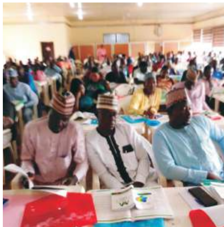
A cross section of participants at the workshop