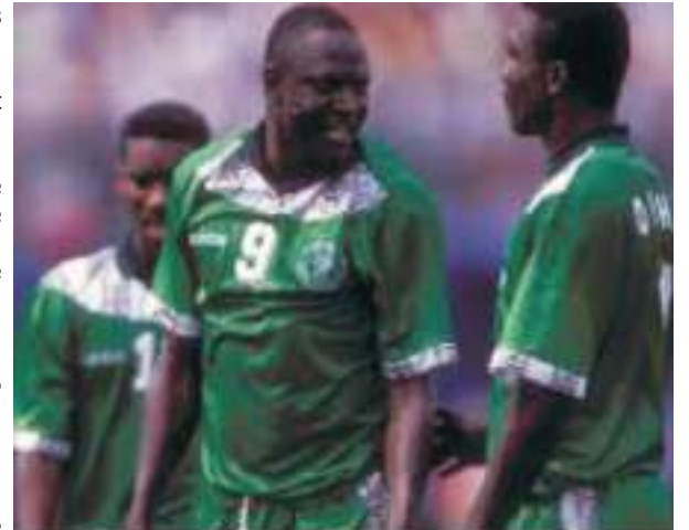
The most prolific striker in Nigeria's football history died on May 4, 2012, aged only 48

ever goal at the FIFA World Cup in 1994 and also represented the African giants at the 1998 World Cup in France.