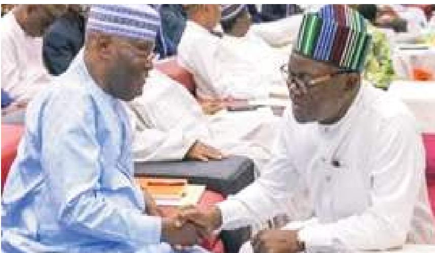
Former Vice President, Atiku Abubakar (left) with the Governor of Benue State, Dr. Samuel Ortom