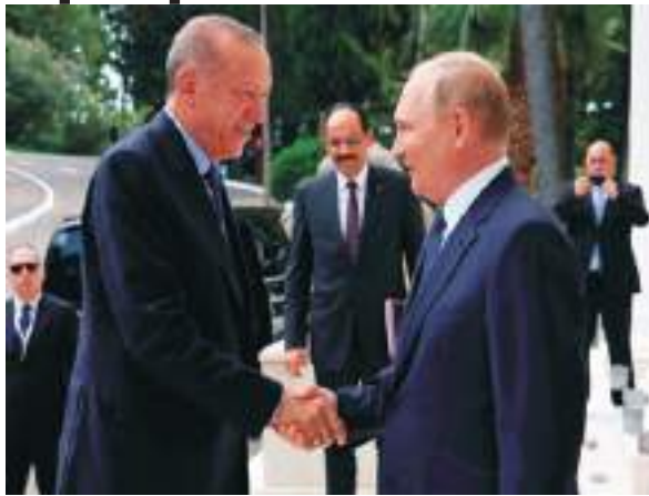
Erdogan says Russian and Turkish energy authorities would work together to designate the best location for a gas distribution centre in Turkey

"The weakening of Europe in all aspects is not in Turkey's interest. On the contrary, it is against [Turkey's interests],"