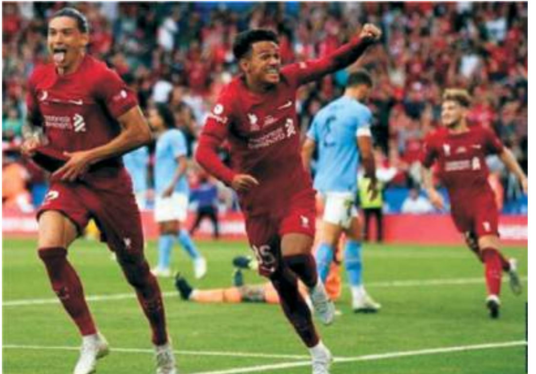
After scoring in the Community Shield, Darwin has netted only twice

If there was a time for the Uruguayan to bring back a bit of that July sunshine and optimism for Liverpool, this Sunday would surely be it.