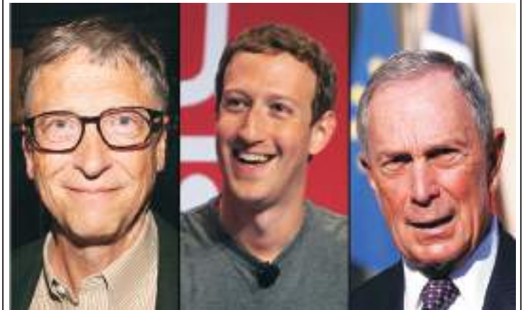
L - R: Bill Gates, Mark Zuckerberg and Michael Bloomberg.

Have you checked the newest "Forbes 400: The Full List of The Richest People in America" yet?