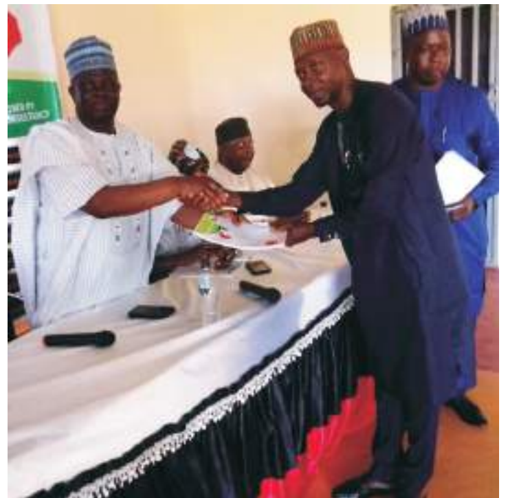
Certificates being presented to some of the participants