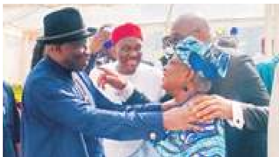
Dr. Mrs. Ngozi Okonjo-Iweala GCON, Director General WTO (right) being congratulated by Dr. Goodluck Jonathan, former President (left)