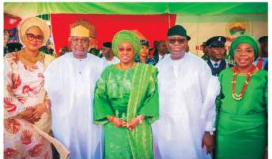
Outgone Governor of Ekiti State in photograph with the incoming and his Deputy (right)