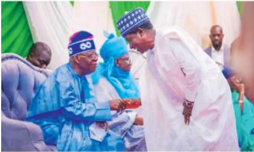
Sen. Bola Ahmed Tinubu, APC Presidential Candidate (left) with his Director General of the Campaign Council, Rt. Hon. Simon Bako Lalong (CON), Plateau State Governor