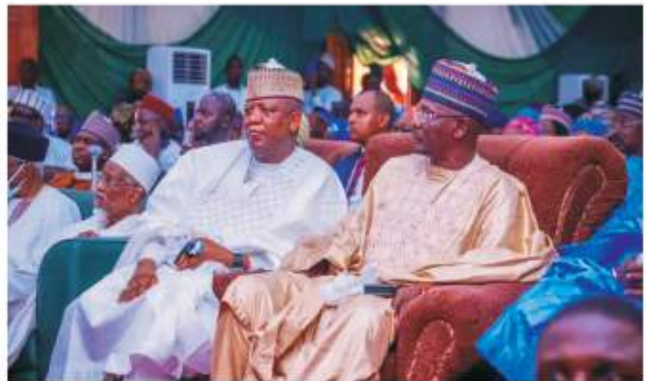
Former Governor of Zamfara State, Abdulaziz Yari (left) with Nasarawa State Governor, Engr. Abdullahi Sule