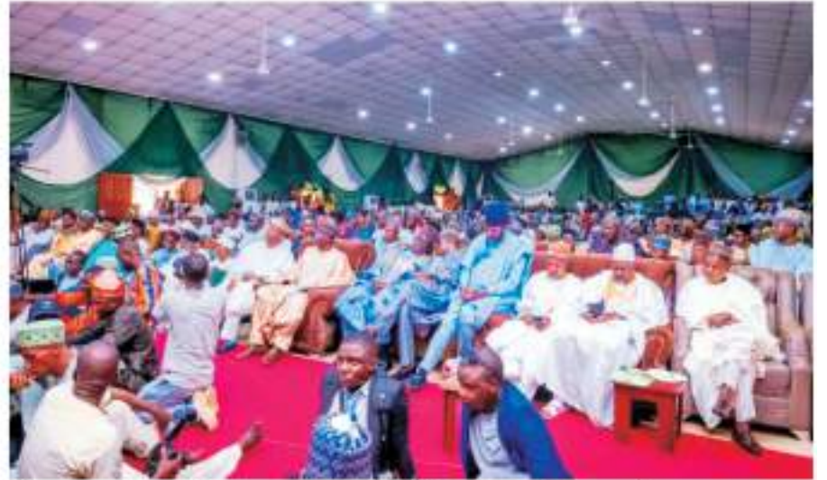
A cross section of Governors and other dignitaries at the meeting