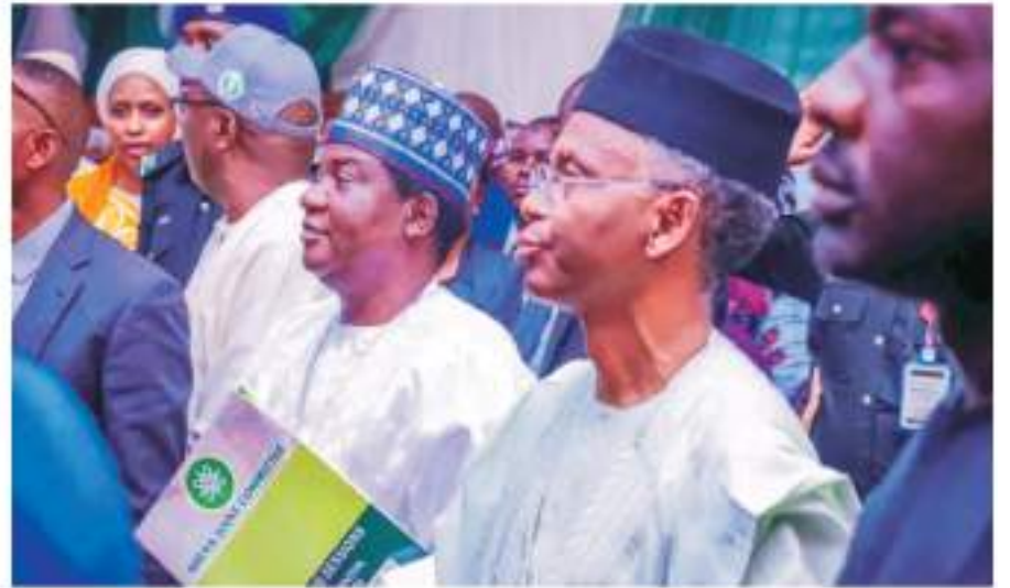
Governors Simon Bako Lalong (CON) of Plateau State and Malam Nasir el-Rufai of Kaduna State listening with keen interest