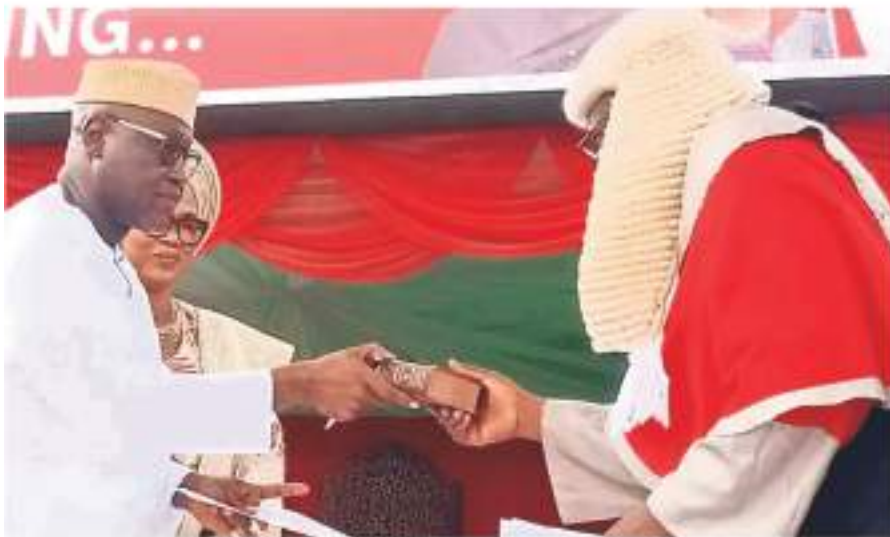
Governor Biodun Oyebanji (left) receiving the Holy Bible from the Chief Judge of the State after the swearing in