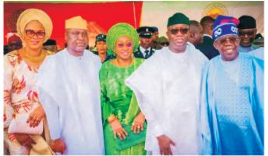
Asiwaju Bola Ahmed Tinubu, APC Presidential Candidate (right) in a photograph with the immediate past Governor, Dr. Kayode Fayemi, wife and the Governor of Ekiti State, Biodun Oyebaji and wife