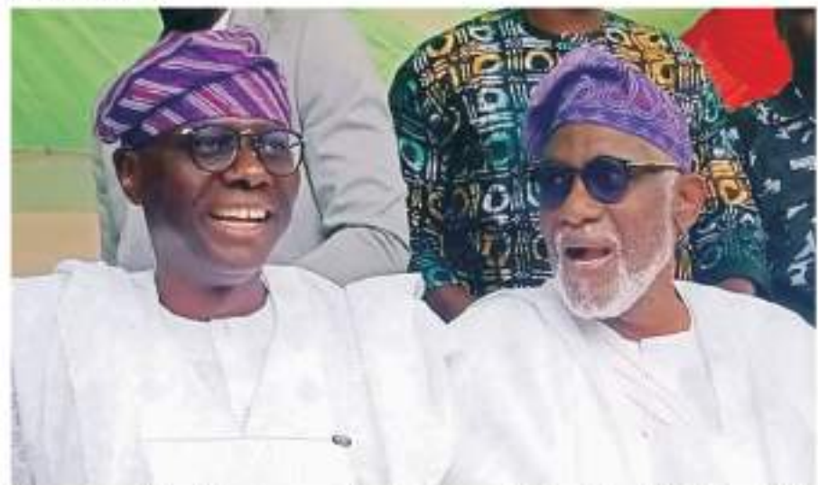
Governors Babajide Sanwo-Olu of Lagos State with his Ondo State counterpart, Oluwarotimi Akeredulu, SAN at the ceremony