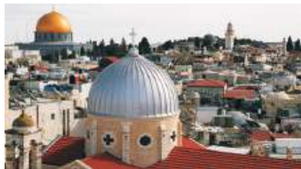
Australia says the status of Jerusalem should be resolved in peace talks between Israel and the Palestinian people

The Australian decision was widely criticised by pro-Palestinian groups as well as by the Labor party, which was then in opposition and promised to reverse the move if it was elected.