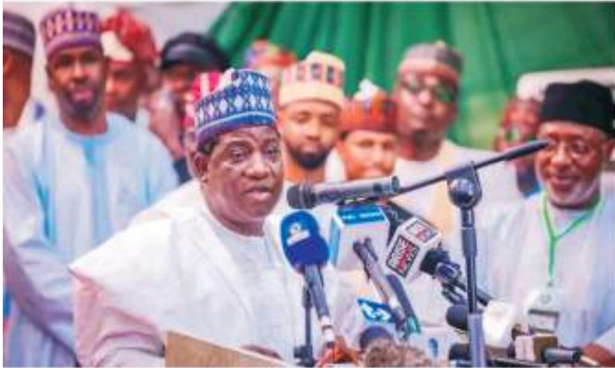
Northern Governors' Forum Chairman, Governor Simon Bako Lalong (CON) delivering his speech at the meeting