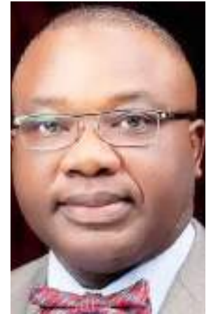
Tony Ojukwu (SAN)

"We must engage in the political process while respecting the fact that the Political space is filled with