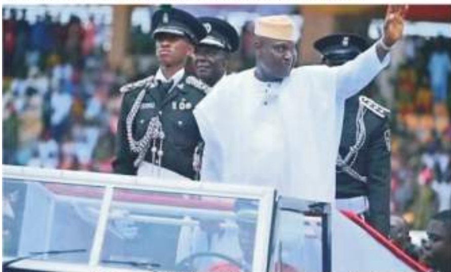
Newly sworn-in Governor Biodun Oyebanji on motorcade acknowledging cheers from the people