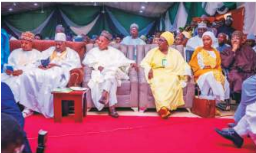
A cross section of Northern Governors and Deputy Governors listening to speeches