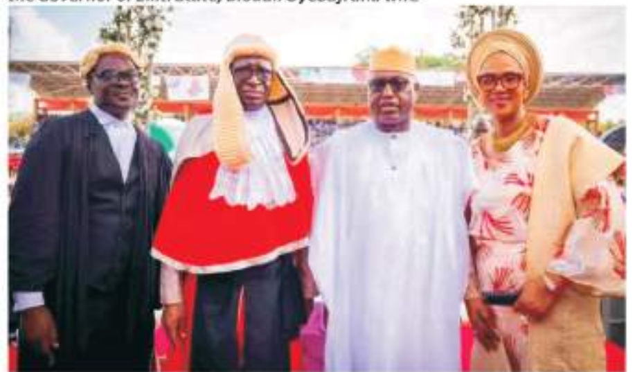
Governor Biodun Oyebaji, wife and the Chief Judge in a photograph after the swearing in ceremony