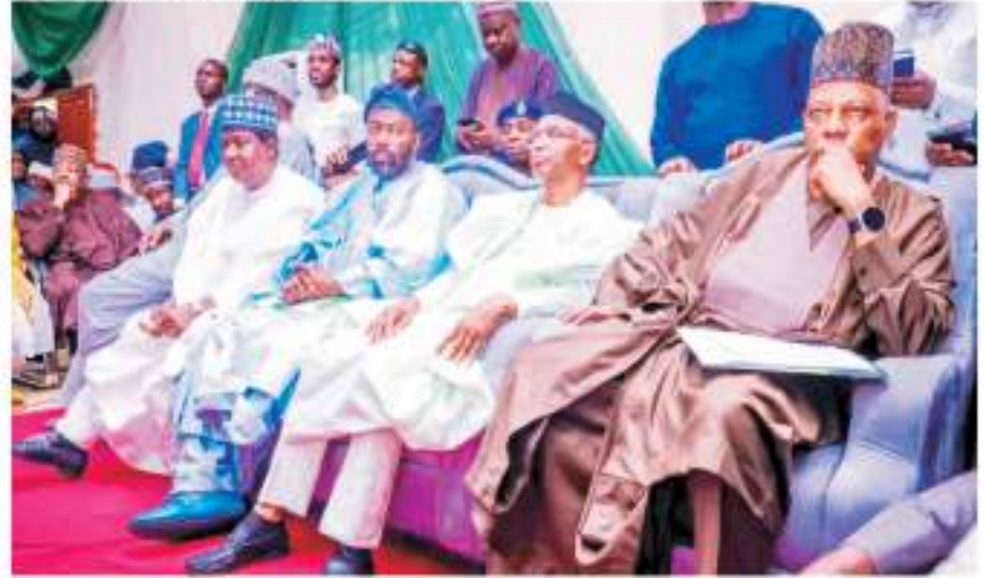
APC Vice Presidential Candidate, Sen. Kashim Shettima (right) and other Governors listening to the Presidential candidate's speech with rapt