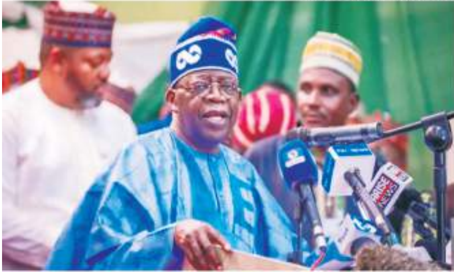
Asiwaju Bola Ahmed Tinubu is seen addressing the group at the Arewa House, Kaduna

The All Progressives Congress (APC), Presidential Candidate, his running mate, Sen. Kashim Shettima, Northern Governors on Monday met with Arewa Groups in Kaduna, Kaduna State