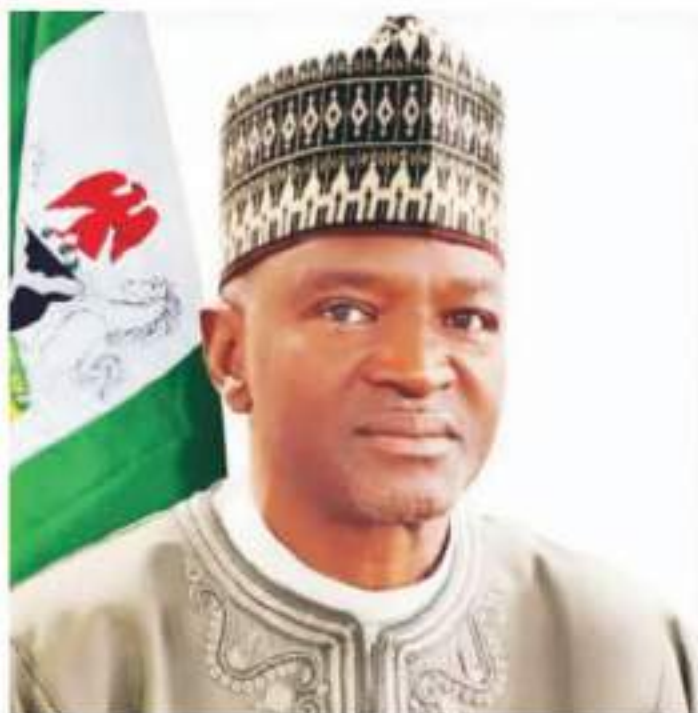
Abubakar, Agric Minister

As a result, current recommendations for biodiversity conservation focuses on the need to conserve dynamic, multi-scale ecological patterns and processes that sustain the full complement of biota and their supporting natural systems. Humans derive a vast number of services from biological communities and these services emerge from the ecosystem functions provided by the species within the communities. The biodiversity argument has two phases which are the anthropocentric (conserving for human benefit)