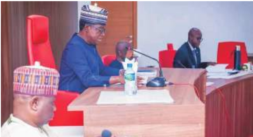
Governor Lalong (CON) presiding over the EXCO meeting

Plateau State Governor and Chairman, Northern Governors’ Forum, Rt. Hon. Simon Bako Lalong, (CON) last week presided over the State Executive Council (EXCO) meeting at its Chambers, new Government House Rayfield, Jos