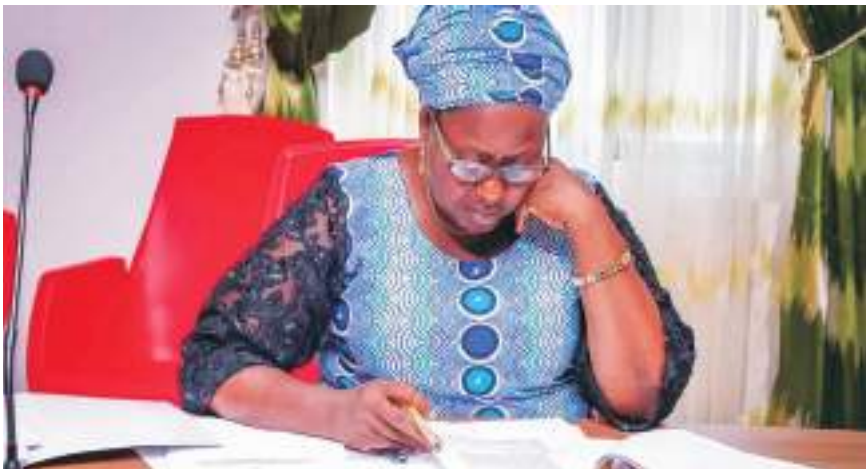
Commissioner for Education (Secondary) Hon. Elizabeth Wapmuk going through some memos during the meeting