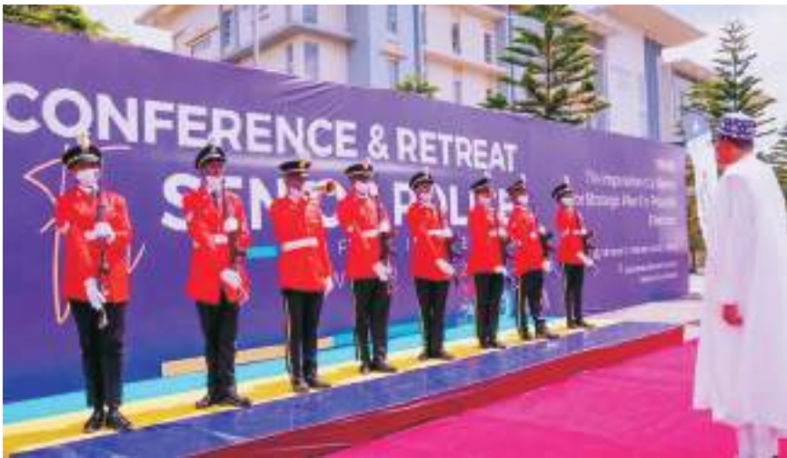
President Buhari (right) inspecting the Guard of honour mounted by the Nigeria Police Force

President Muhammadu Buhari on Monday flagged off Conference and Retreat for Senior Police Officers in Owerri, Imo State.