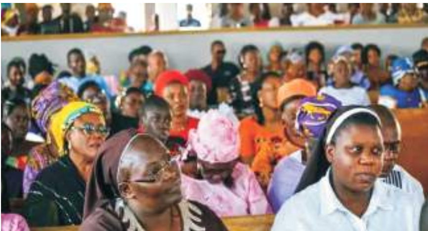
Reverend Sisters and other Parishioners during the 2022 Annual Harvest and thanksgiving