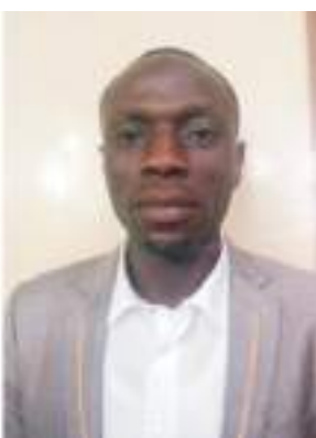
By HOSEA NYAMLONG

"Parents have become so materialistic that it is he who pays the piper that dictates the tune. They have thrown morality to the winds and careless whose horse is gored as they look out for their interest."