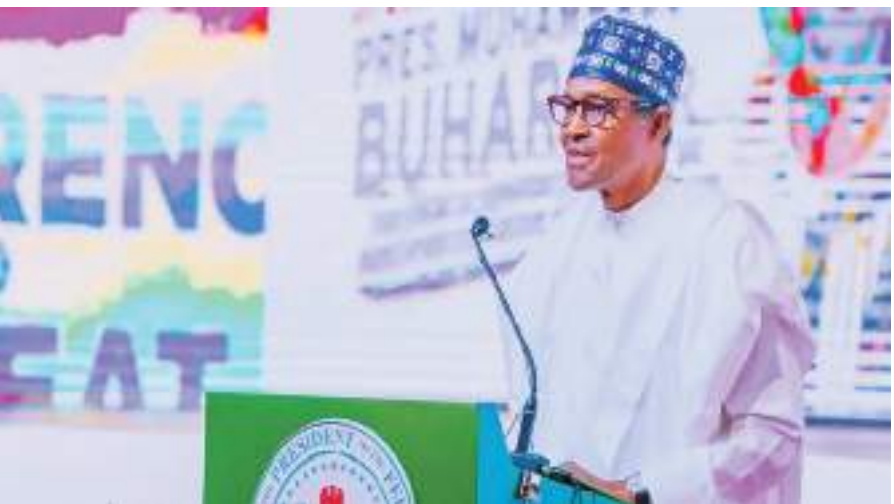
President Buhari declaring the conference open