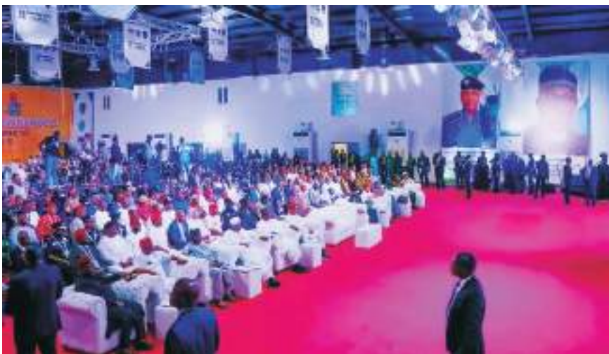
Cross section of conference participants listening to the Presidential speech