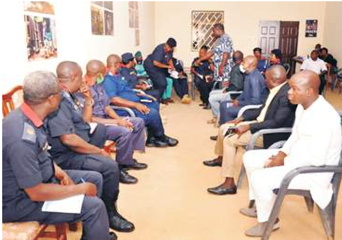
MUCABI Advocacy visit

that of promoting peace, justice and security through education and leadership development in Nigeria.