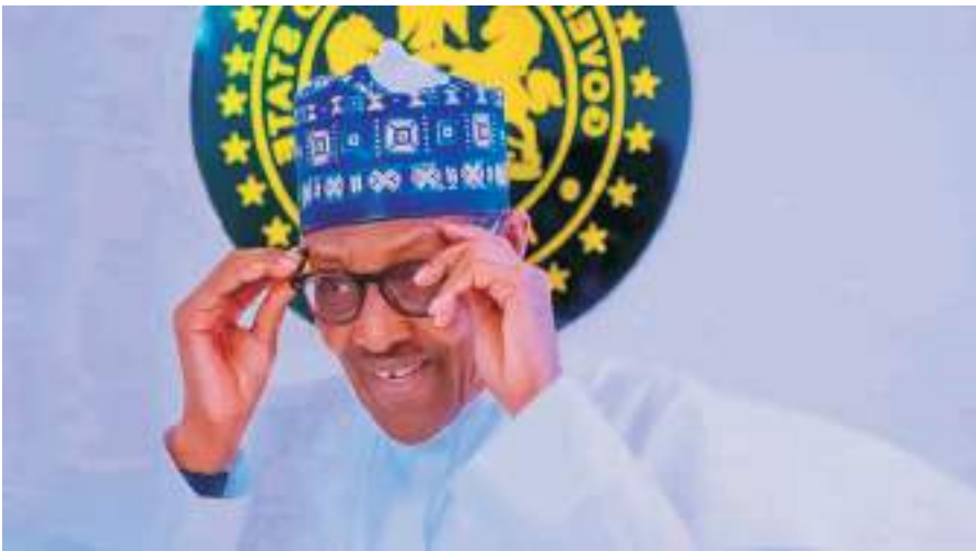
President Muhammadu Buhari adjusting his reading glasses at the conference