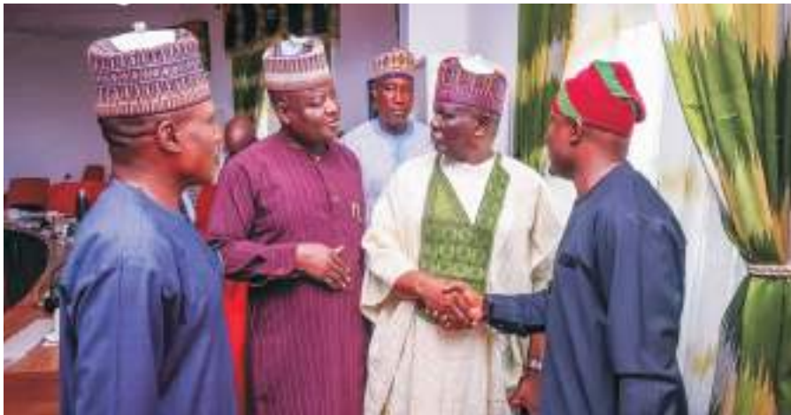
Cross section of members of the State Executive Council before the meeting