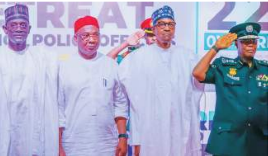
From left are, Governor Mai Mala Buni of Yobe, Governor Uzodimma of Imo State, President Buhari and the IGP, Usman Baba Alkali