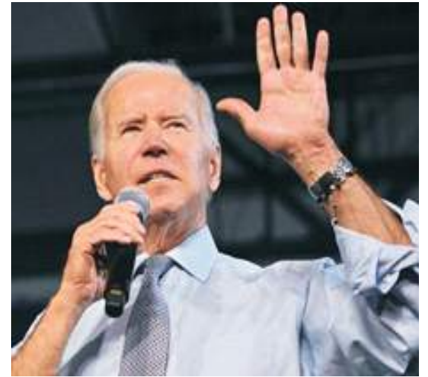
Joe Biden's Democrats face a tough battle to keep control of Congress

Republicans will control at least one chamber of Congress once the dust settles on these midterm elections.