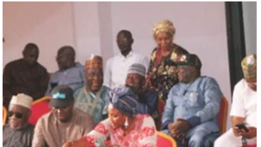
Cross section of Commissioners and members of the APC at the State level