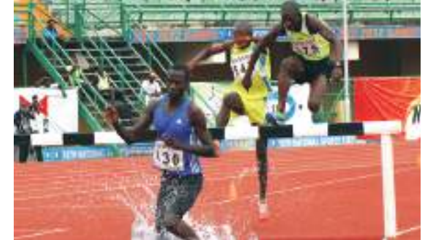
The 3000 steeple chase is among events listed for Asaba 2022 National Sports Festival

type and quality of tartan track used for the Birmingham 2022 Commonwealth Games in England.