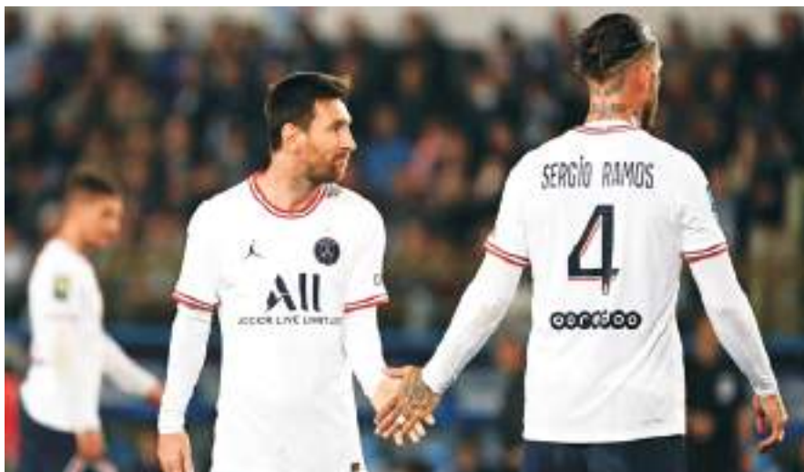
Messi and Ramos