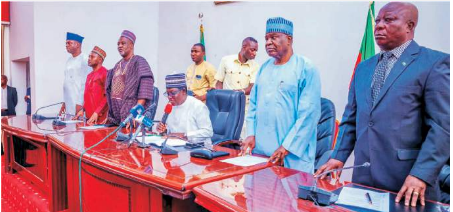
Lalong (sitting) recently inaugurated the Local Organising Committee for the APC Presidential Campaign flag off in Jos.

"Furthermore, the House of Representatives has convened the Accountant Continued on page 2