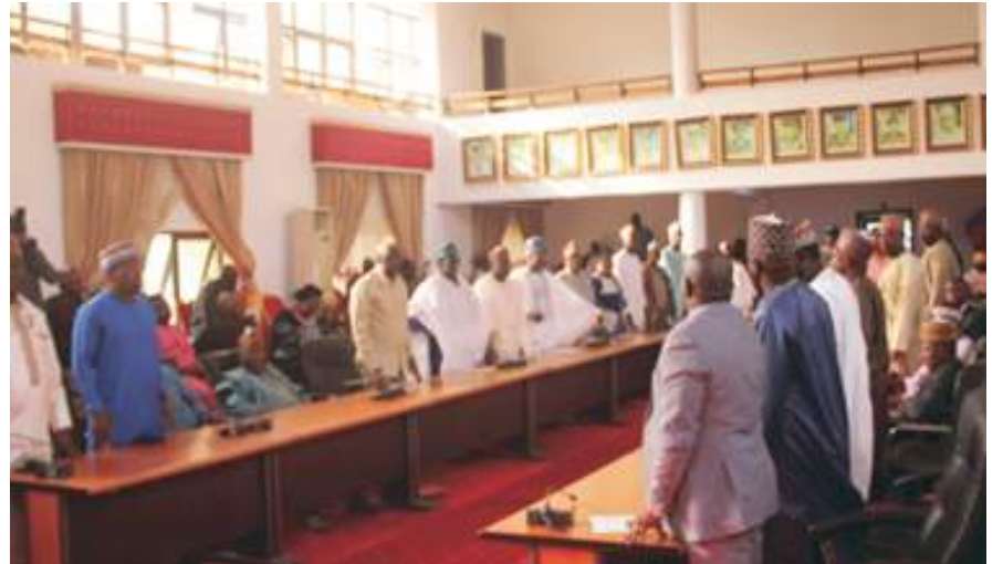
Cross section of members of the LOC being inaugurated by the Governor.