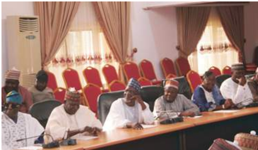
Cross section of members of the Local Organising Committee listening to the inauguration speech