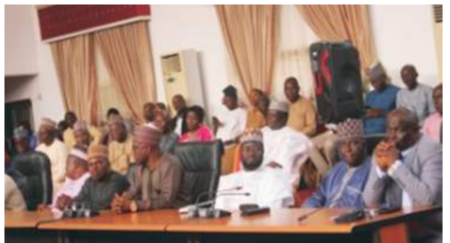
Another cross section of LOC at inauguration