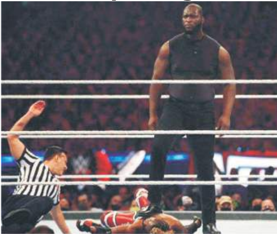
Omos, Pays Surprise Visit To Family In Lagos

THE WWE Superstar was pictured with his family members in Nigeria this week, having been away for more than a decade.