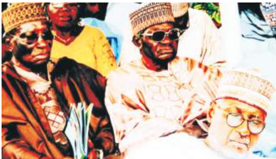
Former Military Governor of Plateau State, Rear Admiral Samuel Bitrus Atukum, Former Governors of Plateau State, Sir Fidelis Tapgun and that of Bauchi, Alhaji Ahmadu Adamu Muazu at the ceremony