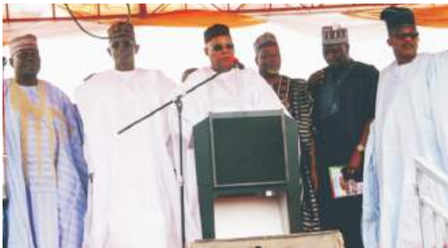
Sen. Kashim Shettima, Yobe State Governor, Mai Mala Buni flanked by Senators and Deputy Speaker, House of Representatives delivering his good will message