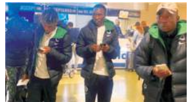
Super Eagles land in San Jose, Costa Rica

The Super Eagles have lost three of six matches to Mexico, tasted defeat twice in three games against the United States, and have won just two of six games against Jamaica.