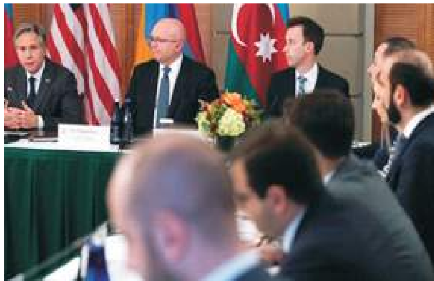
US Secretary of State Antony Blinken (top left) told the Armenian and Azerbaijan delegations that direct dialogue was the best way to a 'truly durable peace'

How he handles that speech, and how he deals with the adversity that is coming in the months ahead, will go a long way toward determining how much support he will have in his own party for another four years in office.