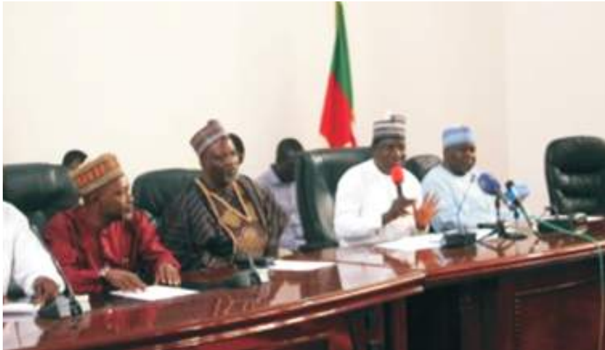
Governor Lalong ( with mic) inaugurating the LOC Chairman and members

The DG, APC Presidential Campaign Council and Governor of Plateau State, Rt. Hon. Simon Bako Lalong, (CON) on Sunday inaugurated Local Organising Committee for the preparation of the APC Presidential Campaign flag off coming up in Jos on the 15th November, 2022.