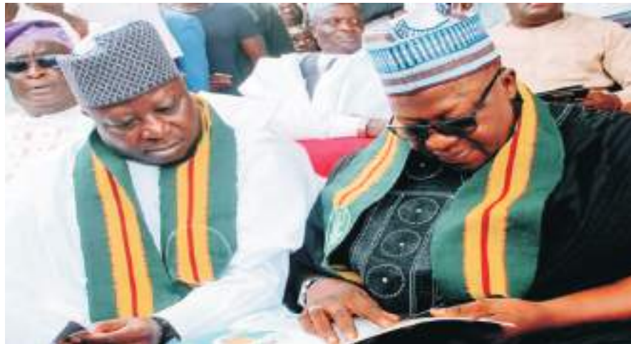
Former Governor of Plateau State, Sen. Joshua Chibi Dariye (right) with the APC State Chairman, Hon. Rufus Bature