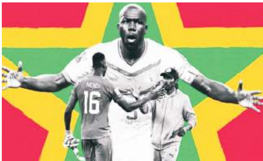
Senegal are the current African champions

England are favourites but after a wonderful 2022 so far, Cisse and Senegal will feel they have nothing to fear.