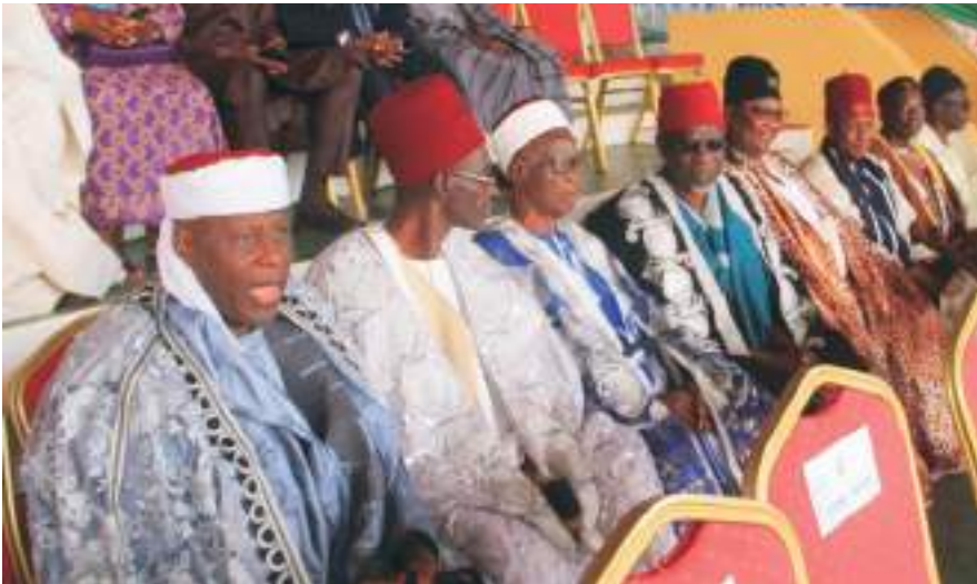
Cross section of Second Class Traditional rulers at the festival