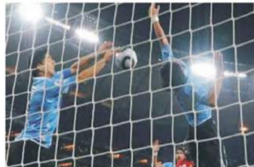
Fifa World Cup

The BBC is not responsible for the content