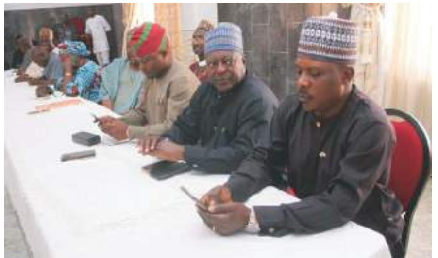
Cross section of Commissioners at the occasion