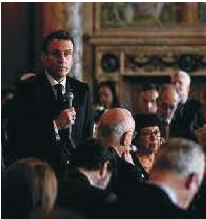
Macron in a joint press conference