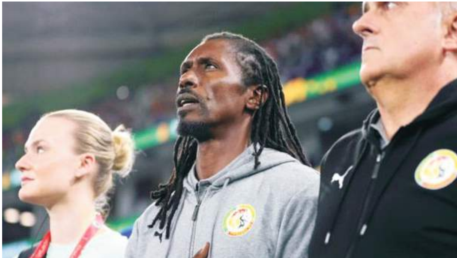
Senegal manager Aliou Cisse captained the 2002 team that reached the Africa Cup of Nations final and World Cup quarter-finals

Chelsea duo Kalidou Koulibaly and Edouard