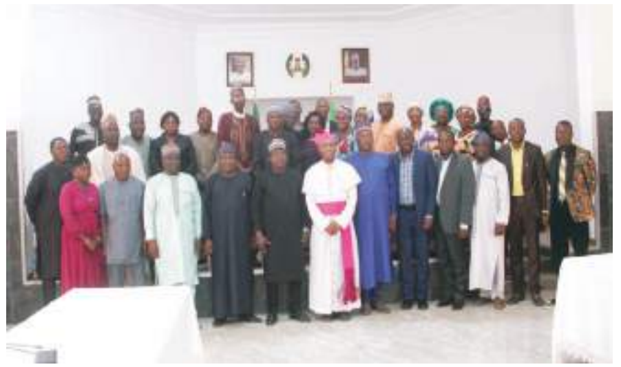
Governor Lalong, Deputy Governor, SGS, Commissioners, PLASU, Chairman of Governing Council in photograph with other Council members