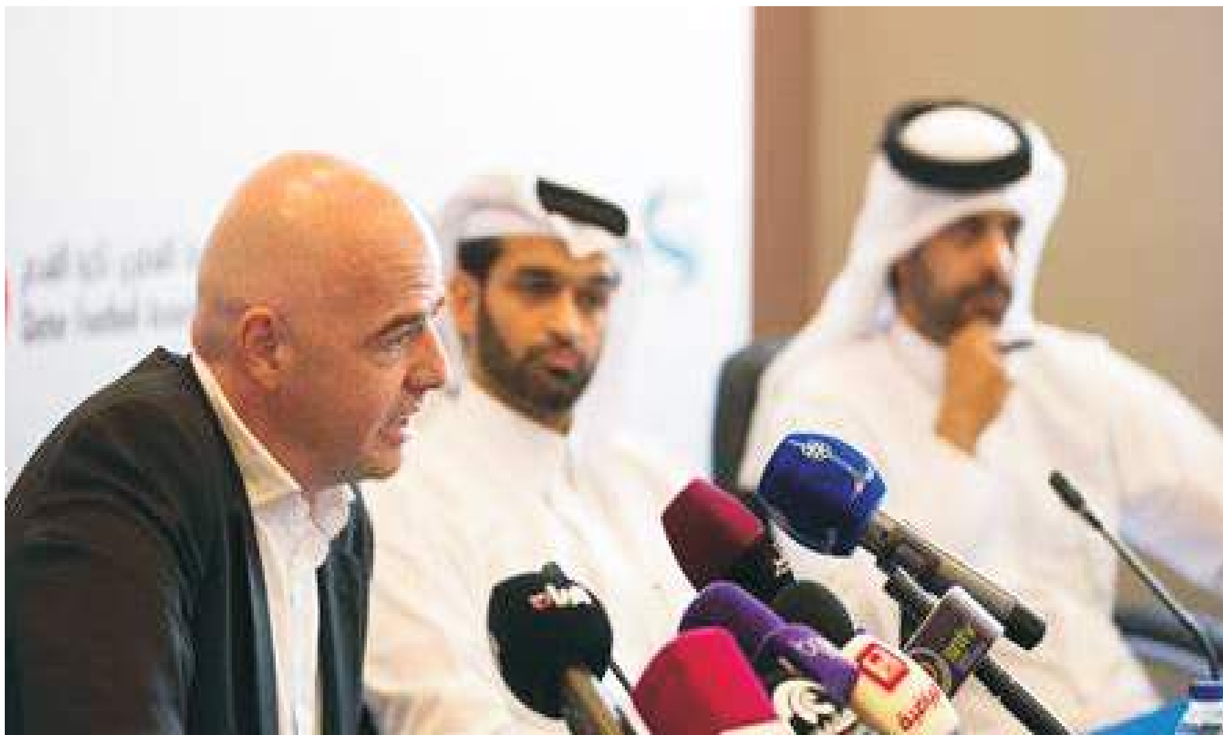
FIFA President, Gianni Infantino at the press conference in qatar