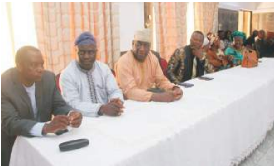
Cross section of delegation with Deputy Vice Chancellors, Academics and Admin, Registrar, during the visit