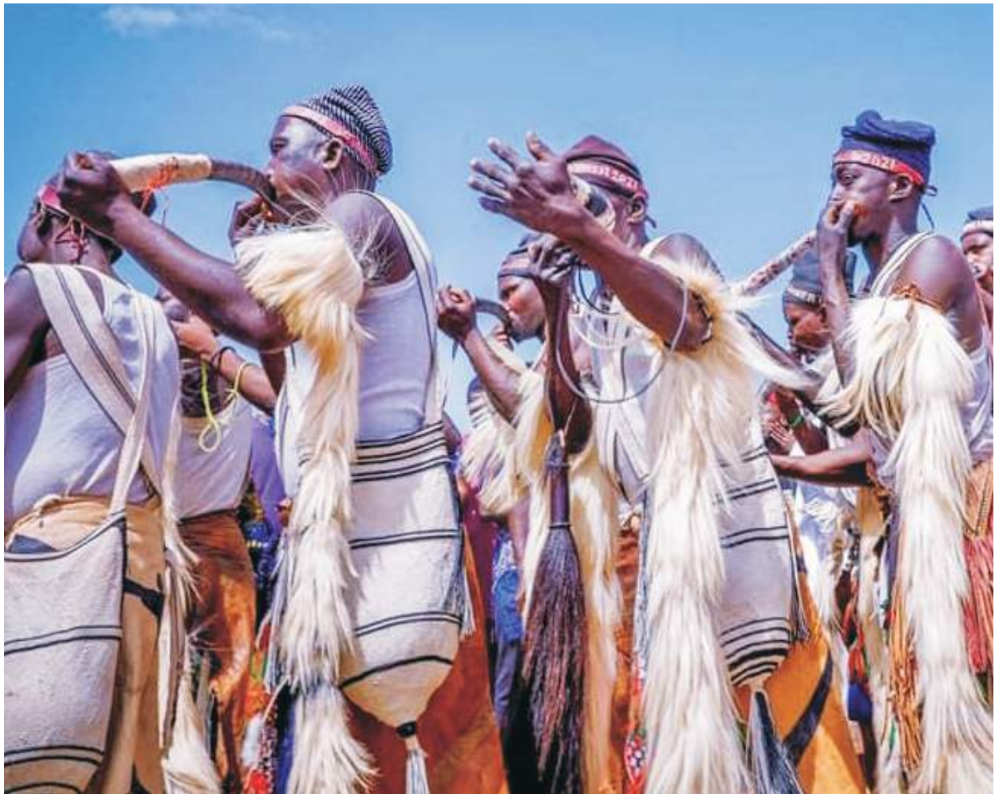
Ngas dance group

In the spirit of love and brotherliness, the Ngas Christmas Carols have also always feature multiple other tribal groups in the state and beyond. This has