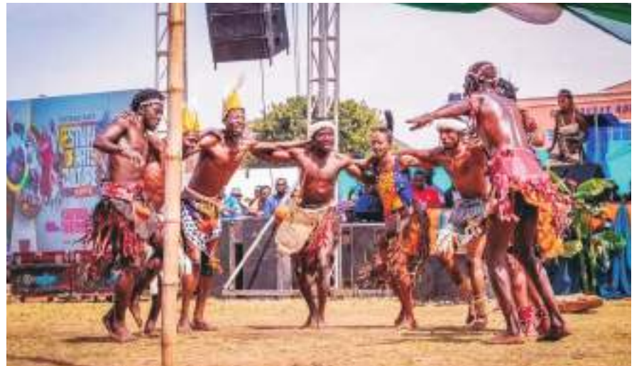
Plateau State Cultural Troupe entertaining guests at PLAFEST 2022