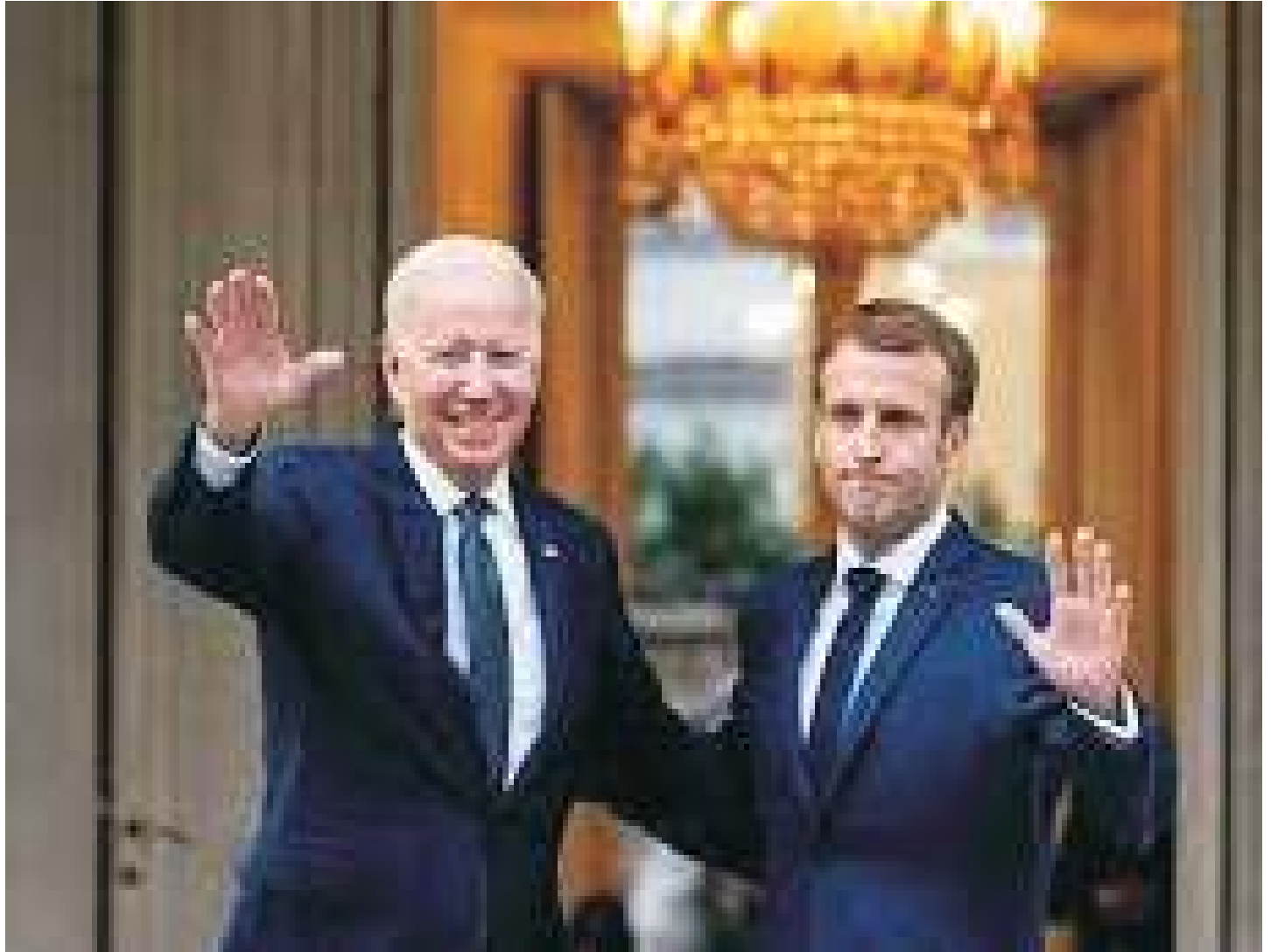
Biden with Macron as he Pays State Visit to US

Separately, at the luncheon with members of Congress from both parties, along with business leaders and diplomats, Macron