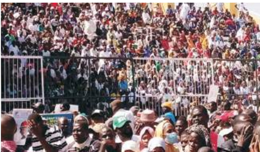
A mammoth crowd listening to the speech by PDP Presidential Candidate