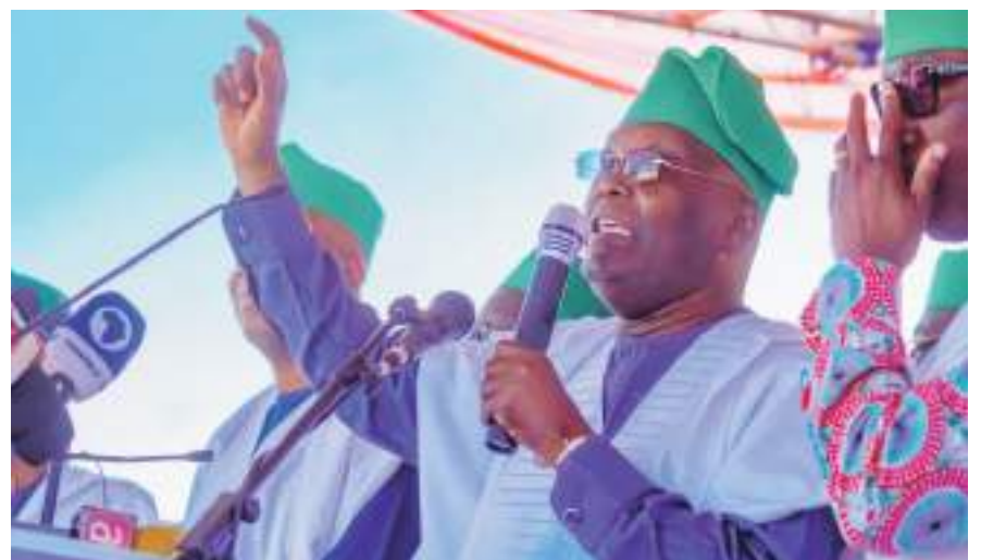
Turakin Adamawa, Alhaji Atiku Abubakar, PDP Presidential Candidate delivering his speech