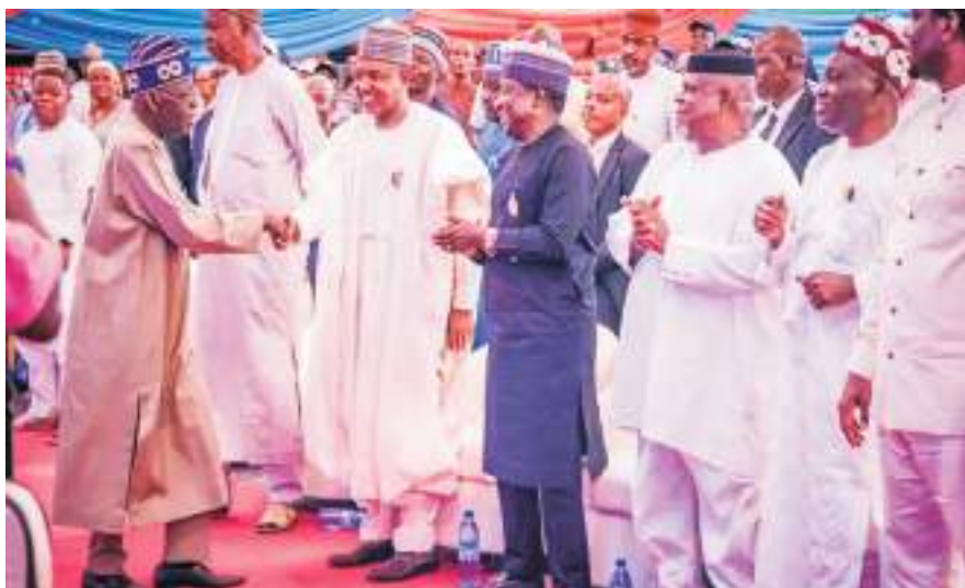
Asiwaju Bola Ahmed Tinubu in handshake with Governor Bagudu Atiku of Kebbi State and others