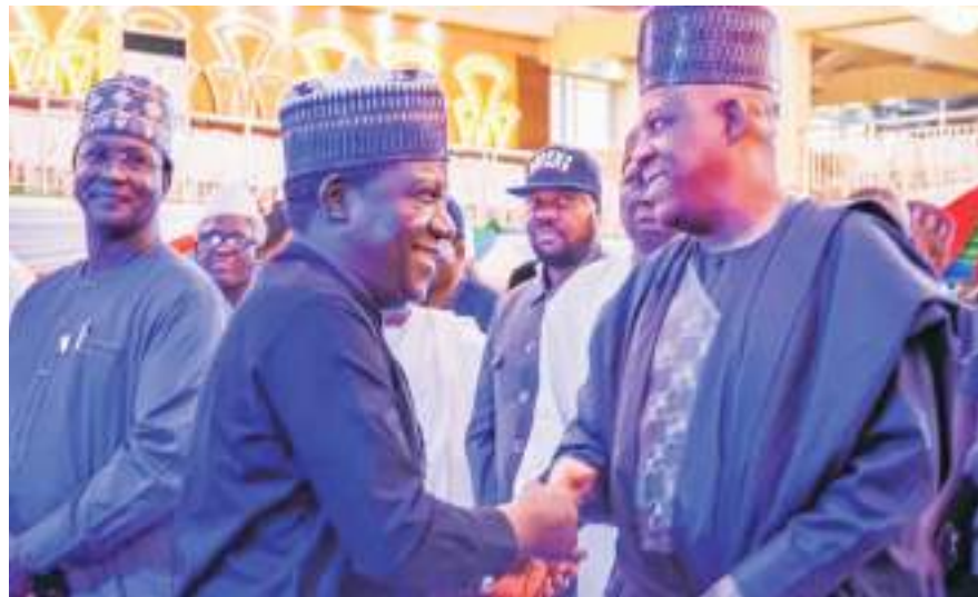
Governor Lalong (left) in a handshake with the APC Vice Presidential candidate, Sen. Kashim Shettima