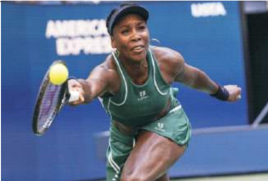
Venus Williams will compete in her 22nd Australian Open in January