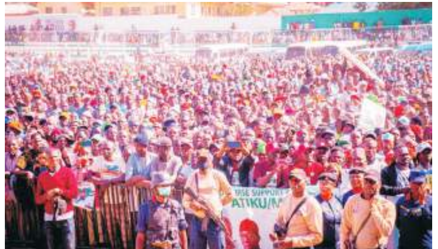
Cross section of PDP supporters at the Party's Presidential Rally in Jos