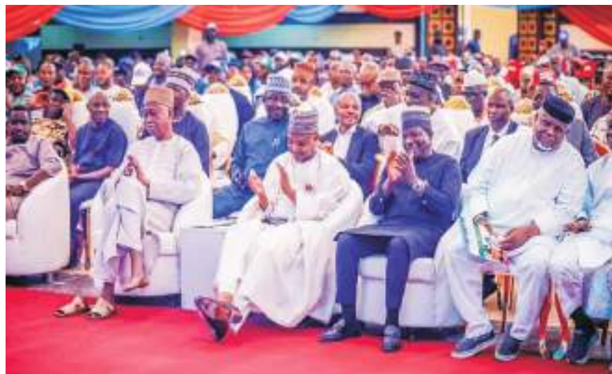
DG PCC, Rt. Hon. Simon B. Lalong and Organised Labour applauding to the speech by the APC Presidential candidate