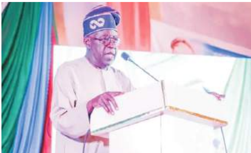
APC Presidential candidate, Asiwaju Bola Ahmed Tinubu delivering his remark