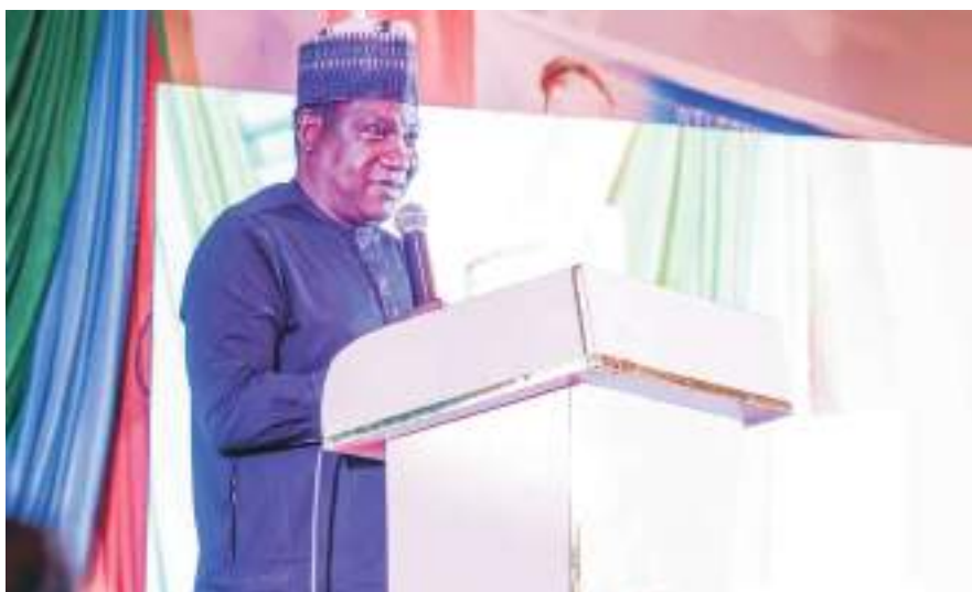
Director General of the Presidential Campaign Council and Governor of Plateau State, Rt. Hon. Simon Bako Lalong (CON) delivering the welcoming