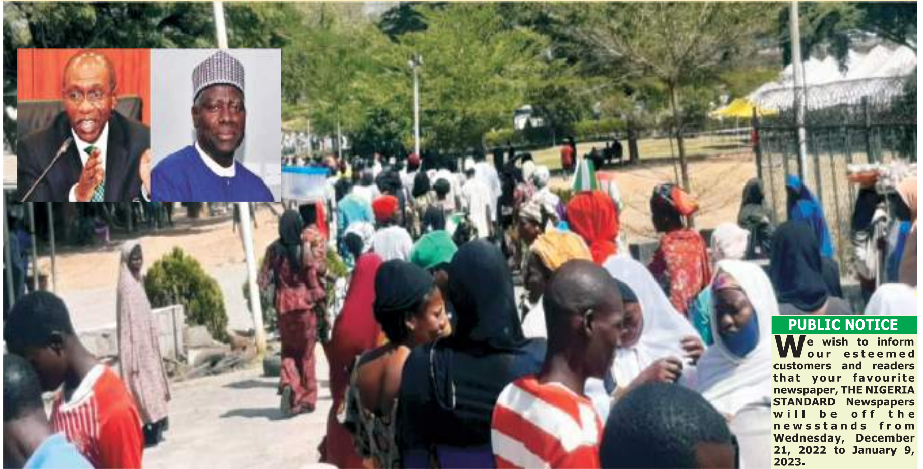
Protest rocks Nigeria's capital over alleged plot to arrest, charge CBN Gov for terrorism