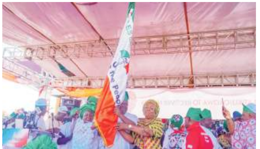
National PDP Chairman presenting the Party's flags to candidates at the Rwang Pam Township Stadium, Jos