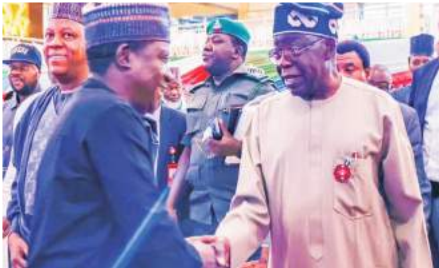
Director General of the PCC and Governor Simon Bako Lalong (CON) welcoming the APC Presidential candidate, Asiwaju Bola Ahmed Tinubu

The All Progressives Congress (APC) Presidential Campaign Council (PCC) and the Presidential Candidate, Asiwaju Bola Ahmed Tinubu on Monday held Town Hall meeting with organised Labour in Abuja