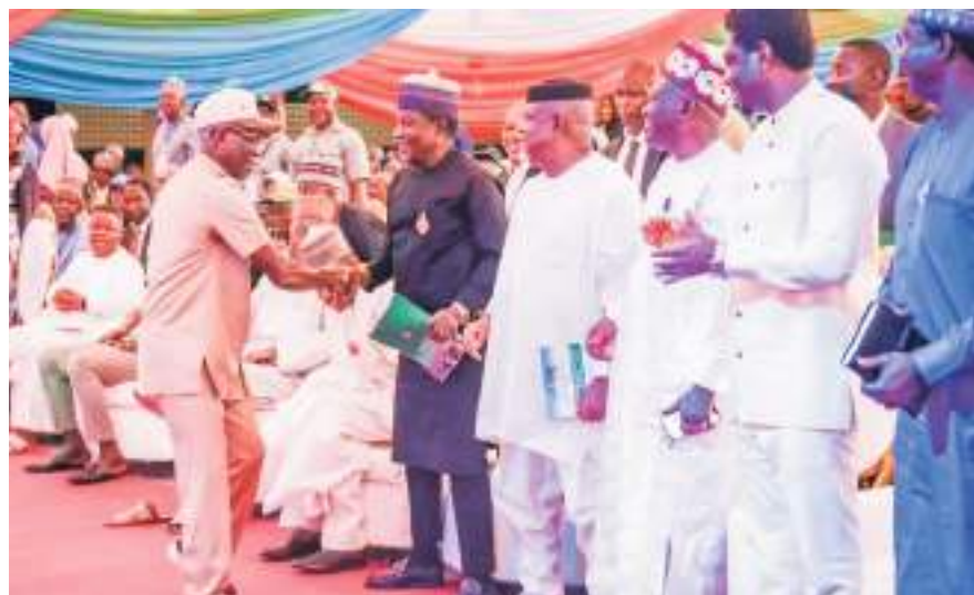
Comrade Adams Oshiomhole exchanging greetings with Organised Labour and DG PCC, Rt. Hon. Simon Bako Lalong (CON)