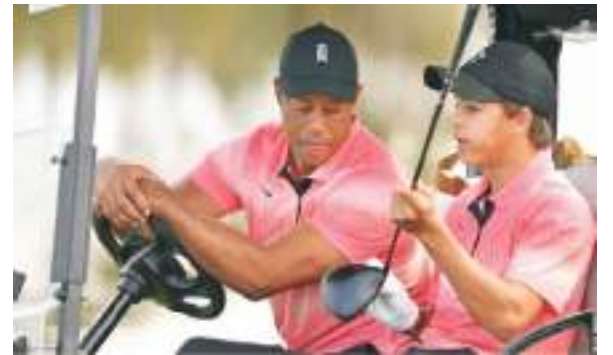
Woods, who played alongside son Charlie, used a cart to help him get around the course at the PNC Championship

broken leg. This year nothing was broken, but it was good that all the pieces are there again all lined up," he said. "Plantar fasciitis is no fun and now I get to truly recover and heal and progress forward on this. "There are so many good things that I've been able to do physically - be able to hit the golf ball and practice and do everything in a standstill. "But I haven't been able to get from point A to point B and we're obviously going