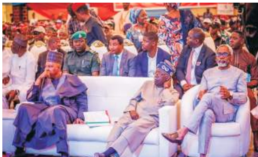
APC Presidential and Vice with the Speaker, House of Reps, Rt. Hon. Femi Gbajabiamila listening with rapt attention to remarks by the DG, PCC