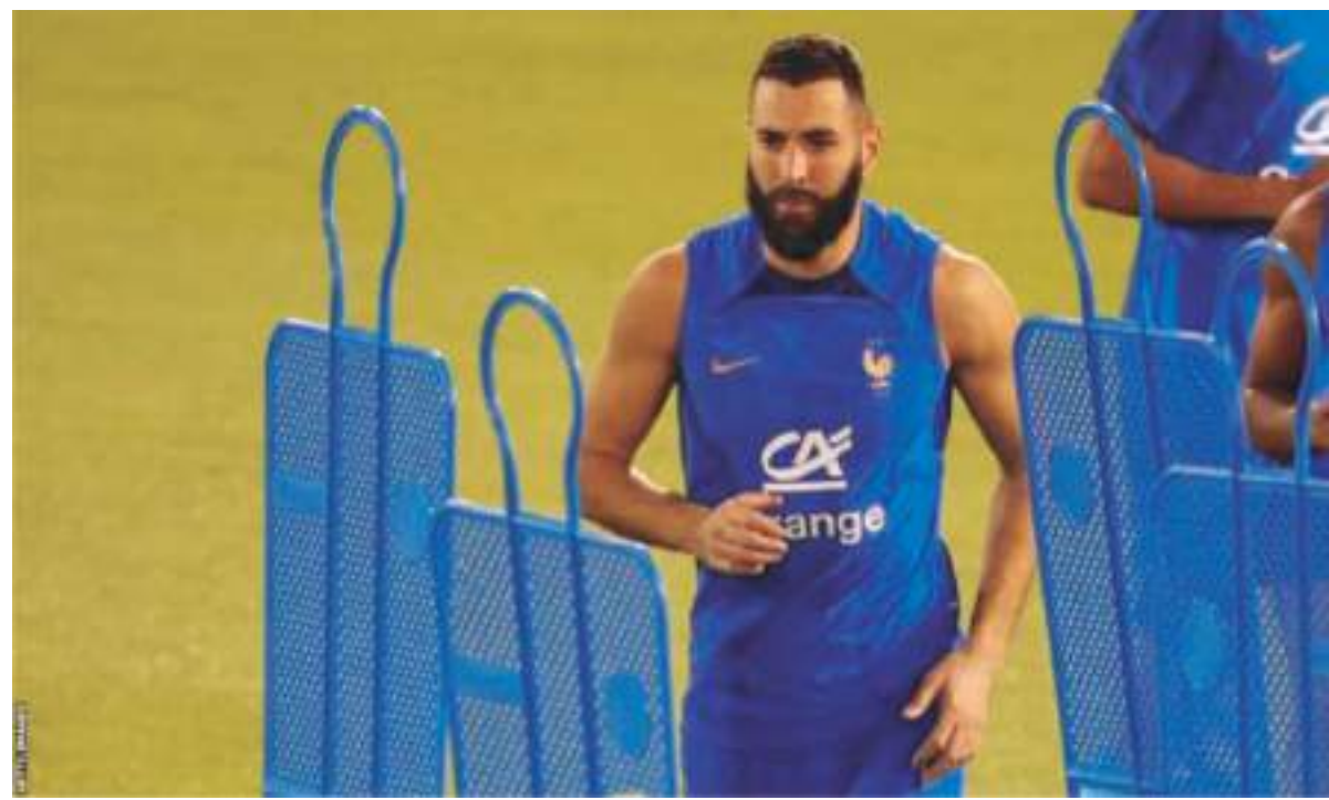
Karim Benzema made his France debut against Austria in 2007

"Then off the field he's a very nice, humble man. We're very pleased for him but also that nice bit of reflective glory is good for our club.