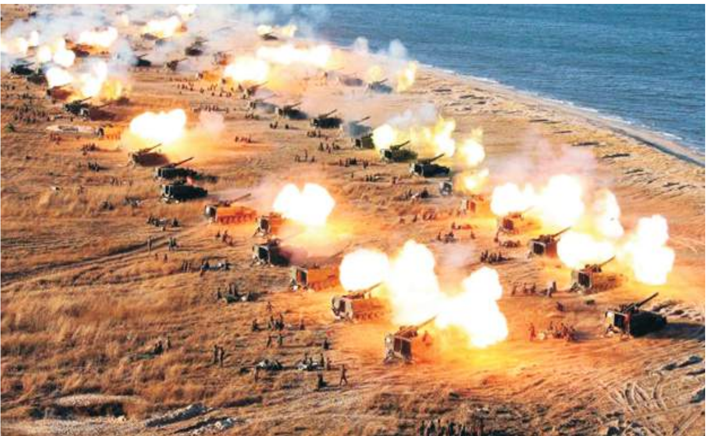
A drill by North Korea's Korean People's Army artillery units