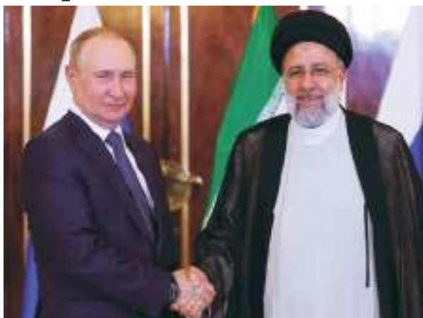
US says Iran now Russia's top military backer

Speaking on Friday, Mr Kirby said that a partnership between Iran and Russia to produce drones would be harmful to Ukraine, Iran's neighbours and the international community.