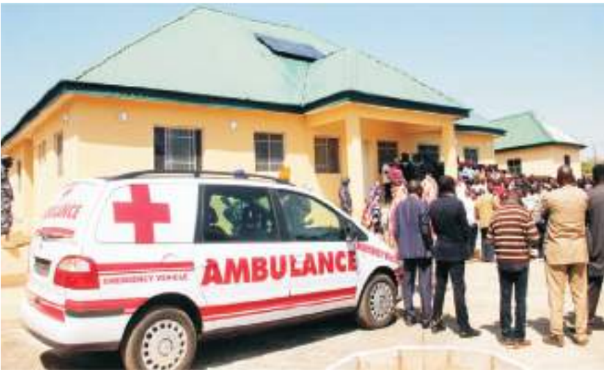
PHC Hambiak and Ambulance commissioned by the Governor