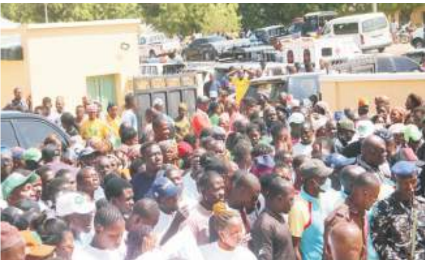
Cross section of members of the community on hand to welcome the Governor