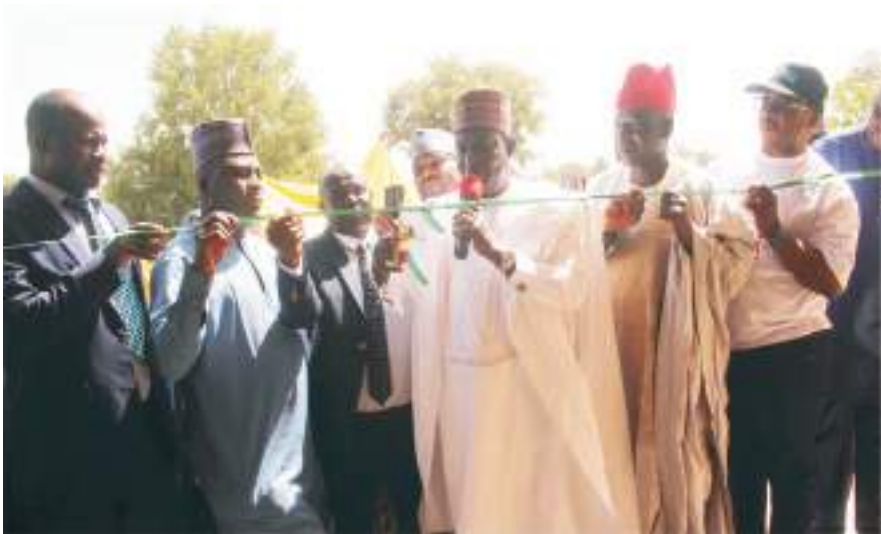
Governor Lalong cutting the tape to officially commission the Clinic, being flanked by other dignitaries

Plateau State Governor, Rt. Hon. Simon Bako Lalong (CON) last week commissioned Primary Healthcare Clinic and issued PLASCHEMA cards to less privileged in Hambiak, Shendam LGA