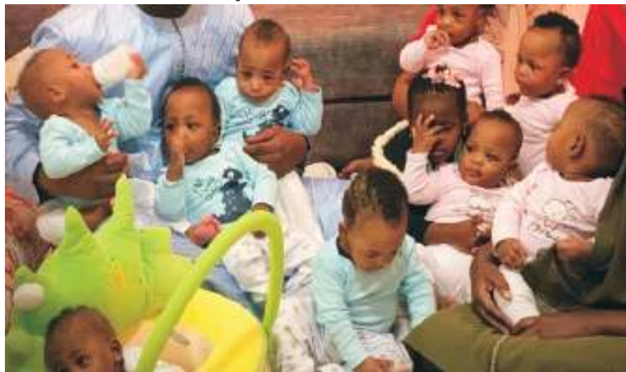
Only two other sets of nonuplets have ever been recorded in history, but none of them survived past a few days

THE world's only nonuplets - nine babies born at the same time - have safely returned home to Mali after spending the first 19 months of their