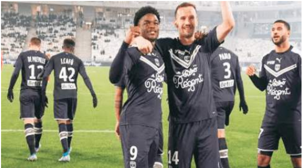
The Nigeria international is experiencing a resurgence in the lower division in France and he could offer a different attacking dimension to the Blues' lineup