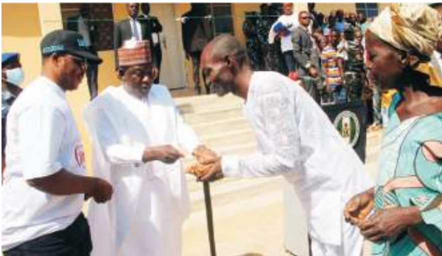
Plateau State Governor, Rt. Hon. Simon Bako Lalong (CON) presenting PLASCHEMA Card to one of the aged persons