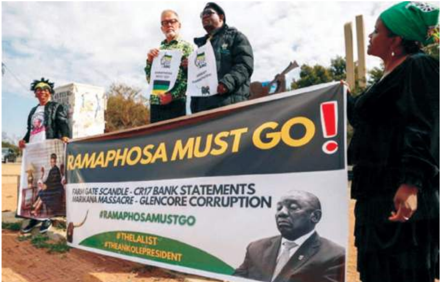
Some ANC members have been calling for Mr Ramaphosa to resign

He made grand promises of a new dawn for South Africa under his leadership and implored citizens to believe that he could turn things around, that the days of corruption