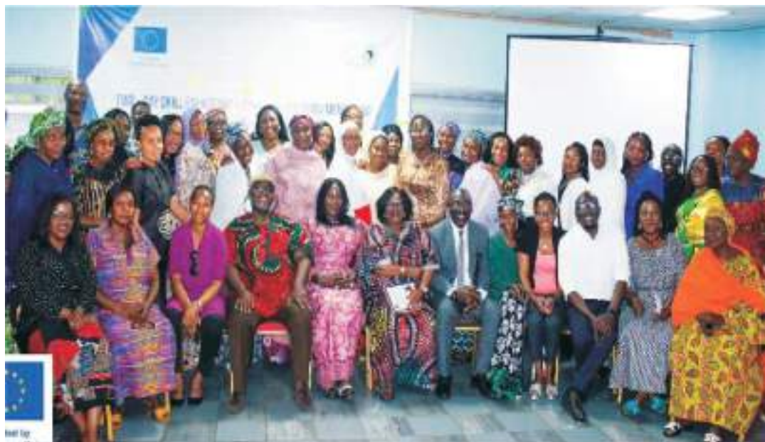
Participants in a group photograph