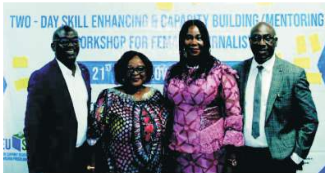
NAWOJ President in company of paper presenters