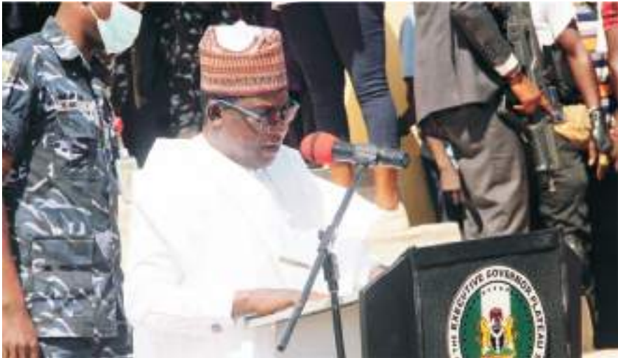
Governor Lalong reading his speech at the Commissioning ceremony

Plateau State Governor, Rt. Hon. Simon Bako Lalong (CON) last week commissioned Primary Healthcare Clinic and issued PLASCHEMA cards to less privileged in Hambiak, Shendam LGA