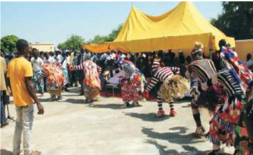
Gamai dancers entertaining guests at the commissioning ceremony