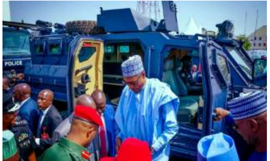
Armoured Personnel carriers (APC) inspected by President Muhammadu Buhari during the commissioning ceremony