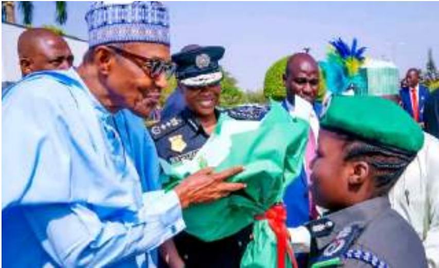
President Buhari (left) being welcomed to the Force Headquarters

Nigeria's President Muhammadu Buhari on Monday Commissioned critical operational assets procured by the Nigeria Police Force at the force Headquarters, Louis Edet House, Abuja