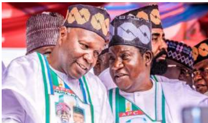
Director General of the Presidential Campaign Council and Plateau State Governor, Rt. Hon. Simon Bako Lalong (CON) discussing with the host Governor, Muhammad Yahaya Inuwa of Gombe State