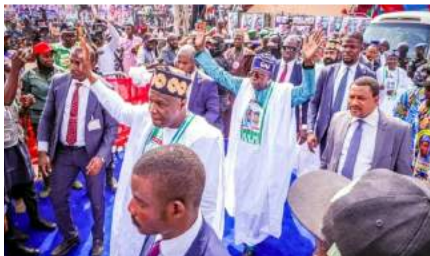
Asiwaju Bola Tinubu, APC Presidential candidate waving to the mammoth crowd during the Gombe rally