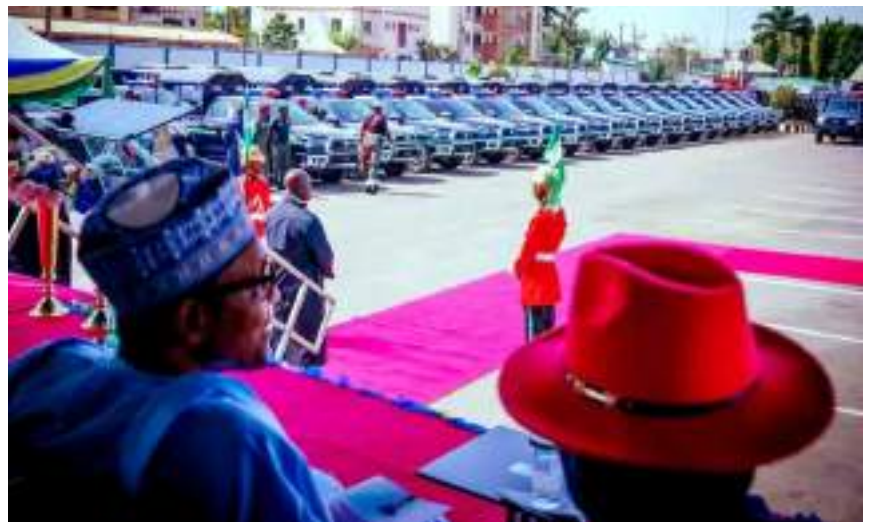
Security vehicles commissioned by President Buhari