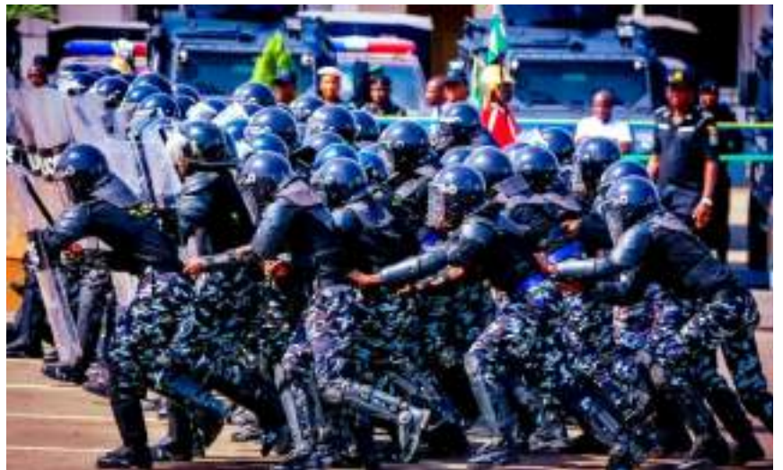
Nigeria Police Force personnel demonstrating at the ceremony