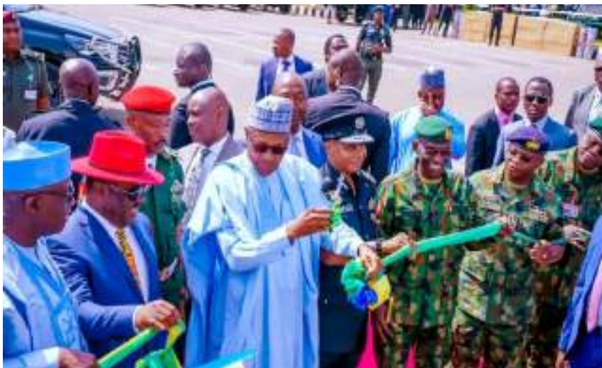
President Buhari (middle) cutting the tape to commission the critical operational assets