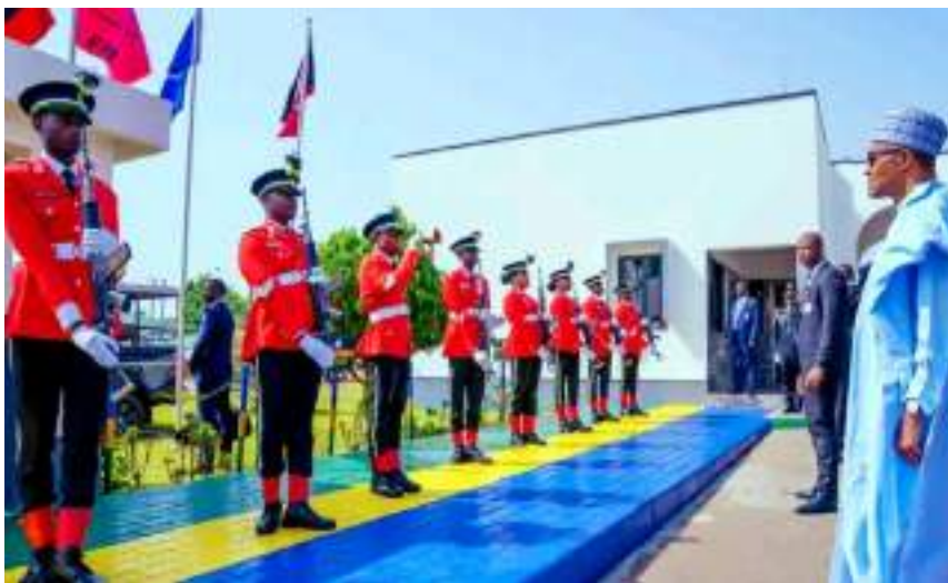
President Muhammadu Buhari (right) taking salute mounted by the Nigeria Police Force