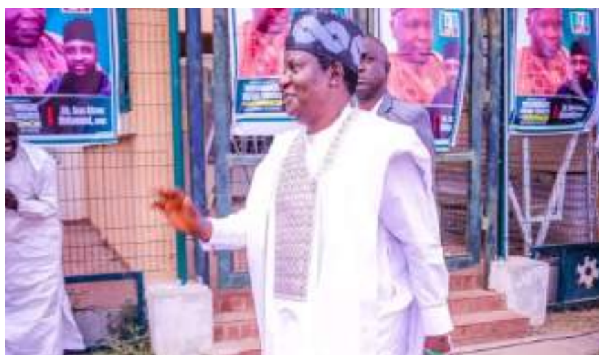
DG. PCC, Rt. Hon. Simon Bako Lalong (CON) advancing to make his speech at the rally