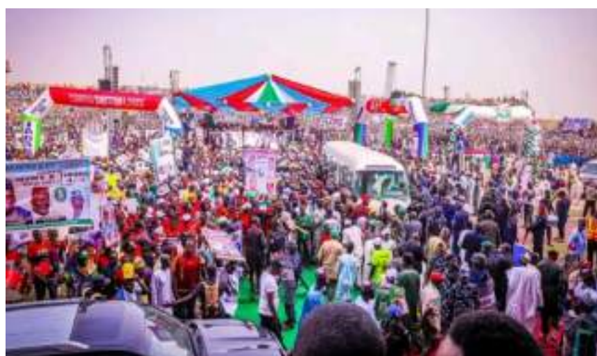
Cross section of APC Supporters in their number at the rally