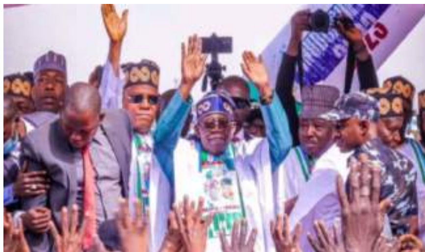
Asiwaju Bola Ahmed Tinubu, Sen. Kashim Shettima and other party stalwarts acknowledging cheers from the mammoth crowd

The All Progressives Congress (APC) Presidential candidate, Asiwaju Bola Ahmed Tinubu, Vice Presidential candidate, Sen. Kashim Shettima, Director General of the Presidential Campaign Council, Rt. Hon. Simon Bako Lalong were in Gombe to flag-off APC's Presidential Campaign