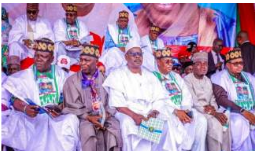
DG PCC, Rt. Hon. Simon Bako Lalong, some senators and Governor Muhammad Yahaya Inuwa of Gombe State