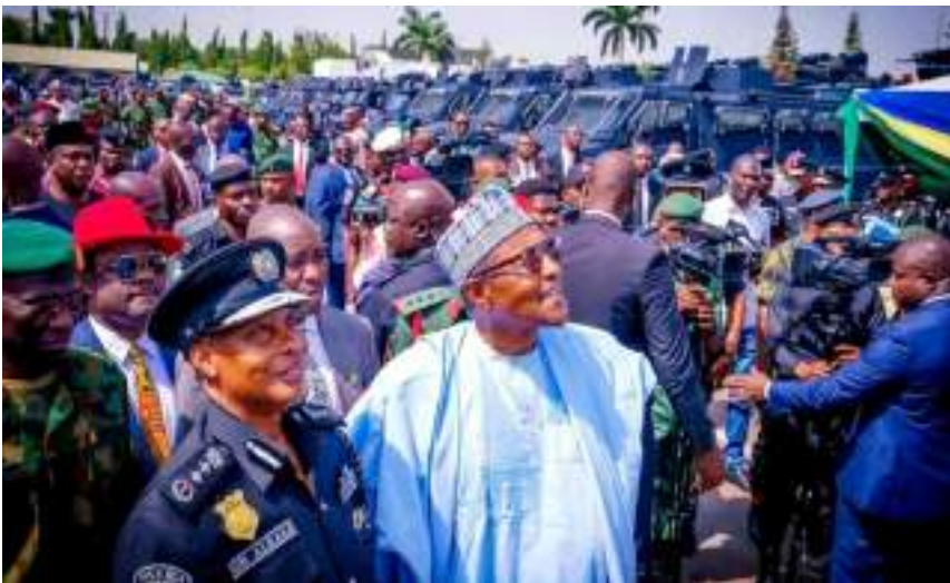
Inspector General of Police, Usman Alkali Baba (left) showing something of interest to the President