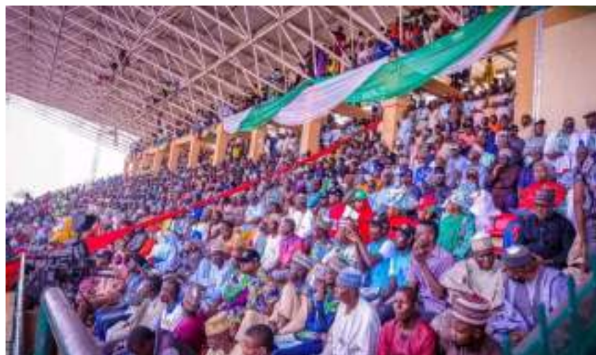
cross section of APC supporters at the presidential rally