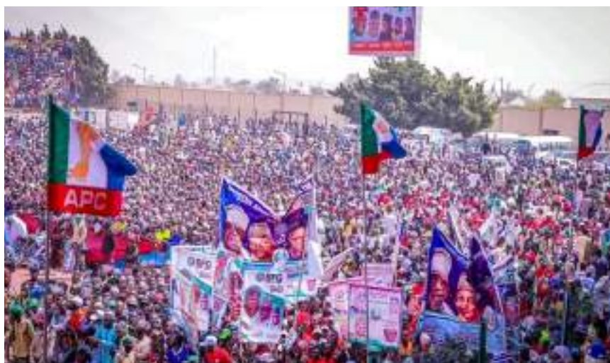
Large gathering of people at the Gombe state Stadium to cheer their Presidential Candidate and other candidates