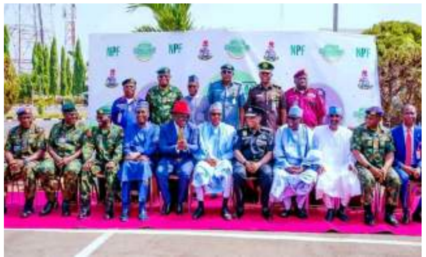
President Muhammadu Buhari in a photograph with IGP, Usman Alkali Baba, Minister of Police Affairs, Muhammadu Maigari Dingyadi and other security Chiefs