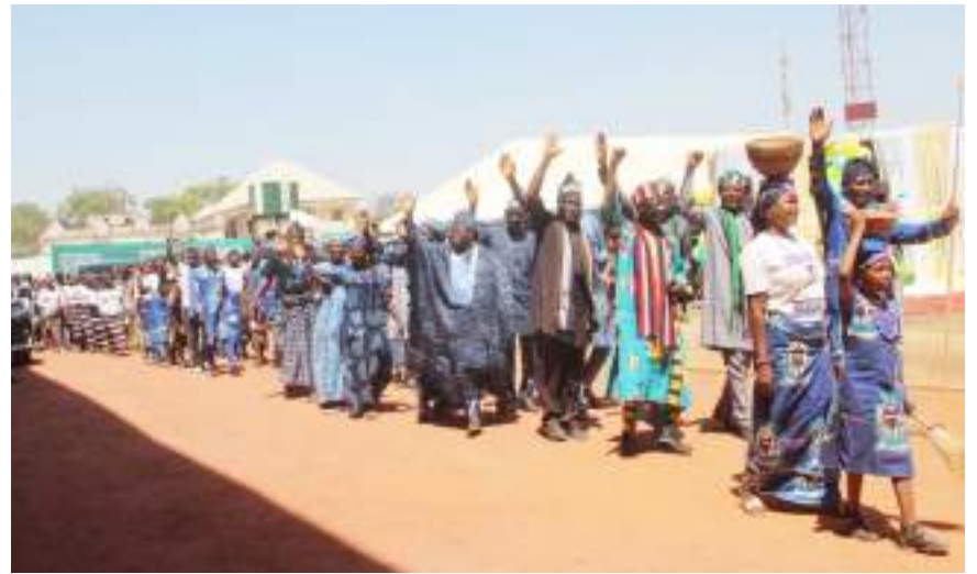
Cross section of PIDAN during the march pass