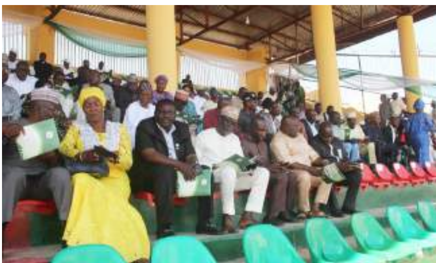
Cross section of Permanent Secretaries at the ceremony