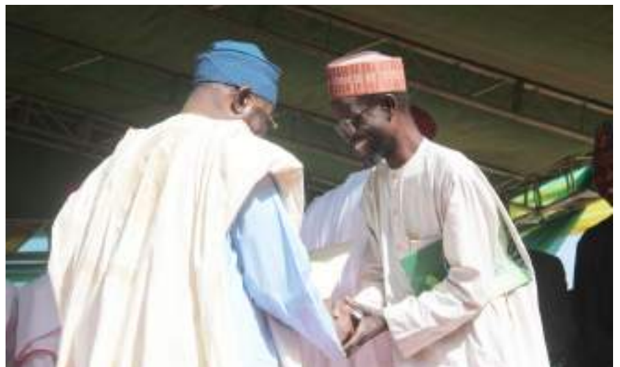
Sir. Fidelis Taggun, former Governor of Plateau State (left) handing over Faith Based Schools to original owners (Islamiya Schools)