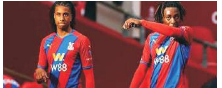
Nigeria boast so many talented youngsters with dual nationalities in Europe and a couple of them could end up playing for the Super Eagles

Former Chelsea winger Victor Moses was a key member of the Super Eagles squad that lifted Nigeria's most recent Afcon Cup in 2013