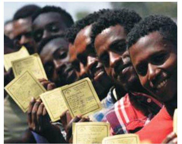
This picture is a result of previous referendum in 2019