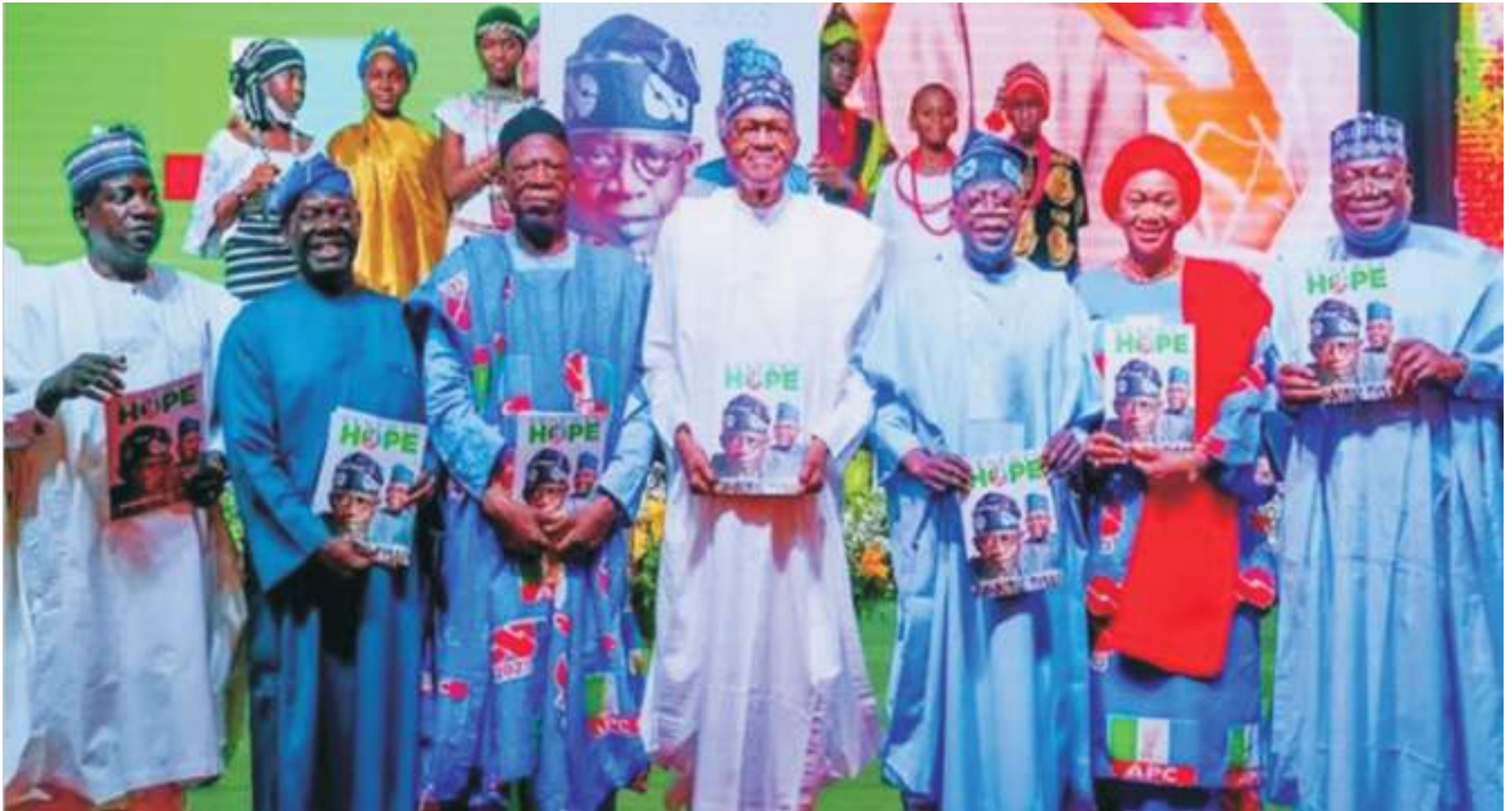
President Buhari with Tinubu, APC presidential candidate and others at a campaign rally recently

A few weeks to the 2023 general election there is growing fear among observers that current internal wrangling in the ruling All Progressives Congress (APC) could tear the party apart and affect its chances in the polls, writes TEMI BAMGBOSE.