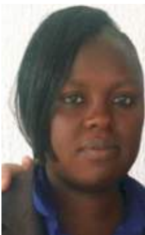
By Yvonne Ishola

It is very important for the political class to know that the survival of our democracy depends on how the country is govern by them. It is very important also that the public should use the window of whistle blowing opportunity that the government is encouraging to expose those acquiring properties that are beyond their means without any explanation. The fight against corruption is not a one man fight but a fight that each and every one of us must have a hand in killing this monster that is eating every fabric of our society in terms of development and integrity as a nation.