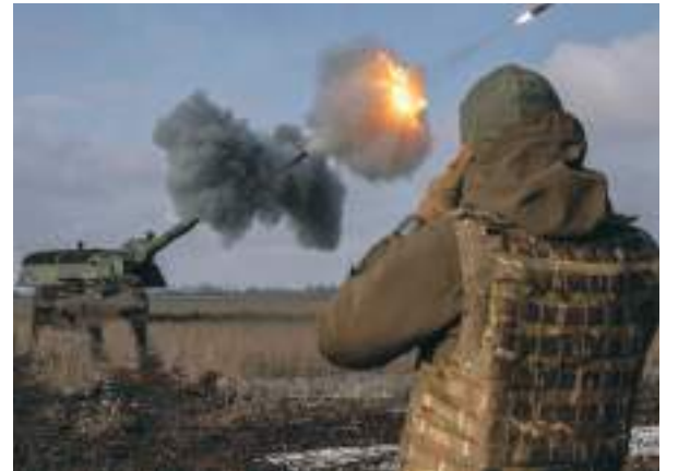
Ukraine's defence minister says training on new Western weapons will start as early as Monday