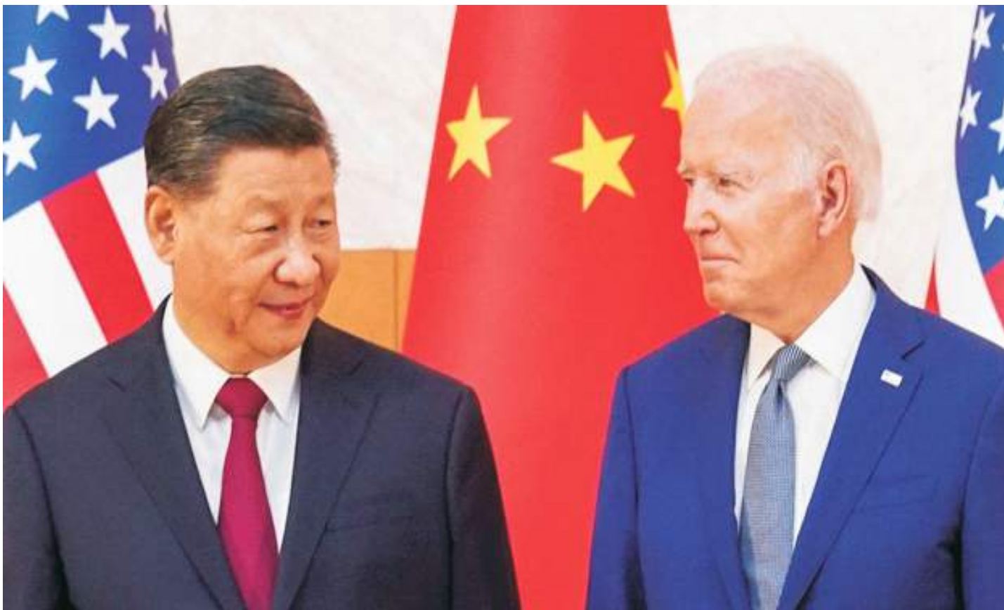
Presidents Xi Jinping and Joe Biden smiled for the cameras in an occasion recently.

not expected from Mr Blinken's meetings in Beijing. The meetings themselves were to be the breakthrough.