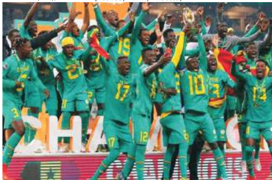
Senegal are the first country to hold both Afcon and CHAN titles at the same time

transportation – it was the best," he said at a press briefing.