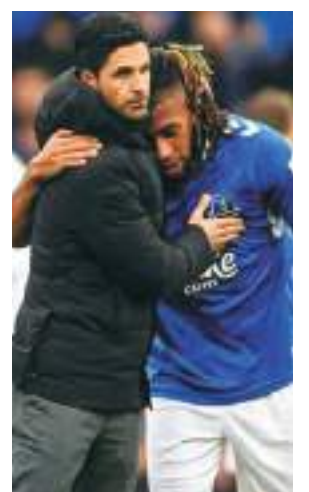
Iwobi hugs Arteta after the game

After Everton's inspiring victory, Iwobi posted on social media, "Nice To See Some Old Faces, Even Better To Win!"