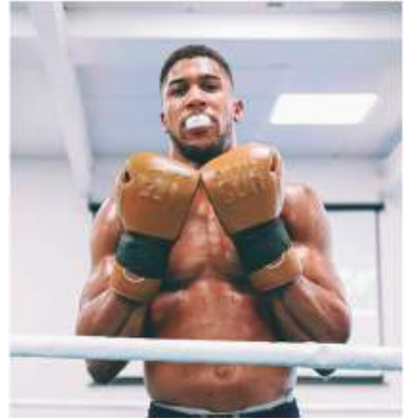
Anthony Joshua Returns To Ring To Face Franklin In April