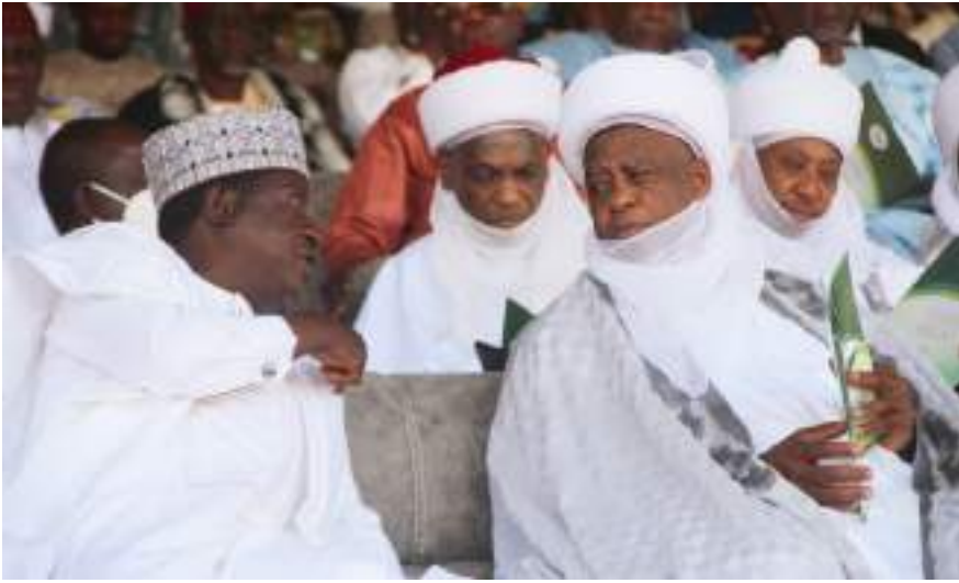
Governor Lalong (left) putting heads together with His Eminence Sultan of Sokoto, Alhaji, Dr. Muhammad Sa'ad Abubakar

The celebration of Plateau State at 47 and the annual Forgiveness Day 2023 took place yesterday at the Rwang Pam Township Stadium, Jos