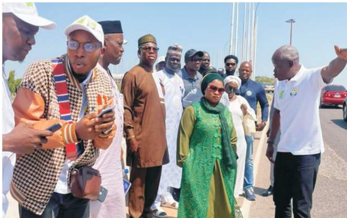
The Abuja International Marathon is the only full marathon authorised by the Federal Capital Territory Authority

In November, Irving was suspended for eight games and had to apologise after posting a social media link to a film with anti-Semitic material.