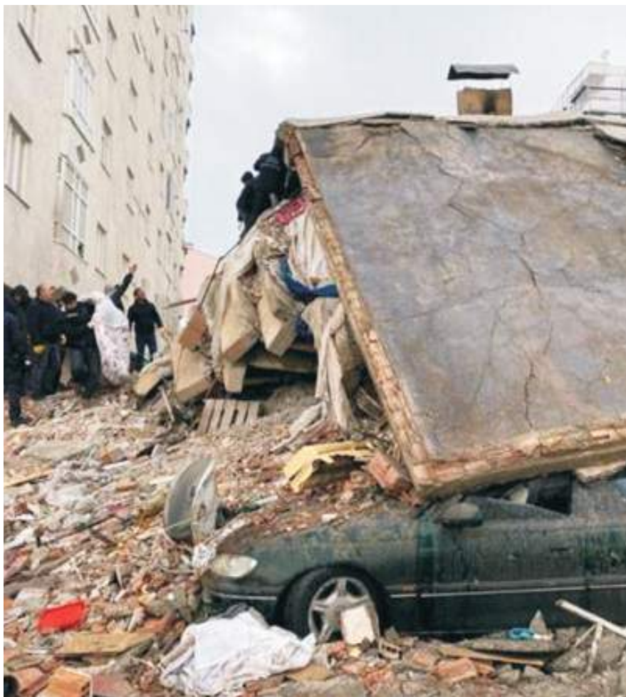
People search through rubble in Diyarbakir, Turkey

The new region is to be called Southern Ethiopia region, if it gets a yes vote.