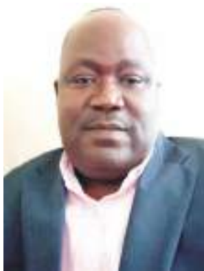
By CELESTINE ATTSAR