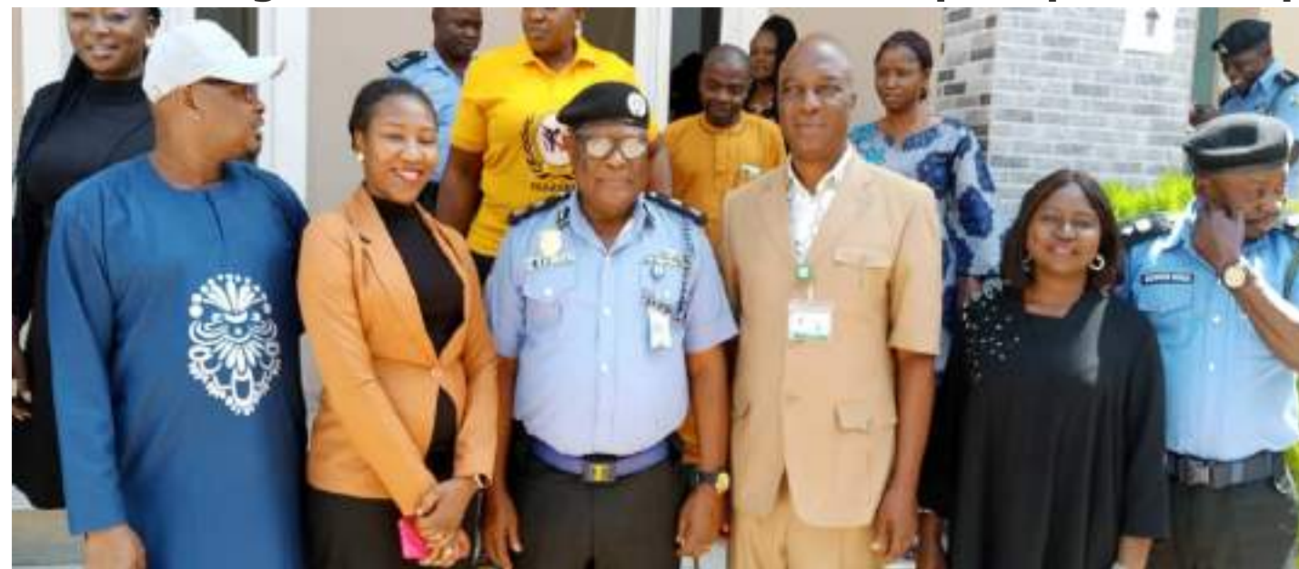
Commissioner of Police in a group photograph with organizers and resource persons