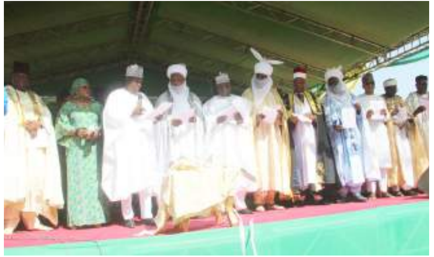
Governor Lalong with other invited dignitaries displaying the Gazette on the creation of Districts and Chiefdoms