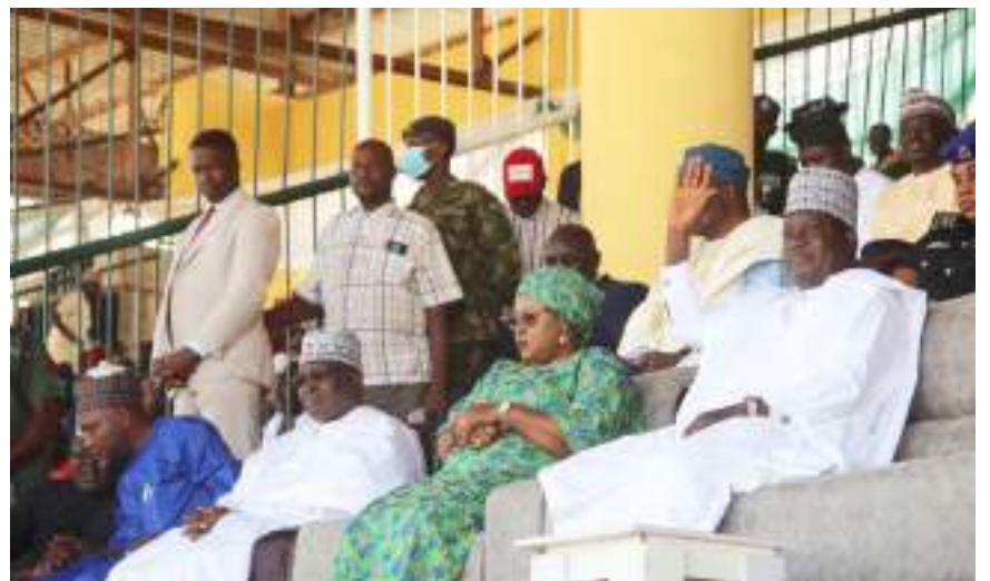
Governor Lalong acknowledging cheers from PIDAN