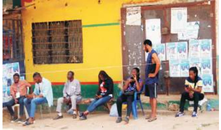
Agents of different political party waiting for voters to come and cast their ballot