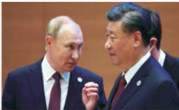
Putin and China Xi discussing

CHINA'S President Xi Jinping will travel to Moscow next week to hold talks with Russian President Vladimir Putin, officials say.