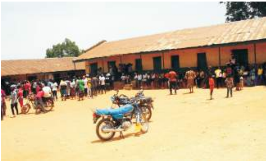
Large turn out of voters at the Sot-Gyel Polling Unit of Jos South LGA