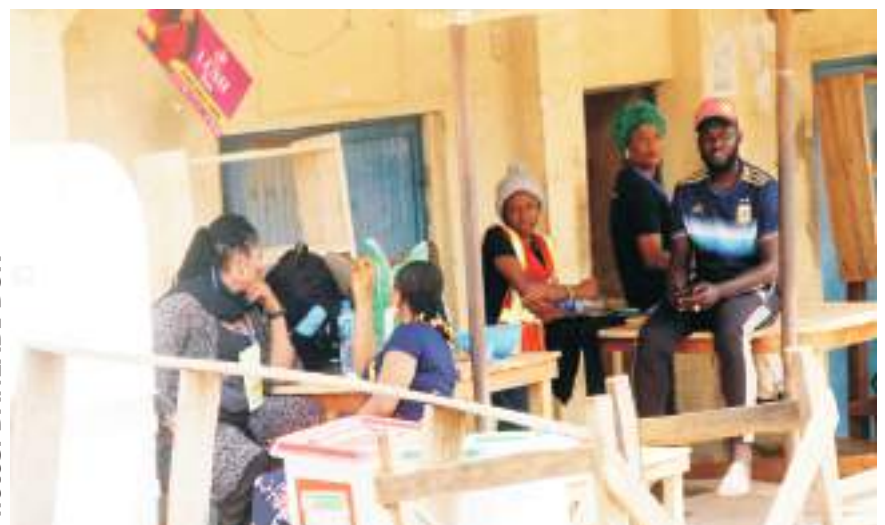
INEC staff and security waiting for eligible voters at Chorbe Polling Unit of Jos North LGA