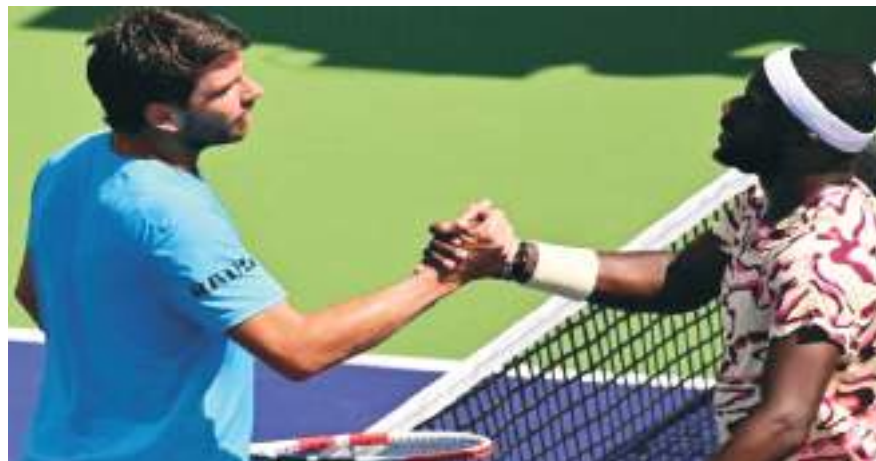
Norrie won the Rio Open two weeks ago and was on an eight-match winning run

The defeat ends the British singles interest in Indian Wells, one of the most high-profile tournaments outside of the Grand Slams, after Jack Draper and Emma Raducanu were beaten on Tuesday.