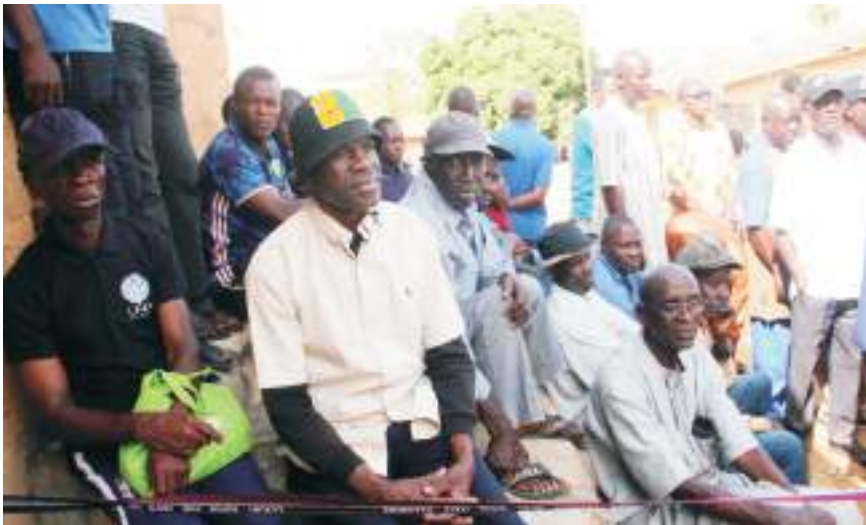
Cross section of elderly people waiting at the Arin Izang Ward, Jos North LGA