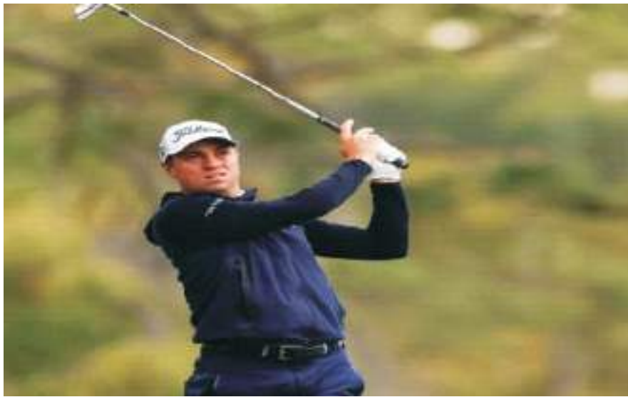
Two-time major winner Justin Thomas is the current world number 10

US PGA champion Justin Thomas has heavily criticised plans by the R&A and United States Golf Association to restrict how far golf balls fly at future elite tournaments.