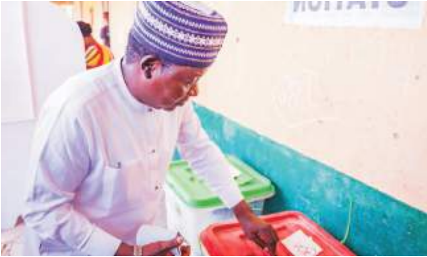
Plateau State Governor, Rt. Hon. Simon Bako Lalong (CON) voting at his Nyak P. U. Shendam LGA

The Governorship and State House of Assembly, conducted by INEC in 28 states of the federation took place yesterday in Plateau State as captured by The Nigeria Standard photographer