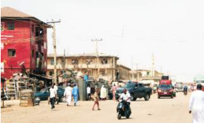
Convoy of Security personnel monitoring the exercise within Jos North LGA

The Governorship and State House of Assembly, conducted by INEC in 28 states of the federation took place yesterday in Plateau State as captured by The Nigeria Standard photographer