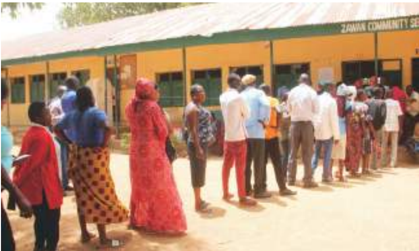
Eligible voters queuing up to exercise their franchise at the Zawan polling Unit of Jos South LGA