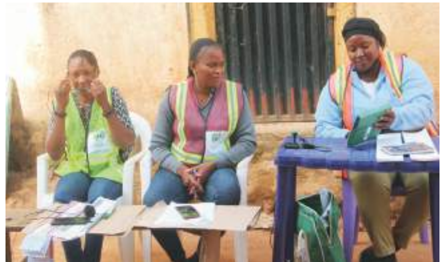
Cross section of INEC Officials waiting patiently for eligible voters