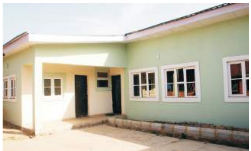
Site of the remodeled NUJ Secretariat inspected by Governor Lalong