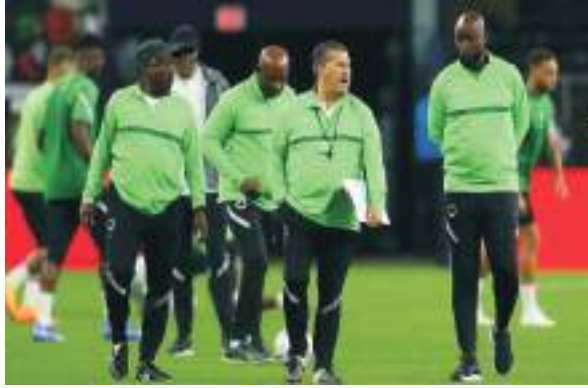
Flying Eagles of Nigeria

Finidi, who was appointed Enyimba's manager in September 2021, had