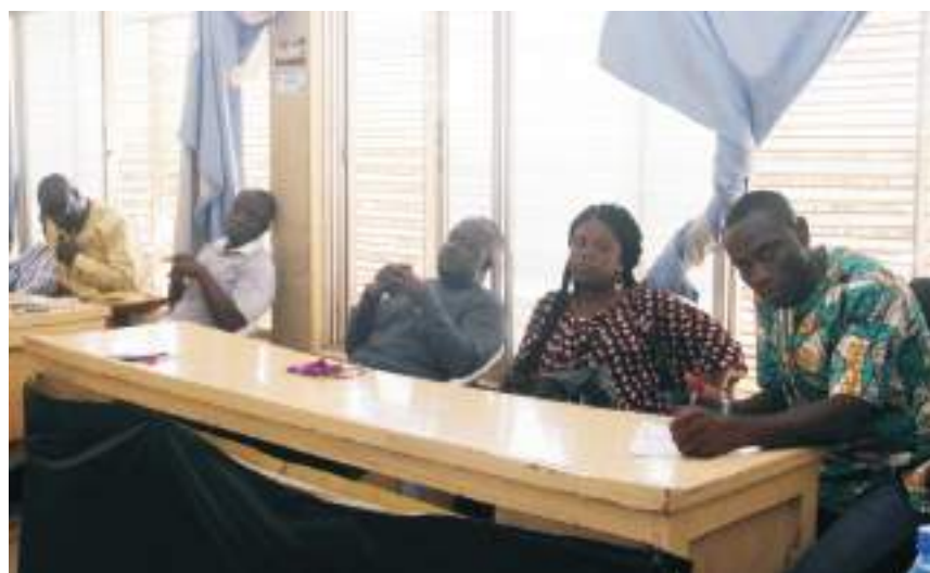
Cross section of Editorial Department Staff listening to the Acting General Manager