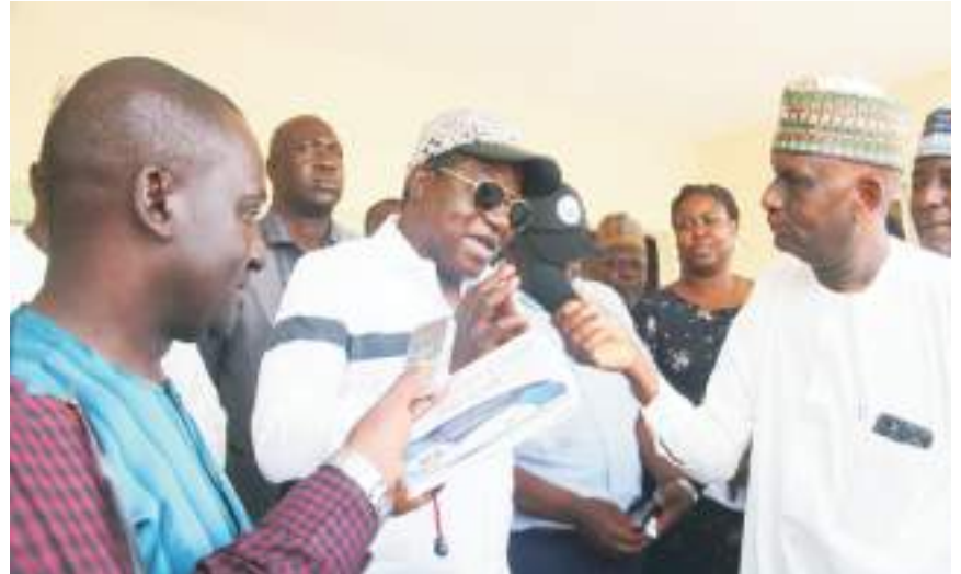
Governor Lalong (2nd left) answering questions from newsmen after the visit