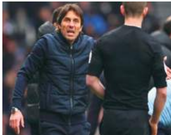
Antonio Conte has won 41 of his 76 games in all competitions as Tottenham manager

Guinea was set to be the original host of the 2025 tournament, but CAF stripped it of hosting rights after affirming its inadequacy of hosting preparations.