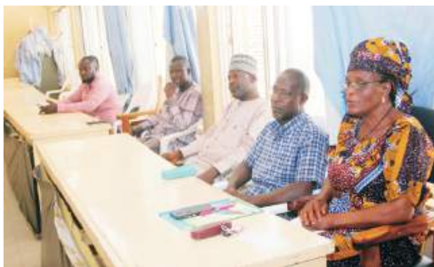
Cross section of Marketing Department staff during meeting