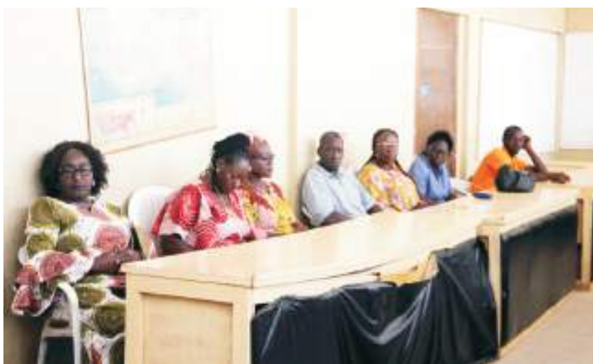
Cross section of Editorial staff listening to the Acting General Manager's address