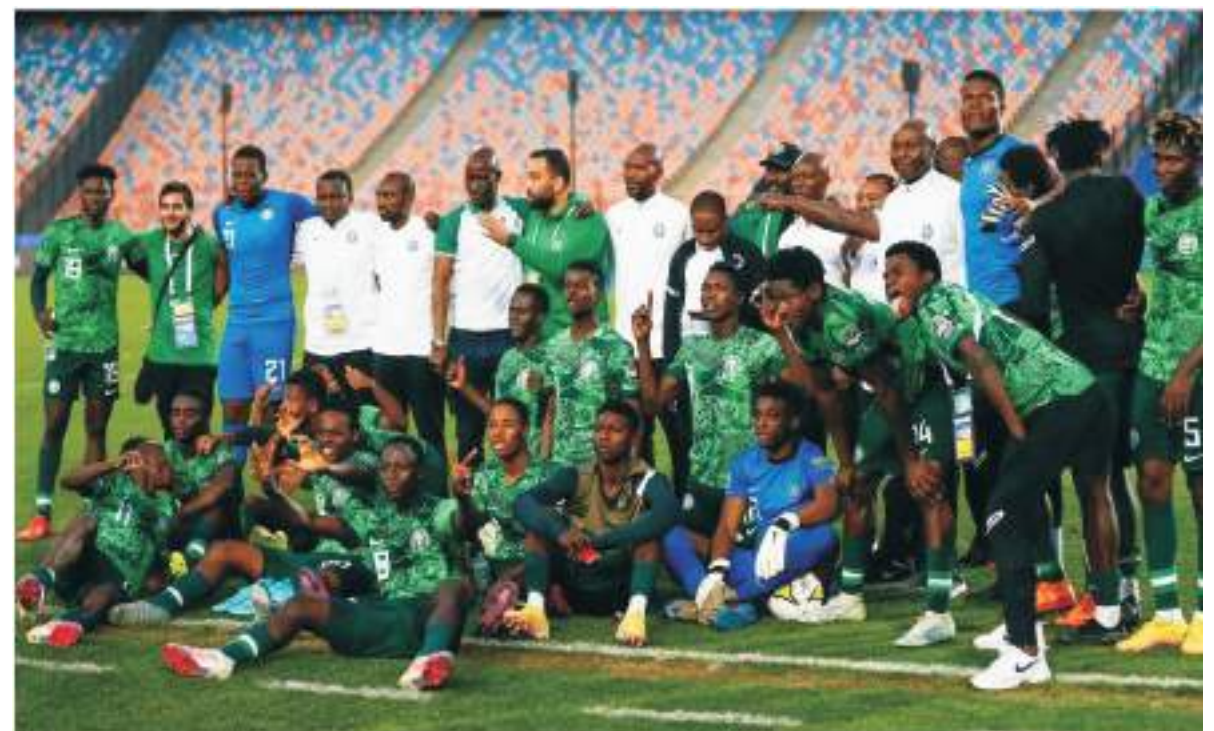
Nigeria's U-20 squad

The overall winners will qualify for the CAF U23 African Nations Cup.