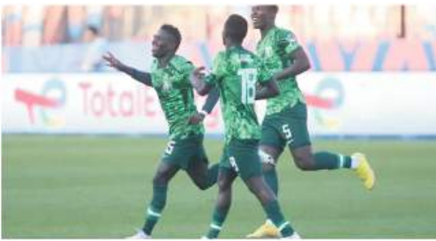
Nigeria's Flying Eagles won fair play award recently at the u-20 AFCON