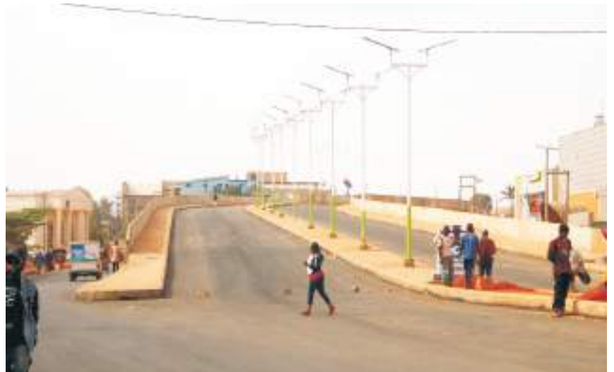
Closer shot of the flyover