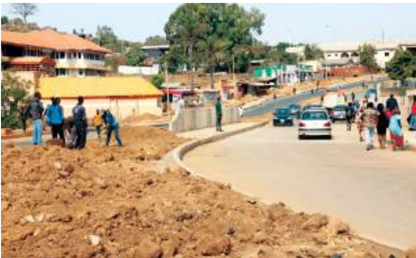
Second constructed bridge after the British American flyover