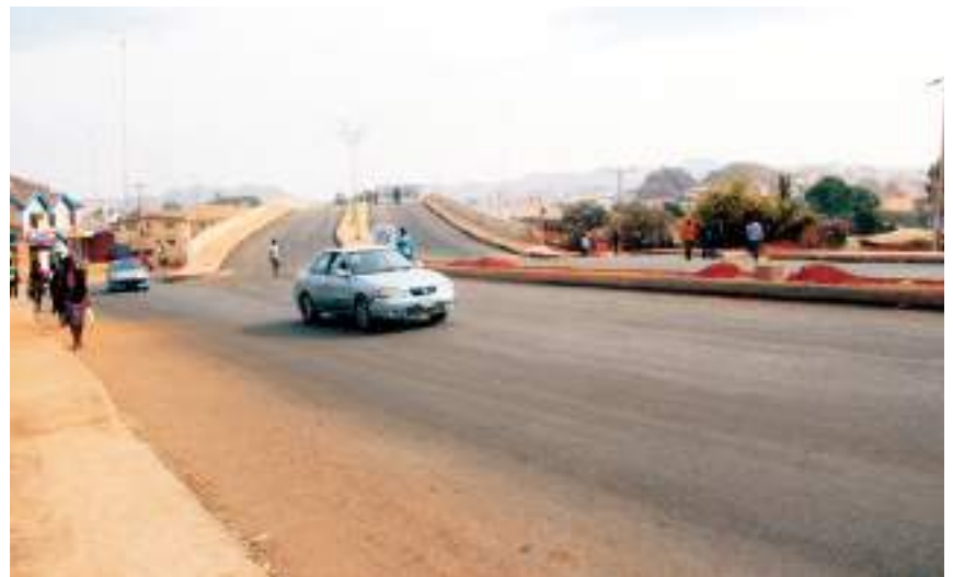
View of the flyover from Terminus