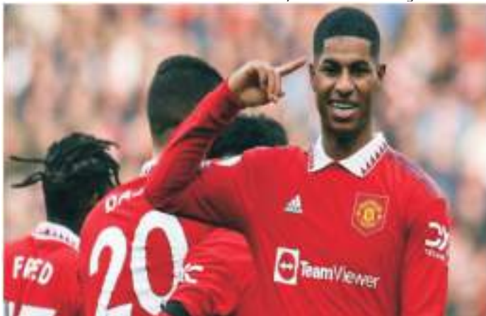
Rashford has scored 17 goals in 21 games in all competitions

Odegaard reminds me of my old City team-mate David Silva in the way he wants to get into pockets of space, get on the ball and dictate play. He does it all so effortlessly too, and I love watching him play.