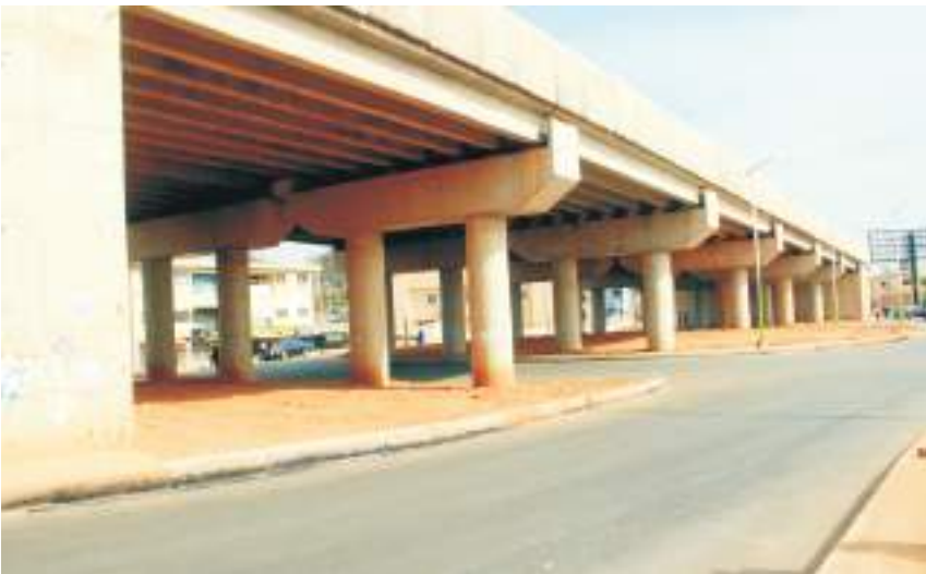
Another view of the Flyover