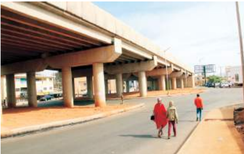
Photo shows the lane from Dogon Karfe to Terminus completed