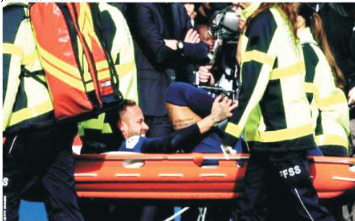
Neymar went over badly on his right ankle five minutes into the second half

Their final league match of the season is against Clermont on 3 June with the Champions League final scheduled to take place on 10 June.