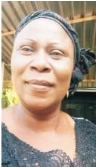
By JENNIFER YARIMA

needs of women and girls. According to the United Nations, women make up only 22 percent of artificial intelligence workers globally.