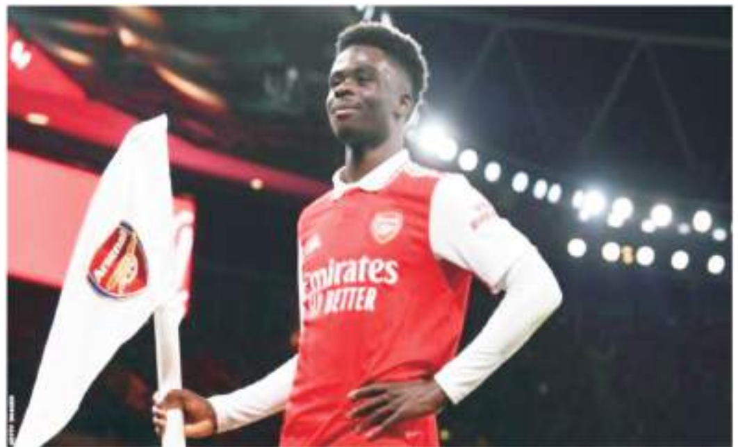
Saka has been with Arsenal since he was seven and is reportedly close to signing a new contract with the Gunners.

Nunez was young and promising, and is showing us now what a great player he can become. Haaland already is one - he is a guaranteed