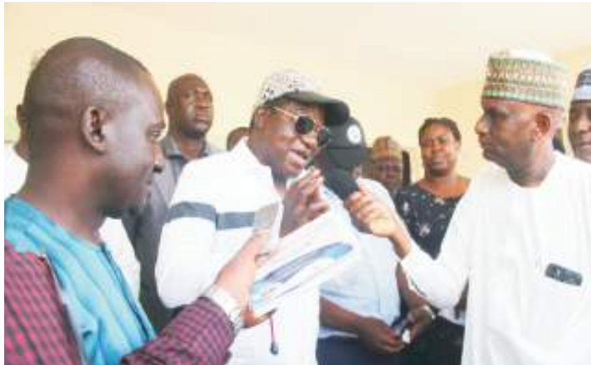
Governor Lalong (2nd left) answering questions from newsmen after the visit