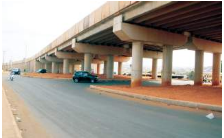
Shot under the flyover