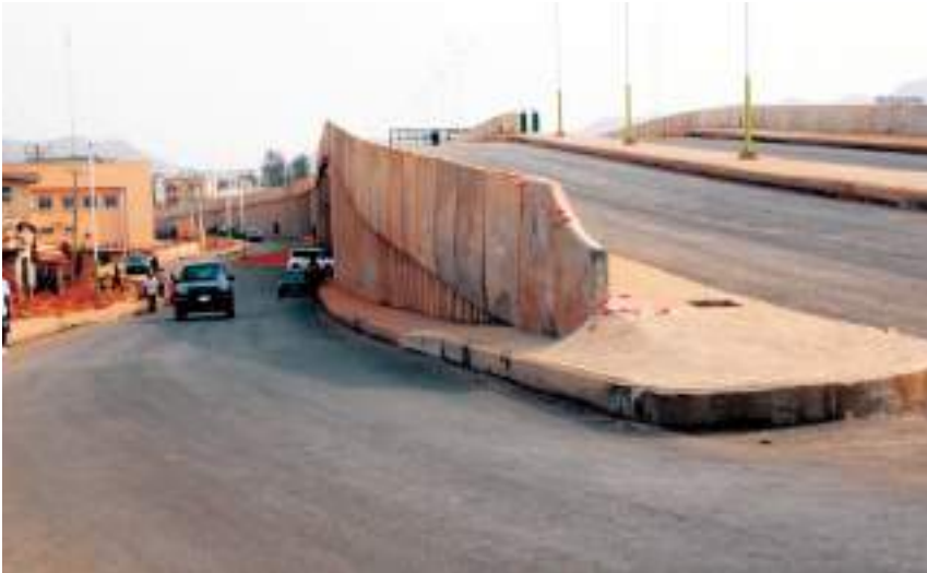
Closeup view of the Flyover from Dogon Karfe approach

The British American road interchange and dualization project progress report as captured recently by The Nigeria Standard photographer