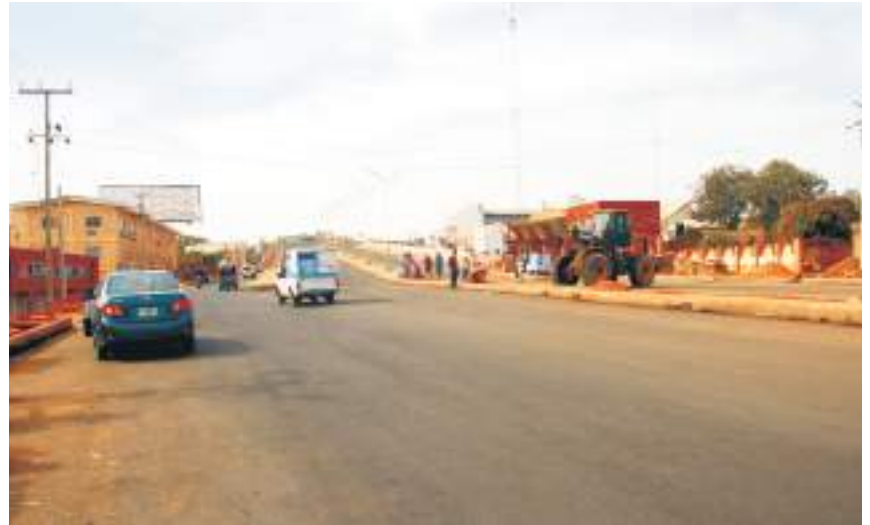
Long shot of the Flyover captured by our lenses