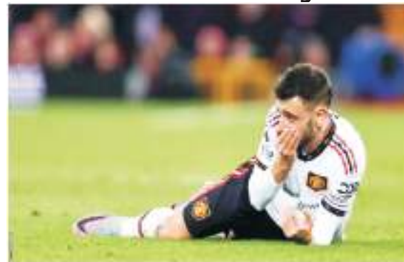
Bruno Fernandes has scored seven goals and provided 11 assists in 40 games

At one point, when Ten Hag, who described his side's performance against Liverpool as "unprofessional", dropped the in-form Marcus Rashford earlier this season after the striker missed a team meeting, while Cristiano Ronaldo's contract was terminated by mutual consent in November.