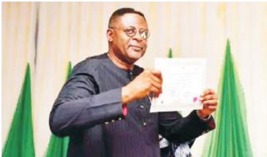
Cross River State Governor-elect, Prince Sen. Bassey Otu displaying his certificate after receiving it at the INEC Headquarters, Calabar