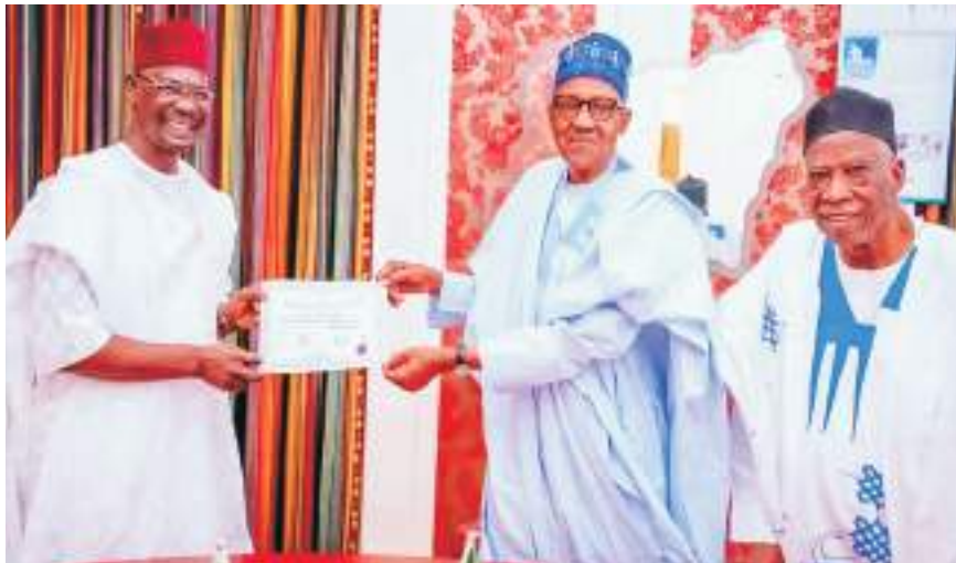
Governor Abdullahi Sule of Nasarawa State when he visited President Buhari at the Presidential Villa, Abuja presenting his certificate, flanked by the APC National Chairman, Sen. Abdullahi Adamu