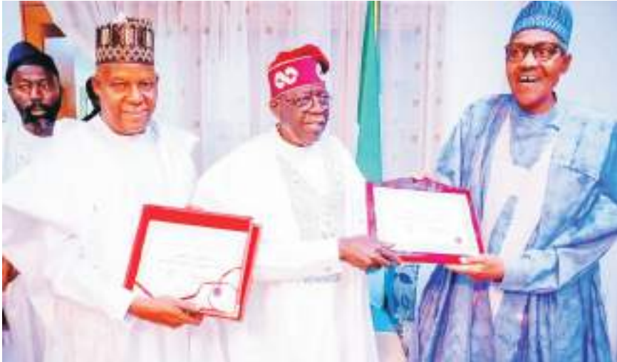
Nigeria's President-elect, Asiwaju Bola Ahmed Tinubu and his Vice, Sen. Kashim Shettima showing their certificate of return to President Muhammadu Buhari in Daura, Katsina State

The Independent National Electoral Commission, INEC recently presented certificate of return to the President, Vice, Members of the National Assembly, State Governors and members of the State Houses of Assembly that were elected during the 2023 General Election. Photographs below as monitored by The Nigeria Standard Newspapers. Photo-Editor