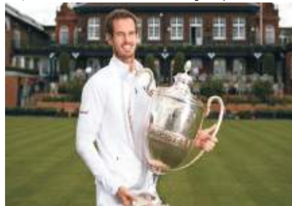
Andy Murray is a five-time champion at Queen's Club

"Obviously I have a lot of special memories there so I'm really looking forward to returning this year."