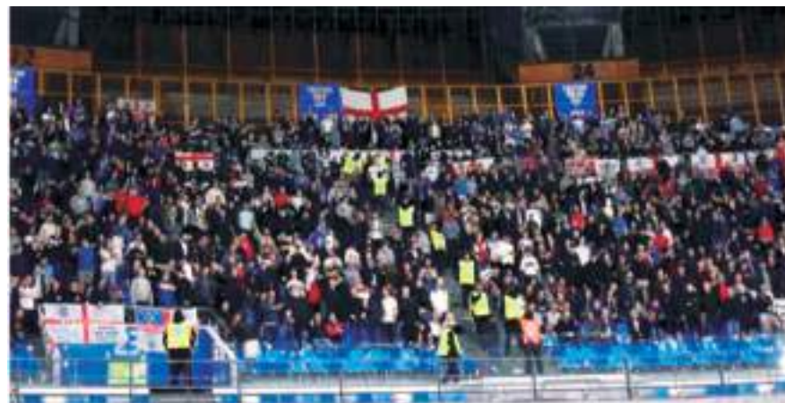
England fans inside Napoli's Diego Armando Maradona Stadium

"We are sorry that what should have been a wonderful occasion watching our first win in Italy since 1961 was not, for many of you."