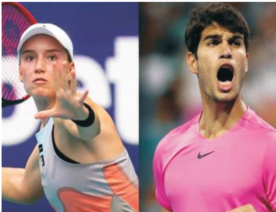
Elena Rybakina and Carlos Alcaraz both won the Indian Wells singles titles two weeks ago