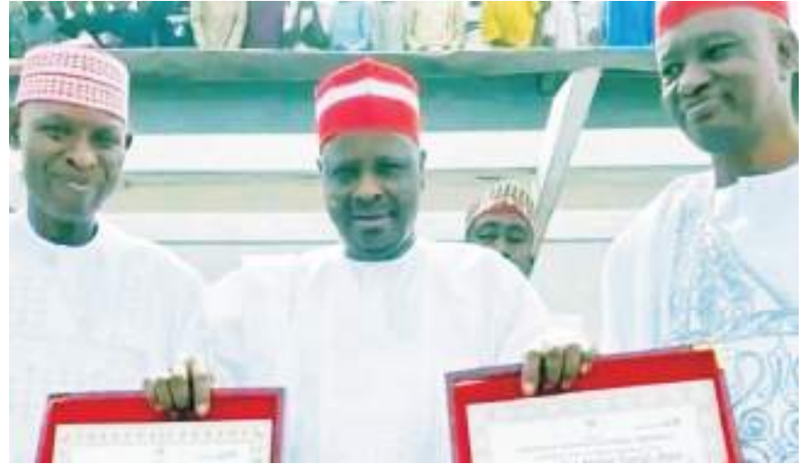
Engr. Abba Kabir Yusuf (left) Sen. Rabiu Kwankwaso (middle) and his deputy after receiving their certificate of return in Kano State