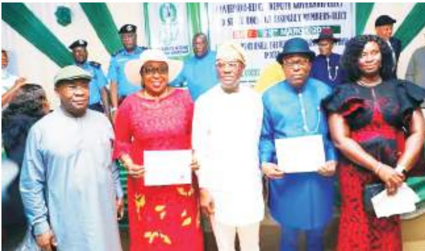
Sir Siminalayi Fubara, Governor-elect of River State (2nd right) his wife, Governor Wike in a group photograph after receiving the certificate