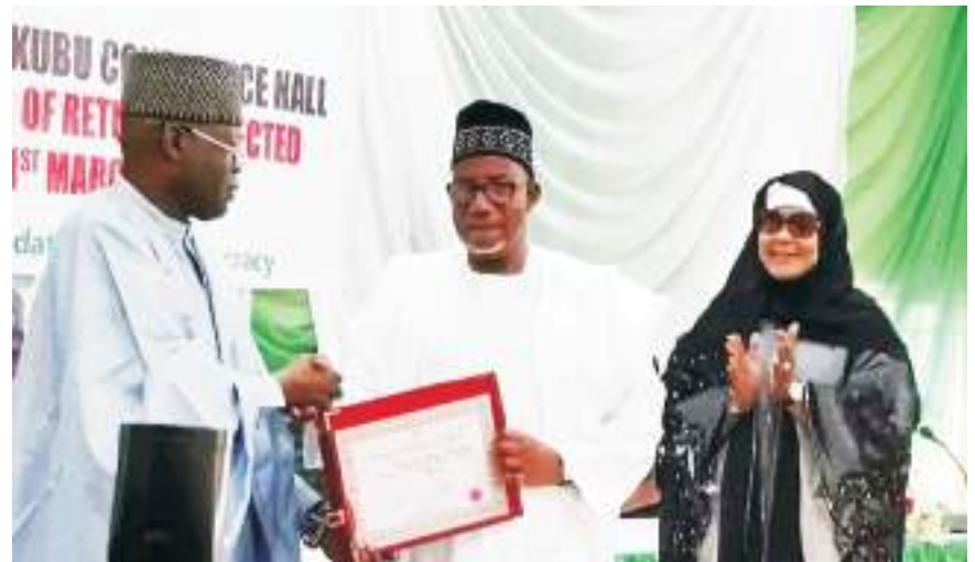
Bauchi State Governor-elect, Bala Abdulkadir Mohammed (middle) after receiving the certificate of return in Bauchi