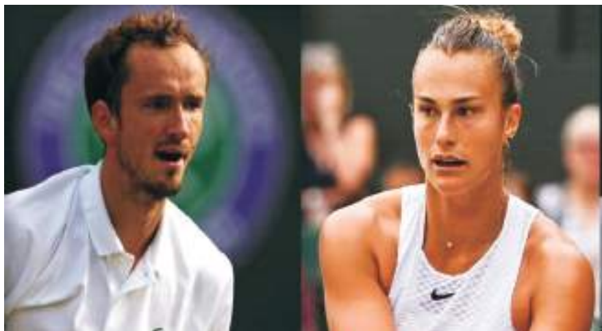
Russian men's world number six Daniil Medvedev (left) and Belarusian women's world number two Aryna Sabalenka will now feature at Wimbledon