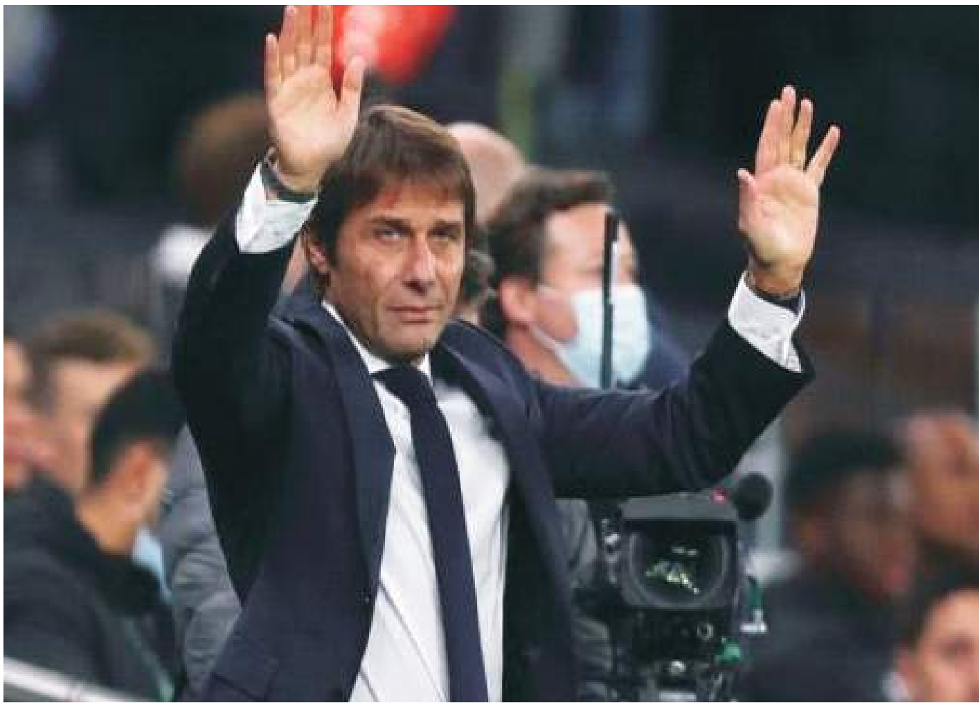
Antonio Conte arrived at Tottenham in November 2021, following the sacking of Nuno Espirito Santo

That undefeated streak comes to an abrupt end with another loss to Chelsea the following week that sparks a three-game losing run in the league - the