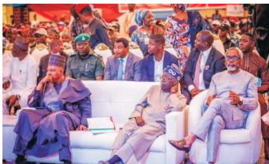
APC Presidential and Vice with the Speaker, House of Reps, Rt. Hon. Femi Gbajabiamila listening with rapt attention to remarks by the DG, PCC