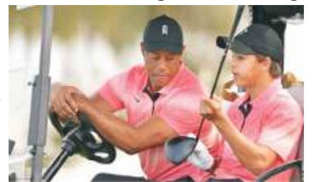
Woods, who played alongside son Charlie, used a cart to help him get around the course at the PNC Championship

broken leg. This year nothing was broken, but it was good that all the pieces are there again all lined up," he said. "Plantar fasciitis is no fun and now I get to truly recover and heal and progress forward on this. "There are so many good things that I've been able to do physically - be able to hit the golf ball and practice and do everything in a standstill. "But I haven't been able to get from point A to point B and we're obviously going