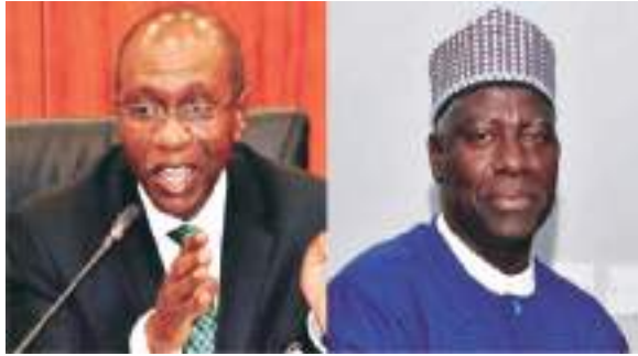
Emefiele Continued from page 1

of the Federation and that of the Secretary to the Government of the Federation fail to take prompt actions on the petition.