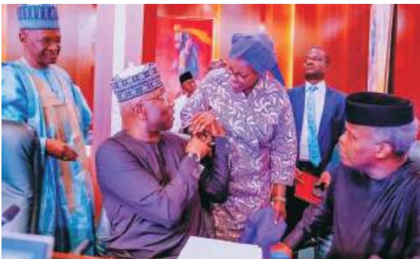
Vice President, Prof. Yemi Osinbajo (right) Minister for Women Affairs and Social Development, Dame Pauline Tallen with the Secretary to the Government of Federation, Mr. Boss Mustapha