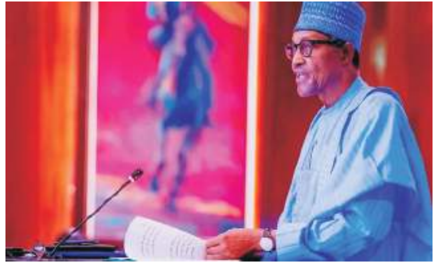
President Buhari addressing the FEC