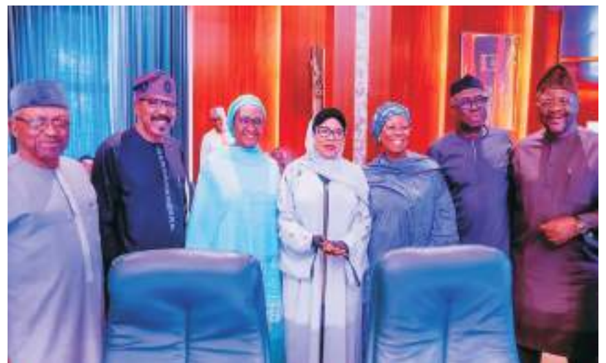
Members of the Federal Executive Council in a photograph