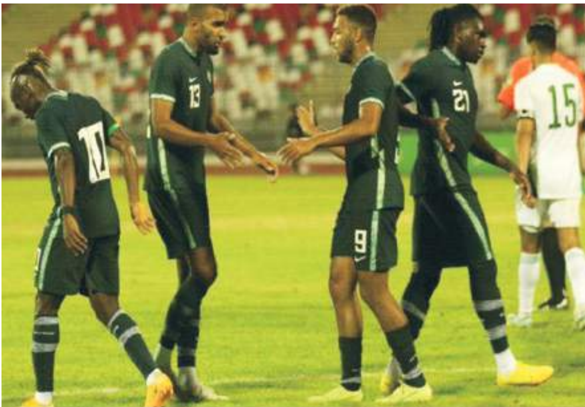
The Super Eagles striker made his debut for Nigeria last September but he has not made the team again since then