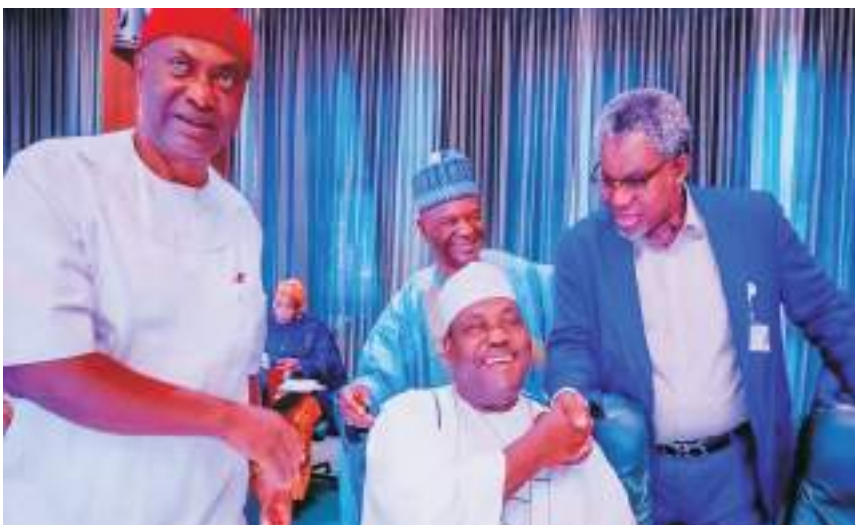
Some ministers at the FEC meeting