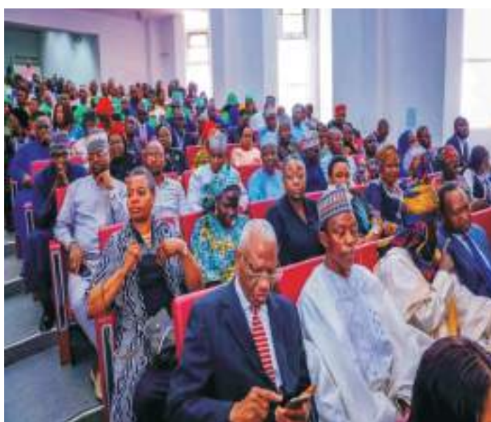
Former chief Judge of the State (2nd right) with other retired Justices at the ceremony

means to resolve issues. This will not augur well for the well-being of the society". He told the new appointees that they were coming on board at a time when the nation is in a process of transition from one administration to another both at the State and Federal levels. This he said gives them the opportunity to help build democracy and rule of law in Plateau State and Nigeria at large.