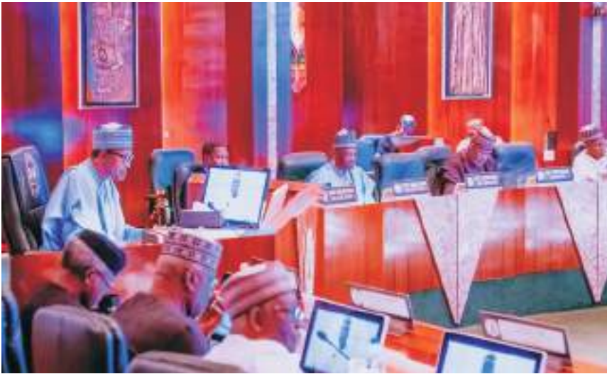
President Muhammadu Buhari presiding over the FEC meeting

Nigeria's President Muhammadu Buhari presided over the Federal Executive Council Meeting held on the 5th April 2023 at the State House Abuja