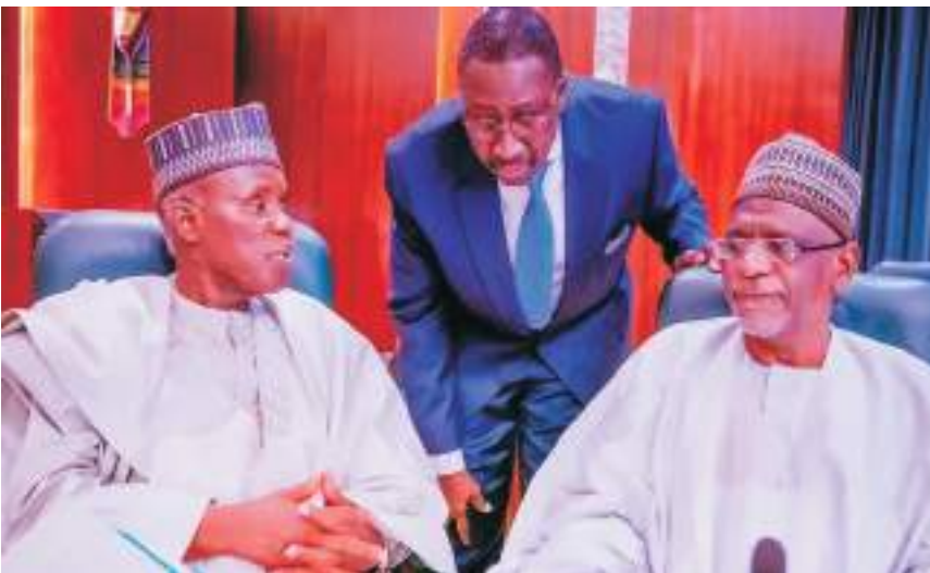
From left are, Minister of Defence, Maj. Gen. Bashir Salihi Magashi, National Security Adviser, Maj. Gen. Babagana Mohammed Monguno and the Minister of Education, Mallam Adamu Adamu during the meeting