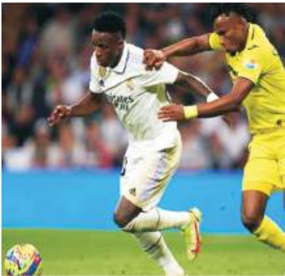
Chukwueze played the game of his life against Real Madrid and he was very close to breaking the legendary Lionel Messi's record at the Bernabeu

Hopefully, his show against Real Madrid will be the turning point in his career and he can start delivering the goods consistently.