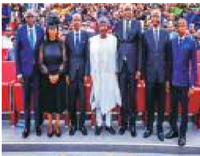
Governor Simon Bako Lalong (CON) in a group photograph with the newly Sworn-in Judges