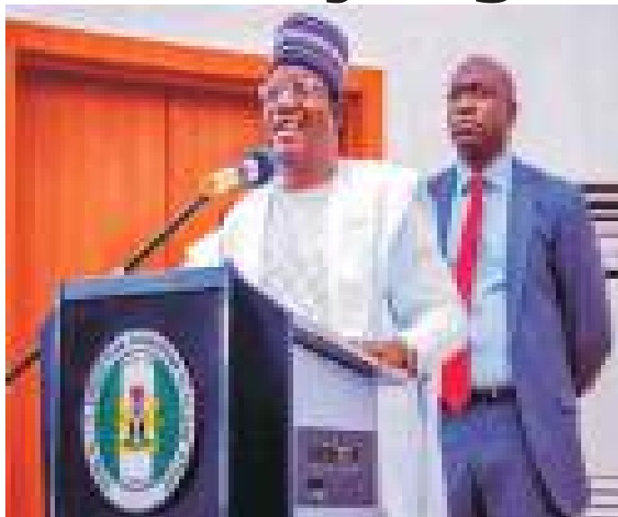
Plateau State Governor, Rt Hon. Simon Bako Lalong reading his address during the Swearing in of 5 Judges and a Judge of the customary Court