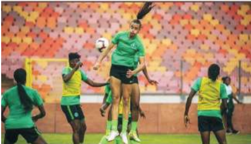
The Super Falcons have dominated Africa but they always falter on the international level

SUPER Falcons defender Ashleigh Plumptre believes the Super Falcons can pull off some good results at the 2023 FIFA World Cup in Australia and New Zealand Soccernet.ng reports.