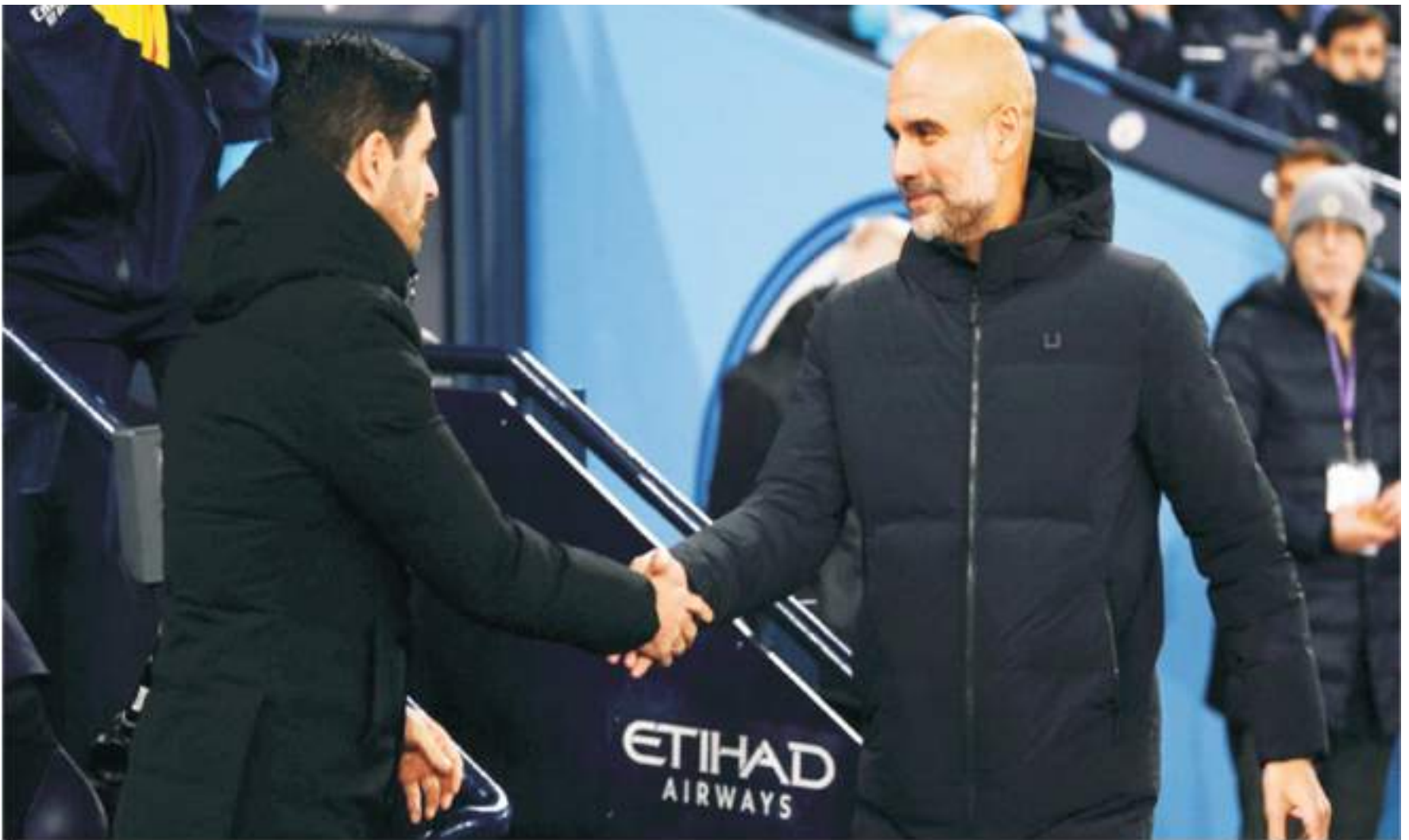
Arteta and Guardiola