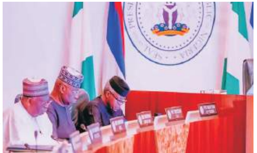
Vice President, Prof. Yemi Osinbajo (right) with other members of FEC listening to remarks