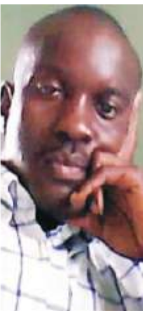
By VICTOR GAI

"The value of education cannot be overemphasized, because education forms the basics of development, literacy, skill acquisition, technological advancements, and the ability to harness human and material resources towards the achievement of etal goals. Public Schools were established for the learning of both the rich and the poor in the country and education then was given the desired attention in which the necessary learning materials were available for both teachers and students to have a quality education."