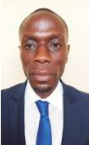
By HOSEA NYAMLONG

NELSON Mandela, once said that "Education is the most powerful weapon which we can use to change the world". He advocated for the value of education.