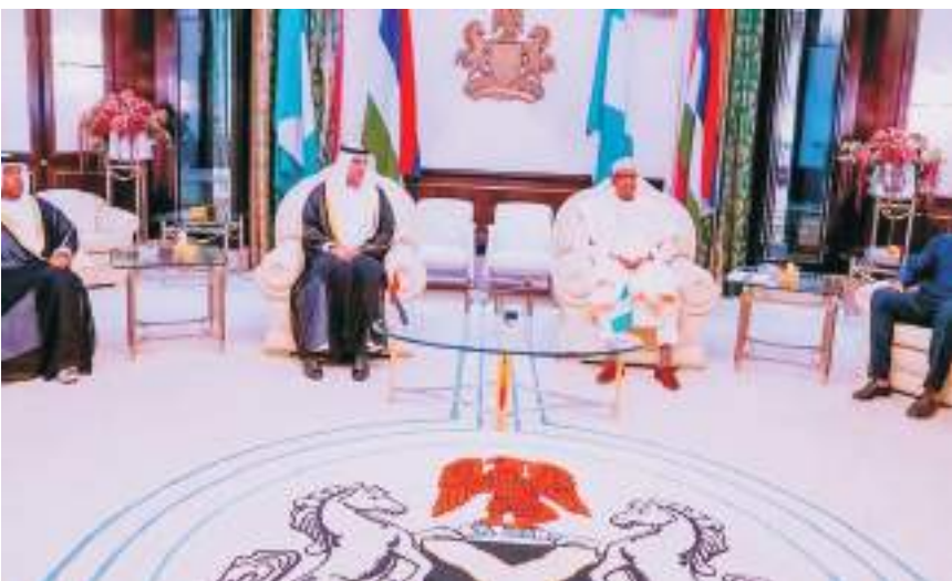
Outgone United Arab Emirates Ambassador to Nigeria exchanging views with Nigeria’s President Muhammadu Buhari during the farewell visit