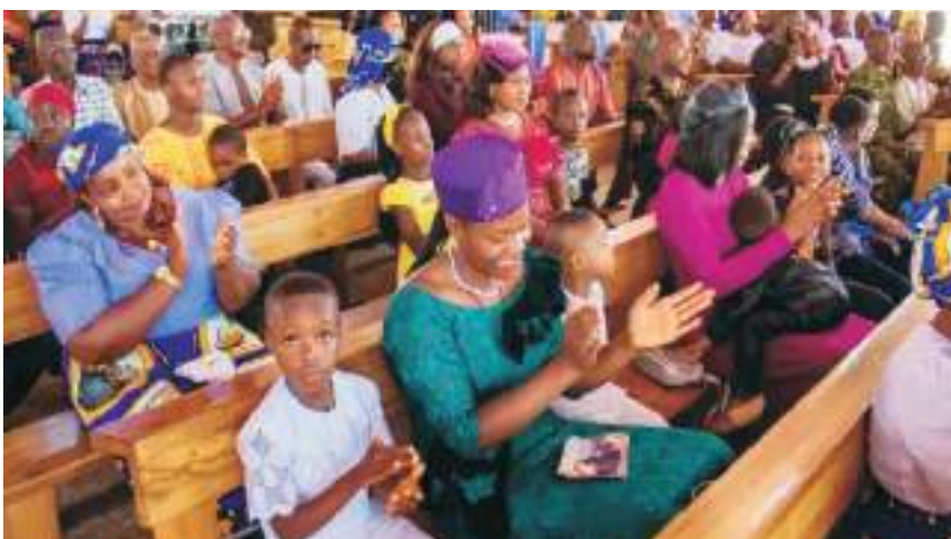
Cross section of worshipers during the Mass