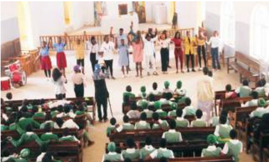
Students of the Theatre and Film Arts appreciating the audience after their performance