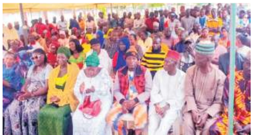
Members of Rt. Hon. Abok Nuhu Ayuba entourage during the visit