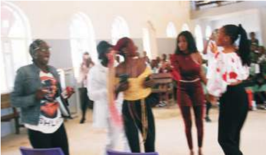
Theatre and Film Arts Students of University of Jos performing to the admiration of St. John’s College Students