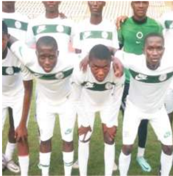
The FIFA U-17 World Cup has been won by the Golden Eaglets five times