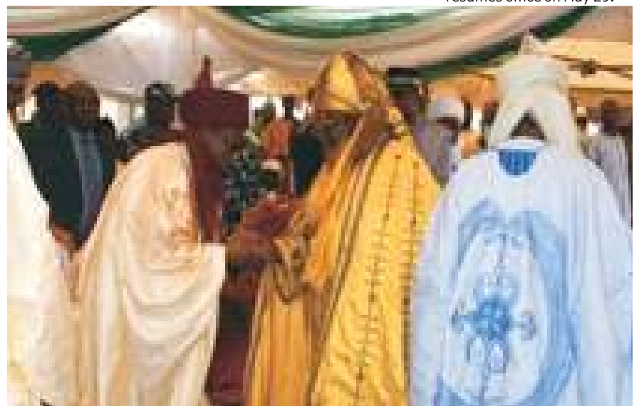
Emire of Bauchi Dr Rilwan Sulaiman Adamu right plays Sallah homage to Gov. Bala Mohammed at Government House Bauchi.

He also assured Nigerians that he has been planning and consulting to put a strong team on ground as he resumes office on May 29.