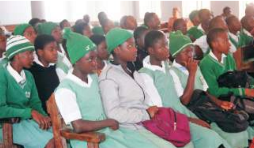
Cross section of students keenly watching the performances