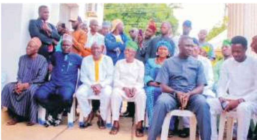
Cross section of stakeholders at the PDP caucus meeting from Jos East LGA