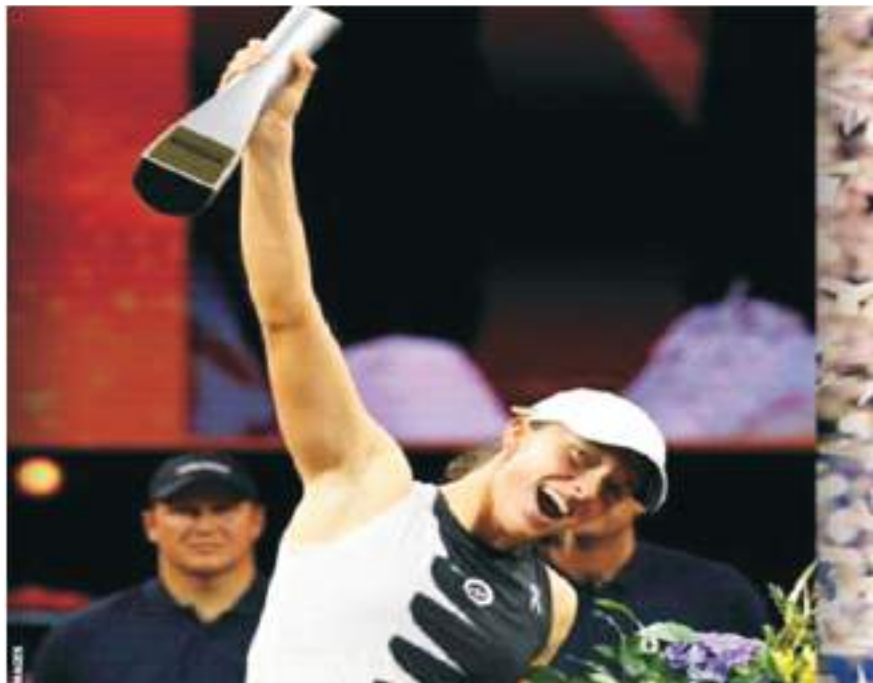
Iga Swiatek is a three-time Grand Slam champion while Carlos Alcaraz won his first Grand Slam title at the 2022 US Open