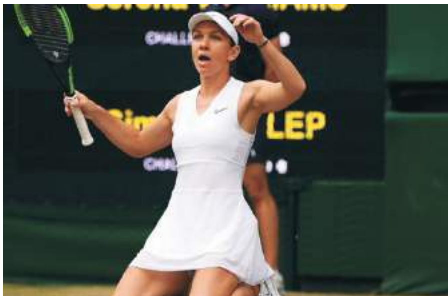
Simona Halep's Wimbledon triumph in 2019 was her second Grand Slam title