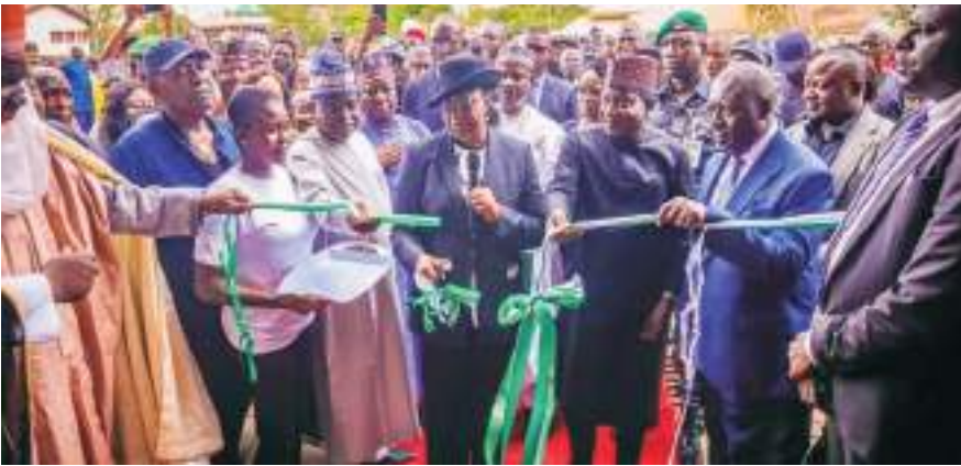
Buhari, Gowon, CJN rain accolades, as Lalong commissions projects.

For Governor Simon Bako Lalong, the few days before leaving office on May 29th, 2023 had been very engaging as he set out to commission over 32 projects completed or initiated by his administration.