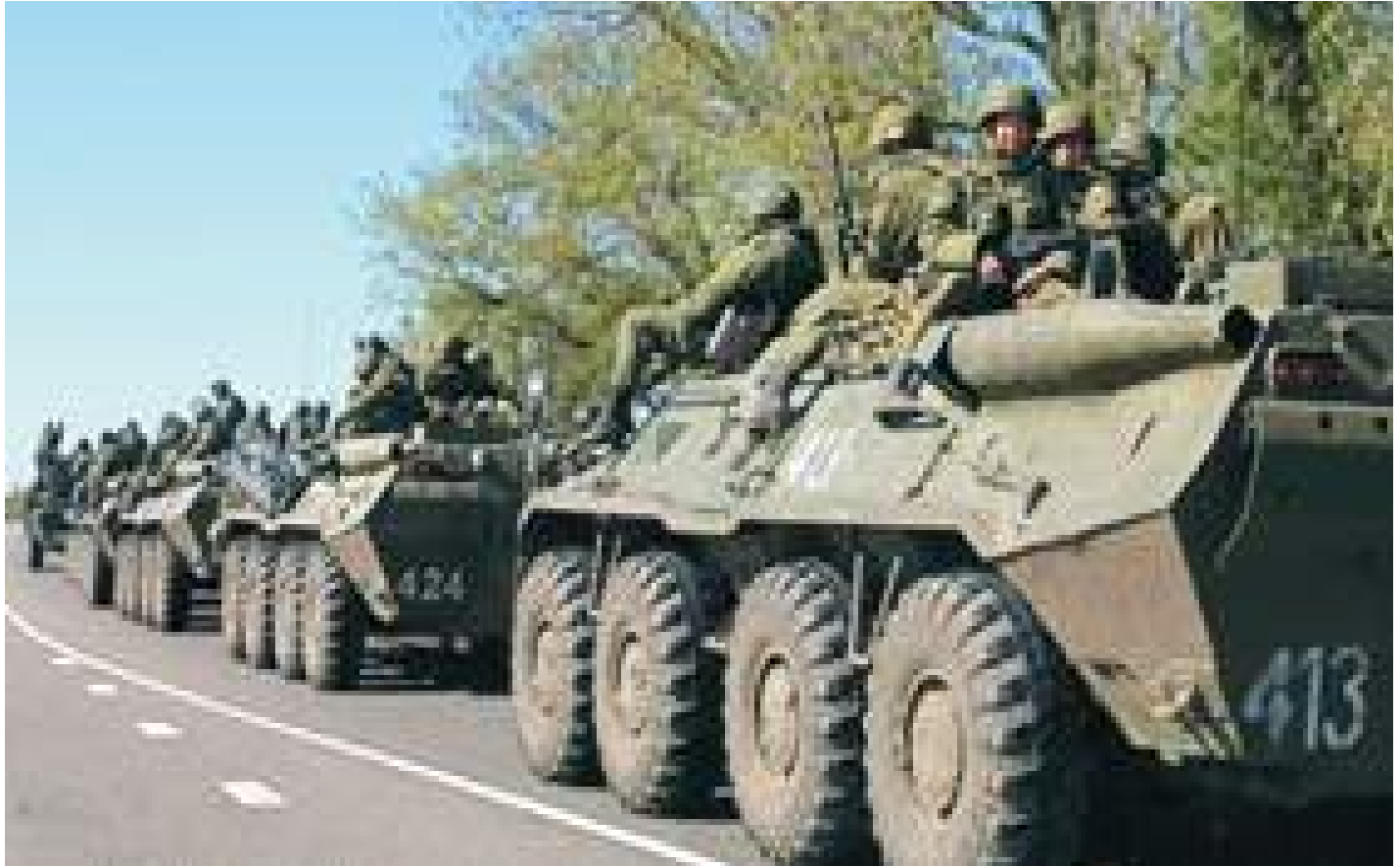
Russian servicemen drive armoured personnel carriers on the outskirts of the city of Belgorod near the Russian-Ukrainian border

Russian shelling in Kupiansk in northeastern Ukraine's Kharkiv province, according to the region's governor, Oleh Syniehubov.