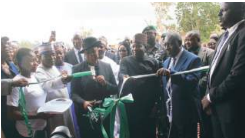
President of the Court of Appeal Justice, Monica Dongban- Mensem commissioning the High Court Complex