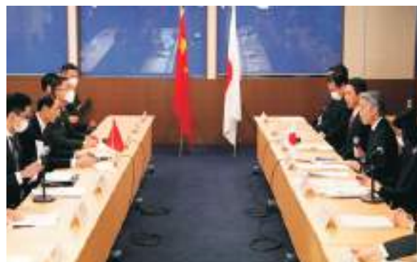
Japanese Senior Deputy Minister for Foreign Affairs Shigeo Yamada, second from right, speaks to Chinese Vice Foreign Minister Sun Weidong, second left, during the Japan-China security dialogue at the foreign ministry, February 22, 2023, in Tokyo

CHINA'S Vice Foreign Minister Sun Weidong has summoned the Japanese ambassador to register protests over "hype around