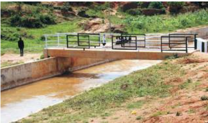
NEWMAP Erosion Control Project commissioned by Governor Simon Bako Lalong, CON at Munchogopyeng, Bukuru, Jos-South LGA