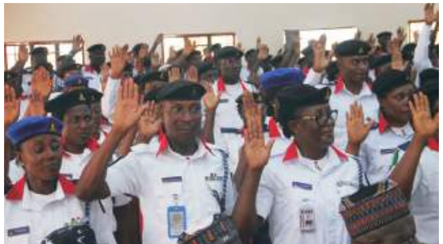
Cross section of set 001 of the NSCDC, Command and Staff College, Jos being inaugurated by the representative of the President