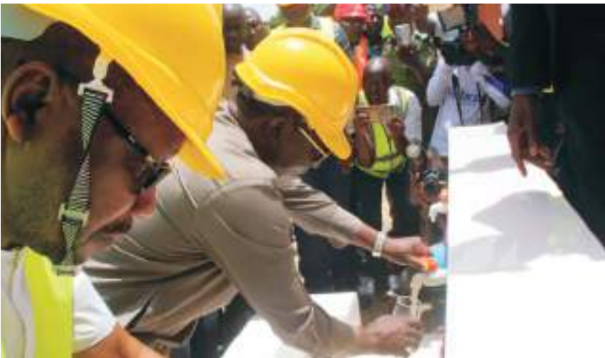
Governor Lalong, CON commissioning the Riyom Water Treatment Plant flanked by the Commissioner of Water Resources and Energy, Hon. Sa'ad Ibrahim Bello