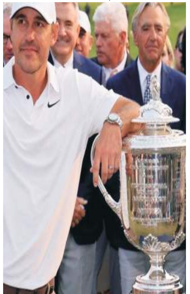
Koepka has joined some of the greats of the game, including Seve Ballesteros, on five major victories

"I'm out here competing as an individual. I'm just happy to take this home for the third time," he added.