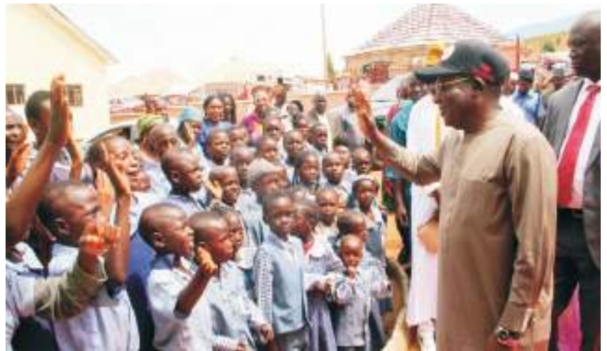
Governor Simon Bako Lalong, CON (right) acknowledging cheers from Pupils of Lalong Legacy Model, Primary School Bukuru, Jos South LGA during the commissioning of the school