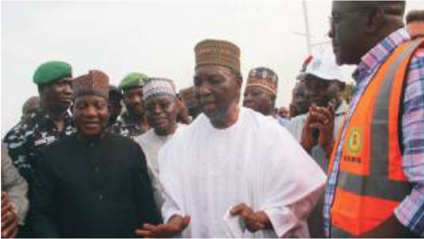
Representative of the President and former Head of States, Gen. Dr. Yakubu Gowon unveiling the plaque at the British American Inter-change flyover and dualization of the road to Lamingo road roundabout

Nigeria's President, Muhammadu Buhari, through his representative and former Nigerian Head of States, Gen. Dr. Yakubu Gowon last week commissioned projects in the state