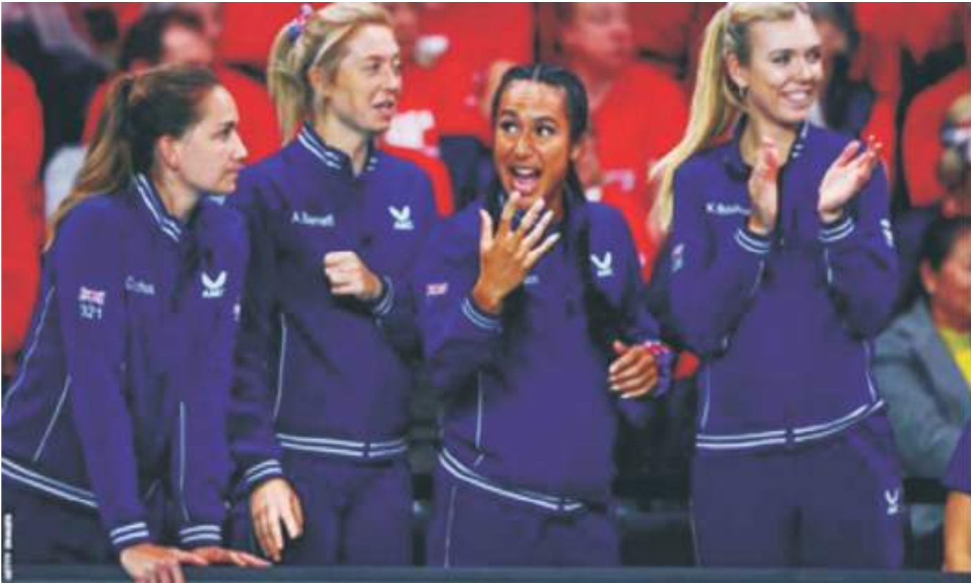
Great Britain, who have won only two of their past seven Billie Jean King Cup ties, faced France last weekend with no top-100 singles players