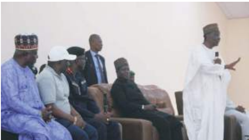
Representative of the President, Gen. Dr. Gowon after commissioning NSCDC Command and Staff College Lamingo inaugurating the Course 001 (Pioneer set of participants)