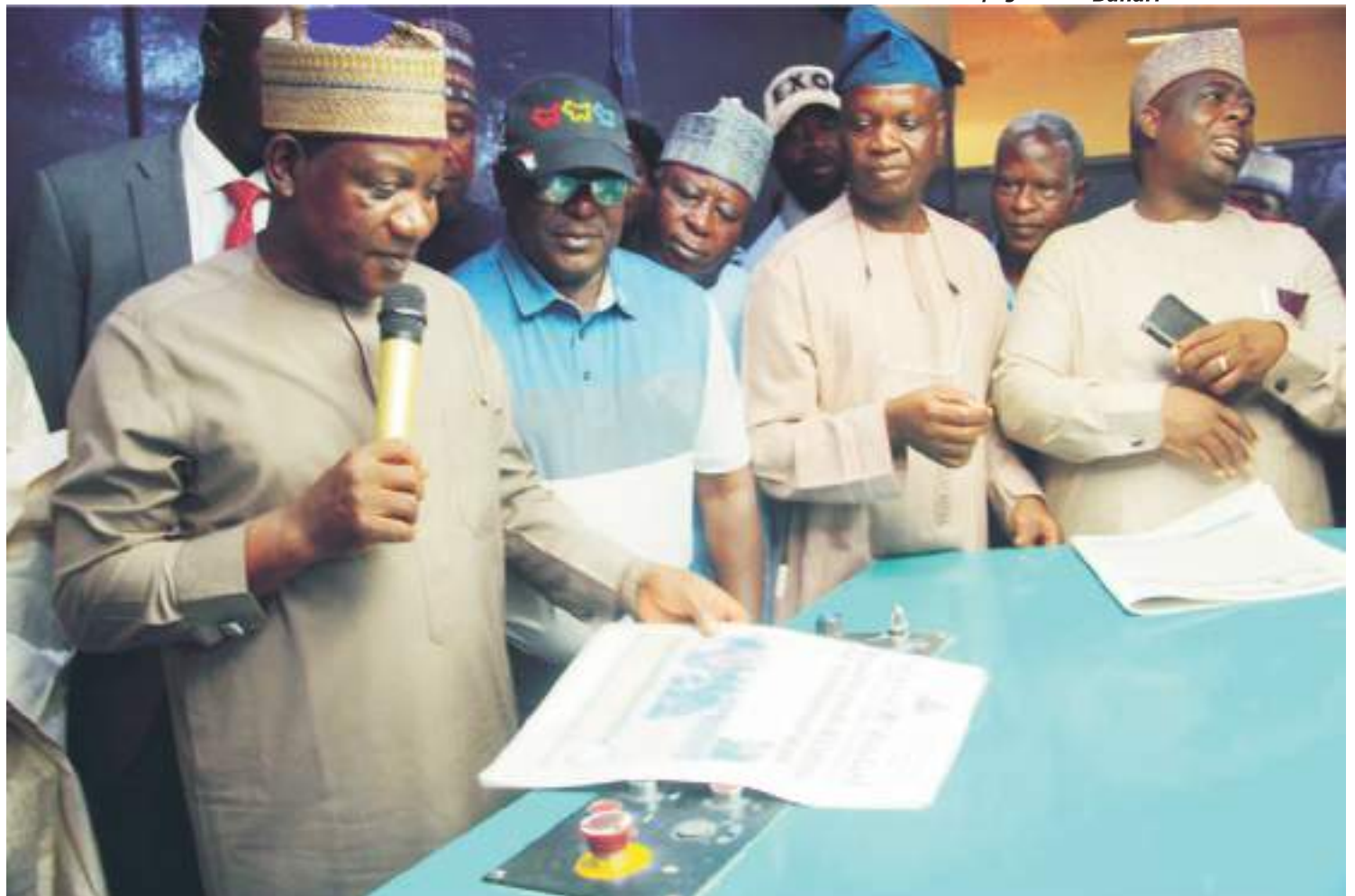
Plateau State Governor and Chairman, Northern Governors Forum, Rt. Hon. Simon Bako Lalong, CON (left) admiring one of the copies of The Nigeria Standard newspapers publication during the commissioning of PPC Cityline Press Machine