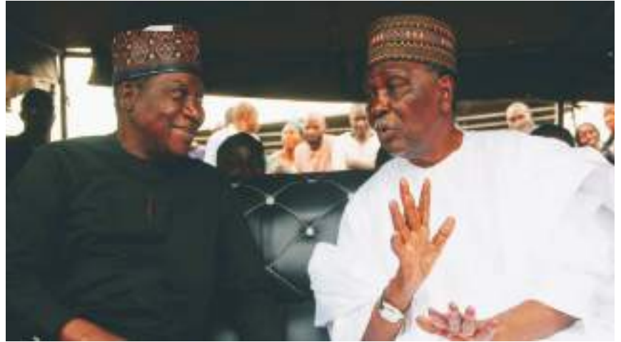
Governor Simon Bako Lalong, CON with Gen. Dr. Yakubu Gowon at the flyover commissioning ceremony