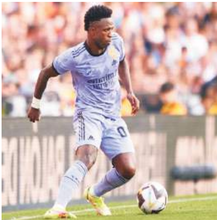
Vinicius Jr in action