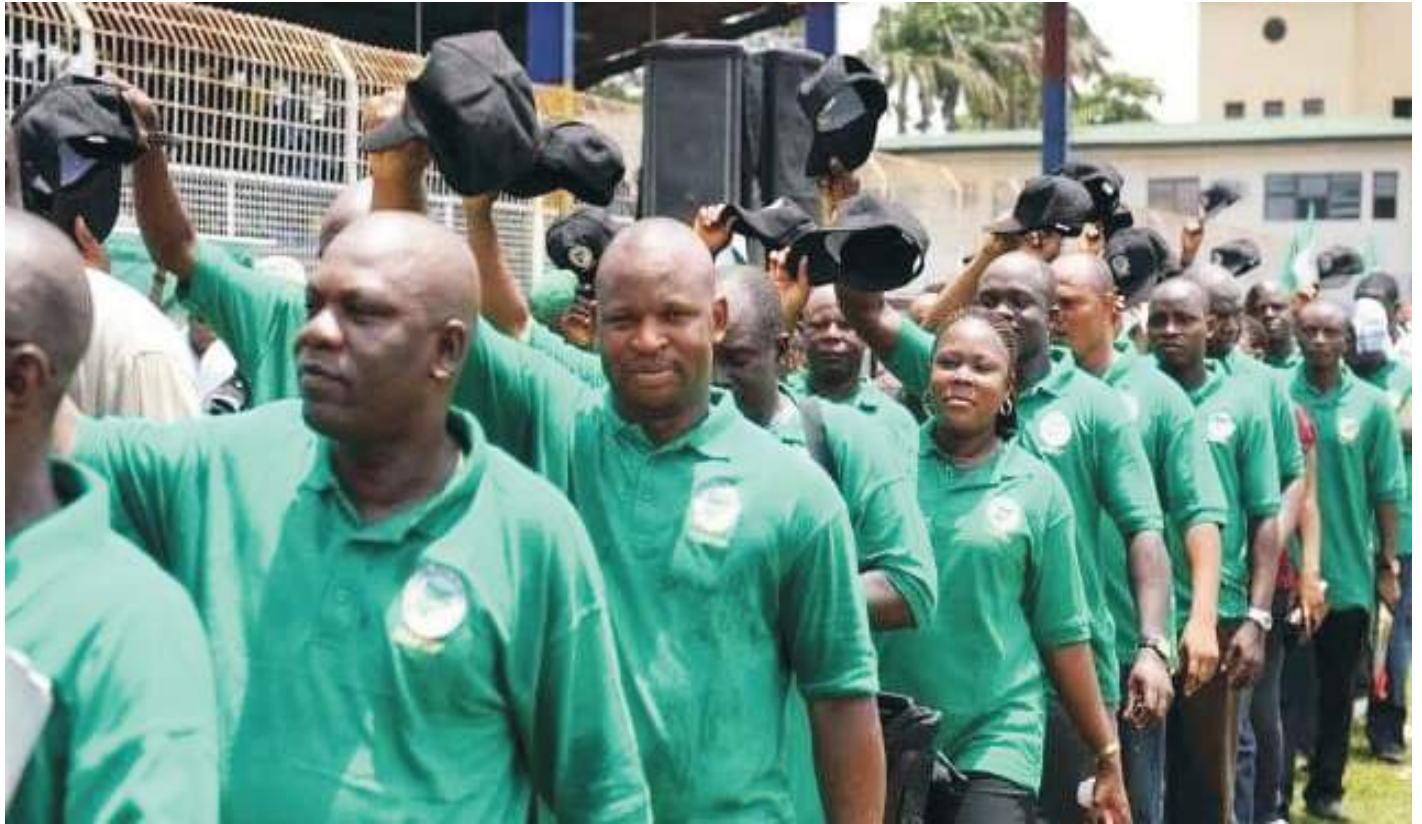
Nigerian workers are suffering and smiling

Shocked about what I was witnessing, I turned to my left and