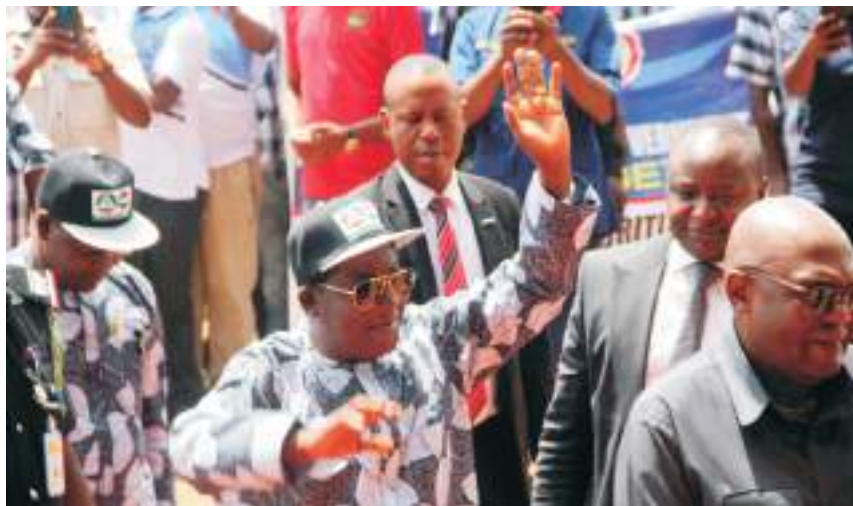
Plateau State Governor, Rt. Hon. Simon Bako Lalong waving at the Nigerian Workers on arrival at the Stadium