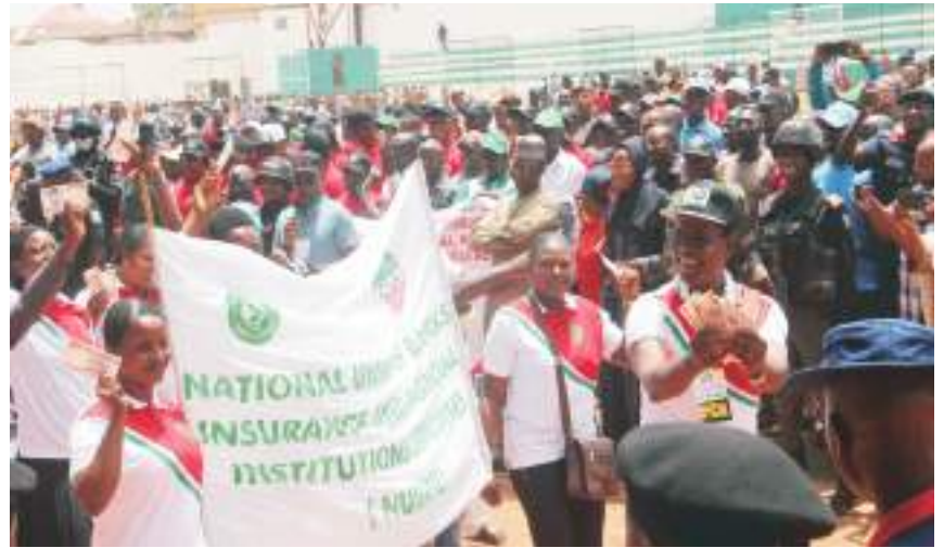
Chairman and members of NUBIFIE demonstrating with Nigeria naira notes at the celebration