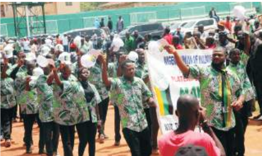
Members of the organised Labour during the 2023 March-Pass at the Stadium