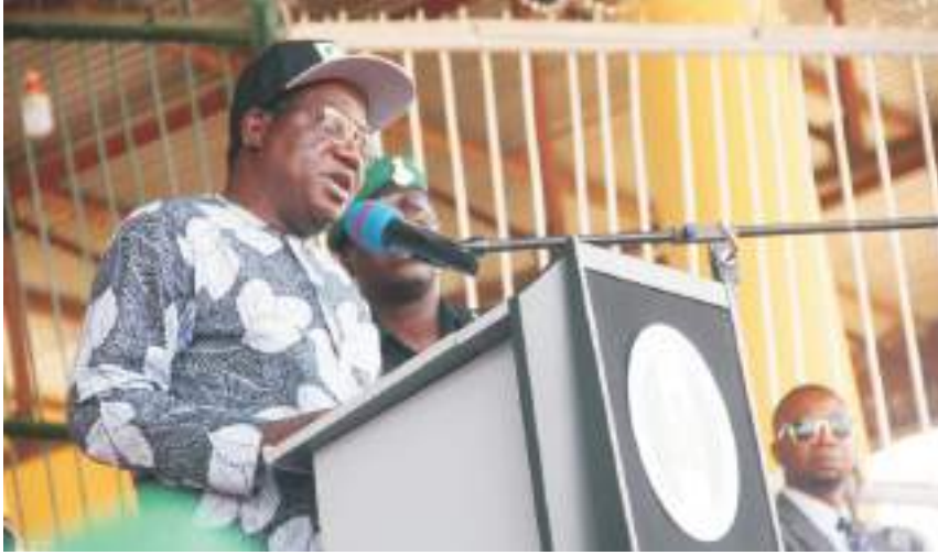
Governor Lalong, CON addressing the Nigerian Workers during the 2023 May Day

Nigerian Labour Congress (NLC), Plateau State Council and Trade Union Congress of Nigeria (TUC) on Monday celebrated the 2023 May Day with the theme: Workers Right & Socio-Economic Justice at the Rwang Pam Township Stadium, Jos