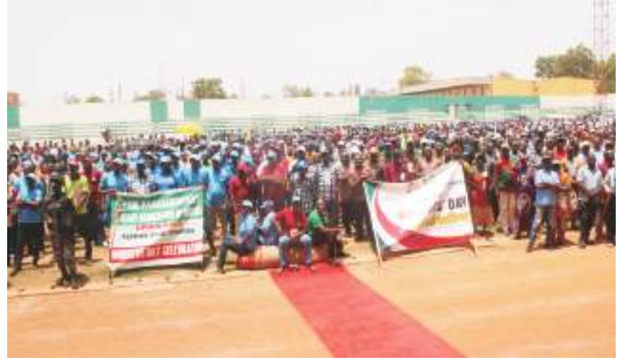
Cross section of workers listening to the Governors address