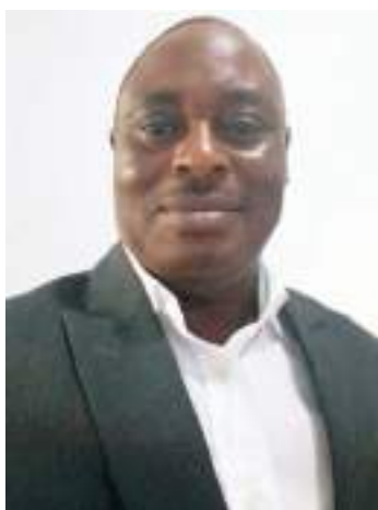
By KENNETH DARENG

Mothers Day is considered as a very auspicious moment to celebrate the daily role of mothers in shaping not only the home front but also the society at large. It is indeed an occasion that calls for reflection on who a mother is.