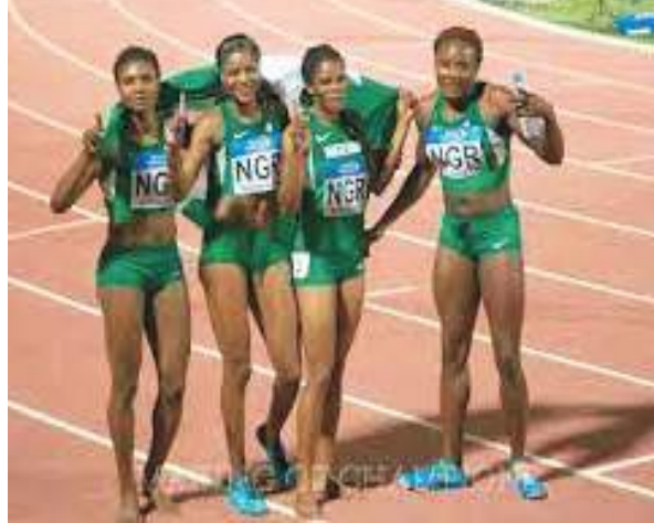
Some Nigerian athletes