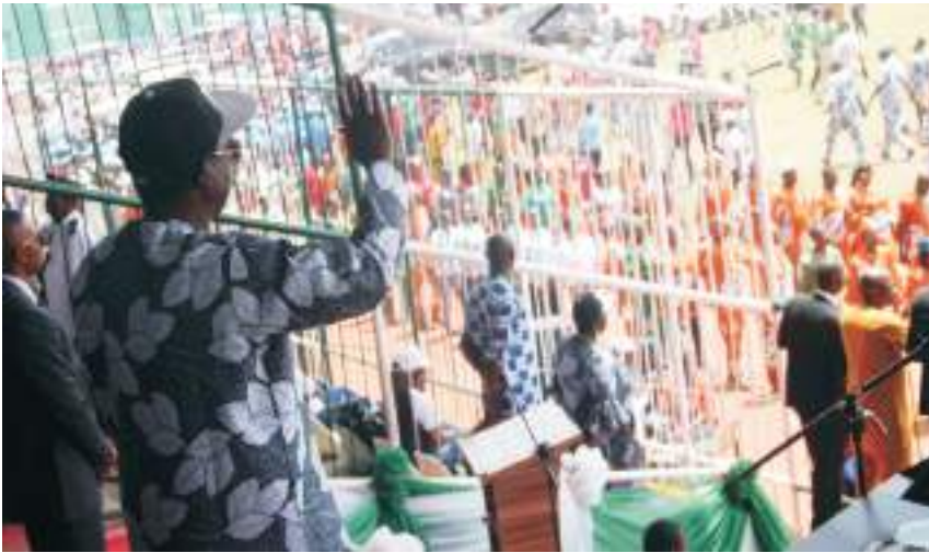
Governor Simon Bako Lalong, CON acknowledging cheers from Nigerian Workers during the May Day celebrations

Nigerian Labour Congress (NLC), Plateau State Council and Trade Union Congress of Nigeria (TUC) on Monday celebrated the 2023 May Day with the theme: Workers Right & Socio-Economic Justice at the Rwang Pam Township Stadium, Jos