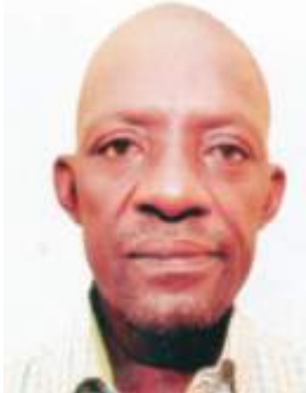
By VICTOR ALI

WATER is life, goes a very popular saying: This cannot be distant from the truth. "No homo sapiens and even animals and other things can survive without the usage of water. It is an inescapable necessity for human existence.