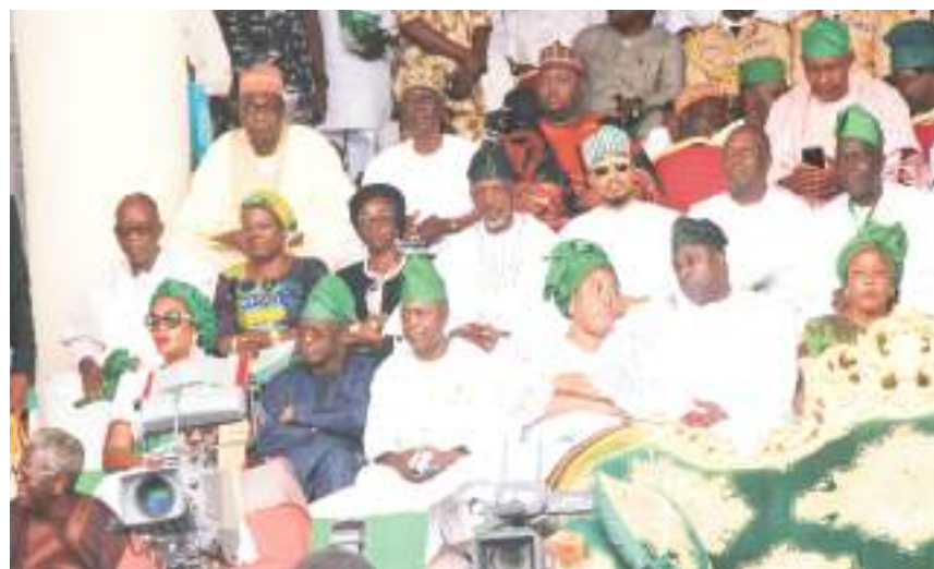
Cross section of invited dignitaries at the inauguration ceremony