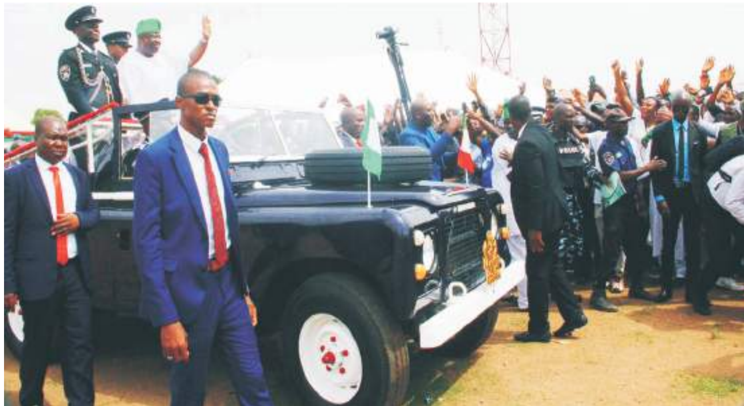
Plateau State Governor, Barr. Caleb Mutfwang acknowledging cheers on motorcade after being sworn-in as the elected Governor of the State at the Rwang Pam Township Stadium, Jos on Monday, May 29, 2023

"Conscious of the fact that I have been elected governor by Cont'd on Page 2