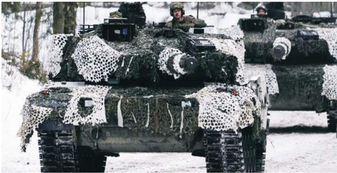
Denmark's Leopard 2A7 tanks move during the Winter Camp 23 military drills near Tapa, Estonia

However, the Danish government highlighted that the latest defence budget announcements will only help the country reach NATO's target in 2030.