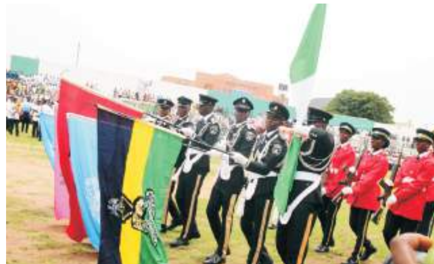
Colour party mounted by the Nigerian Police Force during match pass