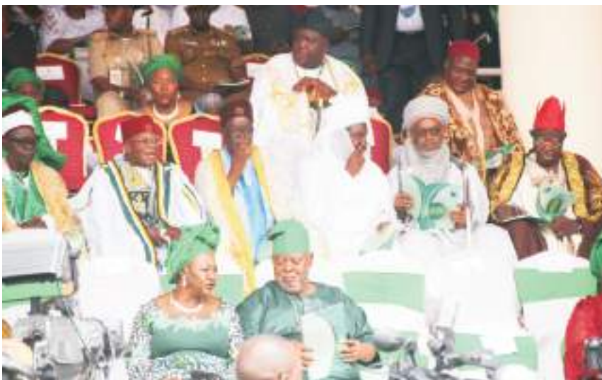
Cross section of members of the State Traditional Council at the ceremony