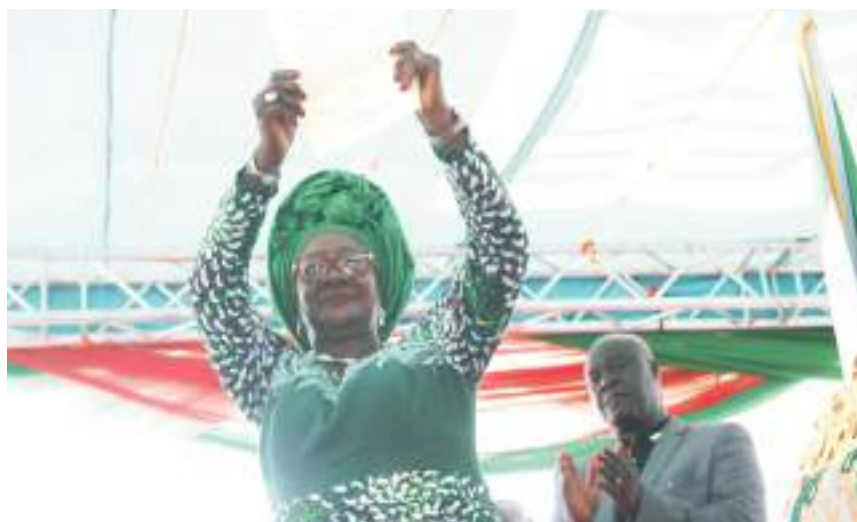
Deputy Governor of Plateau State, Hon. Josephine Piyo displaying her certificate after being sworn-in as Deputy Governor