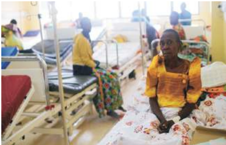
A patient rests on a bed in a hospital in Kampala, Uganda

In September 2022, Aceng admitted that the demand for organ transplants in the country was high, but there was no law in place.