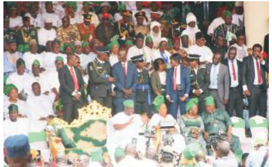
Governor Caleb Mutfwang (front row) acknowledging cheers from invited personalities