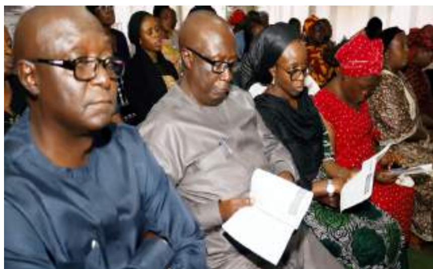
Cross section of sypathisers at the service of songs