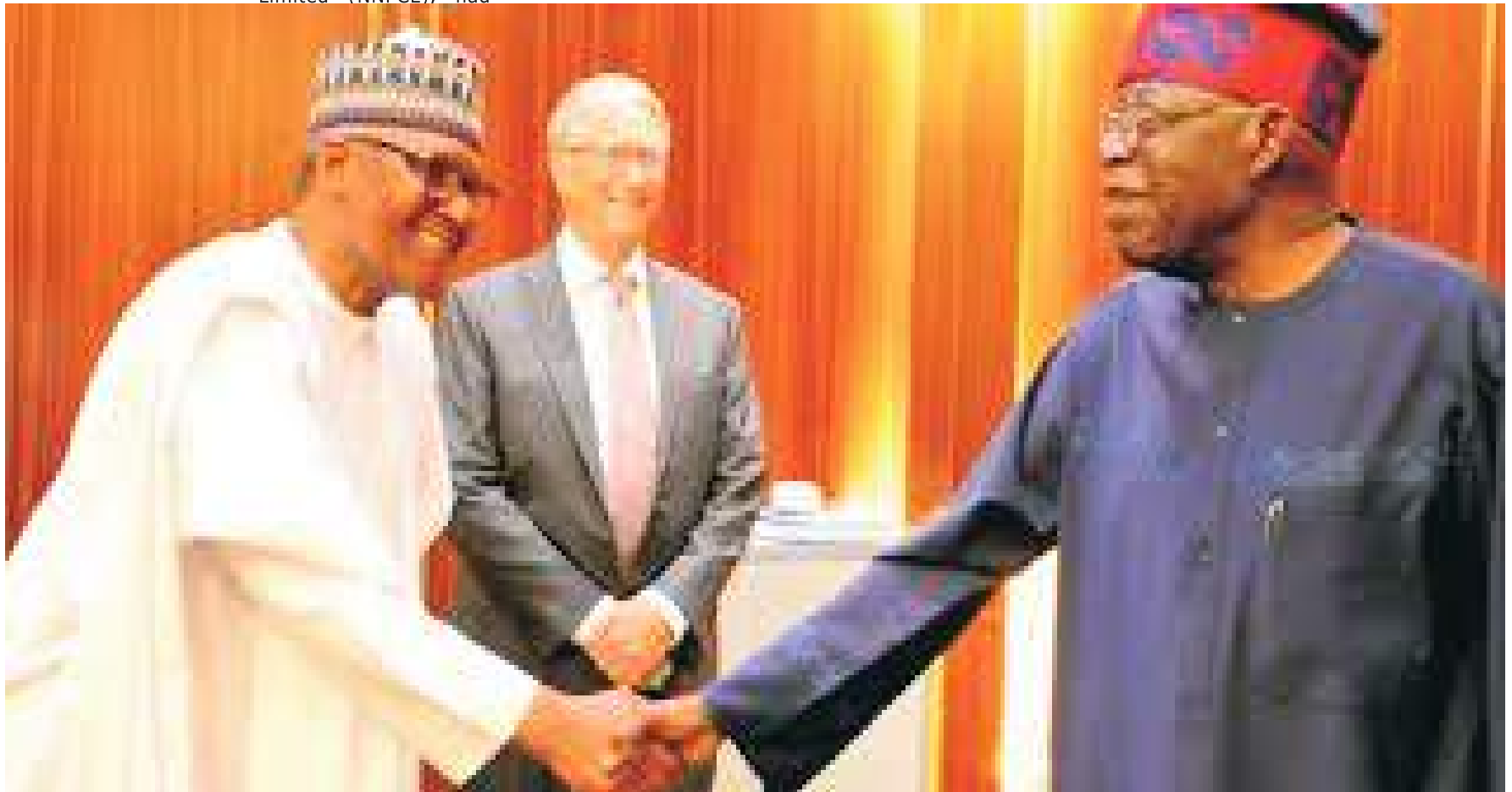
Nigeria's President, Bola Ahmed Tinubu, exchanging greetings with the President of Dangote Group, Alhaji Aliko Dangote and the Founder, Bill & Melinda Gates, Bill Gates during a visit at the Presidential Villa, Aso Rock Abuja on Monday.

"Now, as we go along, of course, we'll be briefing you on the progress or the achievements so far, but the important thing is that NNPC has 30 days fuel sufficiency, so we do not anticipate any gap in supply or in distribution."