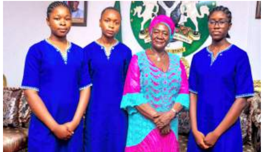
Plateau State Deputy Governor, Hon. Josephine Piyo with some students of the St. Louis College Jos in a photograph