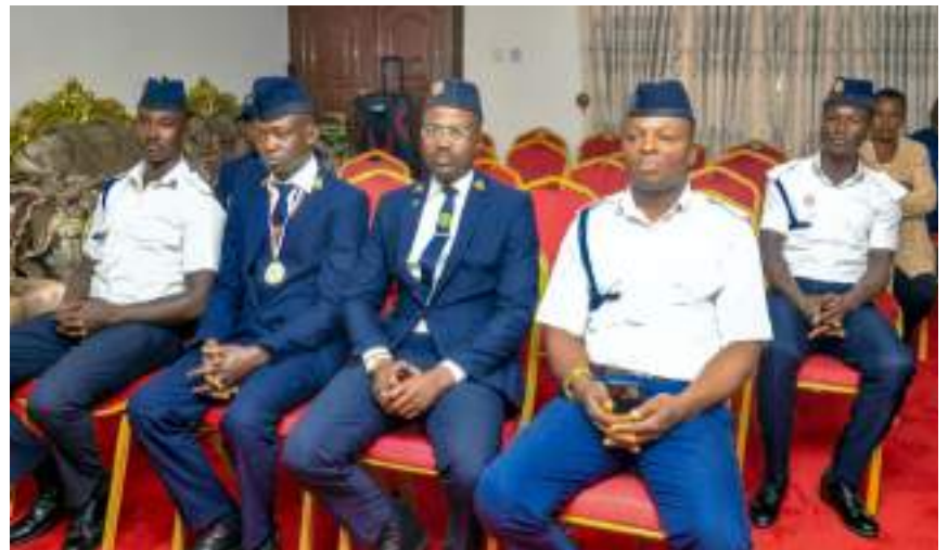
Cross section of some officers of the Boys Bridgade Nigeria, Jos North Battalion Council listening the remarks during courtesy call