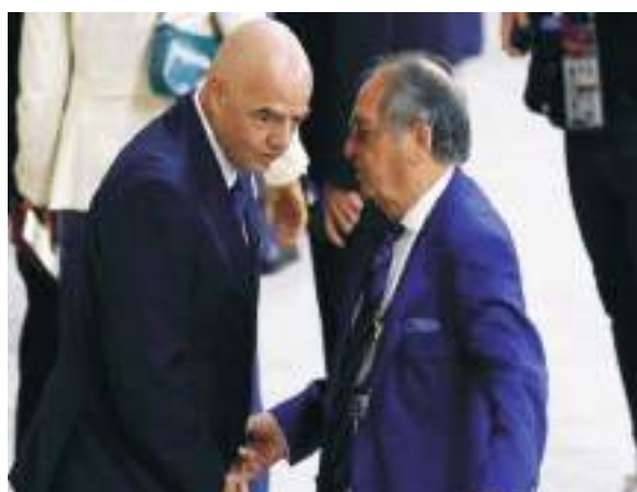
Le Graet has been president of the FFF since 2011

In January 2022, he was appointed as Fifa president Gianni Infantino's delegate in