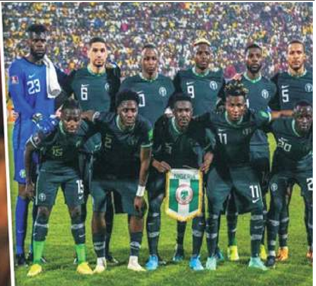
The Super Eagles departed Monrovia, the capital of Liberia with a 3-2 win over Sierra Leone.