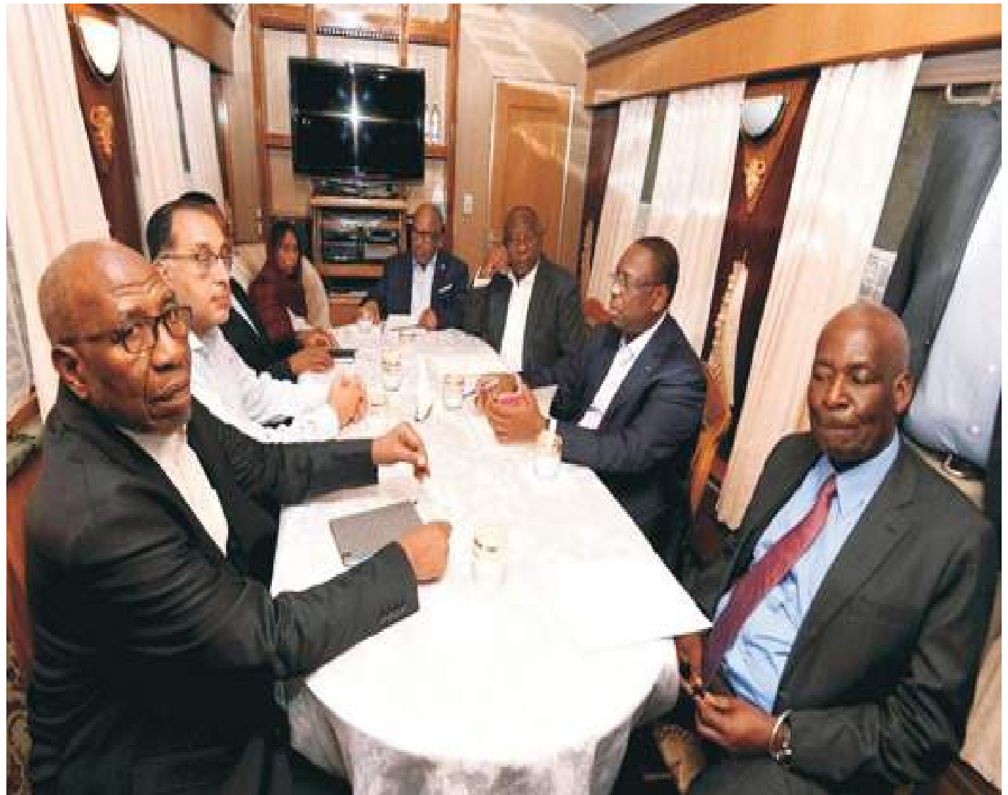
The African delegation travelled by train from Poland to Ukraine, and then on to Russia

which formed part of the African delegation, are seen as aligned with Russia's position. Last month the US ambassador accused South Africa of violating neutrality and supplying weapons to Russia, violating its non-aligned status. South Africa denied this.