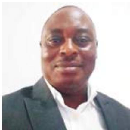
By KENNETH DARENG

In a country of about 200 million people, this sure portends danger. Imminent implosion can occur afterall, the old adage that a hungry man is an angry man remains immortal because at the end, something must give. And what is to be done? It behooves on government to strategise and bring out workable solutions towards ameliorating the already precarious living conditions of Nigerians. It is evil that with all the petrol dollars Nigerians are wallowing in abject poverty, wants and penury.