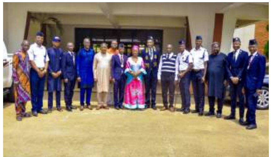
Plateau State Deputy Governor, Hon. Josephine Piyo in a group photograph with government functionaries Evangelist Lengshakka Mershaka and members of the entourage