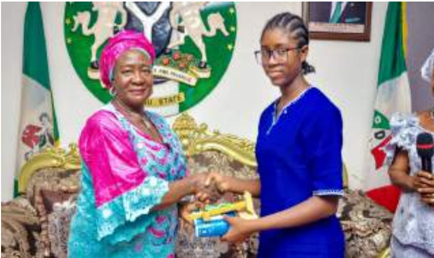
Student of the College (right) presenting souvenir to the Deputy Governor, Hon. Josephine Piyo