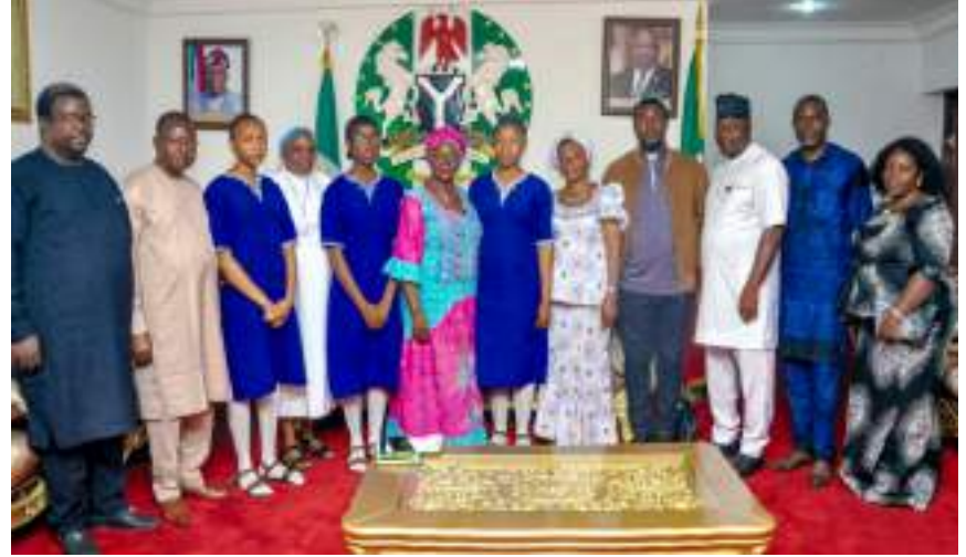
Deputy Governor, Hon. Josephine Piyo (middle) in a group photograph with some management staff of St. Louis College Jos and Government Officials