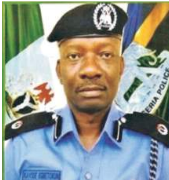
Ag. IGP Egbetokun

Operatives of Kaduna State owned security outfit, have allegedly shot and injured 12 residents of SabonGyero