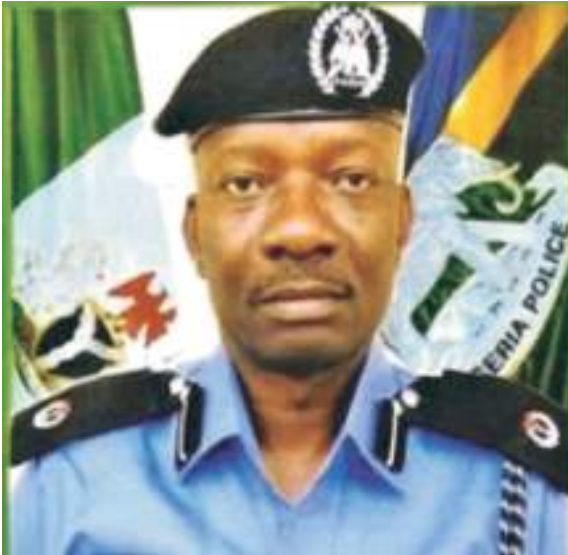
Ag. IGP Egbetokun

THE Police Service Commission has approved new policy guidelines for deployment of management and Tactical Commanders in the Nigeria Police Force and the imperativeness for gender-sensitivity in the deployment of Assistant Inspectors-General of Police and Commissioners of Police to Zonal and state Command Headquarters.