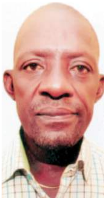
By VICTOR ALI

NIGERIA is indeed a very funny country. Blessed naturally with the Black Gold (crude oil), the country supposedly should be in the league of developed nations. Amidst the joy of discovering this natural resource before the country gained its independence, Nigerians and the world felt the country was good to go in terms of monumental strides in its development. Today, over five decades after independence, it is still debatable whether the God-given crude oil is a blessing or a curse.