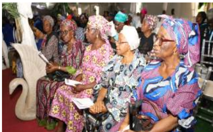
Some members of the deceased family