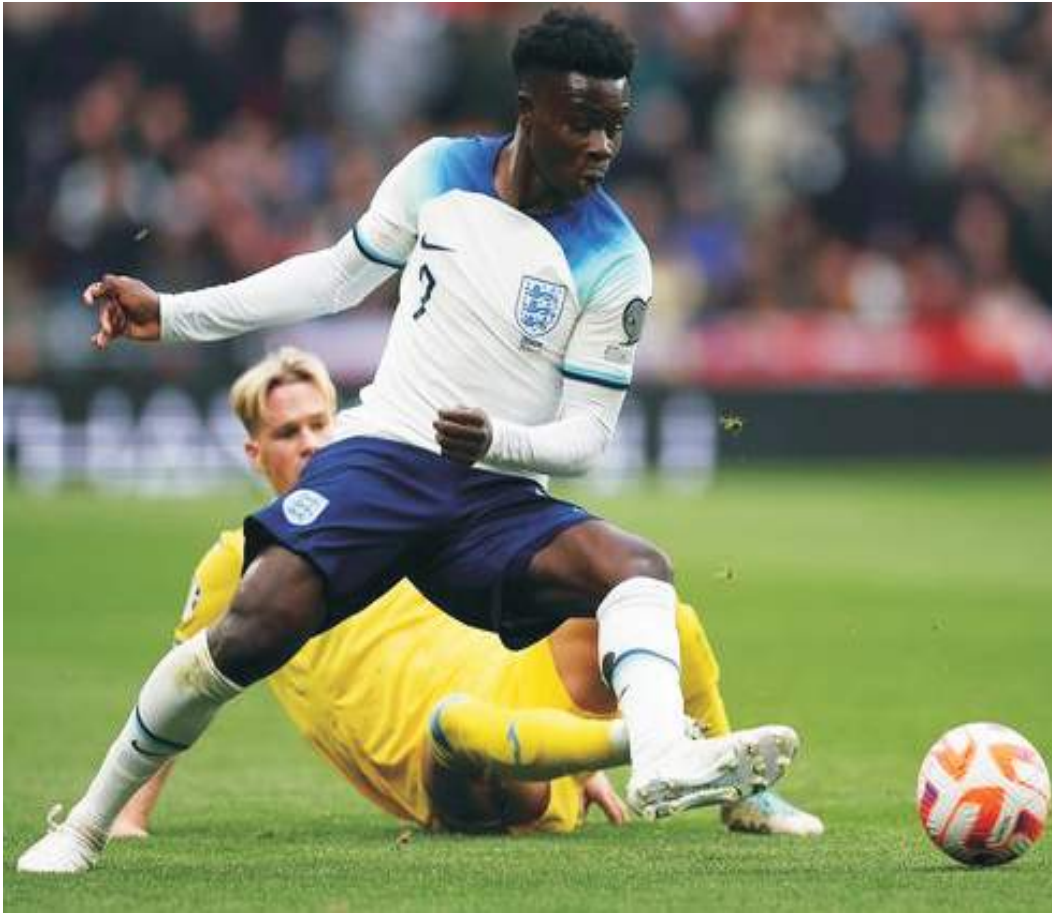
Arsenal fans send Chelsea supporters stinging Mudryk verdict amid Saka comparison

The obvious joy of his teammates when he completed his treble - and when they sought him out with the match ball at the final whistle - showed Saka is not just lavishly talented, but extremely popular.