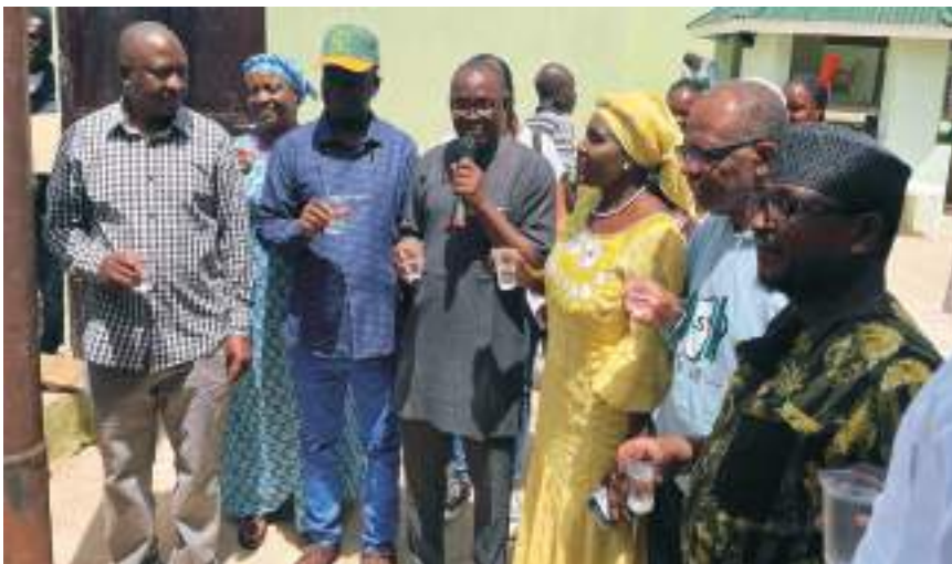
Journalists tasting water from the commissioned borehole