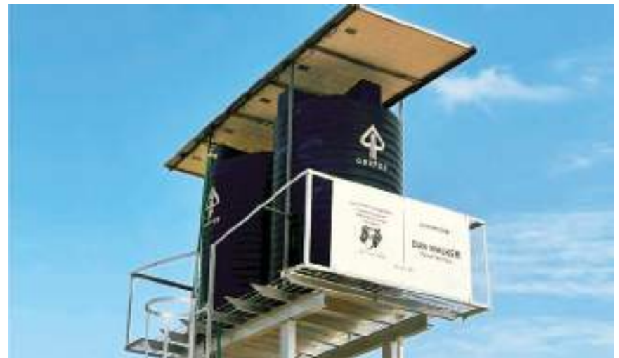
Overhead tank donated by the NGO at the Nigeria Union of Journalists, Plateau State Council, Jos