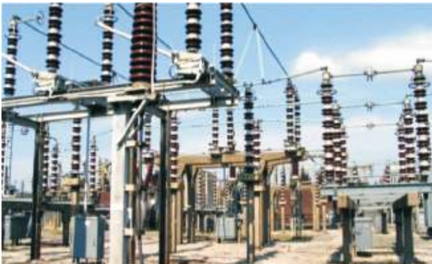
Power Transmission Grid

“It cannot ever be overemphasized that the primary duty of any government is the responsibility to care for and protect her citizens.”