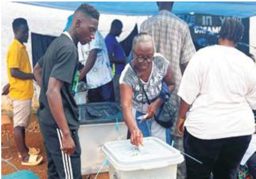
Voters on Saturday are faced with a choice between the same two leading presidential candidates