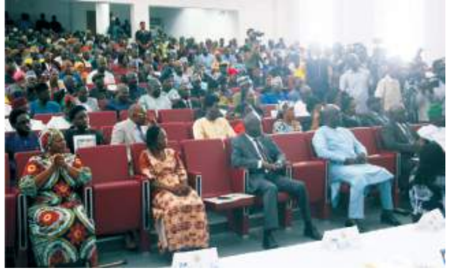
Cross section of the newly appointed Permanent Secretaries