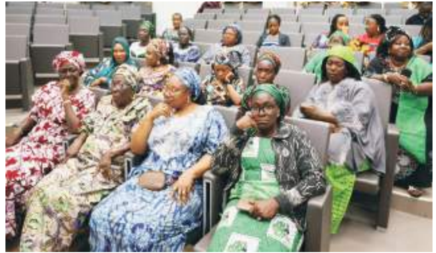
Cross section of widows listening attentively to the speech by the First Lady