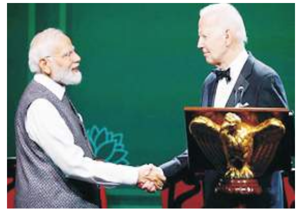
Following a lavish state visit by Indian Prime Minister Narendra Modi to Washington, US President Joe Biden

"This followed a fading commitment to the relationship during [former prime minister] Manmohan Singh's second term as the leader of a coalition government. With Mr Modi there has been a lot more enthusiasm about embracing the US. Mr Biden