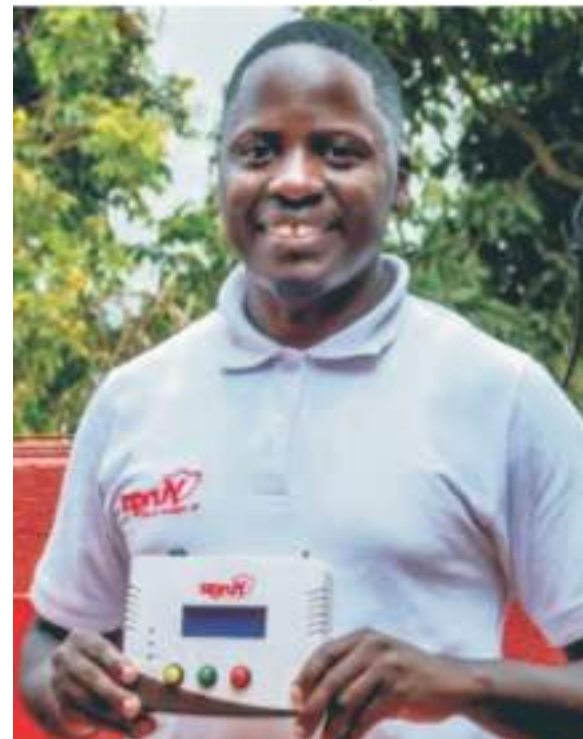
The innovation is based on the "10,000 household model" - a traditional practice where people use drums to alert their community to an emergency

So far, Yunga has prevented over 180 cases of community crime and they have plans to expand to additional African markets like Ghana, Kenya and Nigeria.