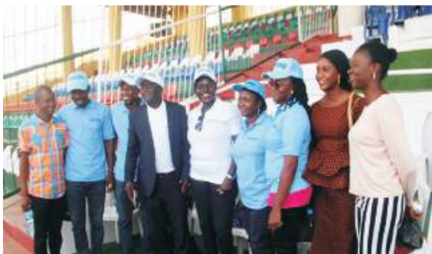
President and Cooperators of NTA Jos Cooperative Society in photograph