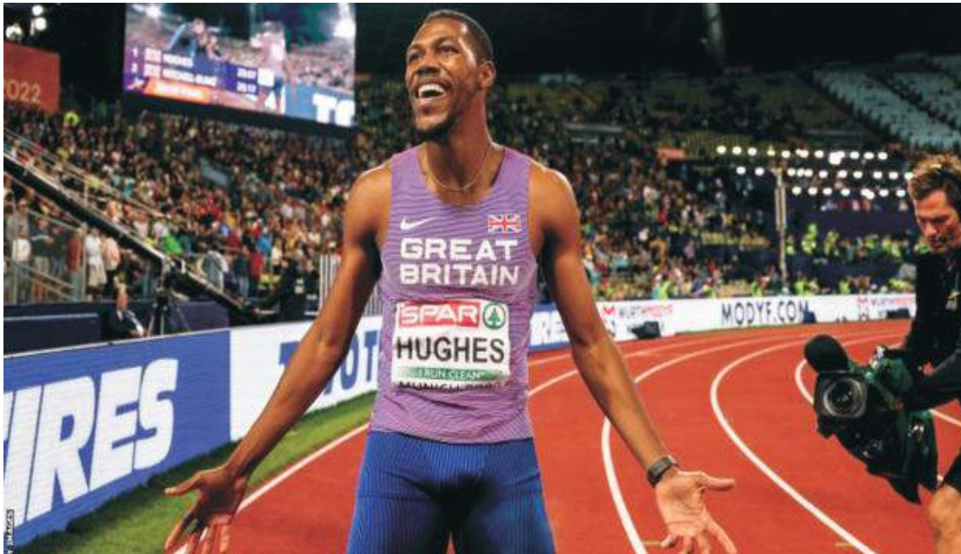
Zharnel Hughes is the fastest man in the world this year, and broke the British 100m record in June