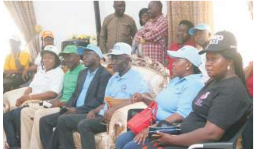
Cross section of some Presidents of Cooperative Societies in the state during the courtesy call