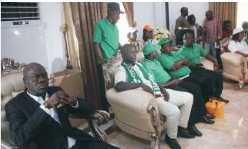
Cross section of the CFN President's entourage