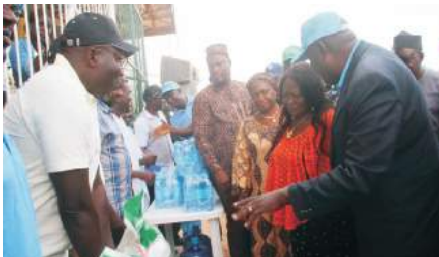
President, CFN, ICA, Africa, President, PLASCOFED conducting the Deputy Governor, Hon. Josephine Piyo round exhibition mounted by Local Government Multipurpose Cooperative Society