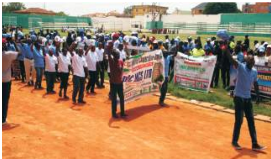
PPC MCS during the match pass at the celebration