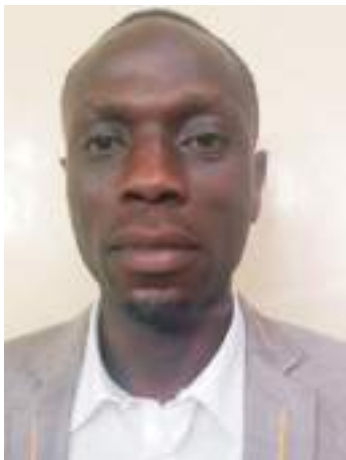
By HOSEA NYAMLONG

"The big questions at the moment are What is obtainable now? Are Nigerians observing these protocols? Or is there a tentative pronouncement that Covid-19 has bid us farewell? Is Covid-19 dead and gone? These questions become very pertinent looking at the turn-around attitudes of Nigerians at the moment. A visit to any gathering, whether social, religious or otherwise will give one the impression that the pandemic has faded into oblivion."