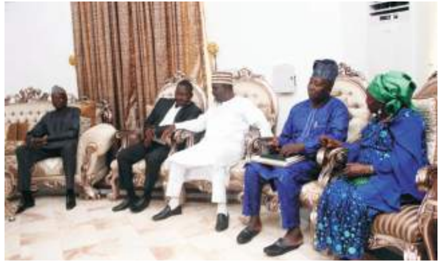
Deputy Governor (right) with other government appointees at the courtesy call