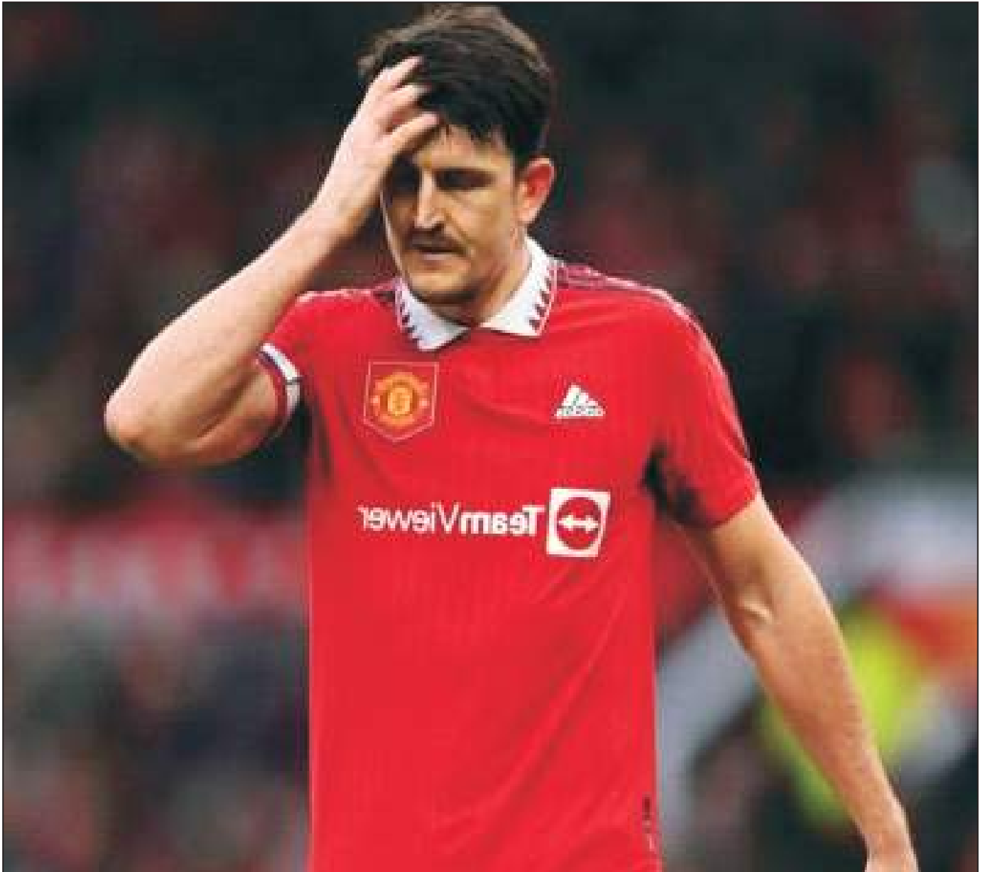
Harry Maguire has been relieved of his duties as captain of Manchester United before the 2023-24 season

'My conscience is clear' - Maguire tells BBC sports editor Dan Roan. He continued to insist the incident had no additional effect on his football but when the new season started the following