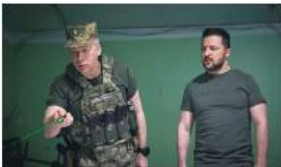
Gen Syrskyi (L), seen here with President Volodymyr Zelensky, is leading Ukraine's renewed offensive in the east

The general says the city's recapture would have more than just symbolic value. He argues Bakhmut is also of strategic importance - as the gateway to other key cities in the region.