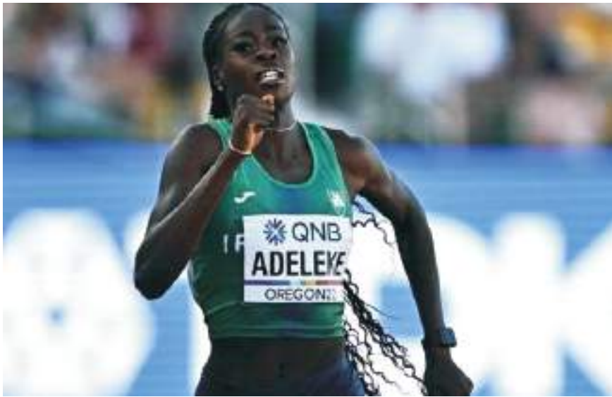
Rhasidat Adeleke broke 50 seconds for 400m for the first time in May and then improved her personal best and Irish record to 49.54 seconds