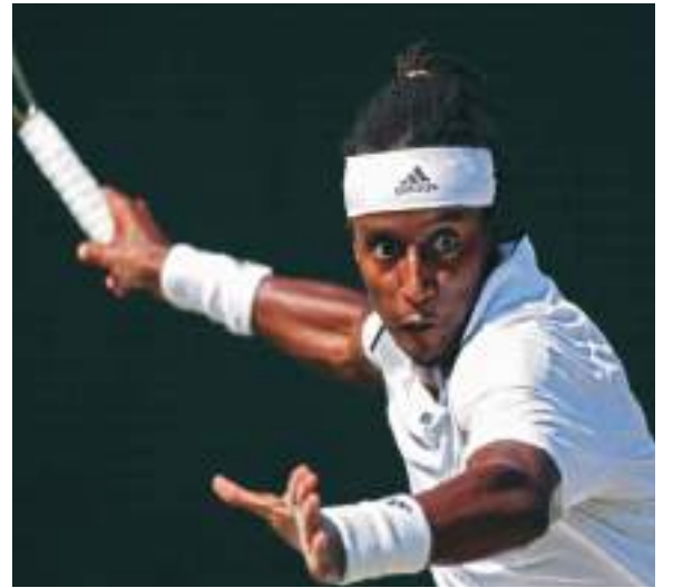
Mikael Ymer knocked ninth seed Taylor Fritz out of Wimbledon before losing in the third round

"The degree of fault of the player, a professional and experienced athlete, was high, although the third whereabouts failure could be described as the result of culpable negligence," said Cas.