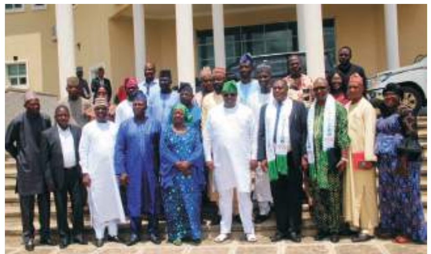
Governor Caleb Mutfwang, National President of Institute of Building, his members and Government Officials in a group photograph