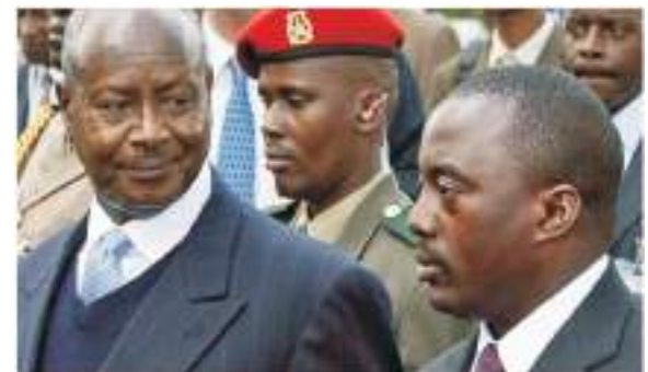
Mr Kabila (R) said the false accusation made by Mr Museveni (L) was ridiculous

"THE false accusations of President Museveni, who is one of the main destabilisers in the region, are simply ridiculous and aim to distract the Congolese people and divide them," Mr Kabila told the Reuters news agency.