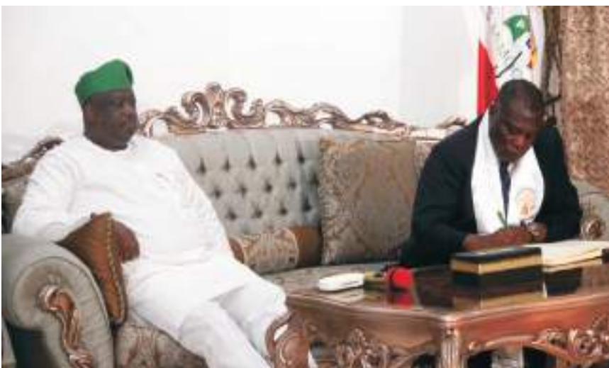
National President of the Institute (right) signing the visitors book