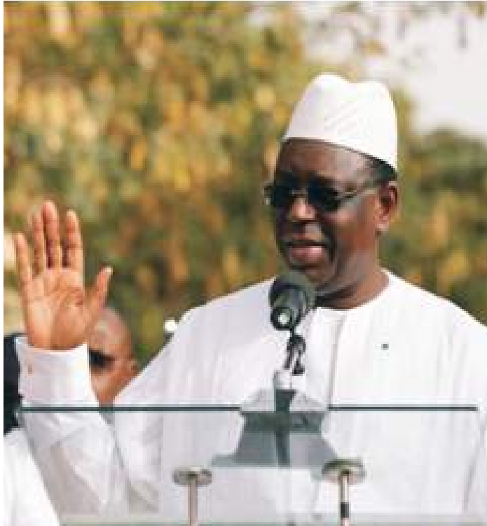
Senegal's President MackySall in Fatick, Senegal on February 24, 2019

Already in the race is IdrissaSeck, the runner-up to 2019's presidential vote, and whose Rewmi party had joined Sall's ruling Benno BokkYaakaar (BBY) coalition after last year's parliamentary elections. Also running is AminataTouré, who previously served as Sall's prime minister. But while both of those candidates served with Sall in government, they've left to pursue their presidential