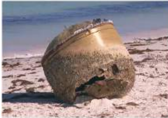
The cylindrical object was found on July 16, 2023, at Green Head, Western Australia

"We're pretty sure, based on the shape and the size, it is an