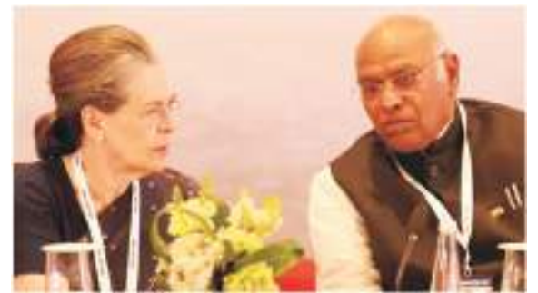
Some reports say Sonia Gandhi (left) may be named president of the united front

political party with a declared income of 19.17bn rupees ($233.67m; £178.4m) in 2021-22. And its biggest strength in a national election is the popularity of Mr Modi, who has been able to sway even voters who may have chosen a different party in state polls.