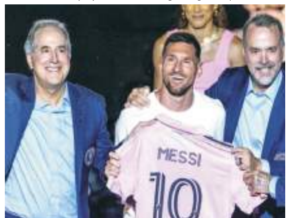
Lionel Messi is Barcelona's record scorer with 672 goals and won 10 La Liga titles, four Champions Leagues and seven Spanish Cups

He said: "Much like when Pele joined the New York Cosmos [in 1975], same thing. Bring him up."