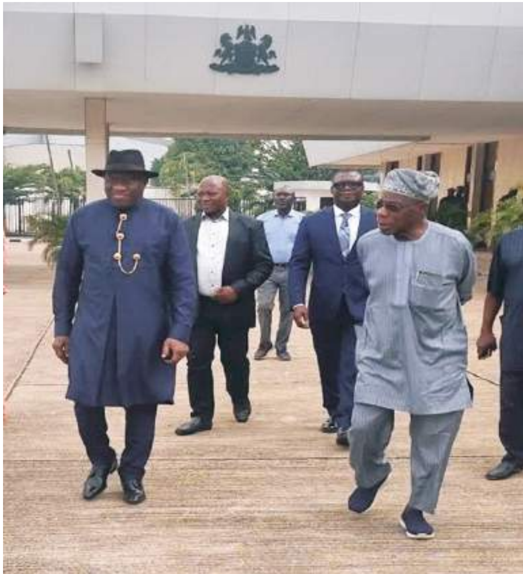
Former Presidents Obasanjo and Jonathan

The incumbent President, Julius Maada-Bio of SLPP was declared winner of the election by the Electoral Commission of Sierra Leone (ECSL) having scored 1,566,932 ( 56.17 per cent) of the total valid vote cast, while his closest rival, Samura Kamara of APC polled 1,148,262 (41per cent) of the total votes.