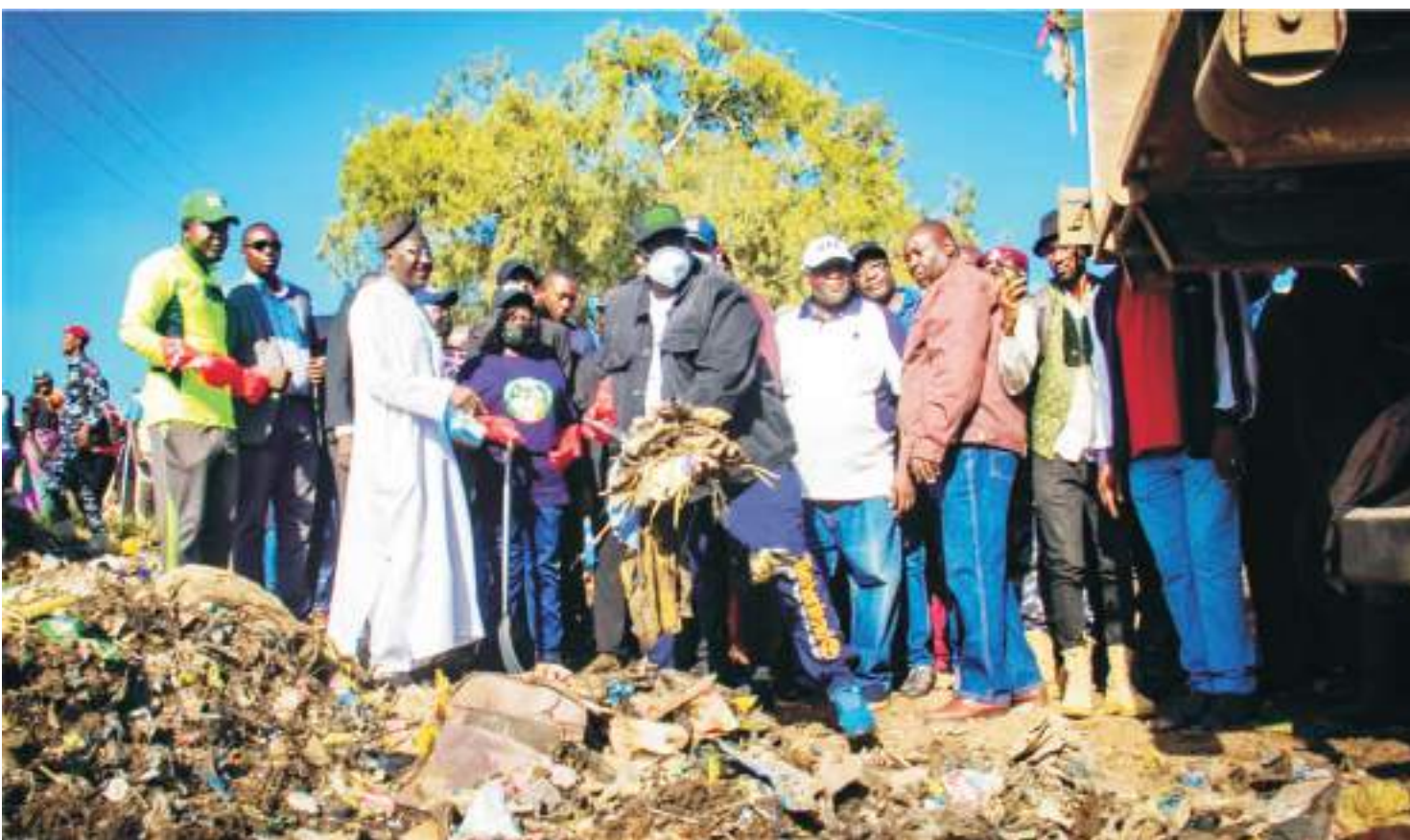
Plateau State Governor, Barr. Caleb Mutfwang flagging off the State Monthly Sanitation exercise last week Saturday in Jos, the state capital