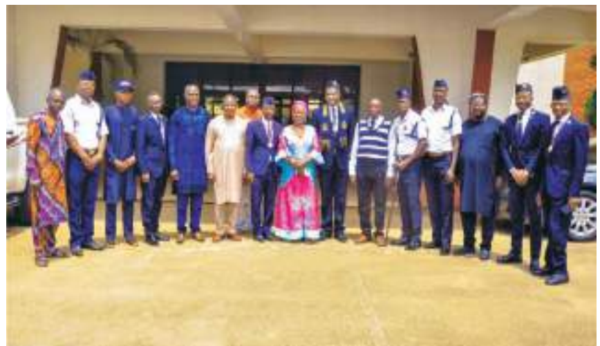
Plateau State Deputy Governor, Hon. Josephine Piyo in a group photograph with government functionaries Evangelist Lengshakka Mershaka and members of the entourage