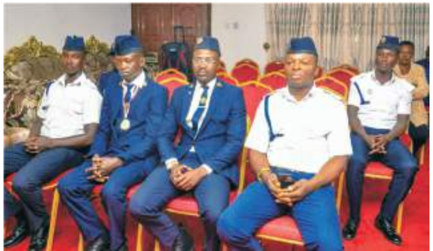
Cross section of some officers of the Boys Bridgade Nigeria, Jos North Battalion Council listening the remarks during courtesy call