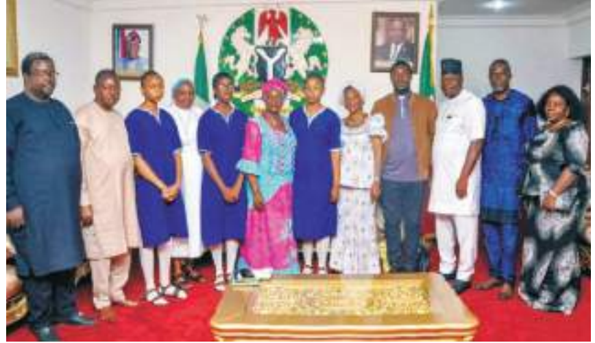
Deputy Governor, Hon. Josephine Piyo (middle) in a group photograph with some management staff of St. Louis College Jos and Government Officials