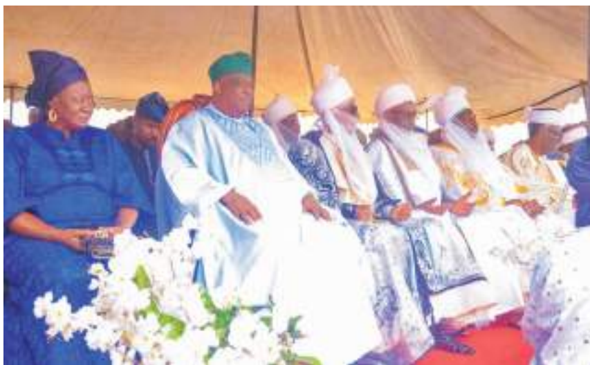
From left are, Plateau State Deputy Governor, Hon. Josephine Piyo, Governor Caleb Mutfwang, former Emir Sanusi Lamido Sanusi with other royal fathers