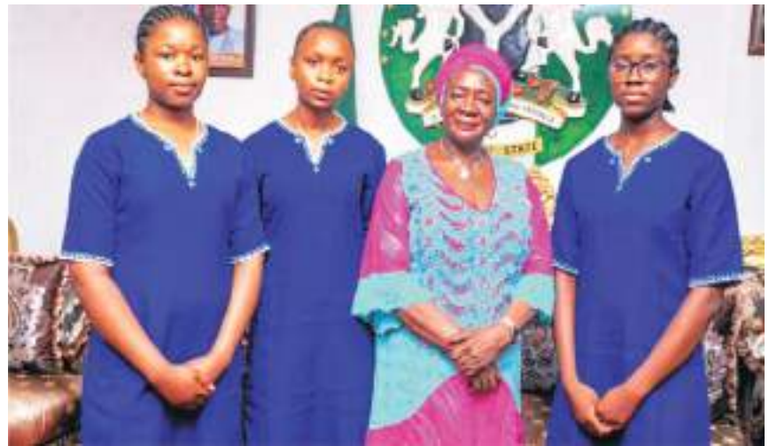
Plateau State Deputy Governor, Hon. Josephine Piyo with some students of the St. Louis College Jos in a photograph