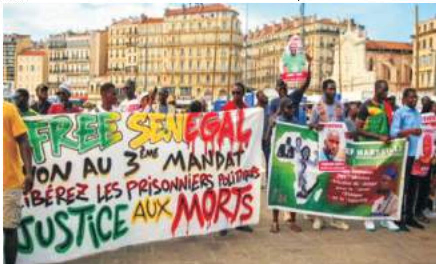
Members of the Senegalese community in France held a protest against a possible third-term bid by President Macky Sall last month

Last month, thousands of protesters took to the streets of various Senegalese cities after Sonko was sentenced to two years in prison for the crime of "corrupting youth".