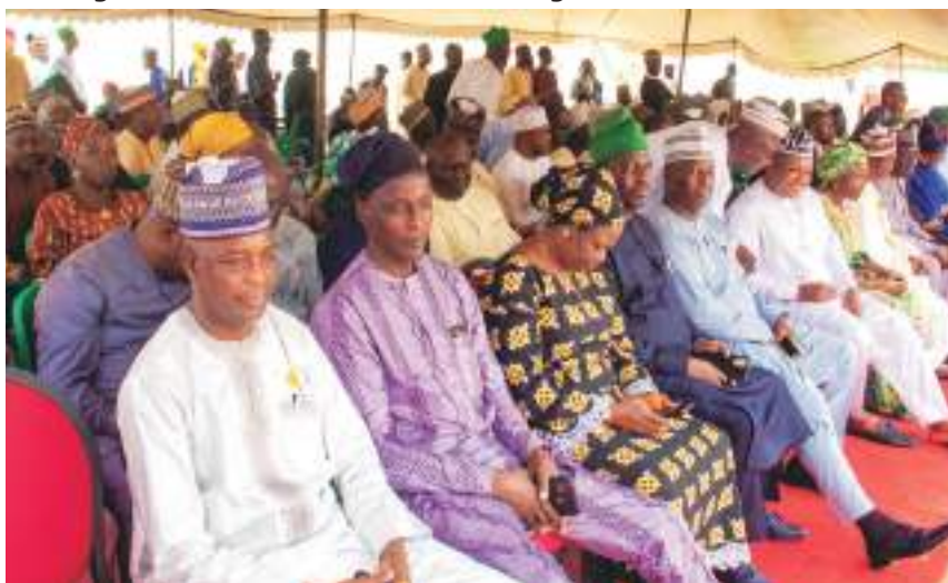
A cross section of state government functionaries during the Sallah Homage