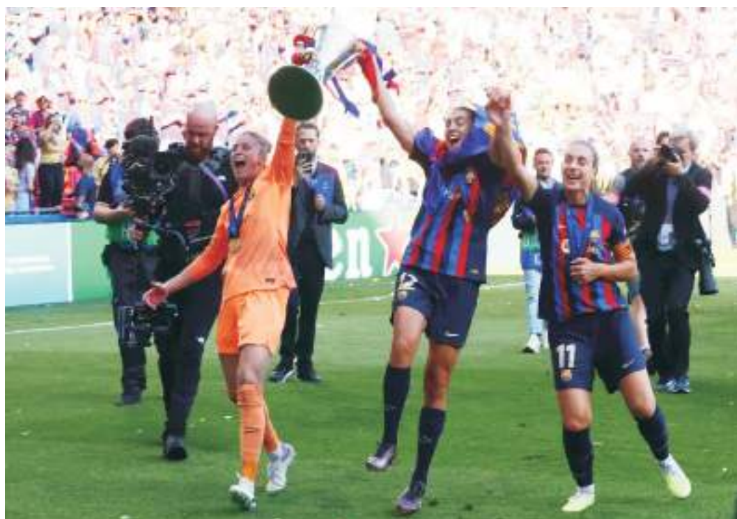
FC Barcelona's Sandra Panos, Alexia Putellas and Patricia Guijarro celebrate with the trophy after winning the Women's Champions League Final