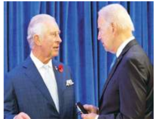
The US President will meet King Charles III in London for the first time since he was crowned King. Here Mr Biden is seen with the then Prince of Wales at the Cop26 summit in Glasgow.

On his final day, he will visit Helsinki, Finland for a US-Nordic Leaders Summit, and US, building on a series of bilateral visits and is expected to be the meetings earlier this year. Russia-Ukraine war.