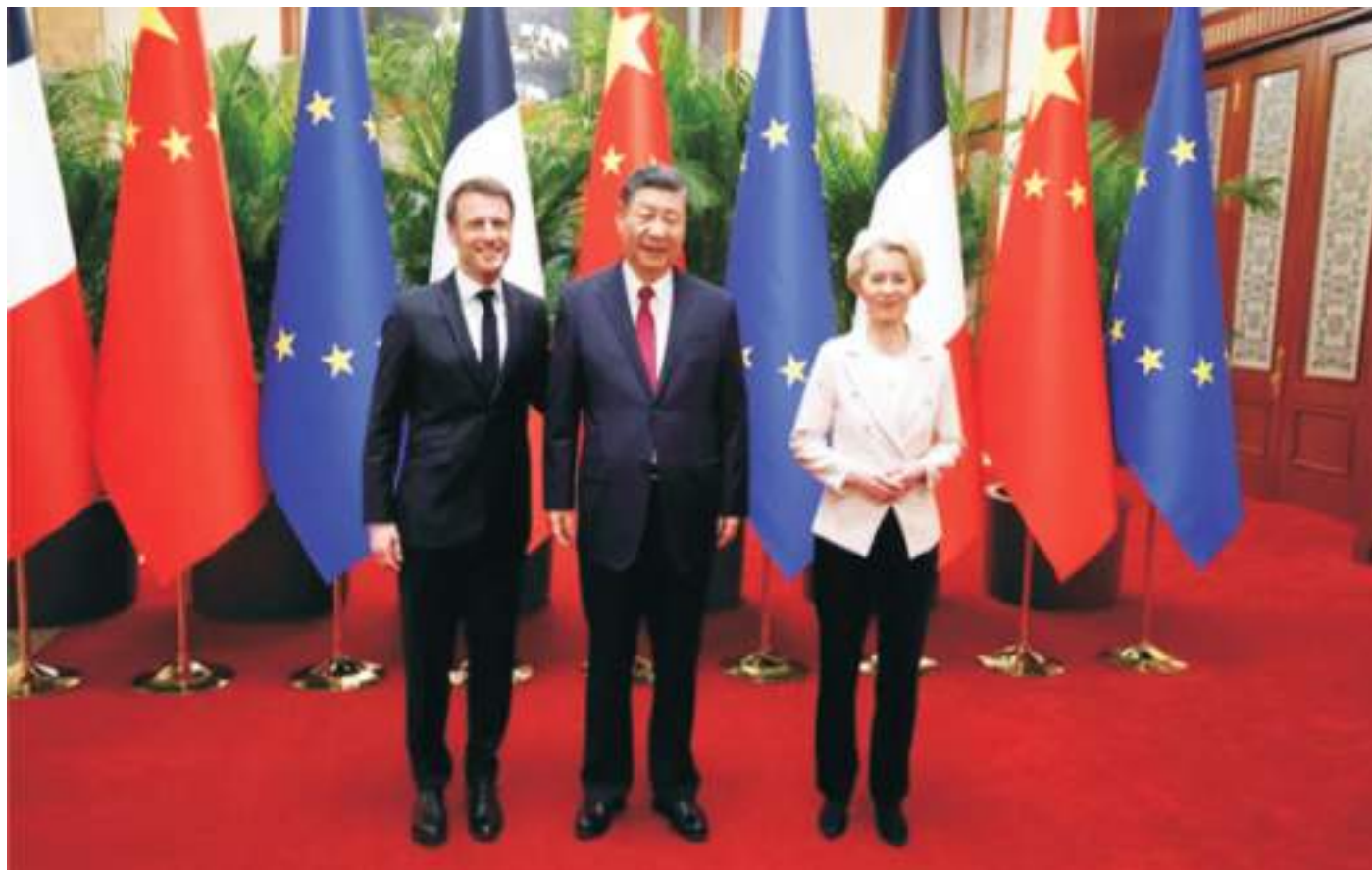
China's President Xi Jinping, his French counterpart Emmanuel Macron and European Commission President Ursula von der Leyen meet in Beijing

The EU also decided to relaunch its "dialogue over human rights" with China in February, two years after they had stalled talks on the issue, following rounds of tit-for-tat