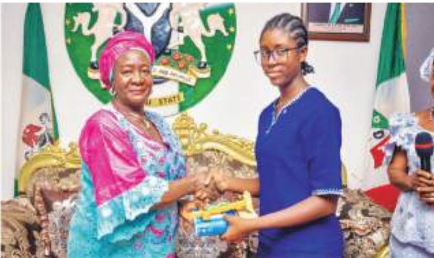
Student of the College (right) presenting souvenir to the Deputy Governor, Hon. Josephine Piyo