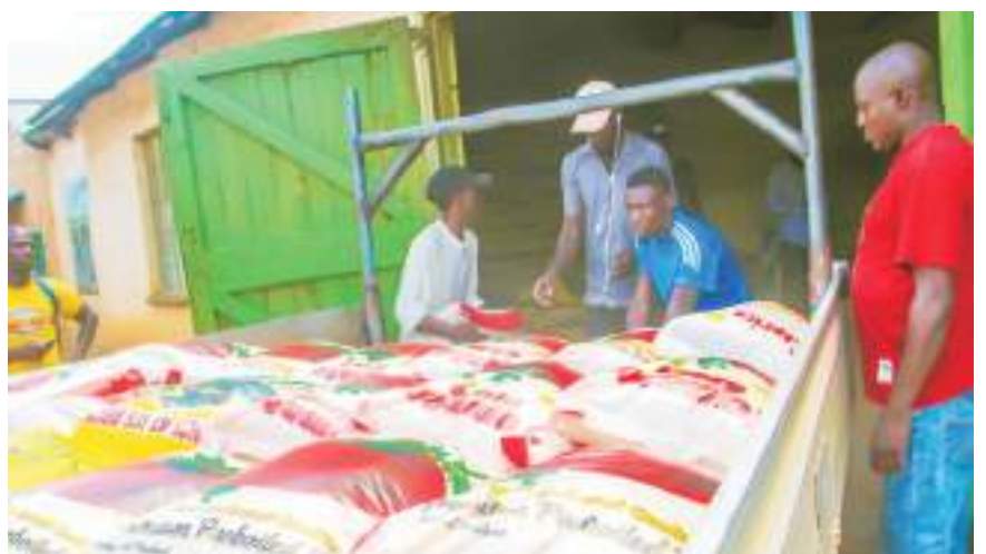
Bags of rice being off loaded at the State Government Store