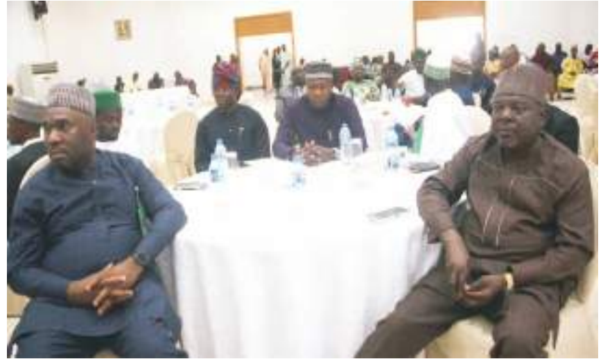
Cross section of Plateau State Executive Council at the meeting