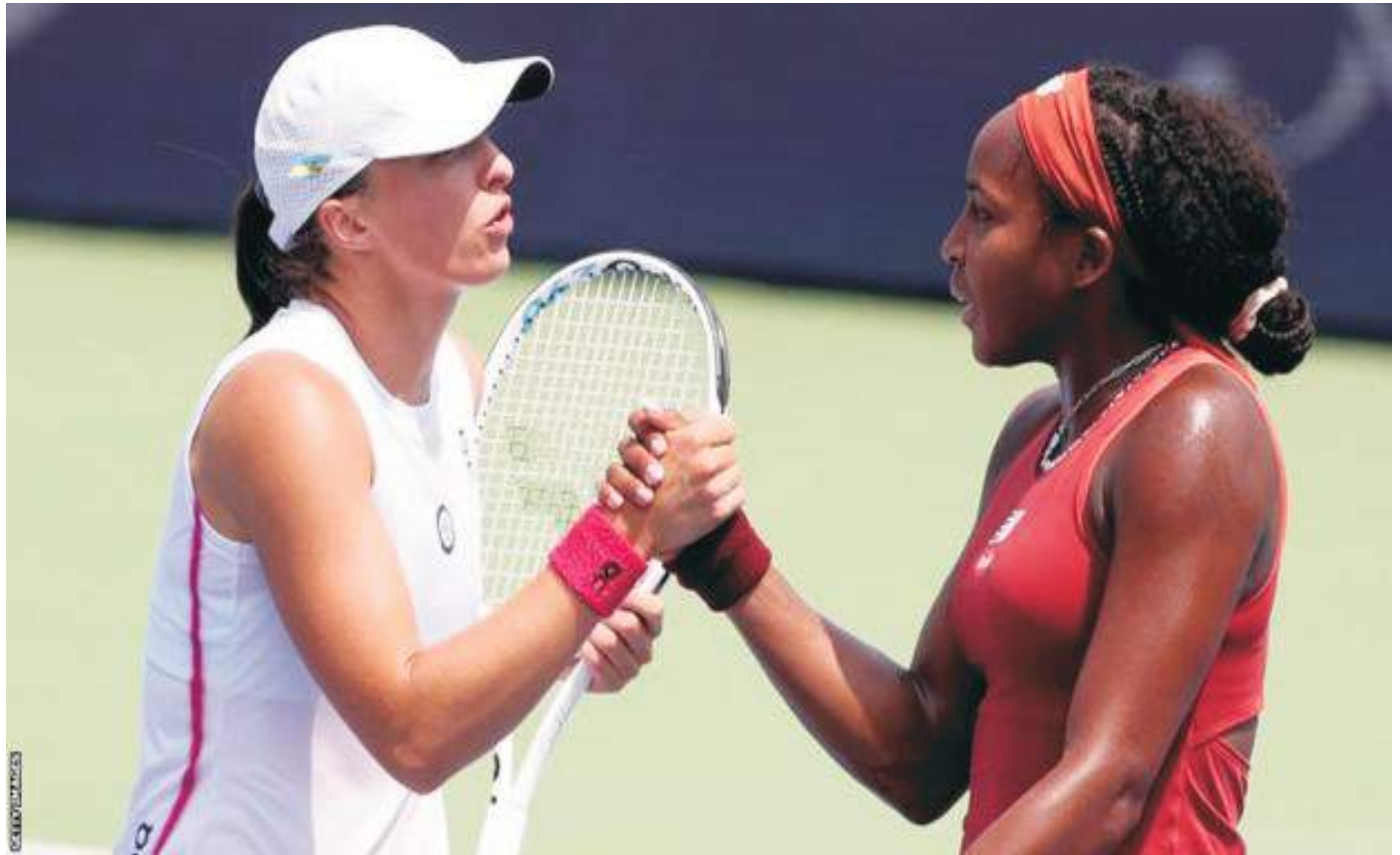
Gauff (right) beat Swiatek for the first time in their eight meetings on her way to the Cincinnati title

Alcaraz landed his first major title at Flushing Meadows in the absence of Djokovic and claimed another at Wimbledon last month, beating the Serb in a thrilling final.