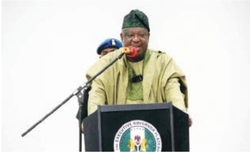
Governor Mutfwang addressing the well attended Plateau State Elders Forum

Plateau State Governor, Barr. Caleb Manasseh Mutfwang recently met with the reconstituted Plateau State Elders' Forum at the Banquet Hall, new Government House Rayfield, Jos