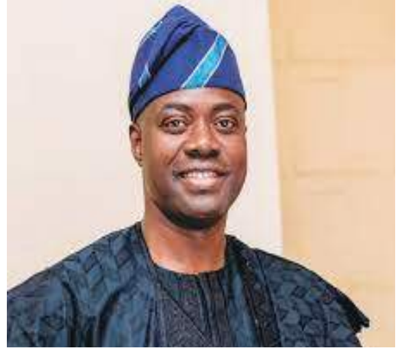
Seyi Makinde -

"As far as we are concerned in the ERC, there is no basis for hike in the accommodation fee. All halls of residence remain in the same despicable condition as they were before students were asked to proceed at the end of the session break a few weeks ago. There is neither