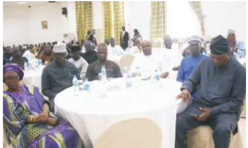
Cross section of former Secretaries to the Plateau State Government