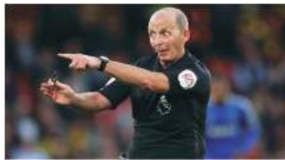
Mike Dean retired from refereeing at the end of last season after a 28-year career

a referee and I think I didn't want to send him up because I didn't want any more grief than he already had."