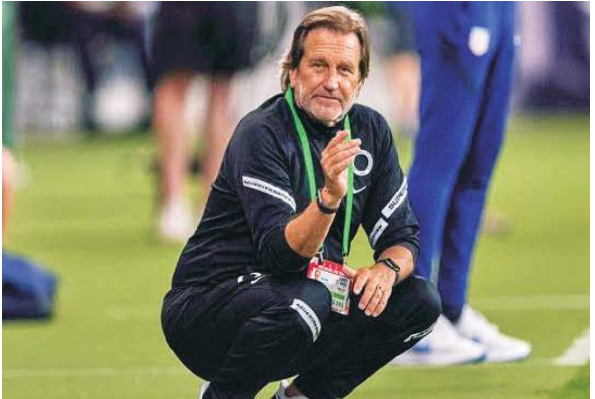
The American gaffer has questioned the latest FIFA women's world rankings as concerned the former African champions

Also, the semi-final opponent of Nigeria Women's Football