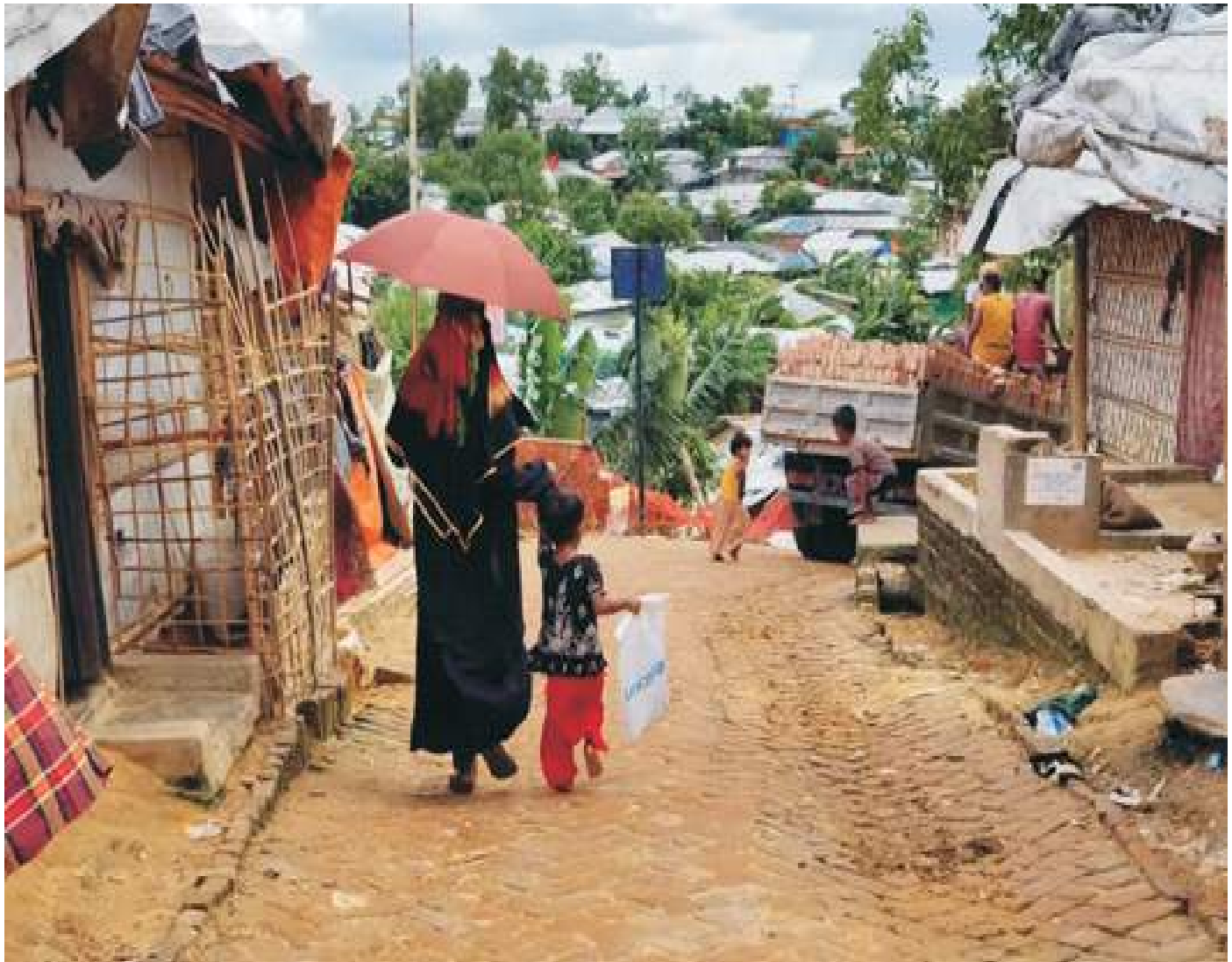
Nearly a million Rohingya refugees live in cramped camps in southern Bangladesh

The risky sea ventures to Malaysia and other Southeast Asian nations are just one of many reminders that the Rohingya refugees in Bangladesh lead a precarious existence, losing hope of safely returning to their now military-ruled homeland and being shunned by the rest of the world.