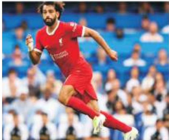
Mohamed Salah has scored one goal in two Premier League games so far this season

307 games for Liverpool and has won the Champions League, Premier League, FA Cup, League Cup, FIFA Club World Cup and Uefa Super Cup during his time at Anfield.