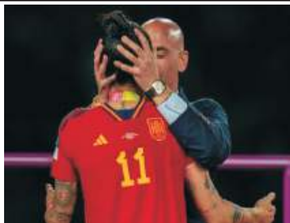
'Ego above dignity': Luis Rubiales' defiance over kiss shocks Spain

No topic is too small or too big for us to cover as we deliver