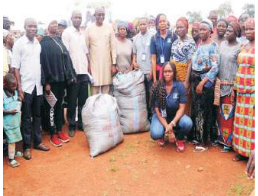
NTF extends clothing and cash aid to Mangu internally displaced persons (IDPs) camp.

Government therefore calls on the general public to disregard any social media call or link for application for the purported ₦5 billion palliatives funds.