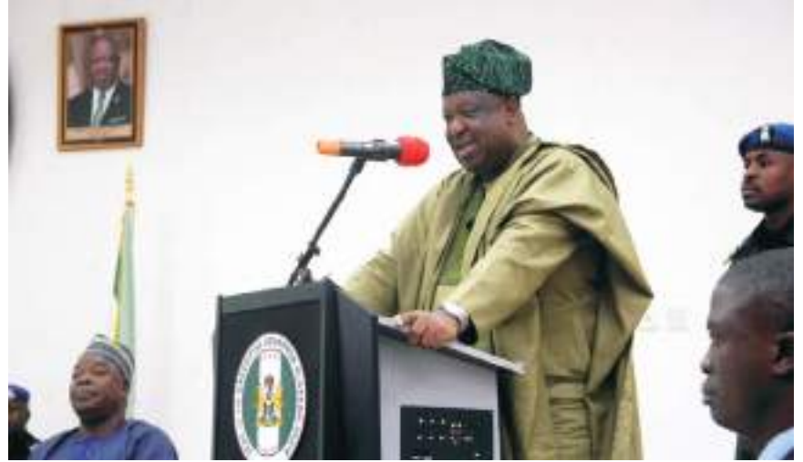
Governor Caleb Manasseh Mutfwang addressing the Elders Forum