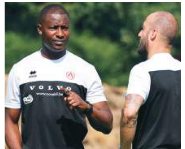
The former Nigeria international spent four years with the Blue-Blacks in his playing days

achieved significant success, amassing an impressive tally of 57 goals in 167 appearances across various competitions.