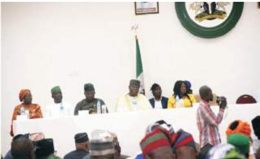
Cross section of personalities at the high table