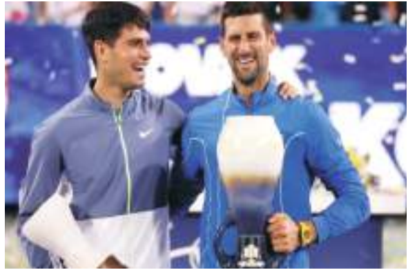
Djokovic won a record-extending 39th ATP Masters 1000 title