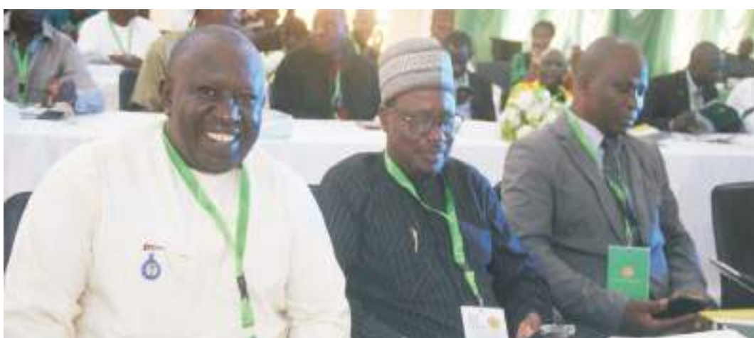
Cross section of Permanent Secretaries

from Adamawa State spoke extensively among many other speakers.