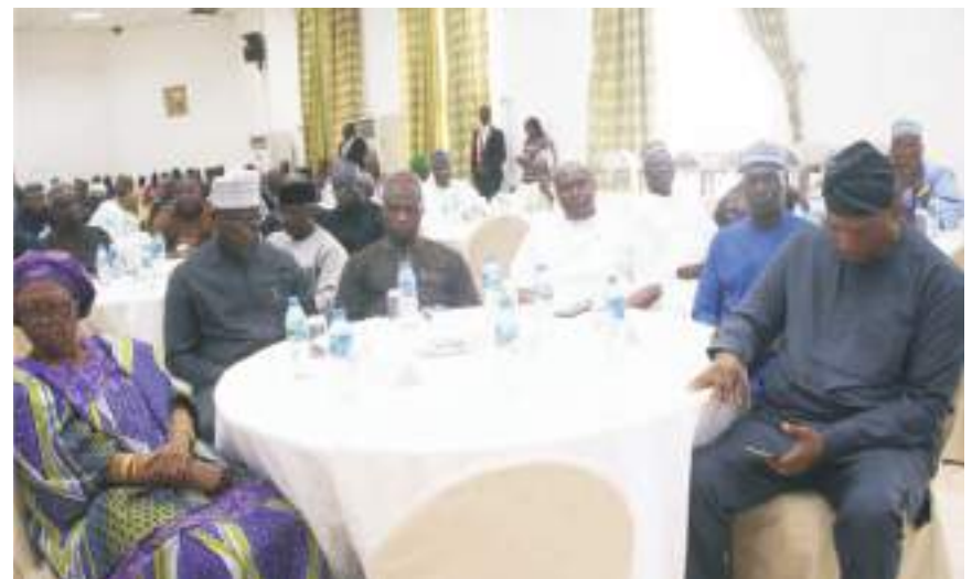
Cross section of former Secretaries to the Plateau State Government