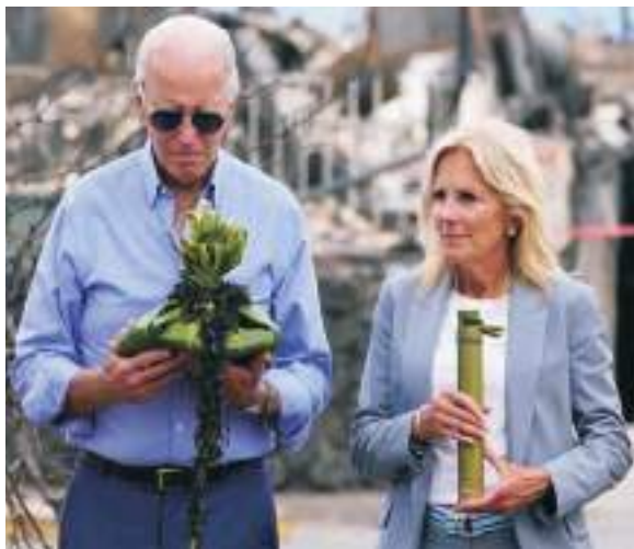
US President Joe Biden and First Lady Jill Biden participate in a blessing ceremony with elders in Lahaina, a Hawaiian community ravaged by wildfire