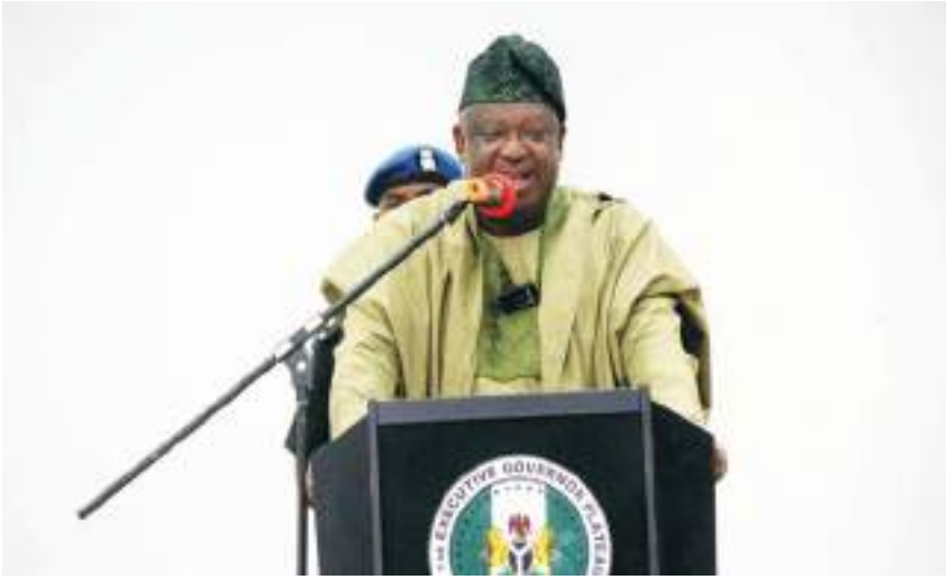
Governor Mutfwang addressing the well attended Plateau State Elders Forum

Plateau State Governor, Barr. Caleb Manasseh Mutfwang on Monday met with the reconstituted Plateau State Elders' Forum at the Banquet Hall, new Government House Rayfield, Jos