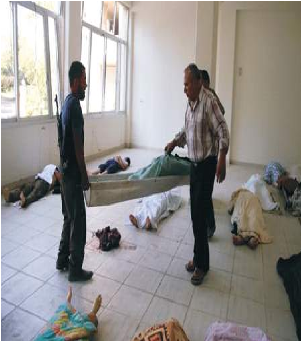
People carry the body of a civilian on a stretcher after chemical weapons attack in the Ghouta area, in the eastern suburbs of Damascus on August 21, 2013

The US and other Western powers, which initially backed the Syrian opposition's rebellion against al-Assad, quickly lost interest in pursuing any sort of diplomatic solution to the conflict through the United Nations-led