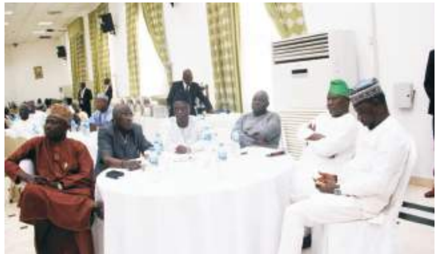
Cross section of former Speakers, PLHA at the meeting