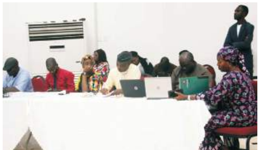
Cross section of secretariate staff, office of the Secretary to Government of the State