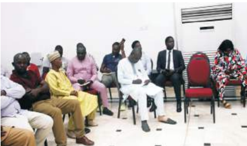
Cross section of journalists covering the opening ceremony of the meeting