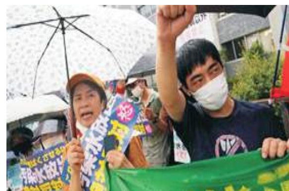
Protesters call for the water release plan to be called off in a rally outside the Japanese PM's residence in Tokyo

A crowd of protesters in Tokyo on Tuesday also staged a rally outside the prime minister's official residence, urging the government to stop the release.