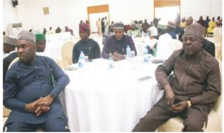
Cross section of members of Plateau State Executive Council at the meeting