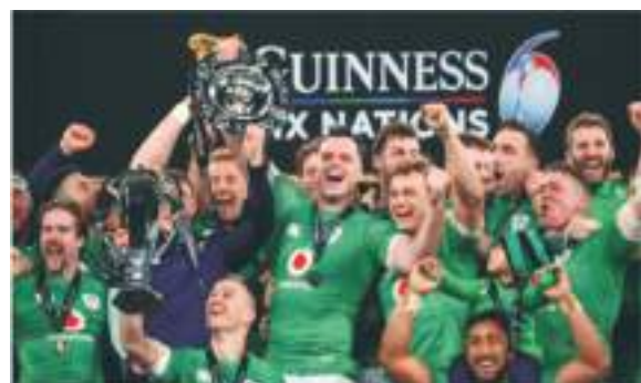
Ireland sealed a Grand Slam and the Six Nations title in March and have won their last 13 matches

Placed number one on the World Rugby rankings on the eve of the tournament and picked as our favourites (just), Andy Farrell's side are as ready as they will ever be to become only the second northern hemisphere nation to win the Webb Ellis Cup, after England's triumph in 2003.