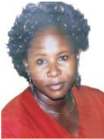
By FRANCISCA ADIDI

THERE is no doubt to the fact that every Nigerian knows that the polity is heated given the fact that the 2023 elections are at the corner and politicians are forming caucus and negotiations are going on in order to bring in good results and to also belong to the credible or profitable platforms.