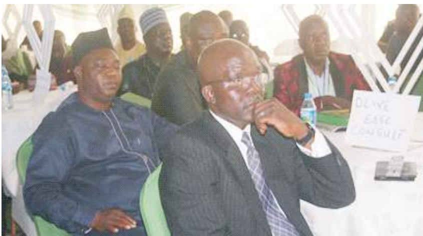
Cross section of Resource Persons at the opening ceremony