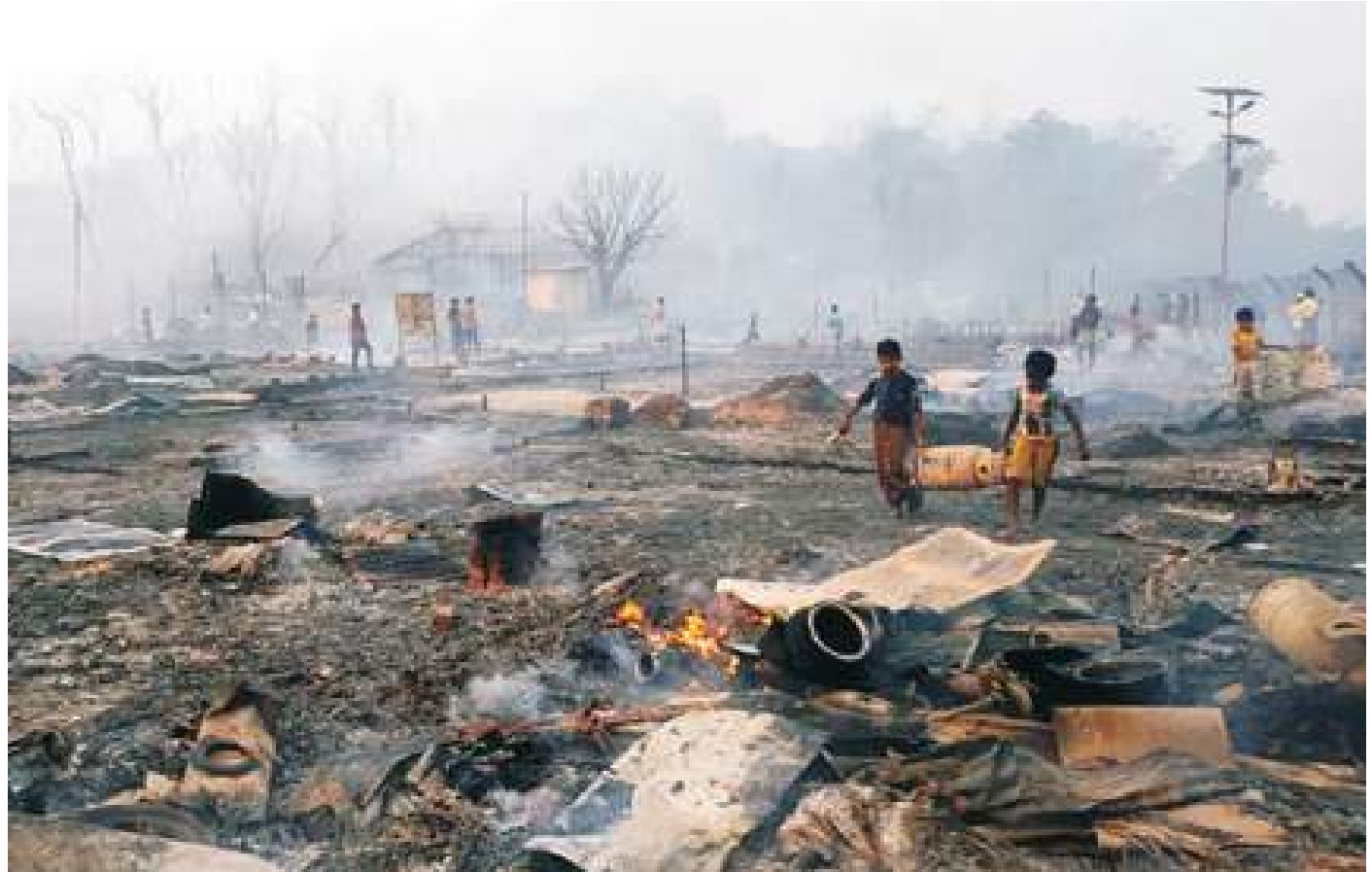
Rohingya refugee boys salvage a gas cylinder after a major fire in Balukhali camp at Ukhiya in Cox's Bazar district, Bangladesh, Sunday, March 5, 2023.

The signs of the death of human rights are omnipresent. Western governments are working hard to shield the Israeli apartheid from accountability, while criminalising Palestinians resisting Israel's oppression and those supporting their liberation struggle. The leading social media companies of the Global North are allowing dangerous misinformation targeting already marginalised and under threat populations to