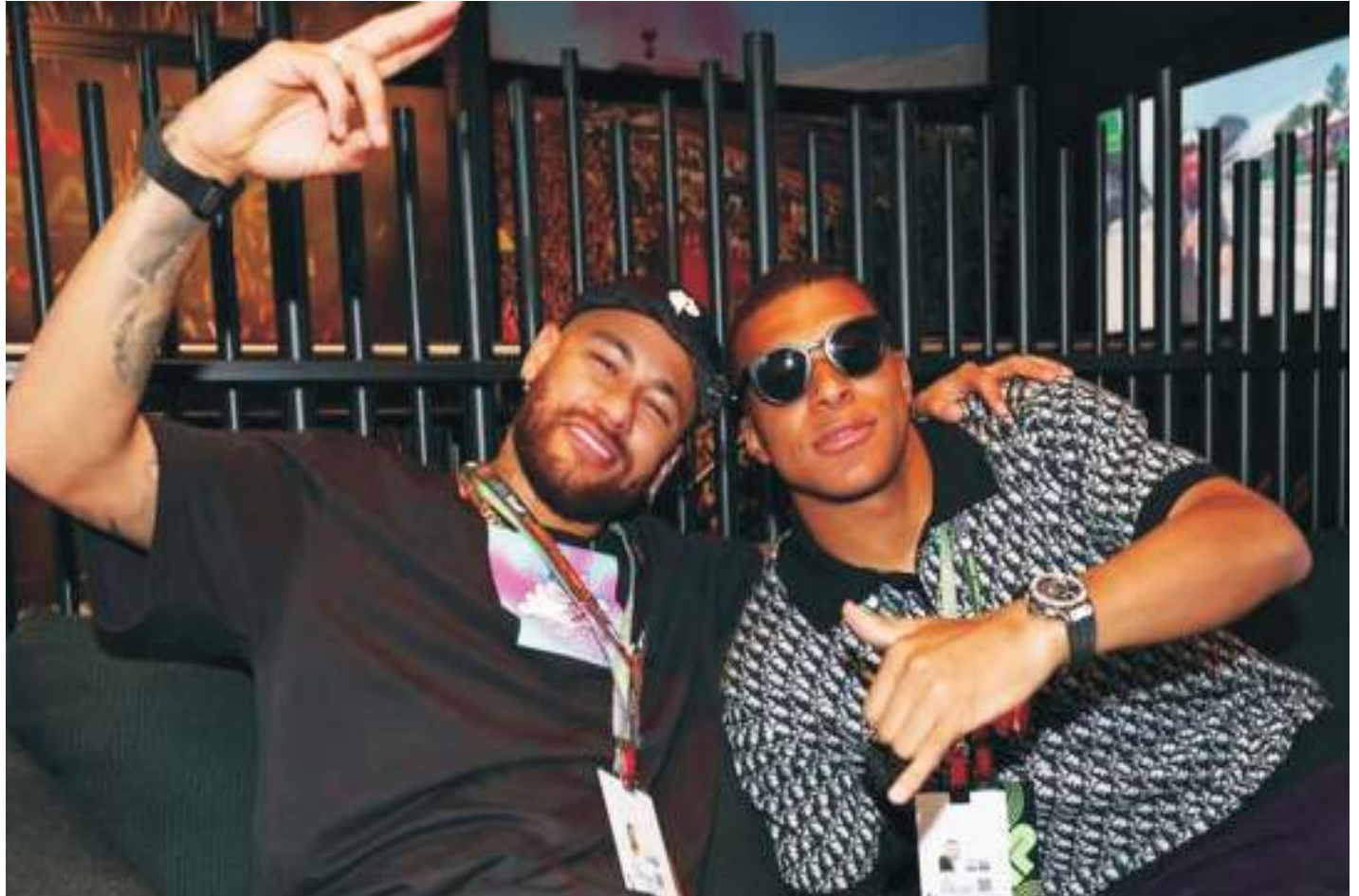
Paris St-Germain pair Neymar and Kylian Mbappe remain the two most expensive footballers ever

Next among forwards is the £107m Barcelona paid Atletico for Antoine Griezmann, also in 2019, and then Romelu Lukaku's £97.5m move from Inter Milan to Chelsea in 2021.