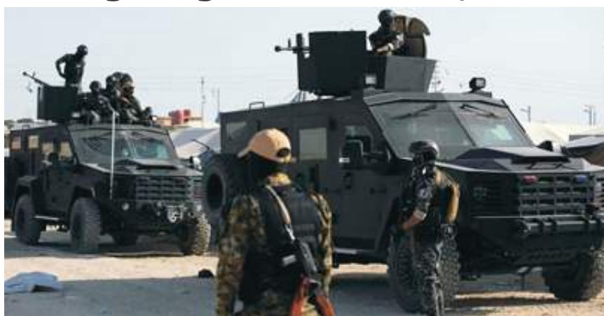
The US-backed Syrian Democratic Forces and its allies control much of north-eastern Syria

A US-led global coalition relied heavily on the SDF and its allies to drive IS militants out of tens of thousands of square kilometres of northern and eastern Syria between