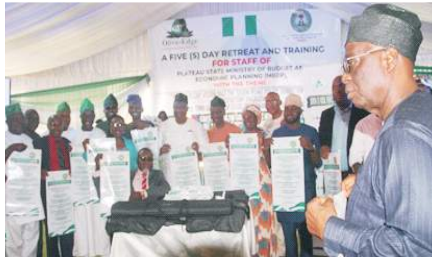
Governor Mutfwang, Commissioners, Permanent Secretaries and Chairmen Local Government Service Commission, Hon. Simon Tangni (right) displaying the 7 Point Policy Thrust on flex