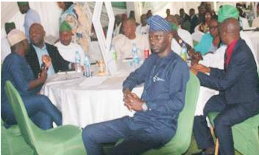
Cross section of members of the state Executive Council