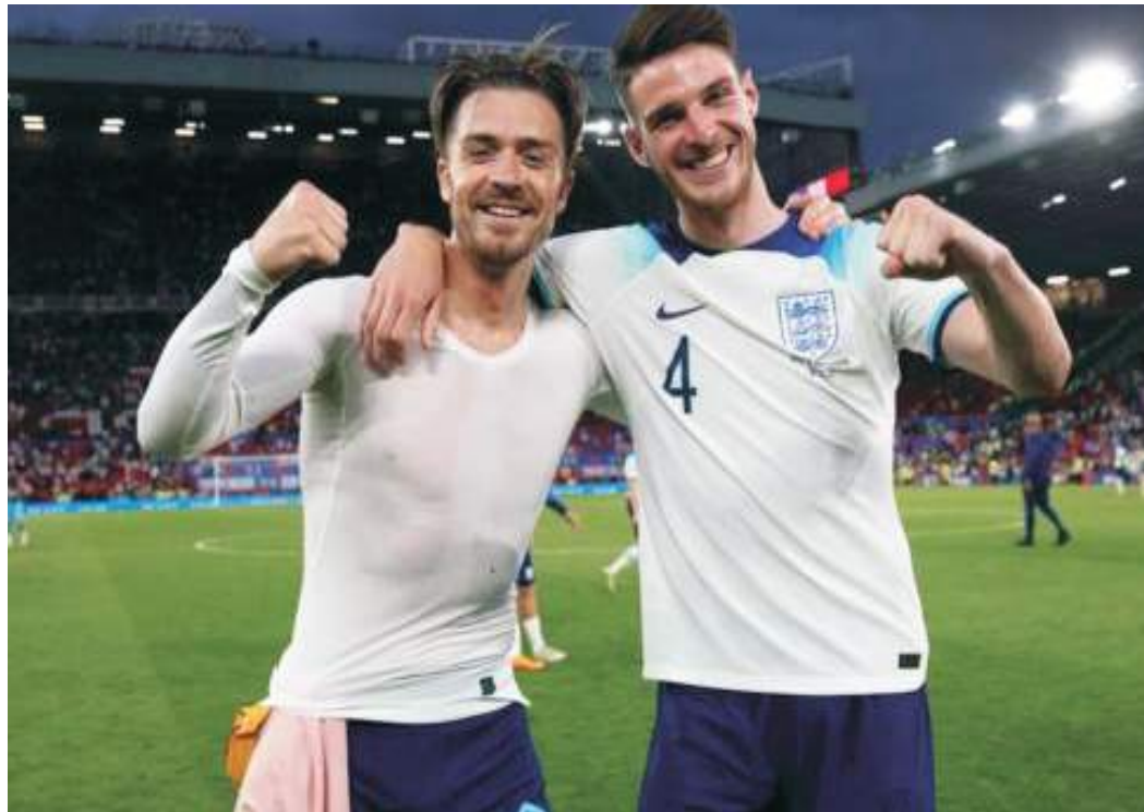
England team-mates Jack Grealish and Declan Rice are the most expensive British players of all time

Belgium's Lukaku holds a record of his own with total career transfer fees of £294.5m, having joined Chelsea twice, Everton, Manchester United and Inter.