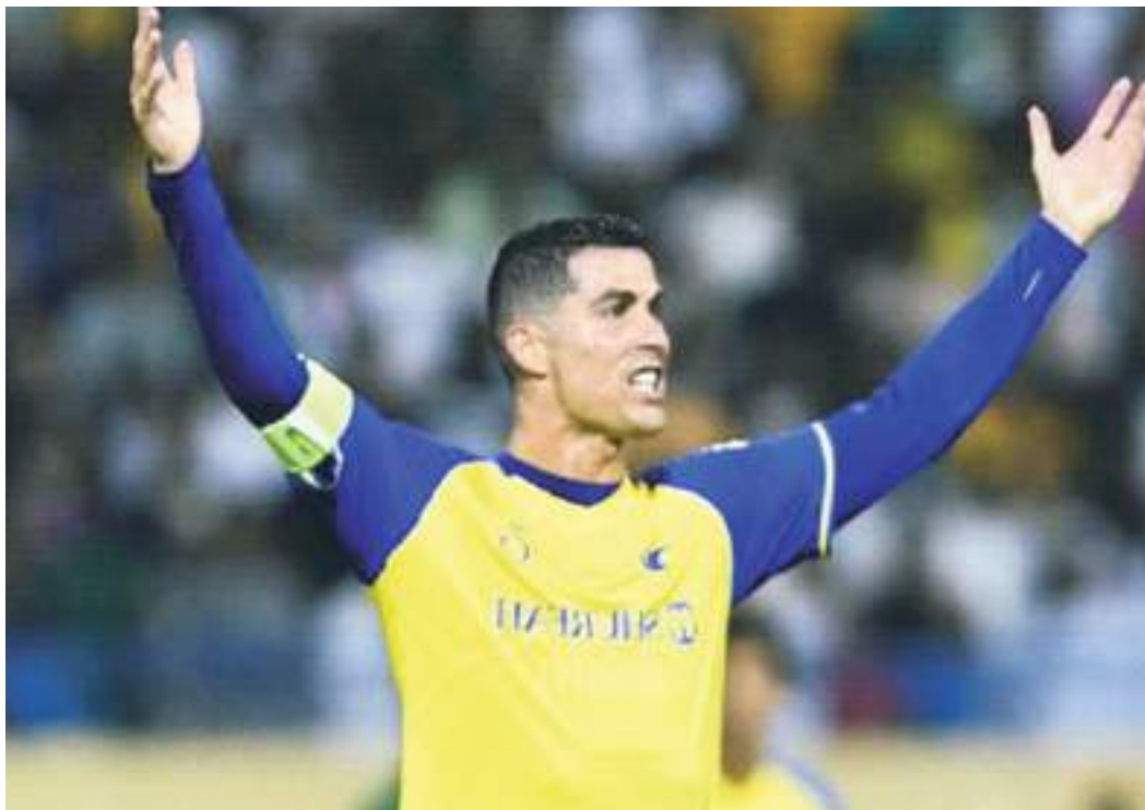
Cristiano Ronaldo was one of the only household names in the league last season