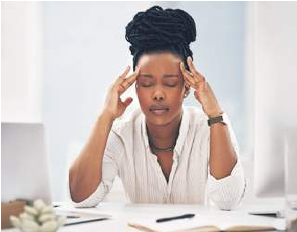
mindfulness refers to focusing on

The opposite side of the control fallacy is the idea that you can't control things you can actually control. For example, you might blame external forces, such as fate