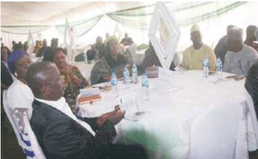
Cross section of Permanent Secretaries in the State Civil Service