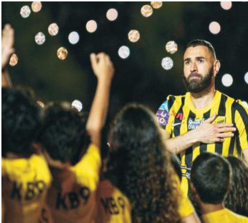
Karim Benzema is presented to Al-Ittihad fans after joining on a three-year contract

signed from Club Brugge, the 28-year-old having also spent a period last season on loan in Italy with Cremonese.