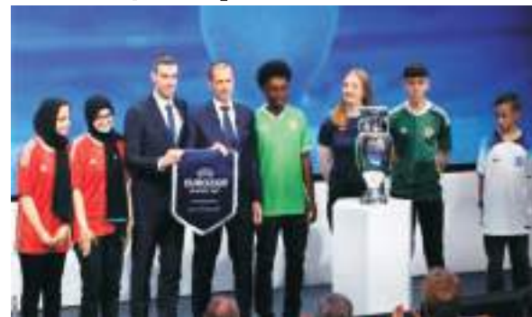
Former Wales captain Gareth Bale was present at the announcement in Nyon along with representatives from each of the host nations

Matches at Euro 2028 are set to be held at 10 different grounds, including Glasgow's Hampden Park and Dublin's