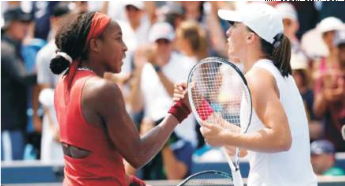
Coco Gauff is number three in the women's rankings and Swiatek is number two

In the women's race, Hassan finished one minute 53 seconds ahead of Kenya's Ruth Chepngetich, with Ethiopian Alemu Megertu in third.