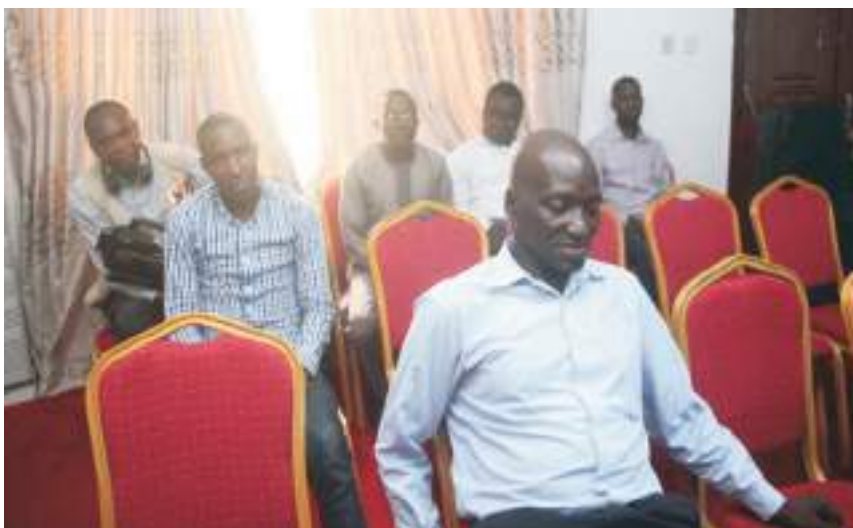
Cross section of journalists covering the visit by the first female Chairman and team