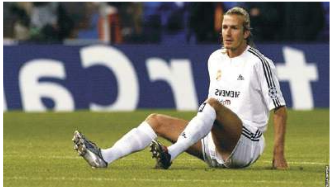
Beckham won a La Liga title in 2007 before switching to the United States with LA Galaxy

"I loved the game more than anyone has ever loved it," he smiled. "I know it's not true but I think I loved it more than anyone."