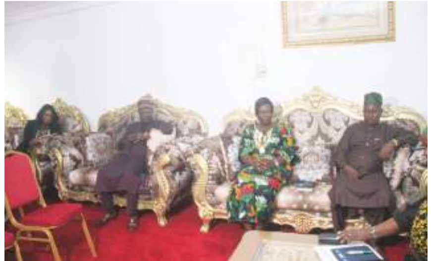
Cross section of State Government functionaries to receive the NUJ