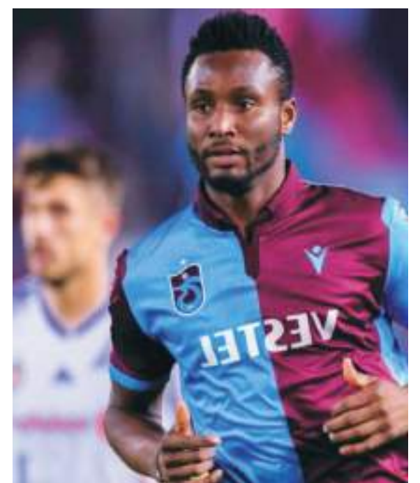
Mikel Obi left Chelsea in 2017 after spending 11 years at Stamford Bridge

Meanwhile, Napoli might need to consider selling him to avoid losing him on a free transfer or for a reduced fee.