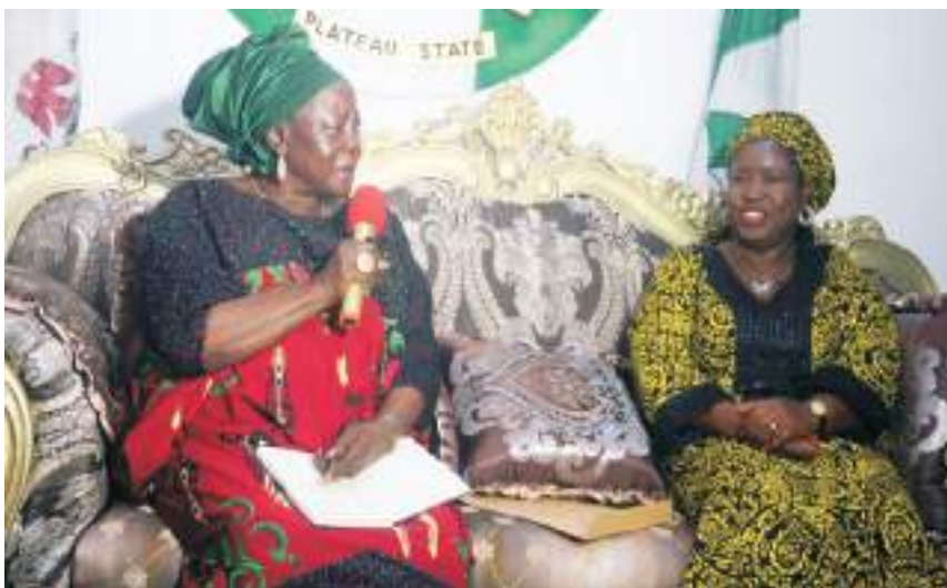
Representative of Governor Mutfwang ( left ) responding