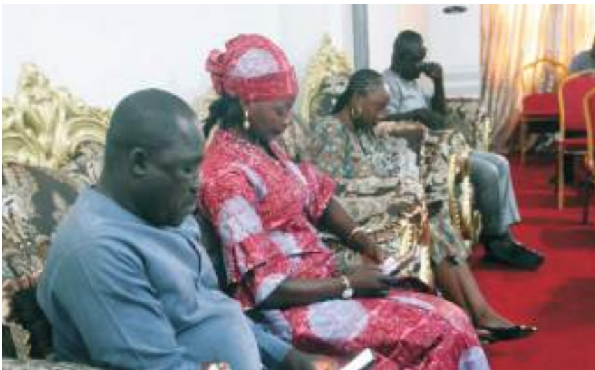
Cross section of the NUJ state executive council during the visit