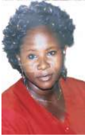
By FRANCISCA ADIDI

THE Federal Government has admitted Nigeria's status as the poverty capital of the world when it disclosed that 133 millions of its citizens are currently living in poverty. In its latest National Multidimensional Poverty index reports unveiled recently, National Bureau of Statistics revealed that 63 percent of Nigerians are poor due to lack of health, education and living standards alongside unemployment and shocks.