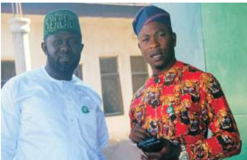
Hon. Sani Shillak and Hon. Gabriel K. Dewan at the premises of the state Assembly