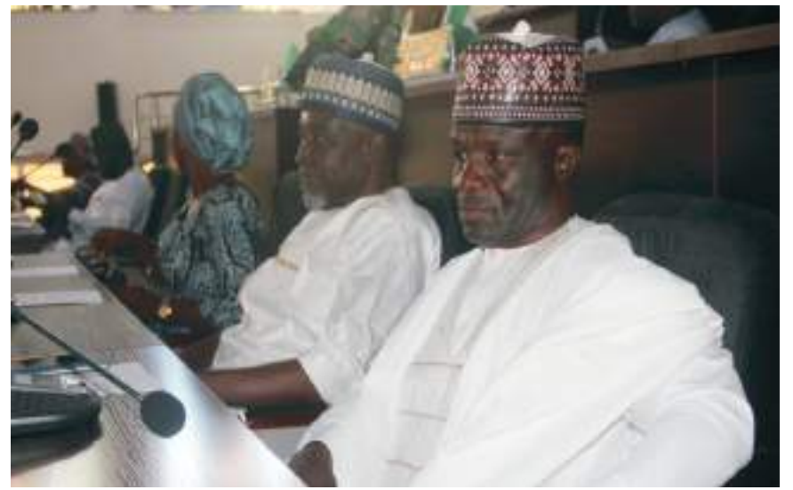
Cross section of members of the State Assembly