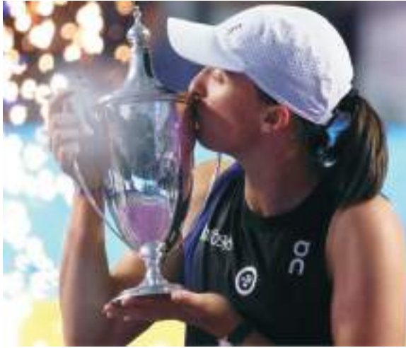
Swiatek is a three-time French open champion

In 2022, she recorded a remarkable 37 straight wins and six successive titles, asserting herself as the top-ranked women's player - where she would remain for 75 weeks until Sabalenka replaced her in September this year.