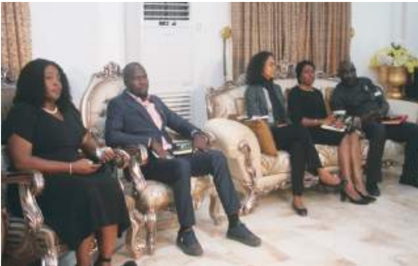
Cross section of members of the delegation