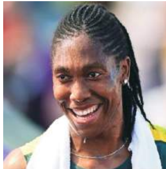
Semenya won Olympic 800m gold in 2012 and 2016

Hyperandrogenism is a medical condition characterised by higher than