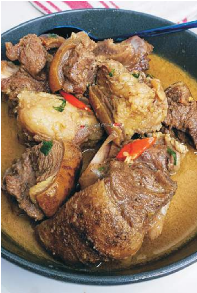
Goat pepper soup

loss. Some may have reservations about this delicious food, but it is very healthy. Okro contains fibre, antioxidants, vitamins C and K, and folate.