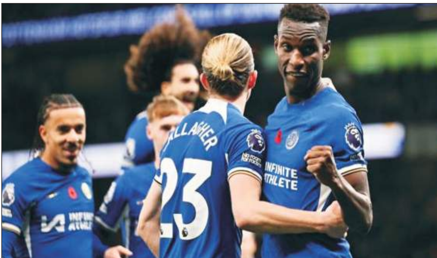
Chelsea have now won three of their last five Premier League games

Nobody has ever suggested managing Spurs is as easy as Postecoglou has made it look, and this almost surreal night delivered compelling proof.