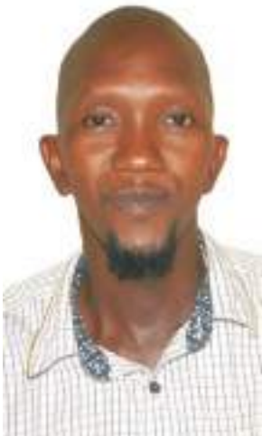
By EZEKIEL DONTINNA

OVER the years, people have been nursing the belief that whatever is medically reported as a result of diagnosis especially from a hospital, it is considered 100% certified and accurate and can perfectly be accepted for its treatment by any lifesaving agency. This belief has been in practice for decades because before now, Nigeria's Health System was next to world standard with well trained personnel that handled severe health cases without any referral cases to other hospitals abroad.