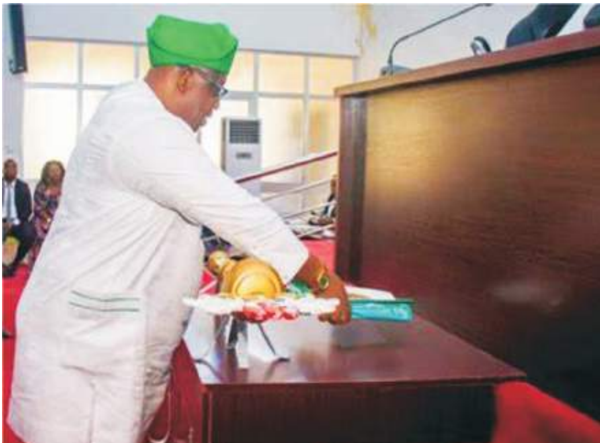
Plateau State Governor, Barr Caleb Manasseh Mutfwang yesterday laying the 2024 Appropriation Budget at the chamber of the Plateau State House of Assembly.