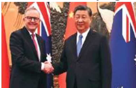
Australian PM Albanese hails progress with China after Xi talks Albanese (left) - seen with Xi in the Great Hall of the People - is the first Australian leader to visit China since 2016

Ahead of their talks, Mr Albanese had told reporters: "We need to co-operate with