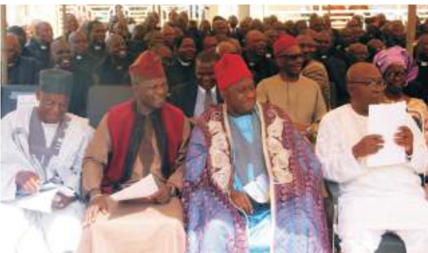
Cross section of royal fathers witnessing the ceremony