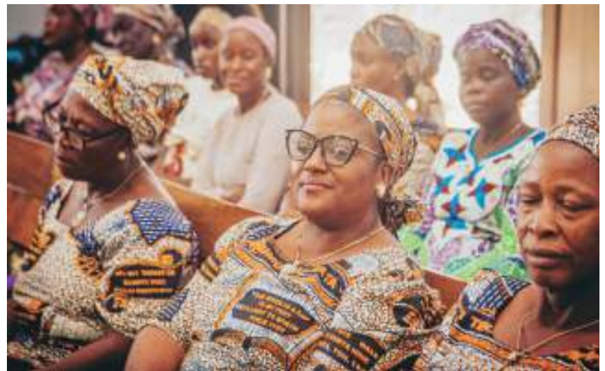
Some TEKAN Women Fellowship listening keenly