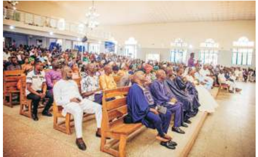
Cross section of members of COCIN LCC Nyanya