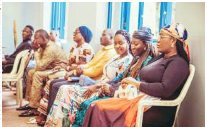
Cross section of COCIN LCC Nyanya members at the service