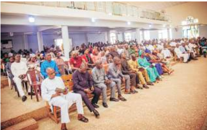
Cross section of worshippers at the service