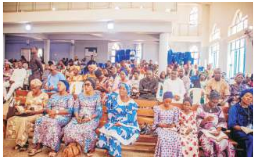
COCIN Women Fellowship during the service