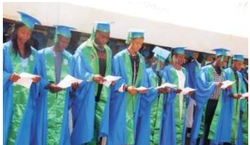
Cross section of pioneer students of KKU taking the oath of the University being administered by the Institution's Registrar