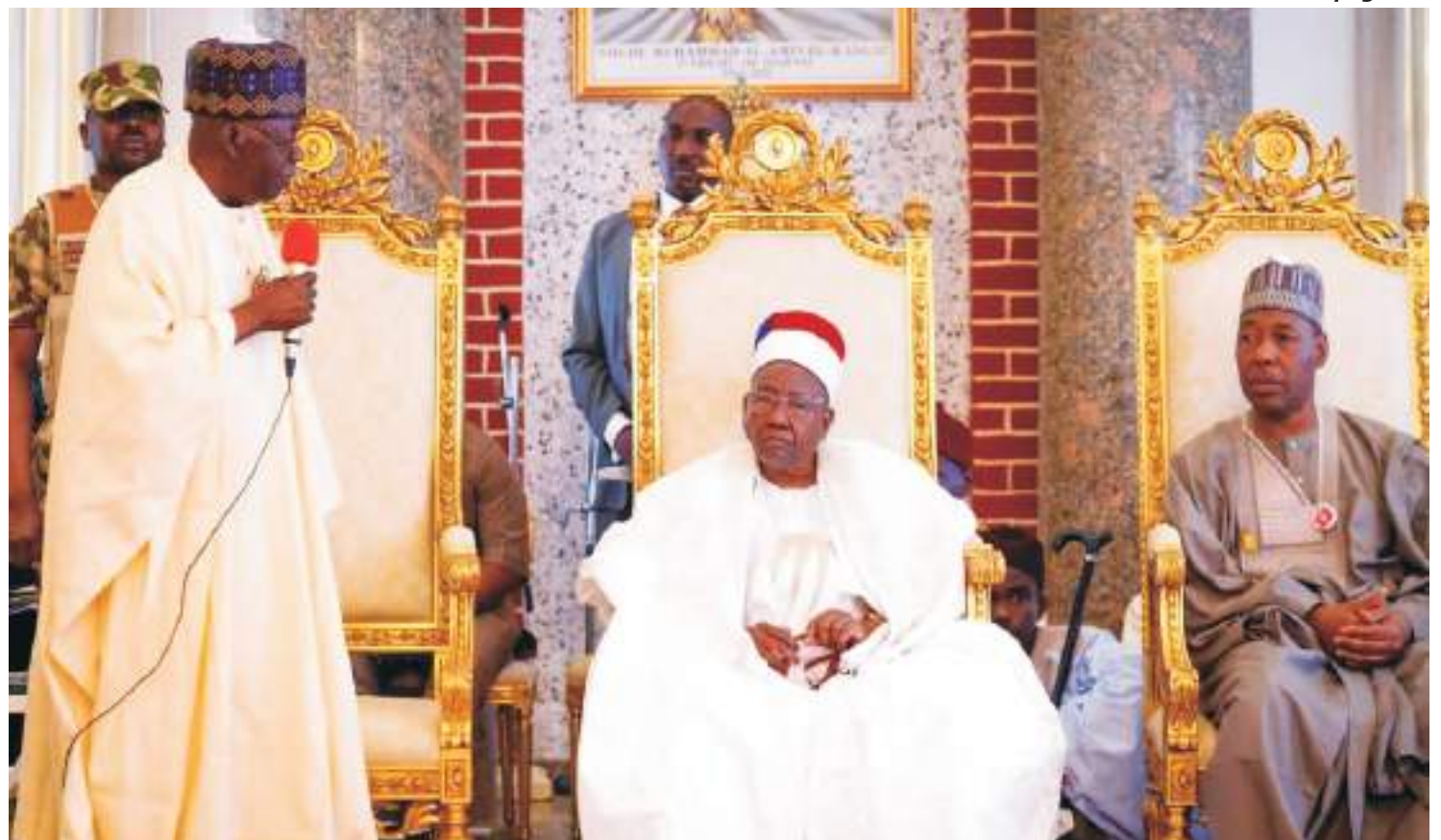
Continued to page 1 Tinubu visits Maiduguri, grieves over Kaduna bomb victims at Shehu's Palace

Declaring this during a Sunday church service held at the Church Of Christ in Nations( COCIN), LCC Nyanya, the Governor