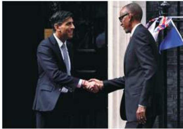
British Prime Minister Rishi Sunak, left, meets Rwandan President Paul Kagame at Downing Street in London

While Sunak has denied that Tuesday's crunch is essentially a vote of confidence in his premiership, he is spending the