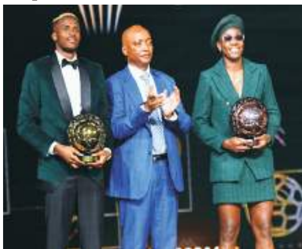
Osimhen wins first CAF African Player of the Year award in the men's category while Asisat Oshoala extends a record sixth CAF African Women's Player of the Year Award

Senegal's Lamine Camara, the 19-year-old FC Metz forward, clinched the CAF Young Player of the Year award, marking his meteoric