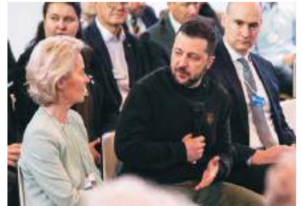
Ukrainian President Volodymyr Zelenskyy speaks with European Commission President Ursula von der Leyen (L) at the World Economic Forum in Davos, Switzerland, January 16, 2024

The Ukrainian leader, who had addressed the Switzerland forum by video link in the past two years, showed up in person, as he faces increasing war fatigue in EU capitals and the US.