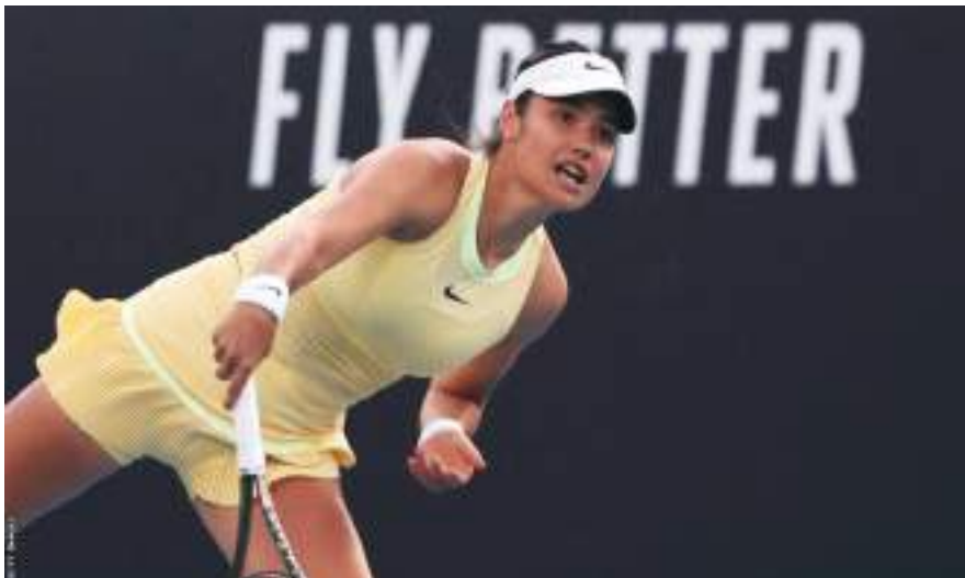
Raducanu has won in the first round of the Australian Open on all three of her appearances at Melbourne Park