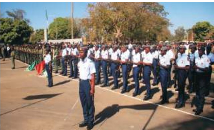
Cross section of Nigerian Army/Air Force inspected by Governor Caleb Manasseh Mutfwang of Plateau State