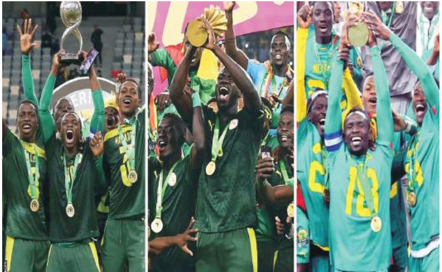
Senegal followed up their 2021 Africa Cup of Nations title (centre) with successes at the Under-17 Afcon and CHAN finals last year

"At grassroots level, we have a very broad base and we're