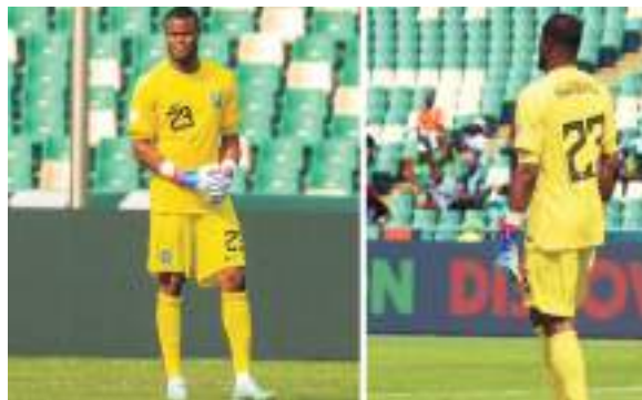
Stanley Nwabali made his debut for the Super Eagles in their 2023 Africa Cup of Nations clash against Equatorial Guinea