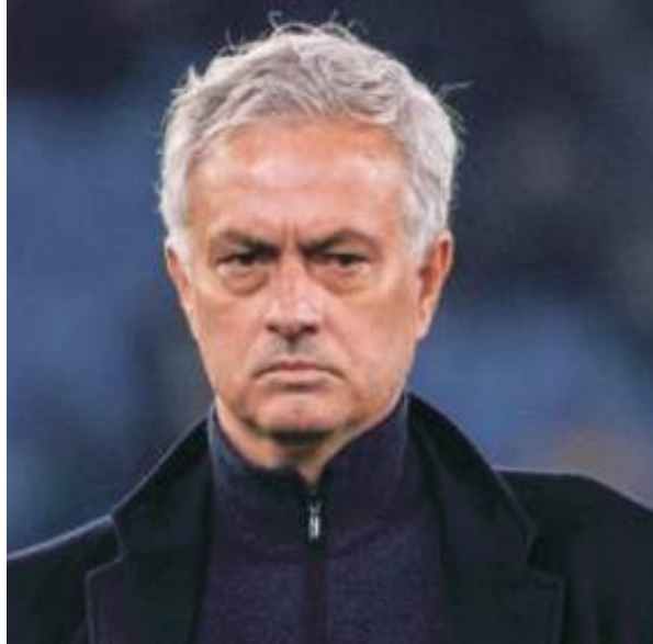
Jose Mourinho took over at Roma following his departure from Tottenham

Conference League secured Roma's first major European title and earned Mourinho huge support among the club's fanbase.