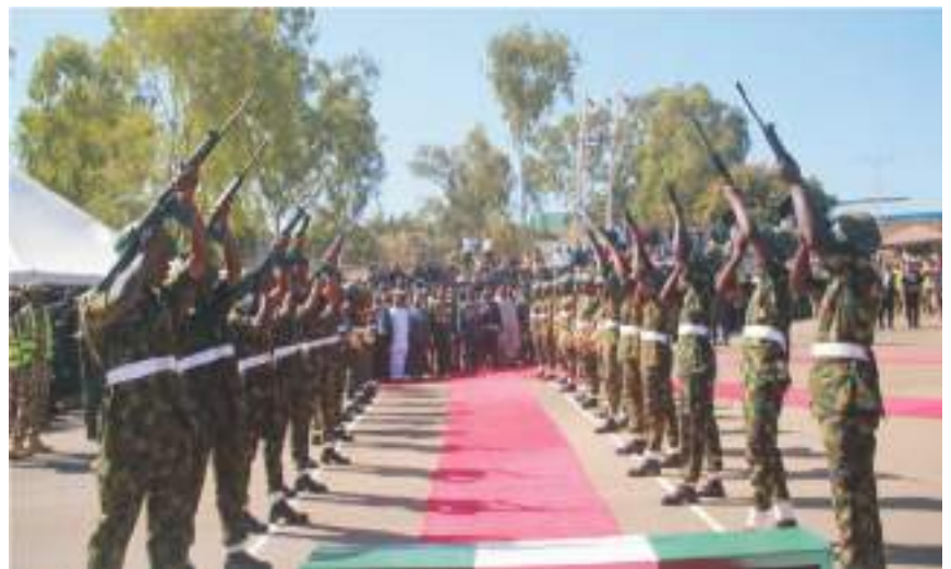
Gun salute (reveille) by the Army and NAF in honour of Fallen and Living Heroes