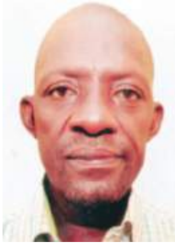
By VICTOR ALI

LAST year, 2023, has come and gone with all its multi-colored memories to remember. One of the fondest of such memories was the fact that virtually all Nigerians, perhaps, with the exception of the "big men" and of course "big women", used their national currency, the naira to buy again their national currency.