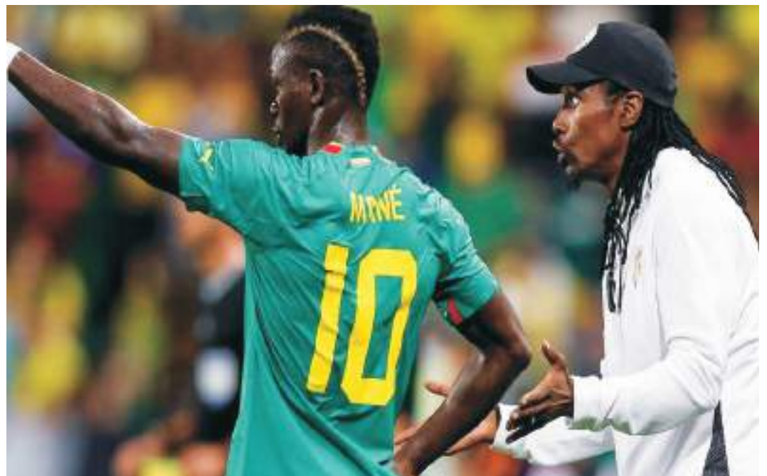
Senegal beat five-time world champions Brazil 4-2 in a friendly in June last year, with Sadio Mane scoring twice

"Winning the Afcon will [have] a big impact for our football because we have won all the other categories, which is great for the country."