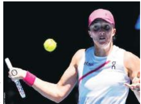
Swiatek has won four Grand Slam titles but has never been beyond the Australian Open semi-finals

"I was a little bit off and Sofia did everything to keep it that way. She's won here so knows what it takes. Huge respect to her."