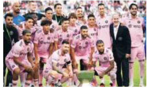
Lionel Messi (front row) helped Inter Miami beat Nashville SC to win the Leagues Cup in the United States

season. In all competitions in 2022-23, he scored a club-record 52 goals - with 28 of them coming after the World Cup, plus another two goals this season before 20 August.