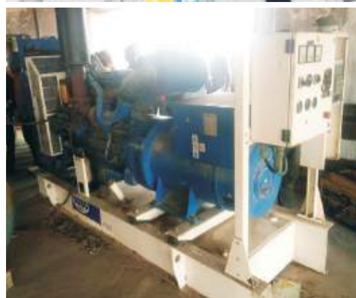
Bokkos treatment plant