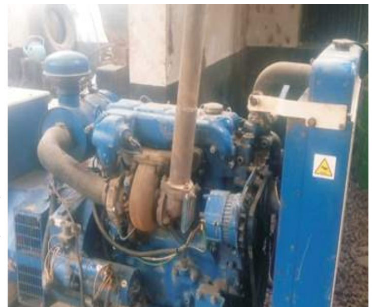
Wase treatment plant

Hon. Mohammed also called on his people to protect the water treatment plant, adding that the