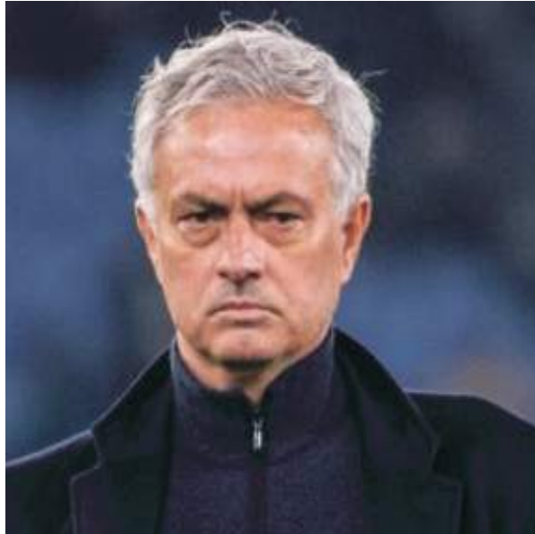
Jose Mourinho took over at Roma following his departure from Tottenham

Conference League secured Roma's first major European title and earned Mourinho huge support among the club's fanbase.