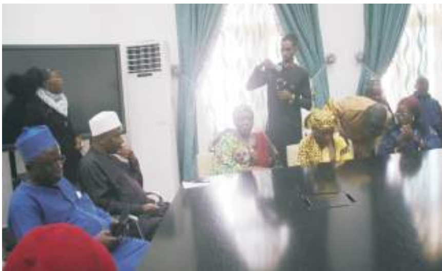
State Accountant General, Permanent Secretary, Finance, Commissioner of Finance with other RMAFC members from Abuja