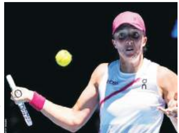
Swiatek has won four Grand Slam titles but has never been beyond the Australian Open semi-finals

"I was a little bit off and Sofia did everything to keep it that way. She's won here so knows what it takes. Huge respect to her."