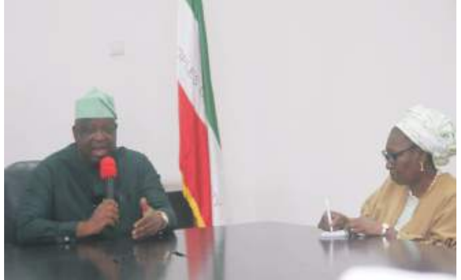
Governor Mutfwang responding to the message from RMAFC, while the Vice chairperson taking notes