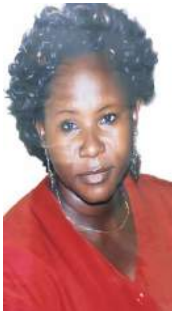
BY FRANCISCA ADIDI