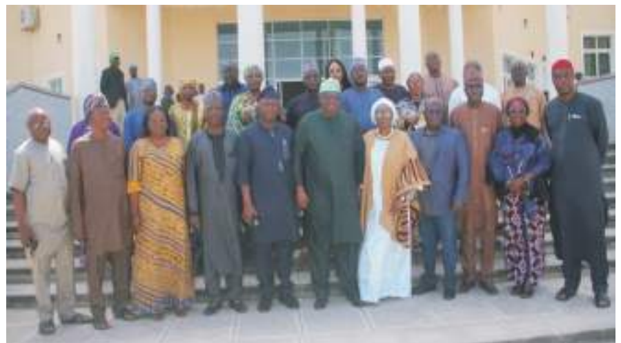
Plateau State Governor, Barr. Caleb Manasseh Mutfwang (middle) with his Commissioners and team from RMAFC, Abuja