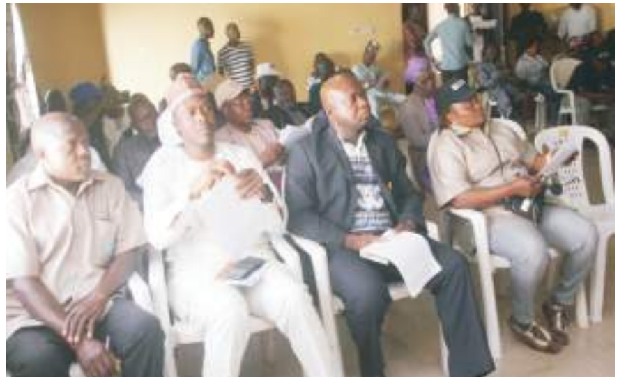
JUPTI members listening to the speech being presented