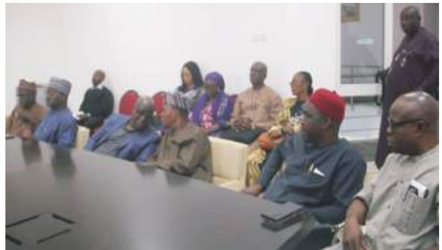
Cross section of RMAFC members