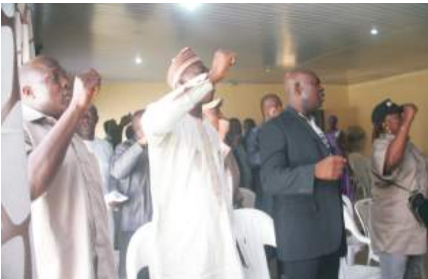
Cross section of JUPTI members singing solidarity songs at the Press Conference