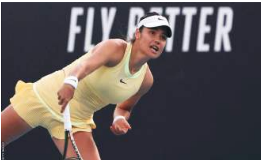
Raducanu has won in the first round of the Australian Open on all three of her appearances at Melbourne Park