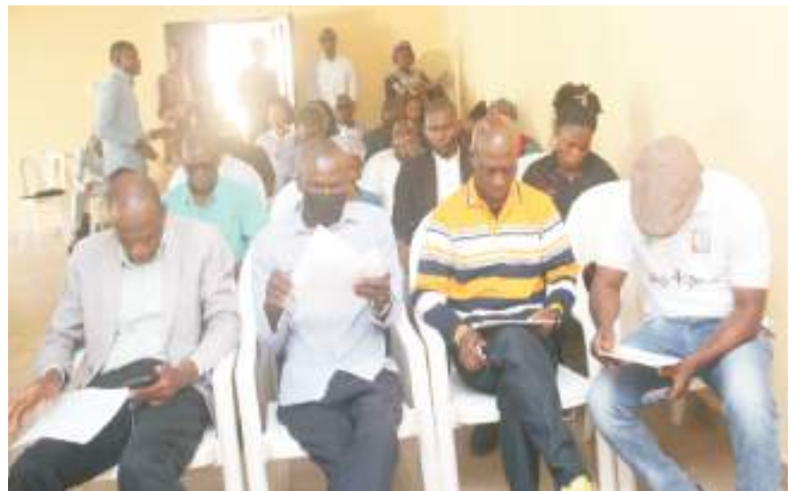
A cross section of newsmen covering the Press Conference