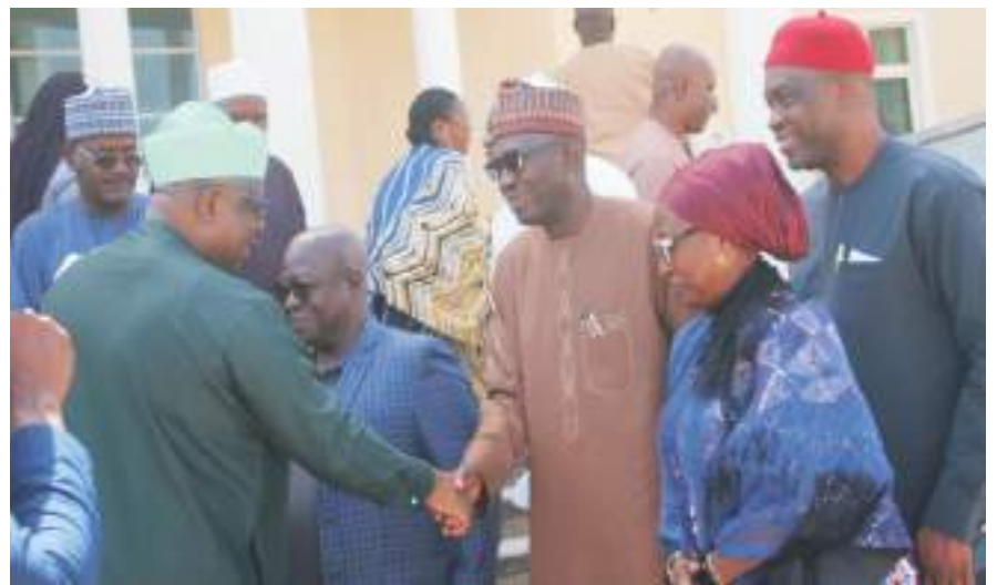
Governor Mutfwang exchanging greetings with Plateau State representative at RMAFC and others