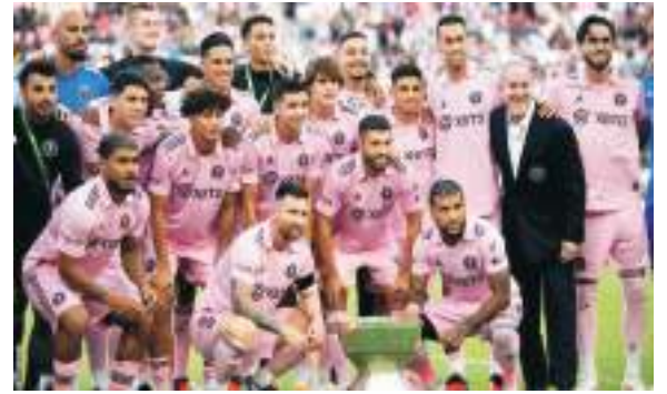
Lionel Messi (front row) helped Inter Miami beat Nashville SC to win the Leagues Cup in the United States

season. In all competitions in 2022-23, he scored a club-record 52 goals - with 28 of them coming after the World Cup, plus another two goals this season before 20 August.