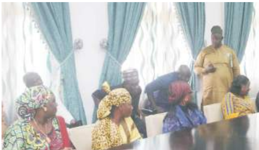
Secretary to the State Government (right) flanked by the CoS Government House, Head of Service, Commissioner of Finance, Permanent Secretary and the State Accountant General