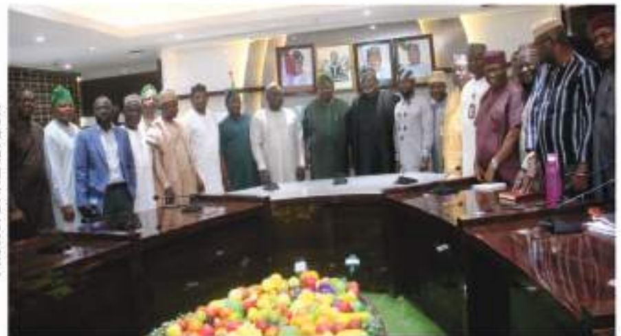
The Minister, Governor Mutfwang, Permanent Secretary, directors of the ministry and the governor's entourage in a group photograph