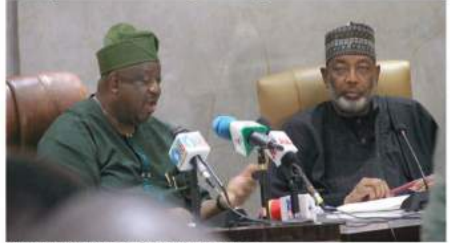
Governor Mutfwang delivering his message