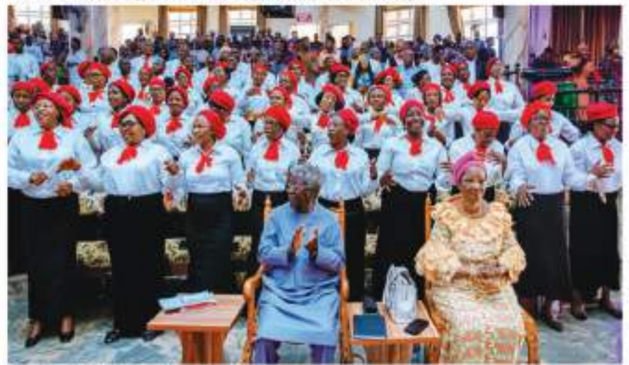
The church Choir rendering songs