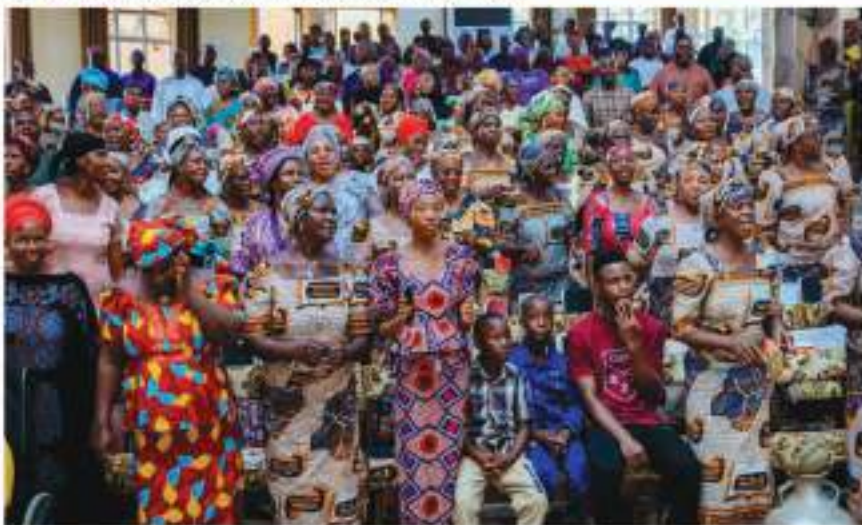
COCIN Women Fellowship of the Church singing