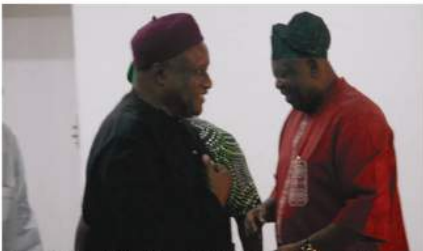
Governor Mutfwang with the chairman, PDP Elders Forum, Chief Raymond Dabo

The Plateau State Governor, Caleb Mutfwang, on Monday held a breakfast meeting with Peoples Democratic Party (PDP), Elders at the Banquet Hall, old Government House, Rayfield, Jos