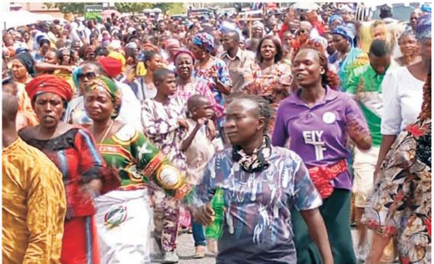
Christian faithful during the annual Jos Easter rally organised by the Christian Association of Nigeria, CAN, Plateau State Branch, on Monday