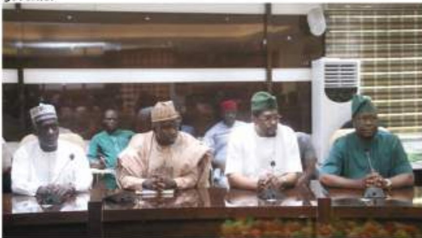
Cross section of the governor's entourage