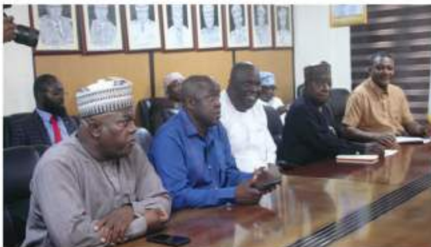
Cross section of PDP stakeholders