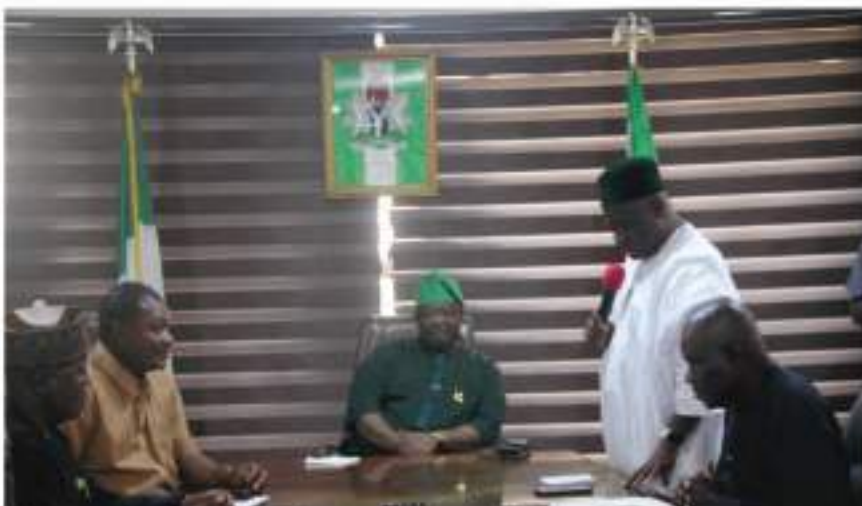
Governor Mutfwang listening to the speech by Hon. Dakas Shan

Plateau State Governor, Caleb Mutfwang, recently hosted the Peoples Democratic Party (PDP) stakeholders from the North Central Zone, led by their zonal chairman, Theophilus Dakas Shan, at the Plateau House, Abuja