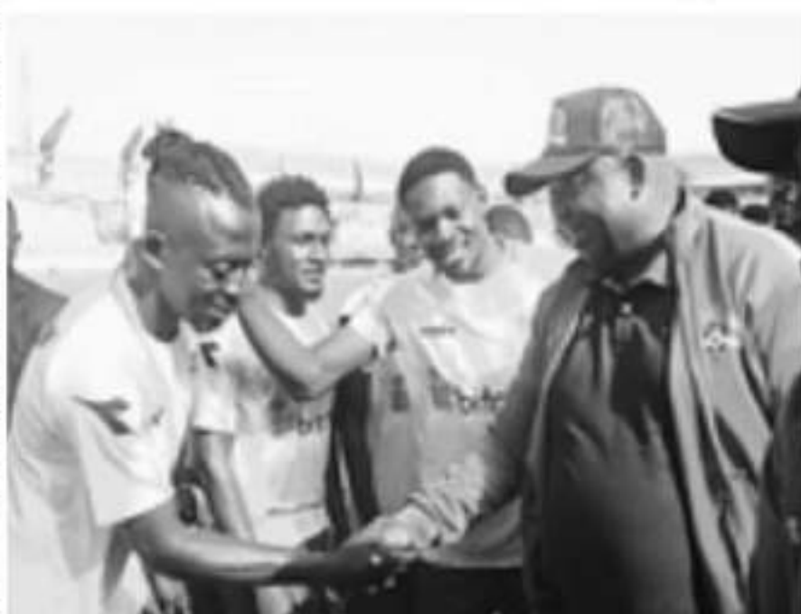
Gov. Mutwang in a hand shake with the players

He commended Governor Mutwang's resilience and foresight for transforming not only sports but all other